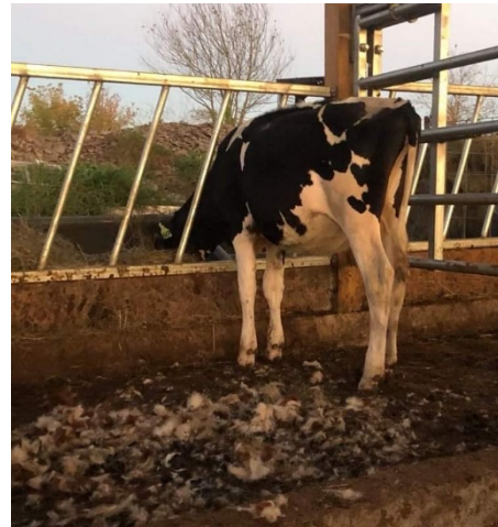
Lot 24's May Lutenant calf