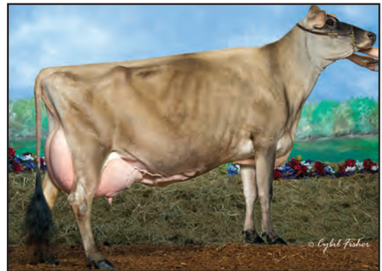
SOUTH MOUNTAIN SANTANA, E-92% SISTER OF GRANDAM OF LOT 163