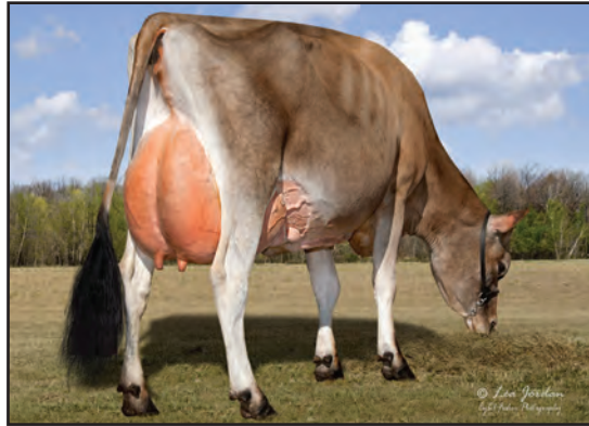
ELLIOTTS CHAVEZ RENEE-ET, E-91% SISTER TO GRANDAM OF LOT 81