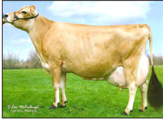
BILLINGS BERRETTA DARLA, E-91% SISTER TO DAM OF LOT 160