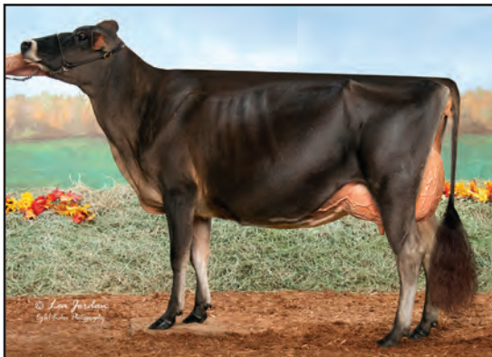
BILLINGS IMPRESSION BACKSTAGE-ET, E-93% SISTER TO GRANDAM OF LOT 159