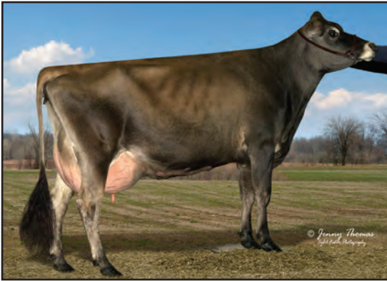
BILLINGS MINISTER MARNI-ET, E-91% GRANDAM OF LOT 161