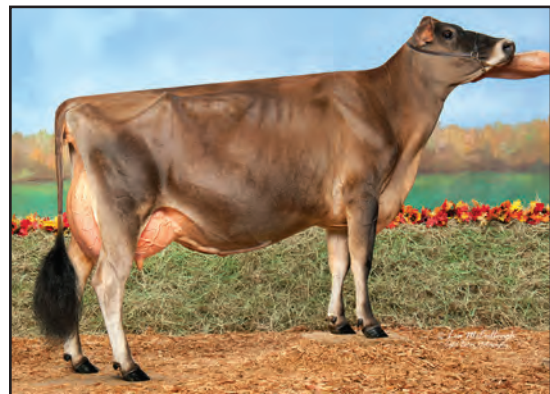
BILLINGS TEQUILA MAYA-ET, E-91% SISTER OF GRANDAM OF LOT 161