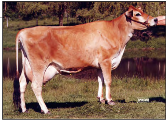
POCANTICO DUNCAN PASSION, E-92% FOURTH DAM OF LOT 142