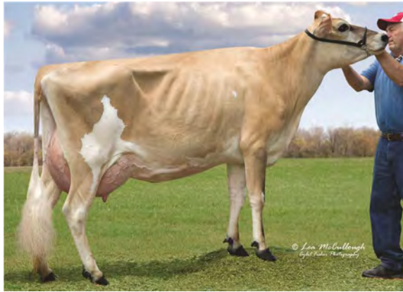
SAR COMMOTION HARMONICA, VG-87% FOURTH DAM OF LOT 44