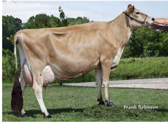
SUNBOW JACE LADY-ET, VG-84% FOURTH DAM OF LOT 5