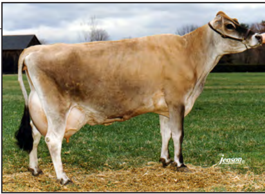
PASSIONS HALFPINT PATIENCE-ET, E-92% GREAT-GRANDAM OF LOT 142