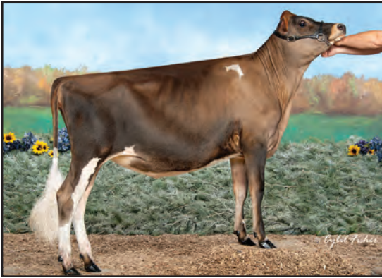
PREMIER-VIEW TEQUILA SABRINA-ET, VG-88% DAM OF LOT 163