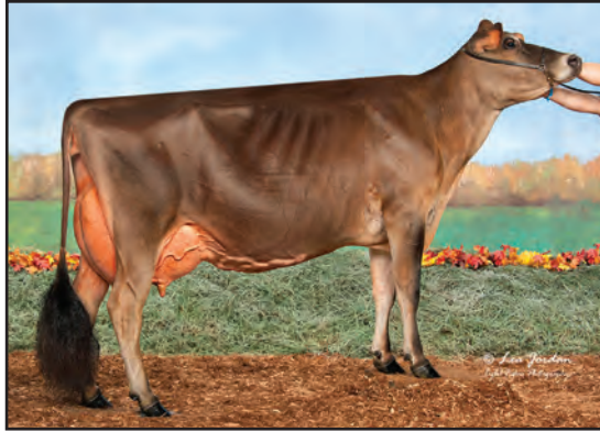
RATLIFF IRWIN VANCY-ET, E-91% SISTER TO GRANDAM OF LOT 87