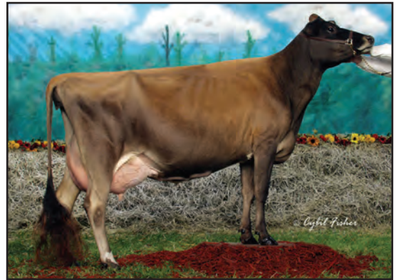
ELLIOTTS PREMONITION SABRINA, E-93% GREAT-GRANDAM OF LOT 163