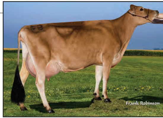
JX FARIA BROTHERS HARRIS JUVENTUS {5}-ET, VG-87% GREAT-GRANDAM OF LOT 39