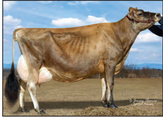
BILLINGS LS BOO BOO, E-93% GREAT-GRANDAM OF LOT 159