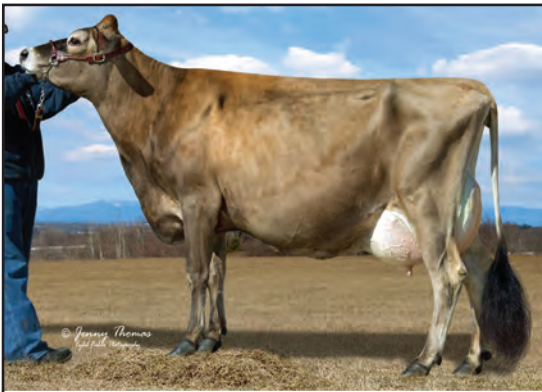
BILLINGS LASER MARGAUX, E-90% SISTER OF GRANDAM OF LOT 161