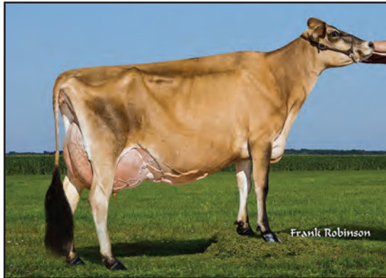
D&E MERCHANT VIRTUE 22228-ET, E-93% SISTER TO DAM OF LOT 31