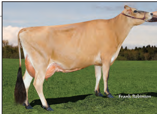
WILSONVIEW TBONE MILESTONE-ET, VG-86% GRANDAM OF LOT 33