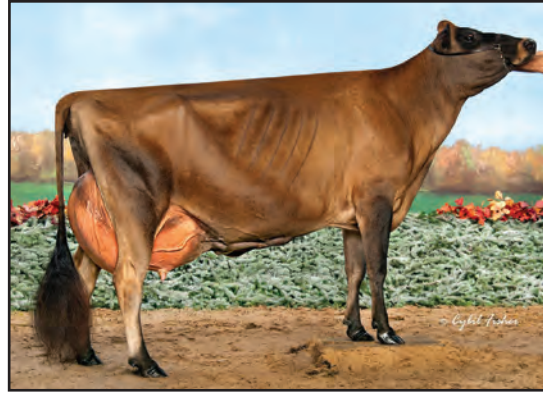
ARETHUSA TEQUILA VISION, E-95% GREAT-GRANDAM OF LOT 87