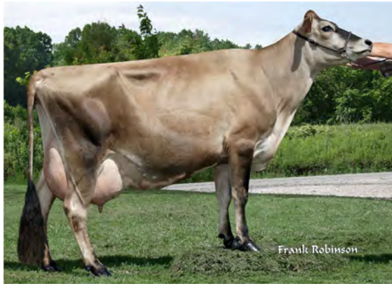
SUNBOW DUNKIRK EMPRESS-ET, E-92% GREAT-GRANDAM OF LOT 7