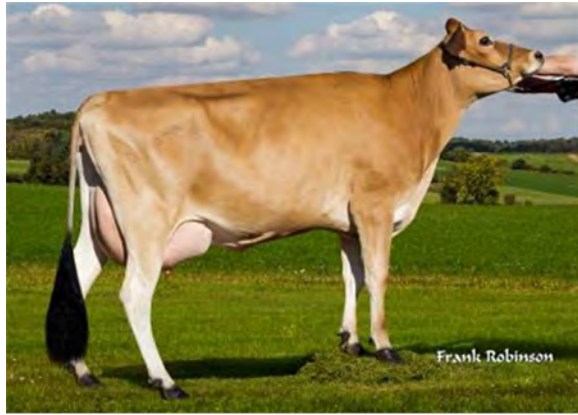
JX SEXING NITRO CANDEE 59765 {5}-ET, VG-84% SISTER TO DAM OF LOT 42