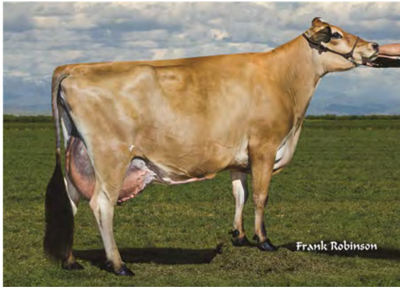
BW IATOLA CAROL ET515-ET, E-90% FOURTH DAM OF LOT 29