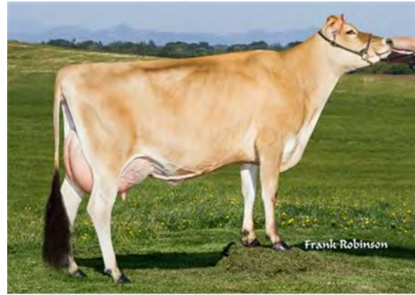
JX NYMANS VACATION 18025 {4}, VG-88% GREAT-GRANDAM OF LOT 36