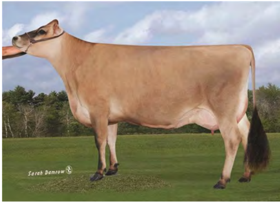
TLJ VALENTINO KAT {4}, E-93% GREAT-GRANDAM OF LOT 37