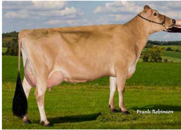
JX FARIA BROTHERS HARRIS WALLACE {4}-ET, VG-85% GRANDAM OF LOT 40