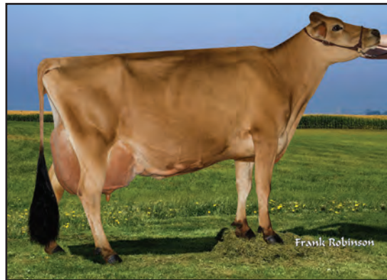
JX D&E SIXTYNINE VIRTUE 22953 {4}-ET, VG-87% SISTER TO DAM OF LOT 31