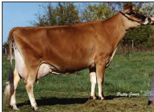
NORVAL ACRES KINGS DELCY 4N FOURTH DAM OF LOT 160