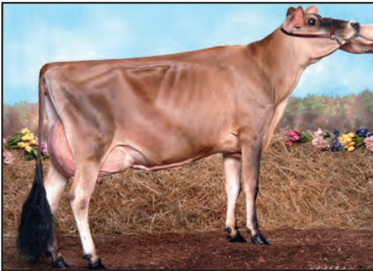
BILLINGS JADE BRYANT, E-92% SISTER OF GRANDAM OF LOT 159