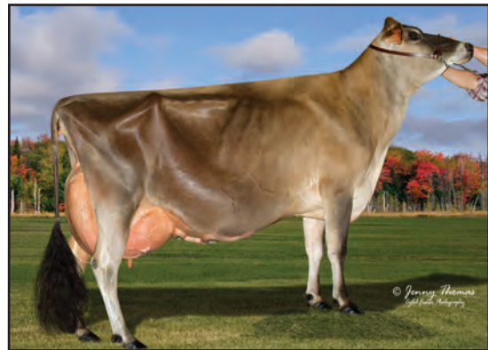
BILLINGS FUROR MEG, E-92% SISTER TO GRANDAM OF LOT 161