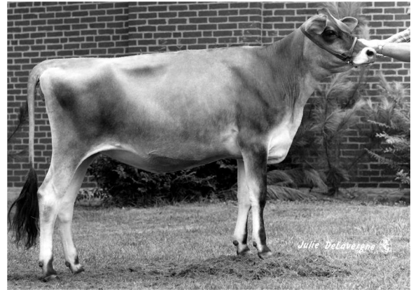
CLUB HILL BEACON NICKI, VG-85% FOURTH DAM OF LOT 164