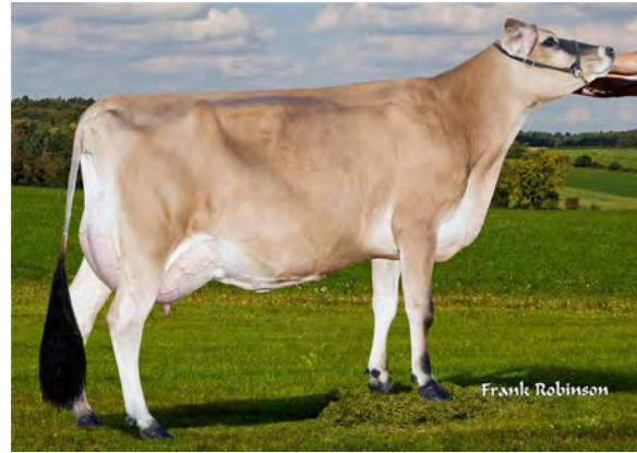
TLJ MAGNUM KINGDOM {5}, E-90% GRANDAM OF LOT 37