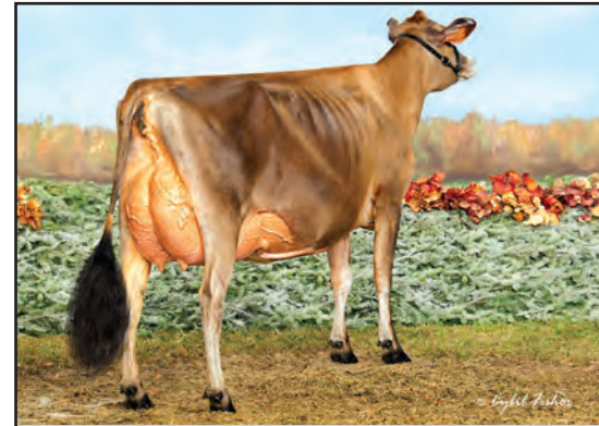
BILLINGS IMPRESSION OF BOOBOO-ET, E-92% SISTER OF DAM OF LOT 162