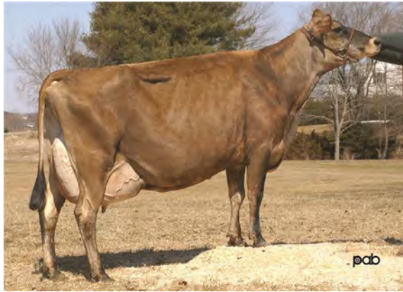
KEMPKO LEMVIG DEBORHA 4TH DAM OF LOT 143