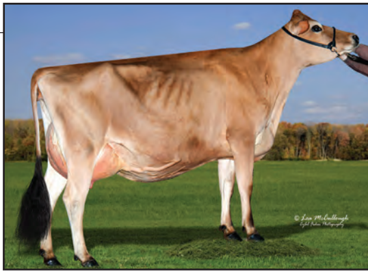
SCENIC VIEW MASTER CHESTNUT-P, E-91% GREAT-GRANDAM OF LOT 84