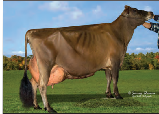
BILLINGS LEGION MINI ME, E-95% GREAT-GRANDAM OF LOT 161