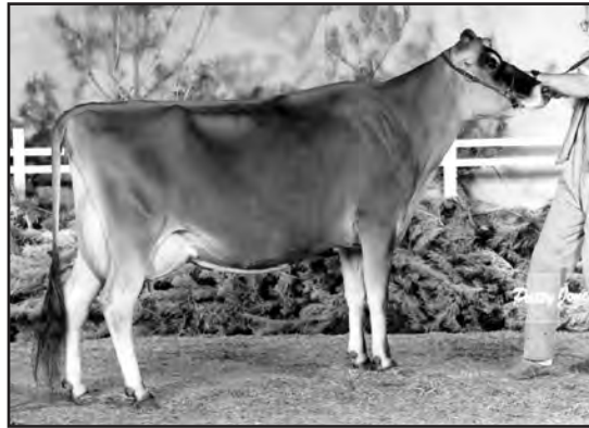
NORVAL ACRES JODYS DELCY 4U, E-90% GREAT-GRANDAM OF LOT 160