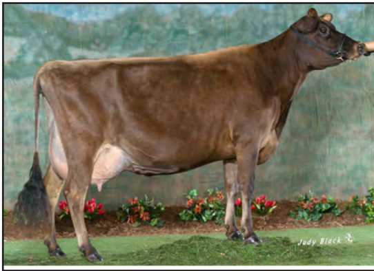
BRI-LIN RENS SOFIE, E-90% FOURTH DAM OF LOT 163