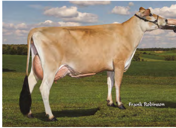
AHLEM PLUS DEE 42868 {6}, E-91% SISTER TO DAM OF LOT 45