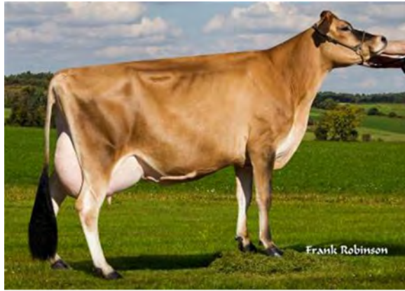
JX SEXING MAGNUM GAIL 59789 {5}-ET, VG-80% GRANDAM OF LOT 36