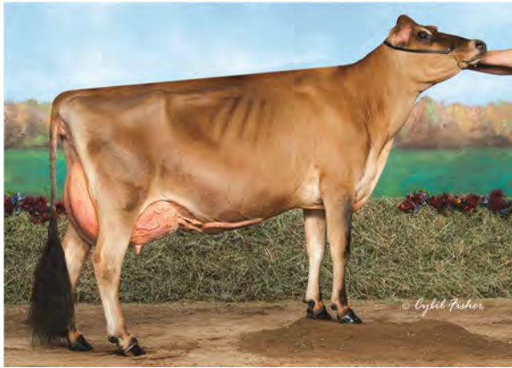
GENESIS VELOCITY JITTER, E-93% SISTER TO DAM OF LOT 83