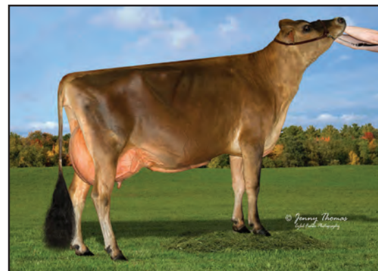
BILLINGS MINISTER BREIGH, E-92% SISTER TO GRANDAM OF LOT 159