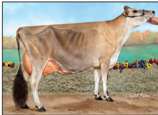
ELLIOTTS CHAVEZ ROXIE-ET, E-93% SISTER TO GRANDAM OF LOT 81