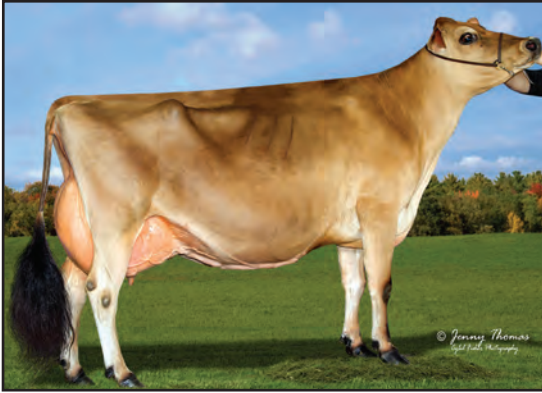
BILLINGS SULTAN BRYCE, E-95% GRANDAM OF LOT 159