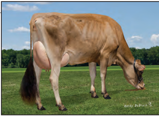
JX FARIA BROTHERS MARLO CHAPEL HILL {3}-ET, VG-85% GRANDAM OF LOT 39