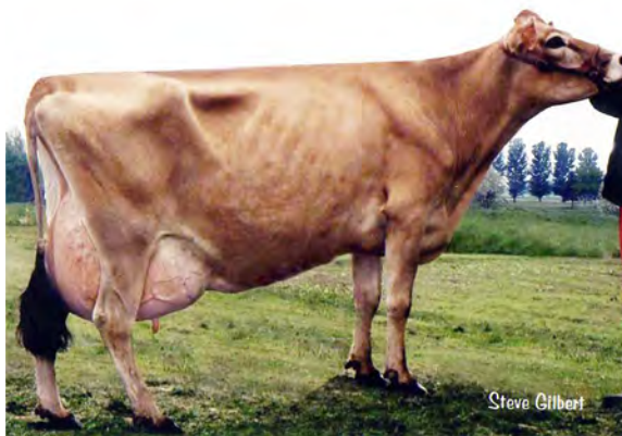
GRAZELAND BOLD DAVITA, E-91% FOURTH DAM OF LOT 97