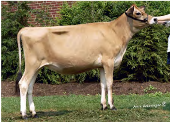
SHELL RAY IMP J NATALIE-ET GREAT-GRANDAM OF LOT 164