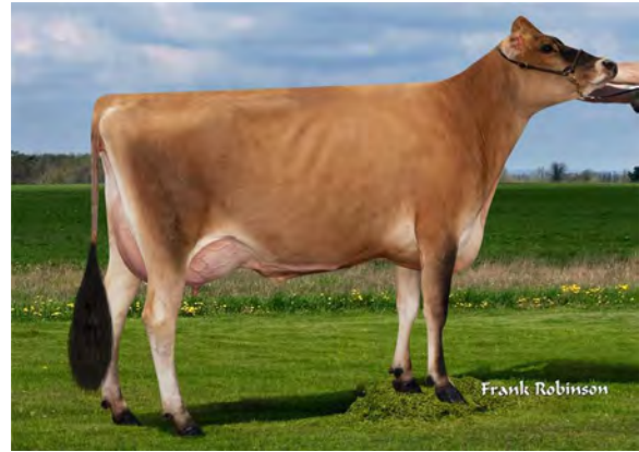
JX SEXING 77188 {3}-ET, VG-85% DAM OF LOT 40