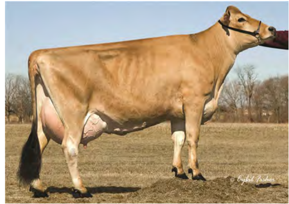
DUTCH HOLLOW LOUIE CHARITY, VG-86% FOURTH DAM OF LOT 42