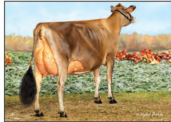
BILLINGS IMPRESSION OF BOOBOO-ET, E-92% SISTER OF GRANDAM OF LOT 159