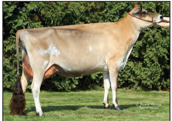
SOUTH MOUNTAIN VALIANT STILETTO-ET, E-91% SISTER OF GRANDAM OF LOT 163