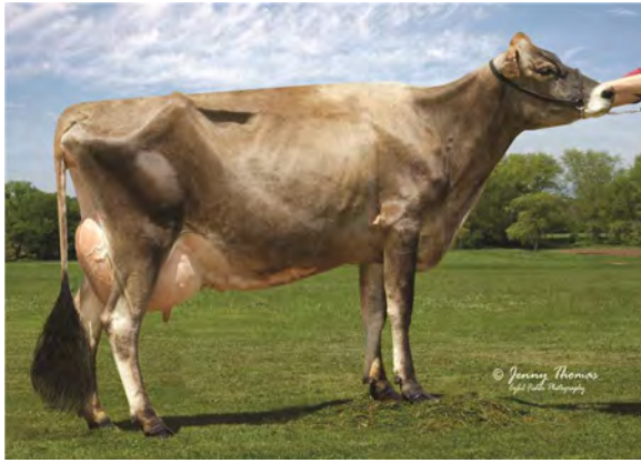
SUNBOW HEADLINE ROSETTE, VG-83% GREAT-GRANDAM OF LOT 1