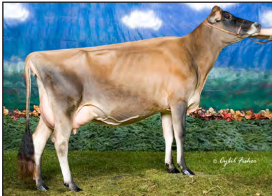
SOUTH MOUNTAIN SARATOGA, E-90% SISTER OF GRANDAM OF LOT 163