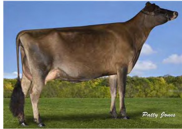
GENESIS VELOCITYS HAWAII, E-92%-2E (CAN) FULL SISTER TO LOT 83