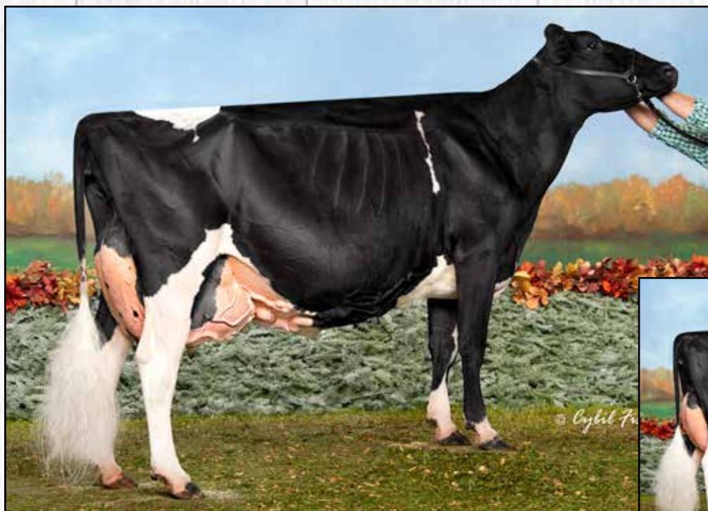
LUDWIGS-DG GOLDWYN EMMY-ET EX-94 3E DAM OF LOT 97

Reserve Grand Champion, IL Championship Show 2014