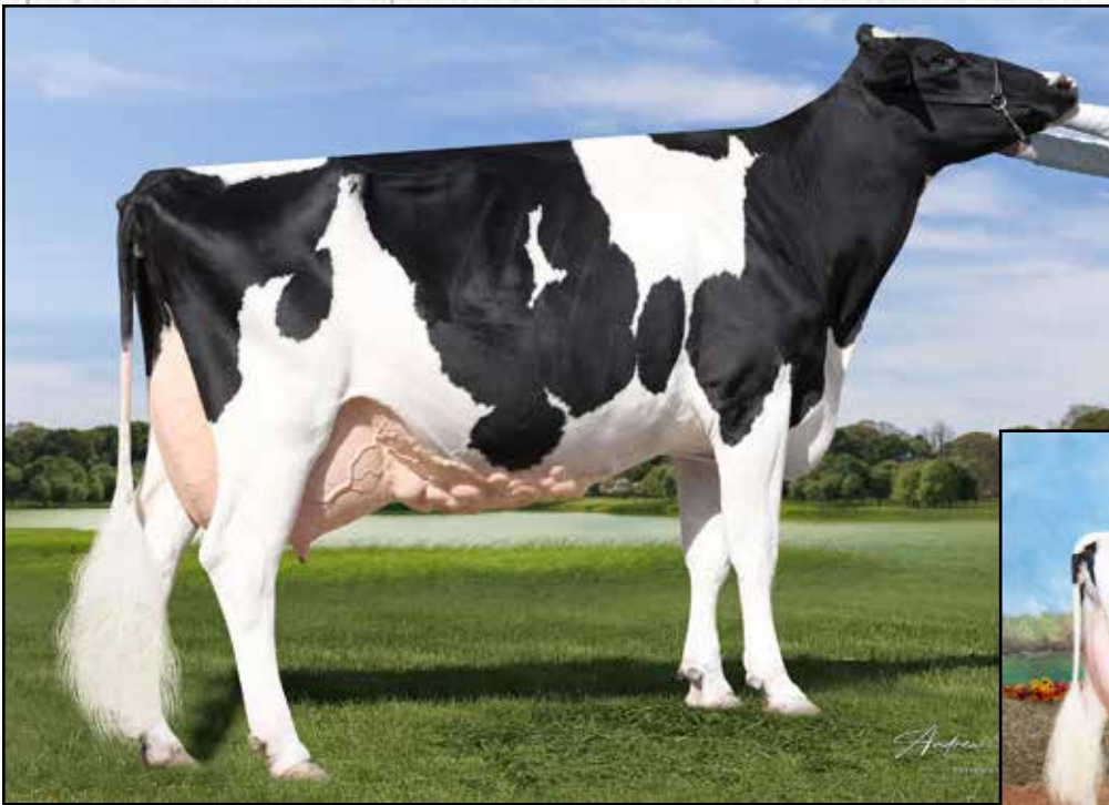
BLUFF-RIDGE ATWOOD TIANA EX-91 SELLS AS LOT 107