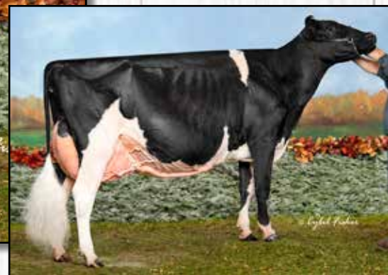
LUDWIGS-DG GOLDWYN ELLIE-ET EX-95 2E FULL SISTER TO DAM OF LOT 97

Reserve Grand Champion, IL Championship Show 2014