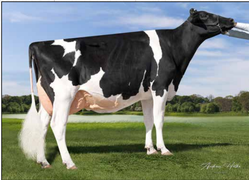
BLUFF-RIDGE SID JASMINE VG-86 SELLS AS LOT 7