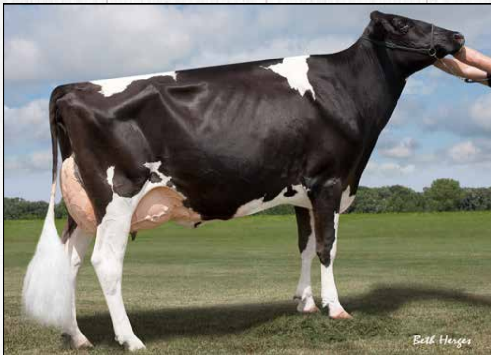
VALLEYVILLE LHEROS MADA-ET EX-92 3RD DAM OF LOT 131 Reserve Grand Champion, IL State Show 2010