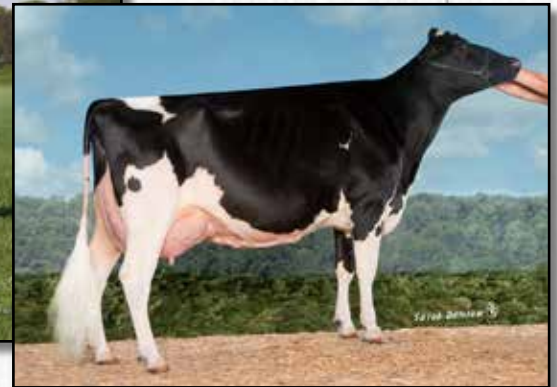
BLUFF-RIDGE BONES DOLCE EX-94 3E DAM OF LOT 71