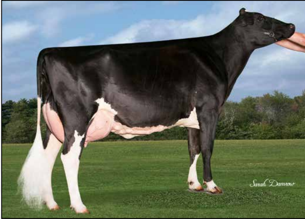
BLUFF-RIDGE DESTRY BERNICE EX-92 2E 2ND DAM OF LOT 54