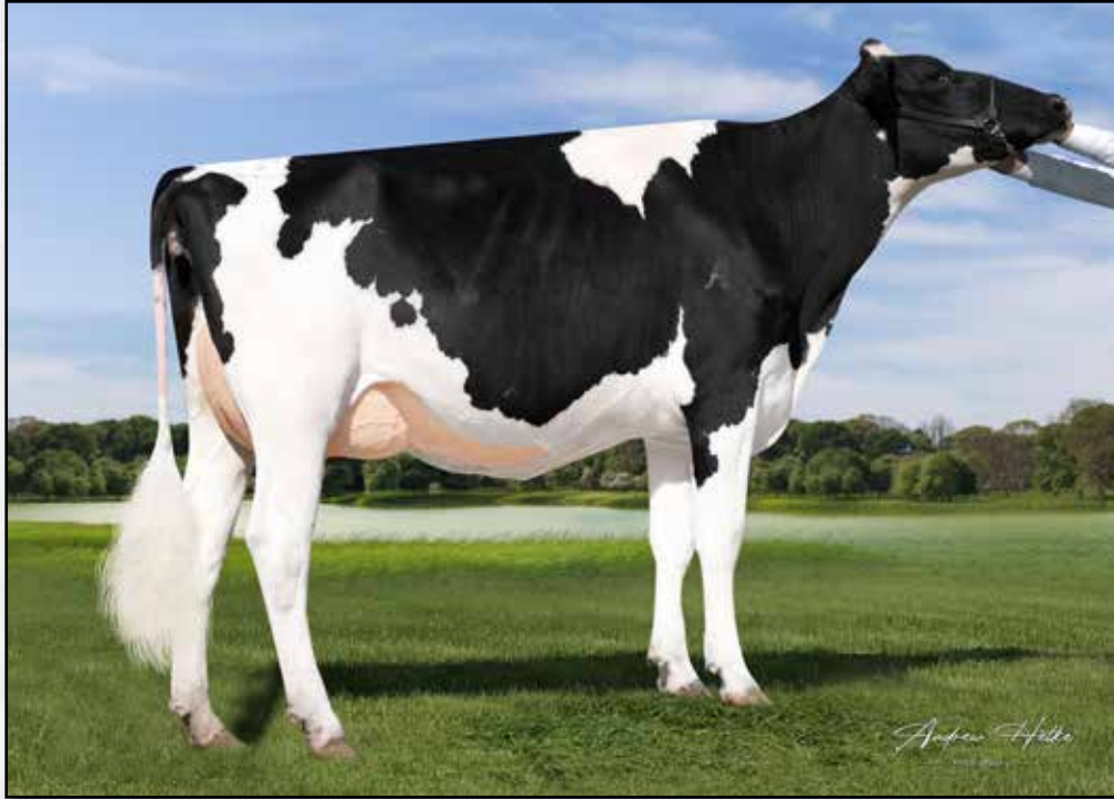
BLUFF-RIDGE DOORMAN BREEZE SELLS AS LOT 61