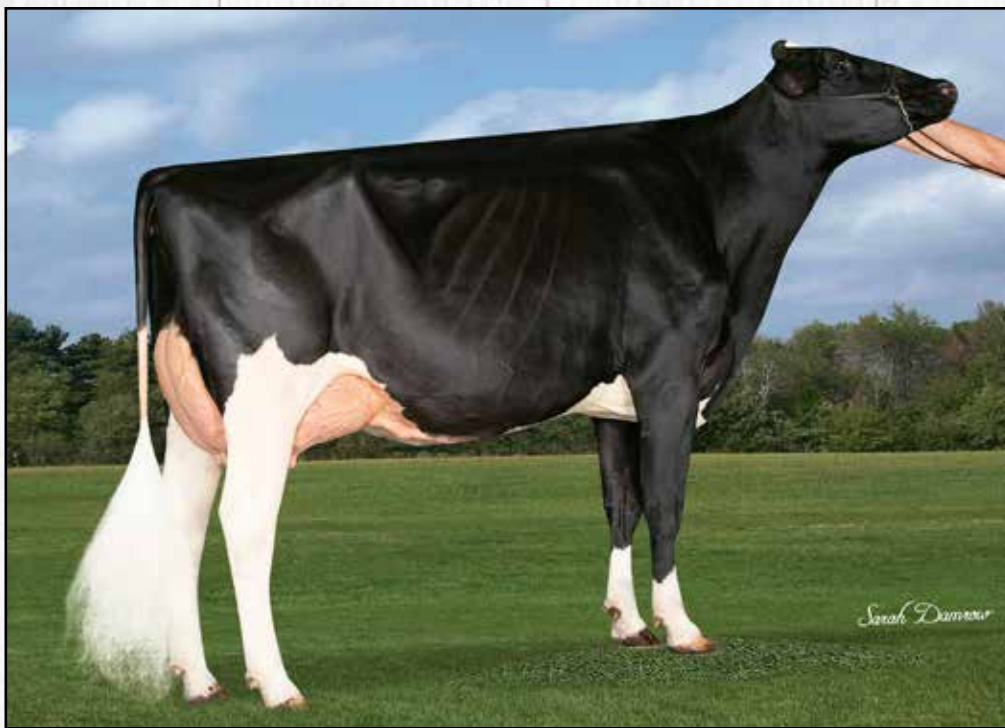
BLUFF-RIDGE DOORMAN BOUQUET VG-86 DAM OF LOT 134

Res Intermediate Champion, IL State Fair 2021