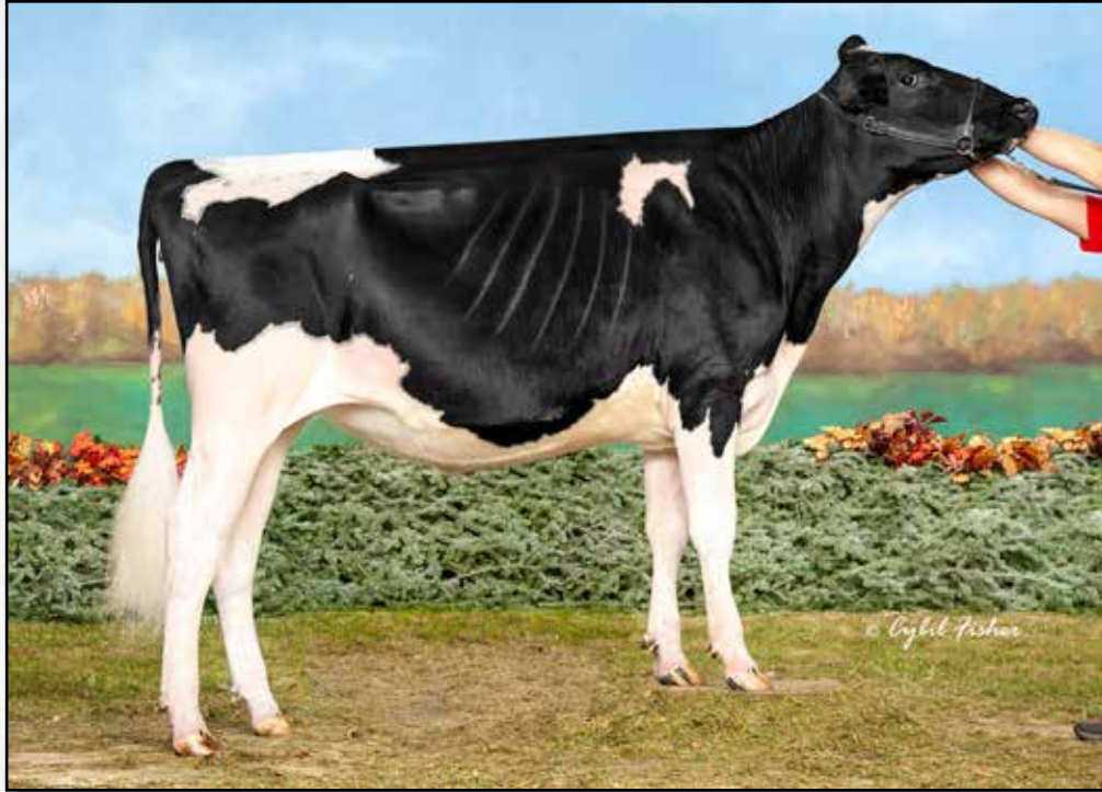
BLUFF-RIDGE UNDENIED BELL SELLS AS LOT 40