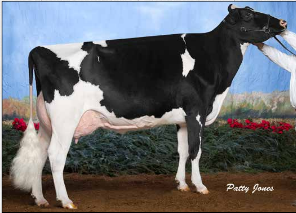
FRAHIL GOLDWYN DIXIE EX-94 2E DAM OF LOT 99

Nominated All-Canadian Senior 3-Year-Old 2010