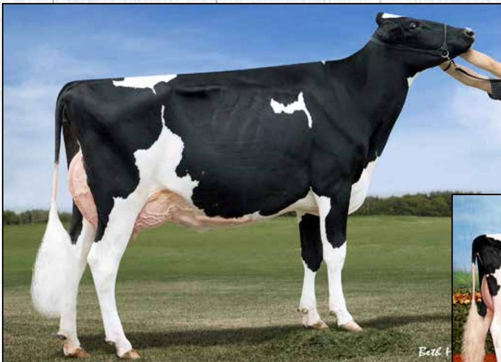
BVK ATWOOD ABRIANNA-ET EX-92 2ND DAM OF LOT 115

Reserve All-American Junior 3-Year-Old 2013