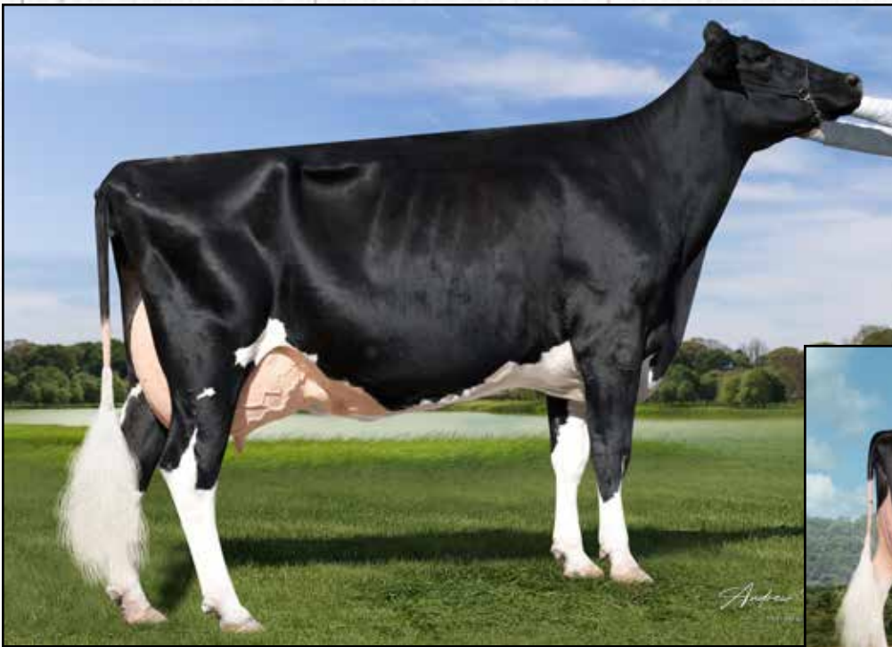
BLUFF-RIDGE SID DOTTIE VG-88 SELLS AS LOT 71