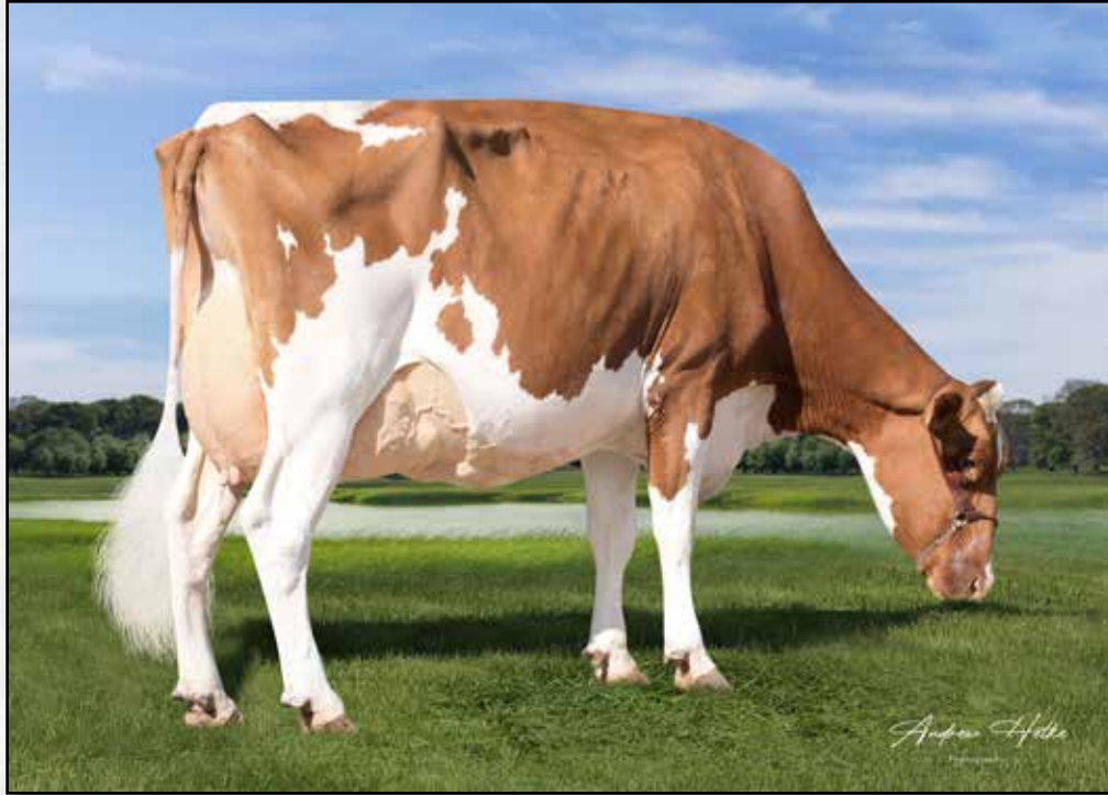
BLUFF-RIDGE BW LILLY-RED VG-87 SELLS AS LOT 132