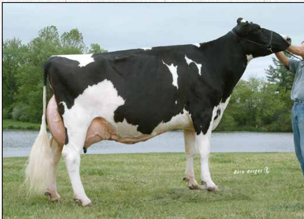
BLUFF-RIDGE ENCORE BUTTERCUP EX-94 3E 2ND DAM OF LOT 34; 3RD DAM OF LOT 35