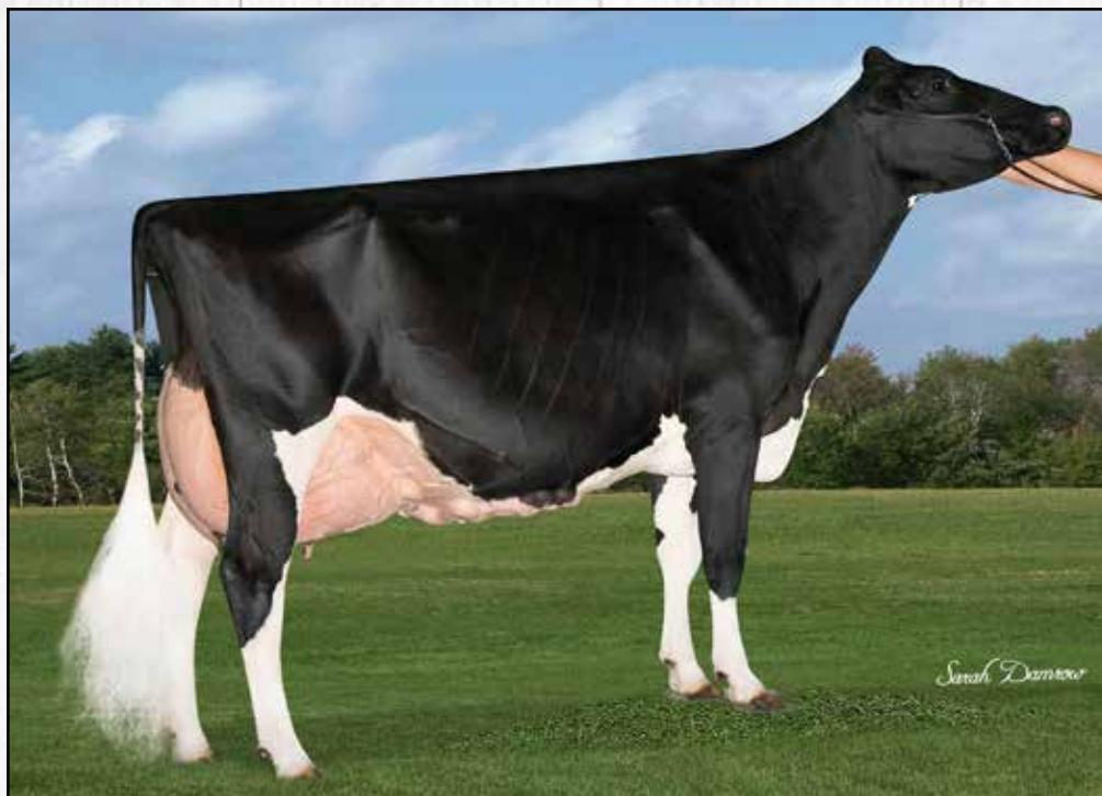
BLUFF-RIDGE ATWOOD BRIDGET EX-94 3E 2ND DAM OF LOT 62