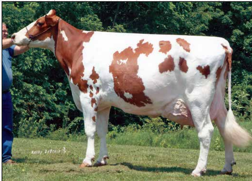
HY-CLASS RANG JATHNE-RED-TW EX-90 3RD DAM OF LOT