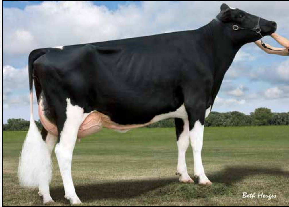
BLUFF-RIDGE ROY BARRETTA-ET EX-93 4E DAM OF LOT 32