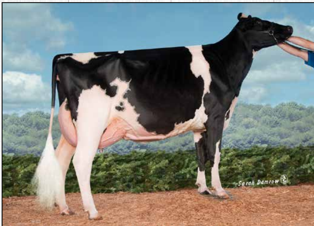
BLUFF-RIDGE GOLDWYN BIDY-ET EX-92 DAM OF LOT 37