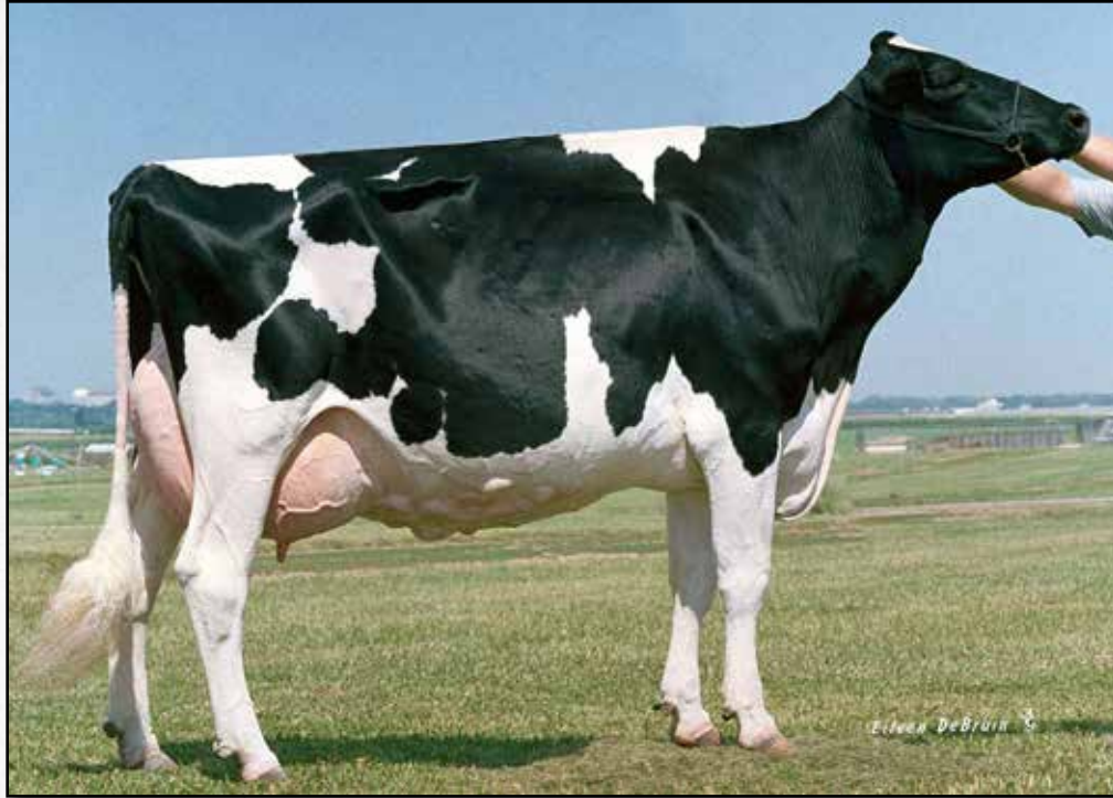
BARDHOLM TRUST LEE EX-93 2ND DAM OF LOT 108; 3RD DAM OF LOT 109