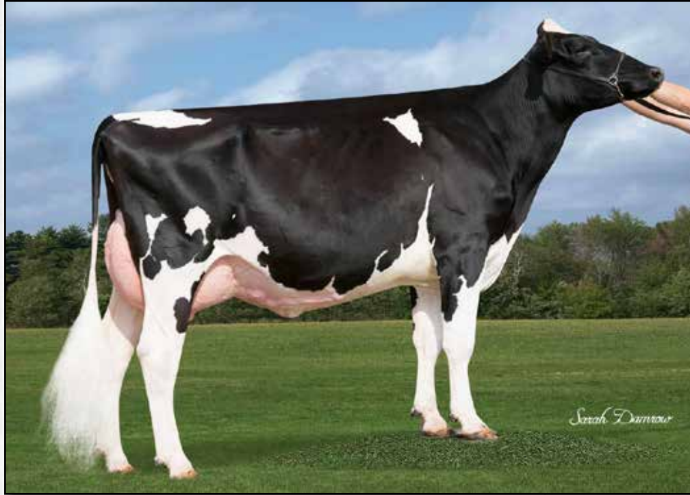
BLUFF-RIDGE BALTIMOR JULIET EX-92 SELLS AS LOT 2