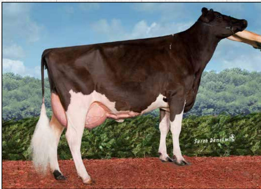
BLUFF-RIDGE ROY JESSIE-ET EX-94 3E 2ND DAM OF LOT 11