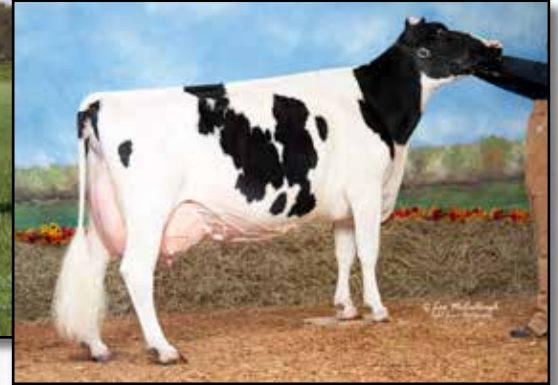
LUCK-E DUNDEE TEASER-ET EX-94 3E DAM OF LOT 107