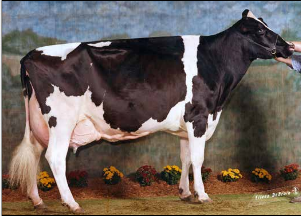
BLUFF-RIDGE BROKER JAY EX-95 3E 6TH DAM OF LOT 8