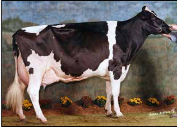
BLUFF-RIDGE BROKER JAY EXCELLENT-95 EEEEE 3E