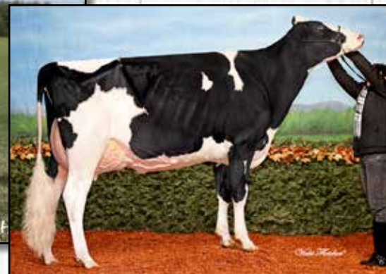
BVK ATWOOD ARIANNA-ET EX-94 FULL SISTER TO 2ND DAM OF LOT 115

Reserve All-American Junior 3-Year-Old 2013