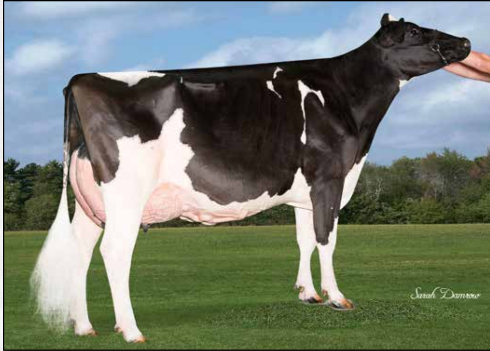
BLUFF-RIDGE ATWOOD JANUARY EX-94 2E DAM OF LOT 10