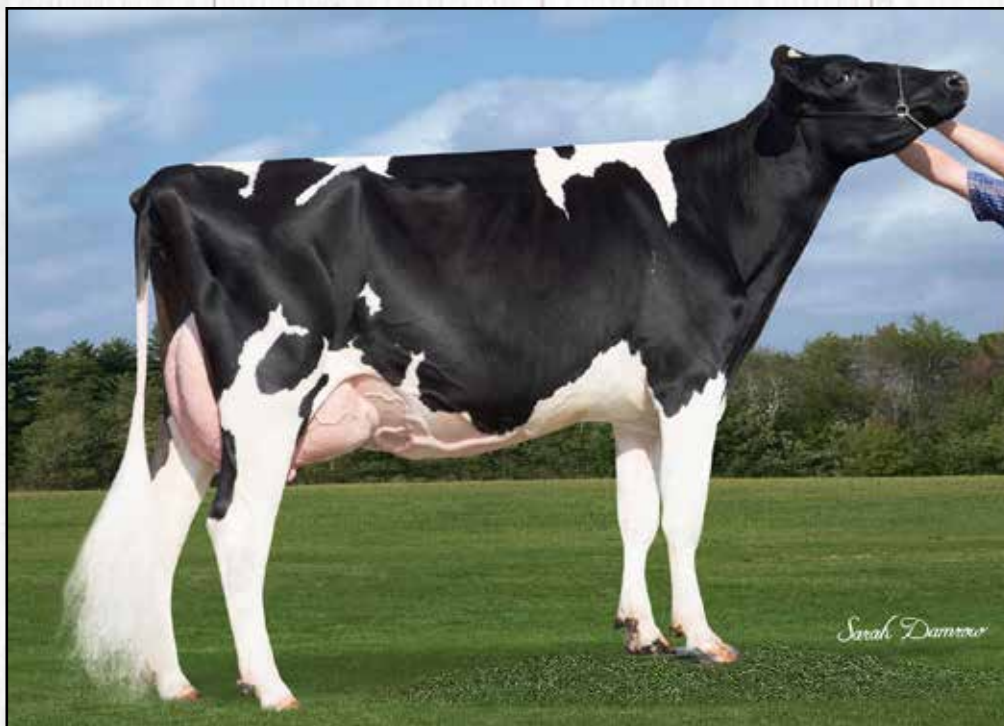
BLUFF-RIDGE AFTSHOCK JO-JO VG-85 DAM OF LOT 9