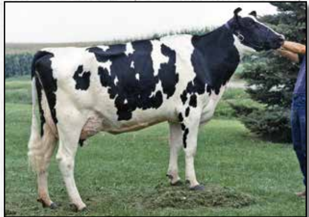
BLUFF-RIDGE MARK BEA-TW EXCELLENT-92 DOM