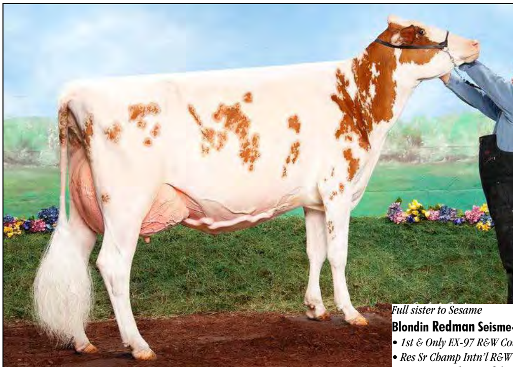
RUSTOWIL RDBR SELINE-RED-ET EX-94 EX-MS 2E 2ND DAM OF LOT 2