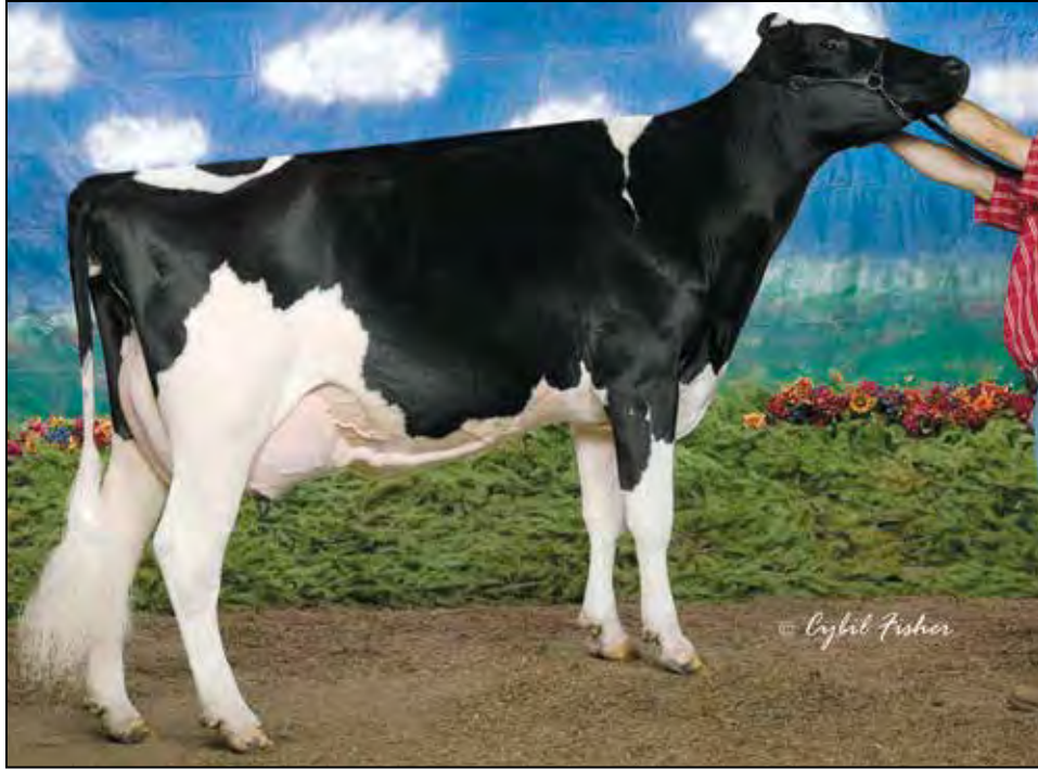
JOHNAN DUNDEE GALAXY-ET EX-92 EEVEE 3E 4TH DAM OF LOT 5