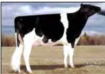
LARCREST CHESSA-ET EX-90 EX-MS DOM 3RD DAM OF LOT 79

840003145987587 99%RHA-I GP-78 @ 2-05 *RC *PO *TC *TL Born: February 2, 2018 • Herd No. 147 2-01 2x 365d 24880 4.6 1138 3.6 894 Fresh: August 14, 2021 Milking: 78# 5.3F 3.4P SCC 460,000