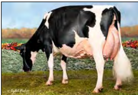
J&K-VUE GOLDWYN GLAMOUR-ET EX-96 EEEEE 3E MATERNAL SISTER TO LOT 47 & DAM OF LOT 48

840003206514714 Very Good-85 VG-MS @ 2-05 Born: December 25, 2018 Fresh: February 5, 2021 Bred: August 25, 2021 to Stantons Cadillac 513H03188 Milking: 82#