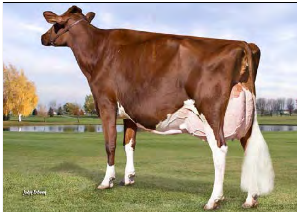
KHW REGIMENT APPLE-RED-ET EX-96 EEEEE 4E DOM 2ND DAM OF LOT 22 & 3RD DAM OF LOT 23