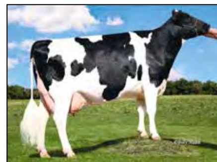
STUMP-VALLEY DURHAM SWEET EX-90 EX-MS GMD 3RD DAM OF LOT 81

840003150757633 98%RHA-I GP-83 VG-MS @ 2-10 Born: February 13, 2018 • Herd No. 151 2-01 2x 365d 27290 4.0 1081 3.4 941 Fresh: August 28, 2021 Milking: 70#