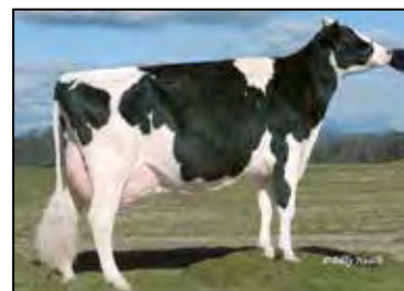
WINDSOR-MANOR RUD ZIP EX-95 4E GMD DOM 4TH DAM OF LOTS 56 & 57, 3RD DAM OF LOT 55

69997985 Very Good-88 VG-MS 4-02 2x 305d 32280 3.7 1179 2.8 915 3-00 2x 349d 29180 3.7 1080 2.8 823 5-07 2x 305d 28590 3.5 999 2.7 774 6-09 2x 282d 25430 4.4 1123 3.0 769 1-11 2x 343d 24570 3.9 946 2.9 719 Life: 1762d 151730 3.8 5769 2.9 4347