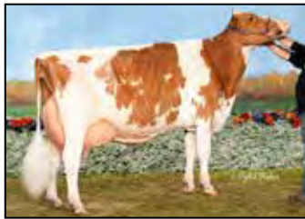
RIDGEDALE-T RAICHUORED 3E-96 MATERNAL SISTER TO DAM OF LOT 113

840003151890451 99%RHA-I Born: February 9, 2019 • Herd No. 873 Fresh: June 28, 2021