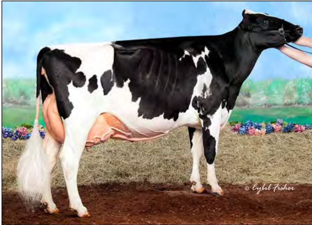
PENLOW GEOGRAPHY GOLDWYN EX-94 DAM OF LOT 89