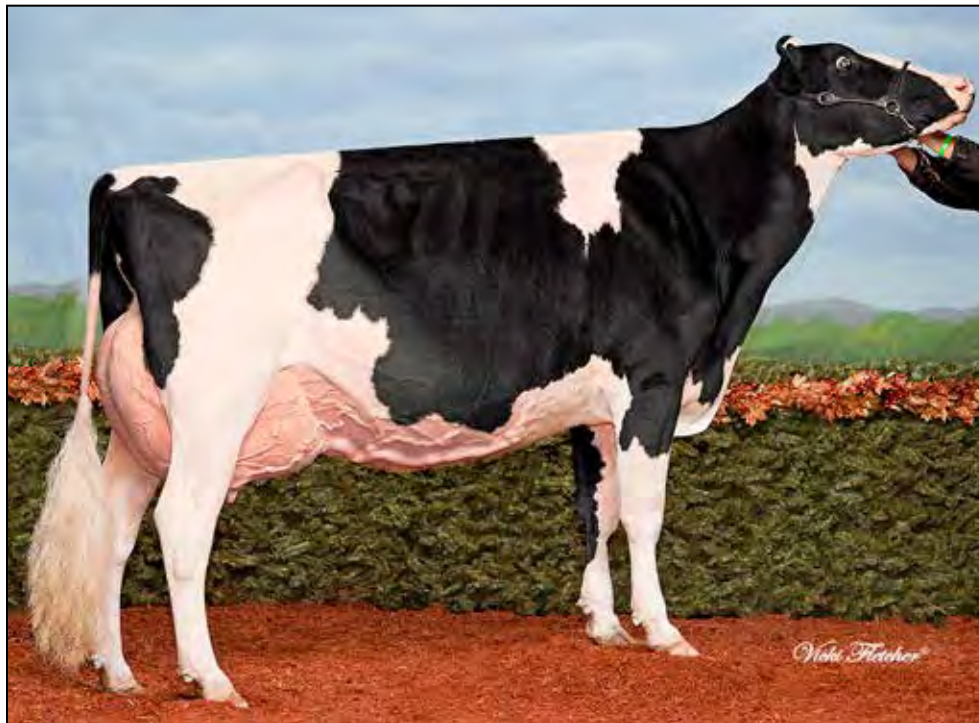
RF GOLDWYN HAILEY EX-97 4E-CAN 4TH DAM OF LOT 42