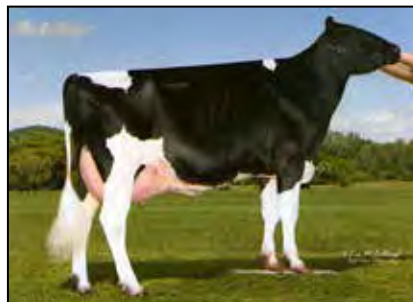
KINGSBURY PARSNIP-ET EX-94 EEEEE 2E 2ND DAM OF LOT 41

840003200787502 99%RHA-I Born: December 26, 2018 • Herd No. 1072 Fresh: August 26, 2021