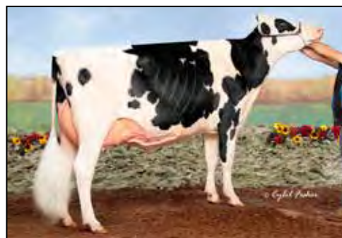
HEART&SOUL JK DEMPSEY GLITZ EX-94 MATERNAL SISTER TO LOT 48