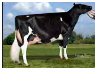
SMITH-OAK GLWYN MINT-ET EX-94 EEEEE 3E 2ND DAM OF LOT 69