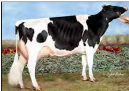
HEART&SOUL ALGNC RISKE-ET EX-94 EEEEE 2ND DAM OF LOT 49

840003206514708 99%RHA-I Born: December 1, 2018 • Herd No. 329 Fresh: June 2, 2021 Milking: 103#