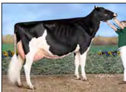
SAVAGE-LEIGH ATWD LIC-ET EX-93 MATERNAL SISTER TO 2ND DAM OF LOT 40

840003200305267 Born: March 3, 2019 • Herd No. 109 Fresh: July 13, 2021 Milking: 64#