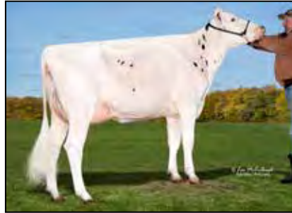
SHUB CAMERON FREEZE-ET VG-85 VG-MS 2ND DAM OF LOT 43

840003200787510 *PO Born: May 15, 2019 • Herd No. 1080 Fresh: August 9, 2021