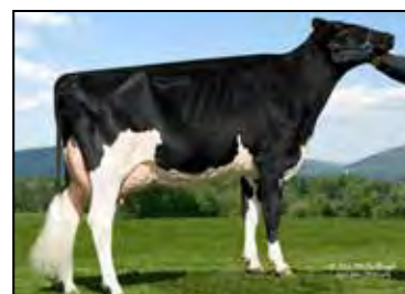
ELK-LICK GOLD ARIEL LEXY EX-90 SAME FAMILY AS LOT 54

840003145368012 99%RHA-I Born: June 4, 2019 • Herd No. 589 Fresh: June 19, 2021