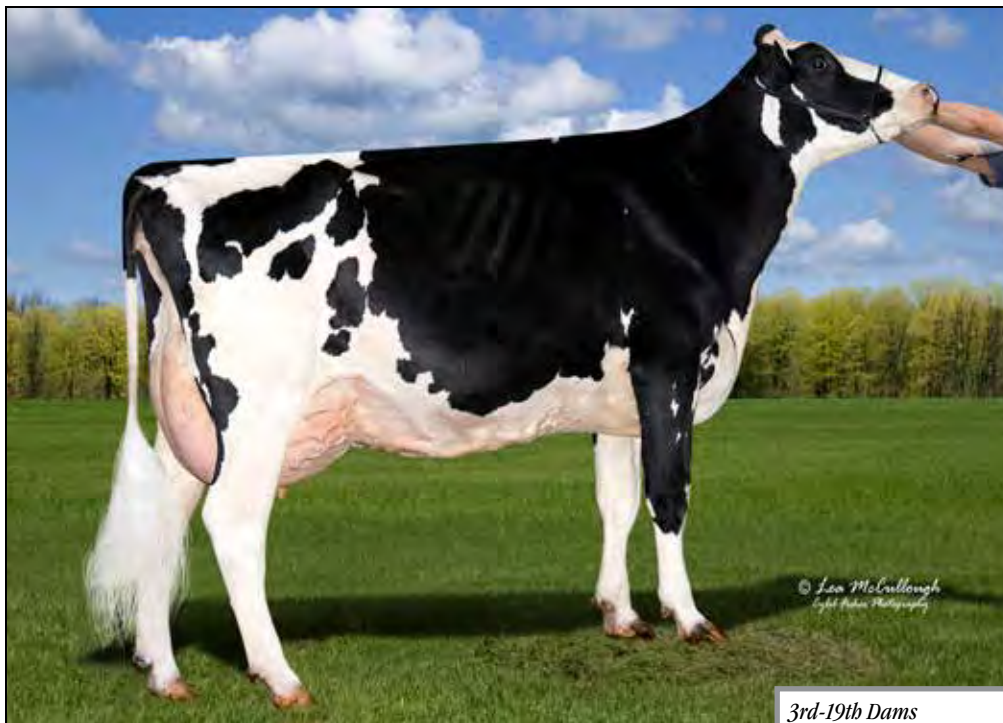
GLEN-VALLEY ROYAL GOLD-ET EX-90 EX-MS 2E 2ND DAM OF LOT 20