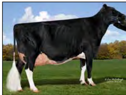
MS DONWALAND TALNT TILLY-ET EX-95 4E GMD 3RD DAM OF LOT 3RD

840003151890457 99%RHA-I Born: February 19, 2019 • Herd No. 879 Fresh: June 4, 2021