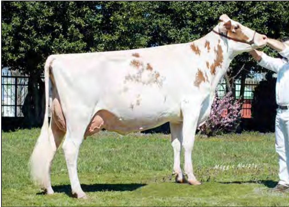
MOUNT ELM C P SNOWCONE-RED-ETS EX-92 EX-MS DAM OF LOT 1