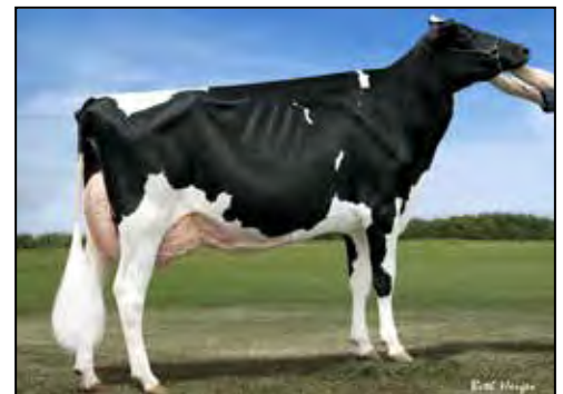
EASTRIVER GOLD DEB 850-ET EX-95 EX-MS FULL SISTER TO DAM OF LOT 44

840003206514723 99%RHA-I Born: March 31, 2019 • Herd No. 344 Fresh: June 5, 2021 Milking: 86#