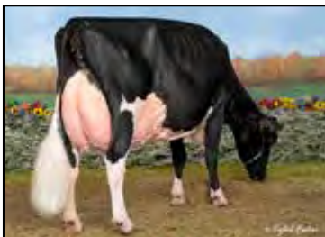
COOKVIEW GOLDWYN MONIQUE EX-95 2ND DAM OF LOT 51

Bred: August 12, 2021 to Siemers Doc Hancock