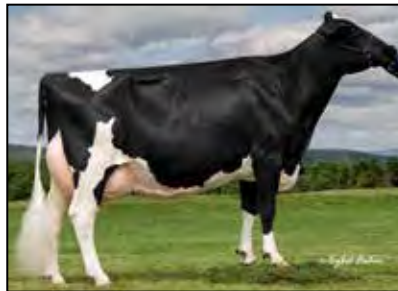
GLORYLAND LIBERTY RAE EX-94 EEEEE 3E DOM 2ND DAM OF LOT 7

144099377 Very Good-86 EX-MS Born: January 21, 2017 • Herd No. 64220 3-02 2x 305d 22290 4.4 976 3.5 777 2-01 2x 324d 19260 4.8 916 3.5 669 Fresh: July 16, 2021 Milking: 100#