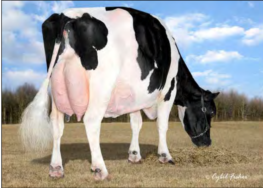
BUDJON-JK LINJET EILEEN-ET EX-96 2E GMD DOM 7TH DAM OF LOT 11