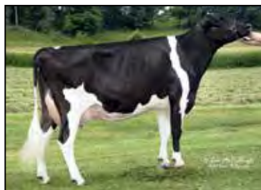
SAVAGE-LEIGH EXPLOSION-ET EX-94 EEEEE 3E 3RD DAM OF LOT 44

Due: October 28, 2021 to Jon-Lu Mr U R Amazing-Red