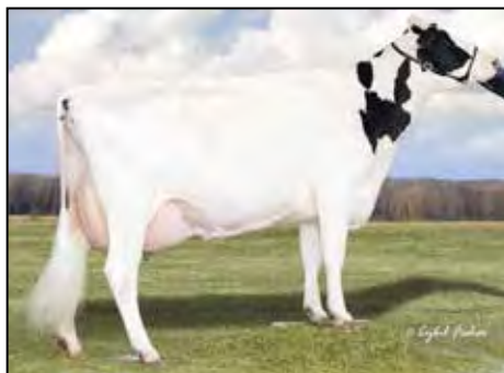
PACK-HERD LEE TONYA EX-93 EEEEE 3E 2ND DAM OF LOT 16

840003200413013 *RC Born: March 11, 2019 • Herd No. 378 Fresh: June 5, 2021 Milking: 88# 3.6F 3.0P SCC 44,000 Bred: August 26, 2021 to Jon-Lu Mr U R Amazing-Red