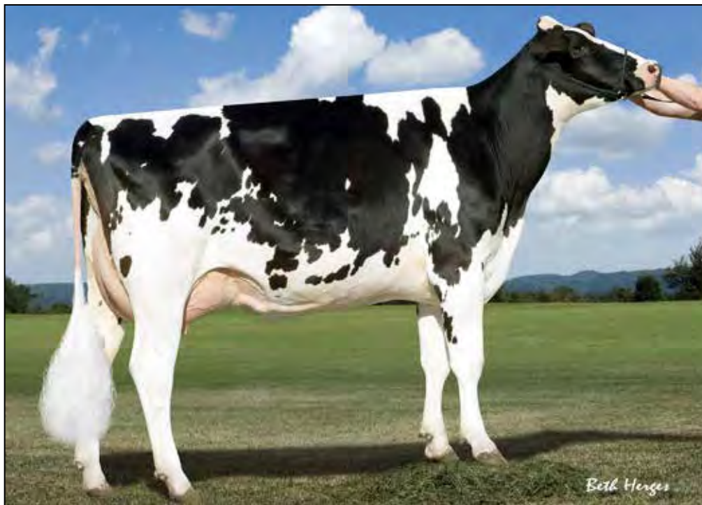
BRIGEEN SHOTTLE GIGI-ET EX-90 EX-MS FULL SISTER TO 2ND DAM OF LOT 26