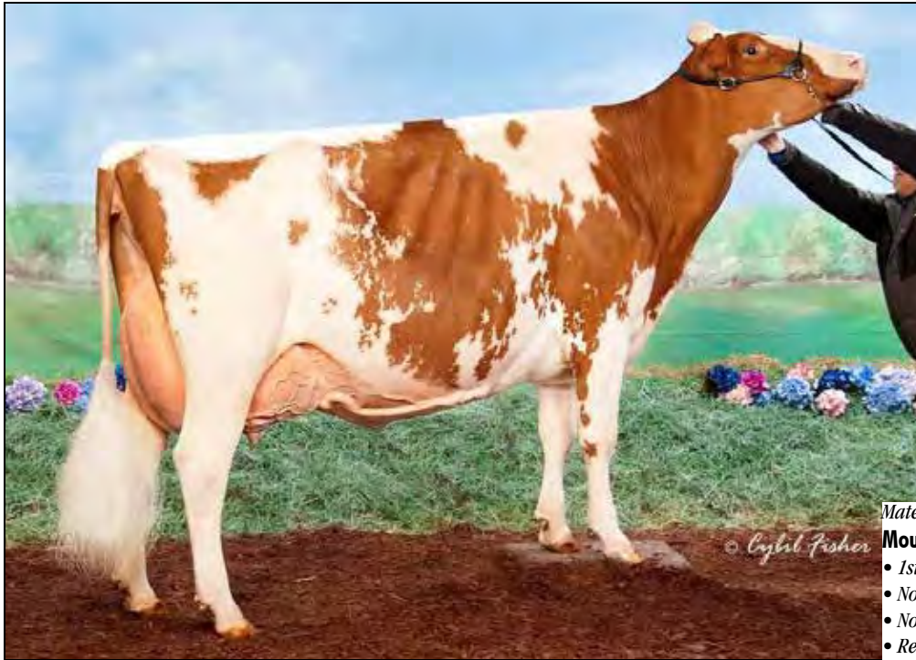
REDTAG DESTRY SNEEZY VG-88 MATERNAL SISTER TO DAM OF LOT 21