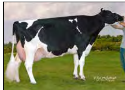
BUTTWOOD DURHAM PERFUME EX-94 EX-MS 3E DOM DAM OF LOT 14

73787572 Excellent-90 EX-MS Born: December 15, 2014 5-02 2x 365d 33670 3.3 1104 3.3 1119 3-06 2x 365d 30900 3.0 923 3.2 1004 2-05 2x 337d 26830 3.3 873 3.3 876 Life: 1261d 103600 3.3 3393 3.3 3441 Fresh: May 18, 2021 • Milking: 120# Bred: August 22, 2021 to Mr Affection Analyst-Red-ET 7H015023