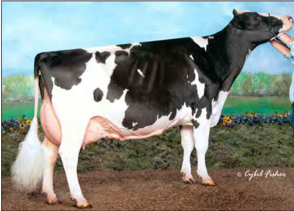
WINDY-KNOLL-VIEW PLEDGE EX-95 3E GMD DOM FULL SISTER TO 3RD DAM OF LOT 3