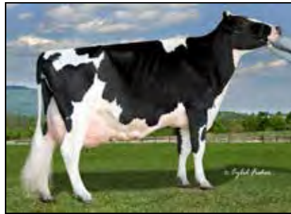
RO-MEYER GIBSON DEE 3110 EX-93 EX-MS 2E 2ND DAM OF LOTS 35 & 36

840003150489258 Good Plus-83 VG-MS @ 2-11 Born: September 2, 2018 • Herd No. 4390 1-11 2x 287d 18760 5.1 961 3.6 674 Fresh: July 17, 2021 Milking: 95# 4.8F 2.9P SCC 0