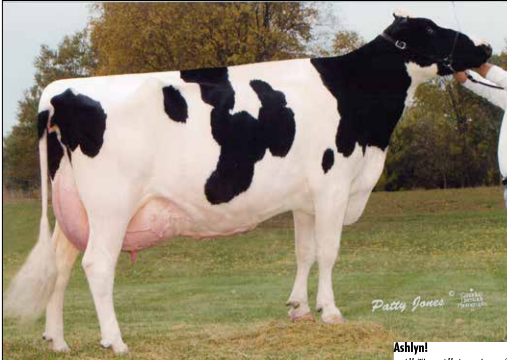
TRI-DAY ASHLYN-ET EX-96 EX-MS 2E GMD DOM 4TH DAM OF LOT 4