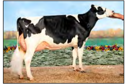
COREDALE AIRLIFT IONA VG-88 VG-MS SELLS AS LOT 51

840003128701013 Very Good-88 VG-MS Born: March 1, 2016 • Herd No. 38 4-00 2x 305d 32100 3.8 1233 3.0 954 3-00 2x 290d 24460 3.4 823 3.0 734 2-00 2x 305d 20810 3.5 738 3.0 615 Fresh: March 27, 2021 Milking: 109# SCC 13,000 Bred: August 22, 2021 to Sandy-Valley J Pharo-ET 250H012975