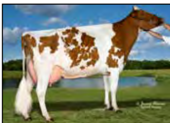
KING-LANE MELLO JOAN-RED-ET EX-93 MATERNAL SISTER TO 2ND DAM OF LOT 114

840003151890460 *RC Born: March 2, 2019 • Herd No. 882 Fresh: July 14, 2021