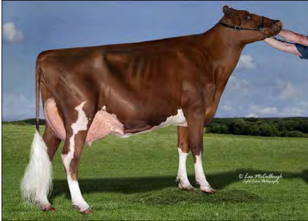
ZIEMS REALITY LOL-RED EX-92 EX-MS 2ND DAM OF LOT 24 & 3RD DAM OF LOT 25