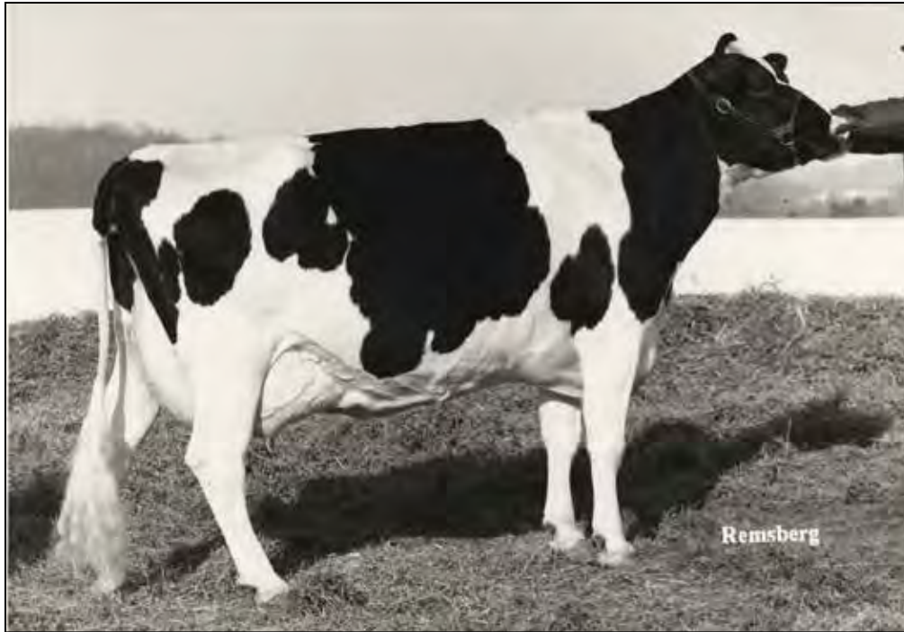
JOY-WIL MILLIE PATSY-ET EX-93 3E GMD DOM 9TH DAM OF LOT 88