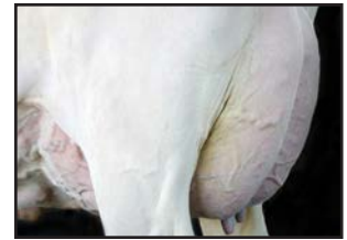
Wargo-Acres Exactly Awesome "EX-91" Excellent Mammary (Lot 1)