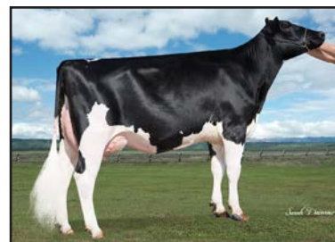
No-Fla Stoic Anne 40873-ET "VG-86" (Granddam of Lot 21)