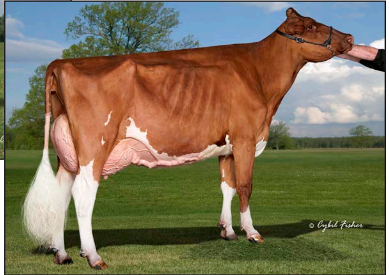
Kress-Hill Ms Sundance-Red "EX-92 2E" (Dam of Lot 17)