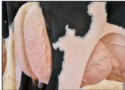
App-Sham Alexander Baby Spot "EX-92" (Dam of Lot 63)