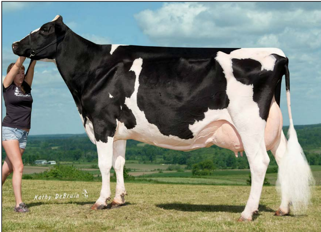
Jeffrey-Way Tamiko-ET "EX-94 3E" GMD (Granddam of Lot 8)