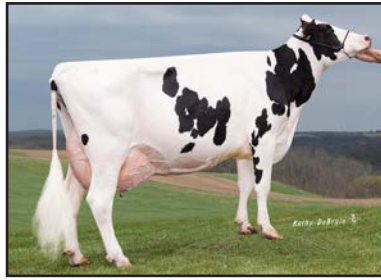
Opsal Million Scamper-ET "EX-90 EX-MS" (Granddam of Lot 61)

Troy Opsal 3017 North Rd. Blue Mounds, WI 53517-9695 608.438.5416