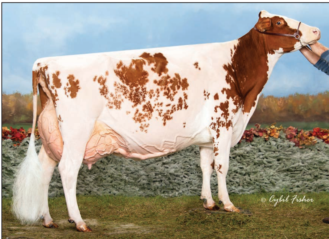
Blondin Redman Seisme-Red-ETS "EX-97 2E" 4* (Third Dam of Lot 31)