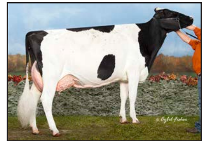
O-C-E-C Toystory Fenway-ET "EX-94 2E" (Granddam of Lot 20)