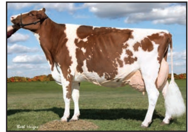
Lavender Ruby Redrose-Red "EX-96 4E" (Granddam of Lot 26, Third Dam of Lot 25)