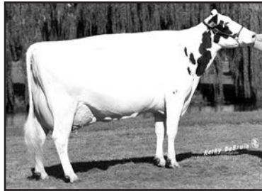
D-R-A August "EX-96 4E" DOM (Seventh Dam of Lot 59)