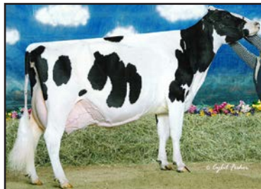
Ernest-Anthony LL Sammy-ET "EX-95 4E" (Fourth Dam of Lot 60)