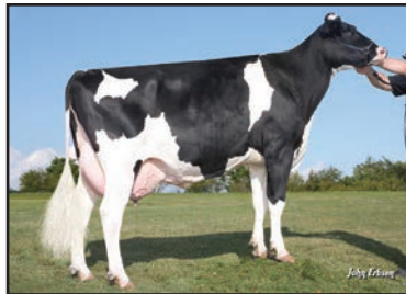
Webb-Vue Goldwyn Elvira-ET "EX-90" GMD DOM (Sixth Dam of Lot 28)