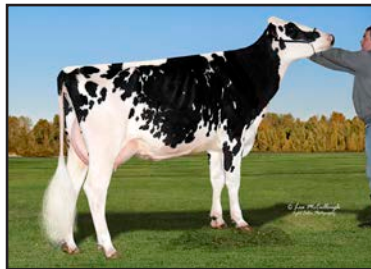
Janestead Shottle Paula "VG-88" (Granddam of Lot 16)