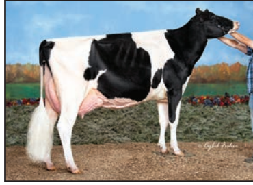
Kingsmill Ashlyns Ashore-ET "EX-94 2E" (Third Dam of Lot 3)