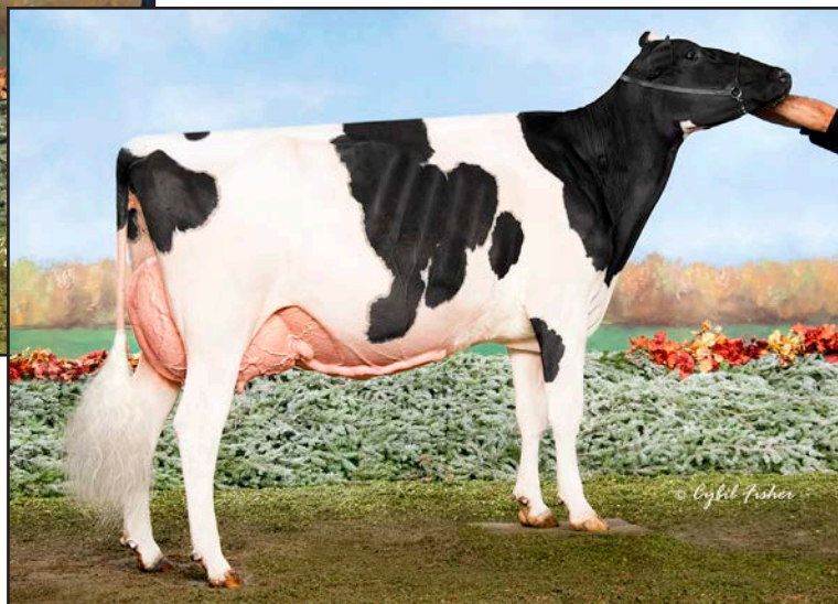
Floydholm Mc Emoji-ET "EX-94" (Maternal Sister to Lot 5)