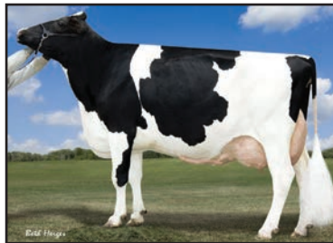
Hilrose Rubens Patsy "EX-93 3E" GMD (Maternal Sister to Third Dam of Lot 2)