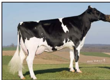
Opsal Shottle Shiloh-ET "EX-91 2E" GMD (Maternal Sister to Granddam of Lot 46)