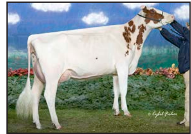
Wilstar SS Dixierose-Red-ET "EX-90 EX-MS" (Maternal Sister to Granddam of Lot 30)