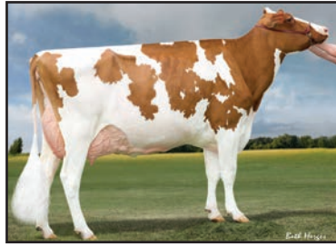
Sunny-Valley A Favor-Red-ET "EX-91" (Third Dam of Lot 27)