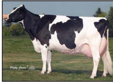
Acme Star Lily "EX-94" 8* (Sixth Dam of Lot 32)

Darren Kamphius N4884 Oak Grove Rd. Brandon, WI 53919-9716 920.872.0243