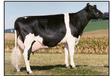
Jenny-Lou Patron Toyane "VG-89" GMD DOM (Fourth Dam of Lot 49)