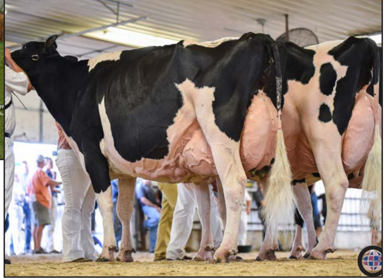
Kishholm Collett "EX-95 3E" (Same Cow Family as Lot 18)