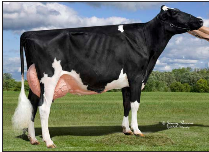
App-Sham Alexander Baby Spot "EX-92" (Dam of Lot 63)