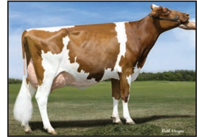
Ms Talent Applicious-Red-ET "EX-92 3E" (Granddam of Lot 24)

72005820 Excellent-90 EEEVE 6-01 *TL *TD 5-04 3x 365d 35,350 4.7 1657 3.6 1267 2-09 3x 365d 29,910 4.4 1311 3.4 1012 S: Tiger-Lily Ladd P-Red-ET