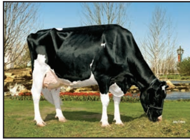
Kamps-Hollow Altitude-ET *RC "EX-95 2E" DOM (Granddam of Lot 19)