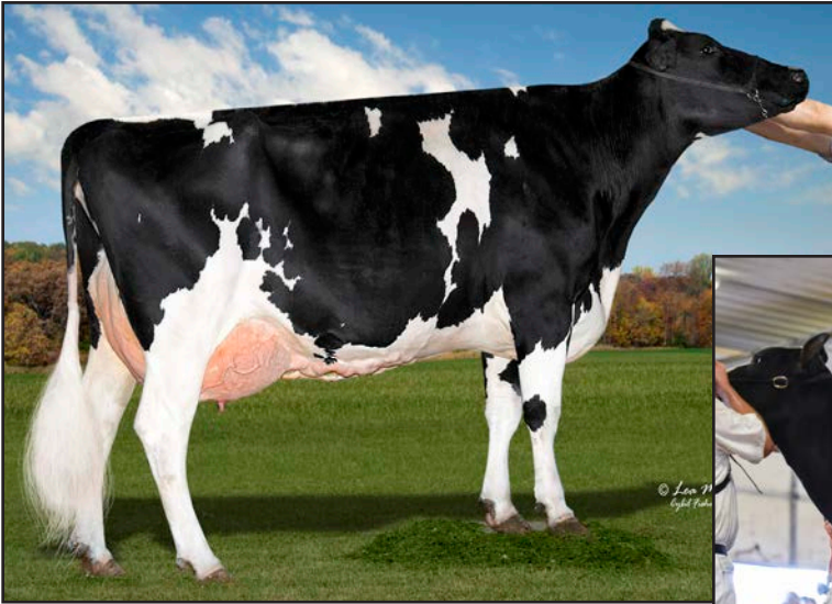
Kishholm Final Cherrypucker "EX-91 2E" (Dam of Lot 18)