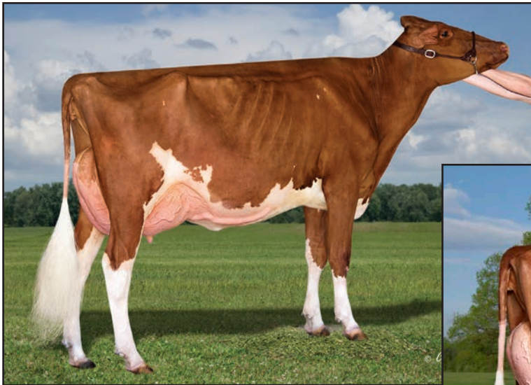
Ms Kress-Hil Sapphire-Red-ET "VG-89" (Maternal Sister to Dam of Lot 17)