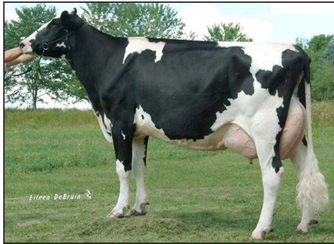
Fustead Blitz Barbie-Tw "EX-92 2E" (Third Dam of Lot 11)