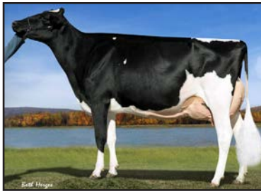
Rosedale Gold Mine-ET "EX-93 2E" (Full Sister to Dam of Lot 26)

Dan Jarek N605 Old Hwy 47 Pulaski, WI 54162-9802 920.737.4338