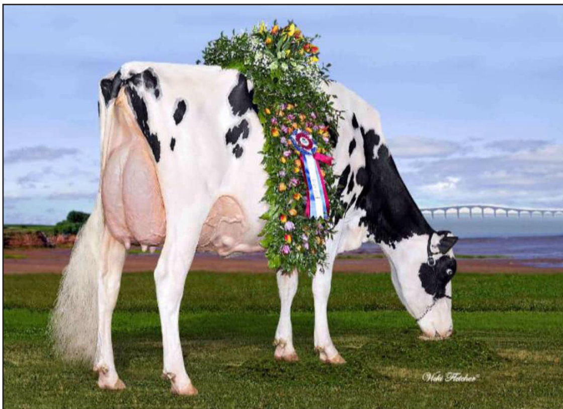
Idee Windbrook Lynzi "EX-95 2E" 1* (Maternal Sister to Lot 6)