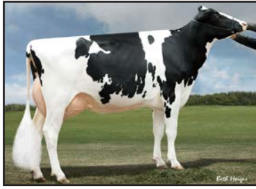
Rosedale Winning Colors-ET *RC "EX-93 3E" (Granddam of Lot 25)