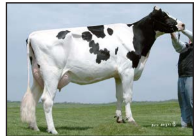
Above-Par Durham Paoli-ET "VG-88" DOM (Fourth Dam of Lot 16)