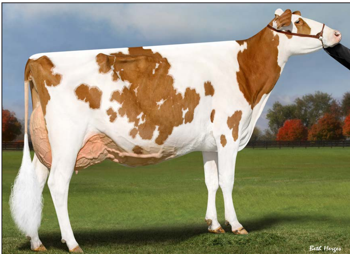
Mead-Manor Def Adeline-Red "EX-94" (Dam of Lot 4)