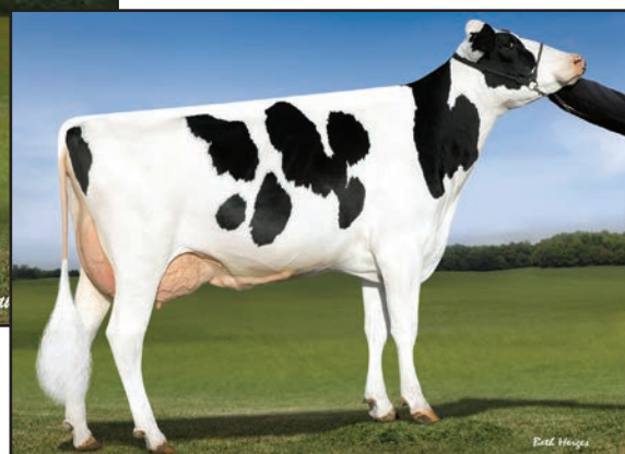
OCD Supersire 9882-ET "VG-86" DOM (Third Dam of Lot 7)