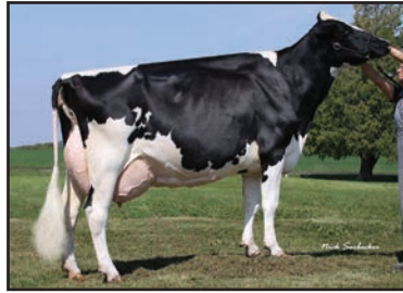
Lyn-Vale Roy Gabrielle "EX-93 3E" (Maternal Sister to Granddam of Lot 9)