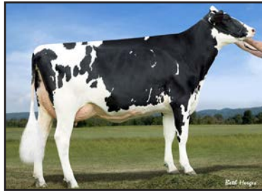
Rugg-Doc Freddie Chick-ET "VG-85" (Fourth Dam of Lot 48)

Whitetail Valley Dairy LLC E1597 Haase Rd. Waupaca, WI 54981-7560 715.281.4549