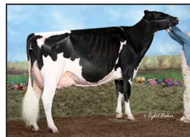
Pierstein Goldwyn Frisou "EX-94 2E" (Granddam of Lot 22)