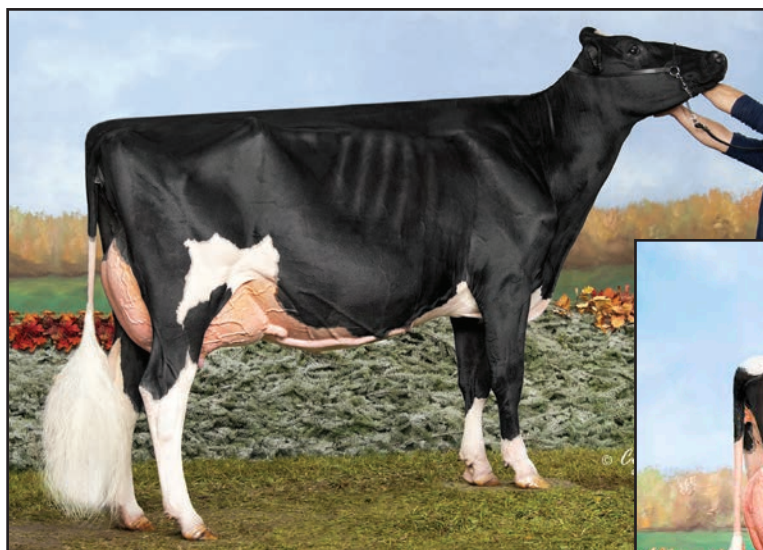
Budjon-JK Damion Eklipse-ET "EX-94 2E" (Dam of Lot 5)