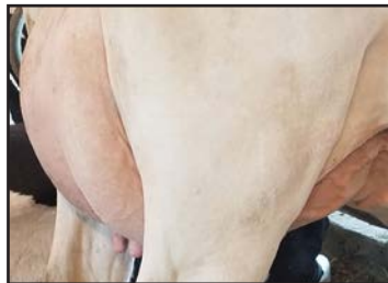
Udder Photo and Showing Photo of Mission-Bell Bywy Rodacious "VG-86" (Lot 35)