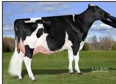
Clearfield Drmn Flamin-ET "VG-87" (Dam of Lot 20)

Bred 2/04/21 to Avant-Garde-I KD Summerfest-ET 94HO19370