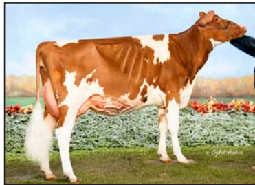
Opsal Diamndbck Madison-Red "EX-90" (Same Family as Lot 10)