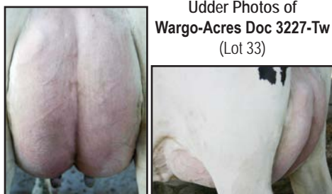
Udder Photos of Wargo-Acres Doc 3227-Tw (Lot 33)

Wargo-Acres Dhavala GP-82 3-00 3x 365d 36,190 3.9 1400 3.1 1127 Wargo-N-JD Dipper EX-90 EX-MS 6-04 2x 365d 49,531 3.5 1738 3.2 1565" 4-11 3x 365d 50,786 3.0 1507 3.2 1655" Life: 1972d 214,509 3.4 7366 3.3 7156" Wargo-N-JD Drea-ET GP-82 3-02 3x 365d 39,108 3.8 1488 3.1 1233" Wargo-Acres Dynamite VG-87 GMD 4-00 2x 365d 45,190 4.3 1956 3.0 1370 Life: 1213d 108,530 4.3 4615 3.1 3414 Wargo-Acres Durham Dazzle 3E-94 GMD DOM 5-05 2x 365d 50,890 3.6 1843 3.0 1548 Life: 2203d 200,270 3.5 7048 3.1 6267 Wargo-Acres Darby VG-88 EX-MS 4-06 2x 336d 34,250 3.4 1168 3.1 1076 Life: 1376d 116,520 3.4 3981 3.2 3704 Wargo-Acres Daisy VG-87 3-02 2x 357d 27,350 3.8 1052 3.3 894 Wargo-Acres Dixie VG-88 EX-MS 3-03 2x 354d 25,190 3.7 920 3.2 804 Wargo-Acres Gold Urbana VG-86 5-01 2x 322d 21,210 3.6 755 3.2 683 Wargo-Acres Stoney Sequel VG-88 4-00 2x 293d 23,220 3.6 826 3.0 691 Wargo-Acres Star Opal VG-87 5-00 2x 339d 26,390 3.4 887 2.9 753 Wargo-Acres Elevation Joy 2E-91 GMD DOM 4-10 2x 365d 25,770 3.9 1013