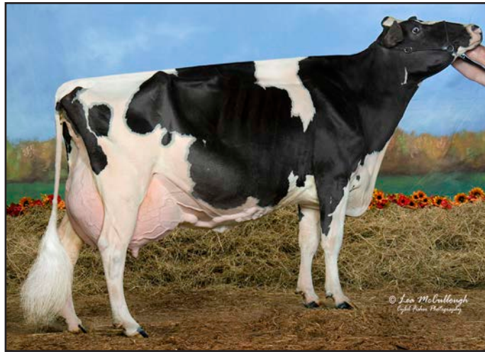
Rotesown Gibson Ideal "EX-94 3E" GMD (Granddam of Lots 13 & 14)