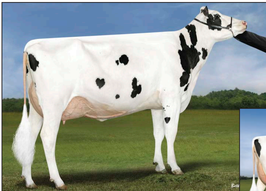
Ms Ri-Val-Re Achvr Paula-ET "VG-87" (Dam of Lot 7)