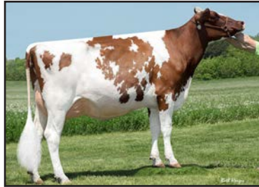
A-L-H Adalade-Red-ET "EX-90 EX-MS" (Dam of Lot 24)

Dan Jarek N605 Old Hwy 47 Pulaski, WI 54162-9802 920.737.4338