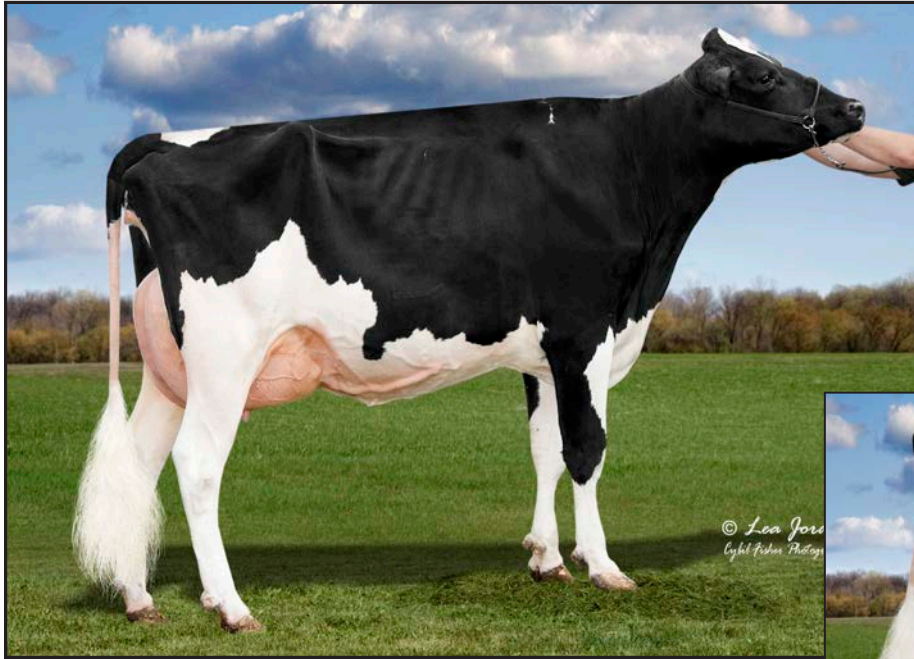
Jimtown KD Narcisa-ET "VG-88" #1 PTAT Cow of the Breed (Dam of Lot 3)