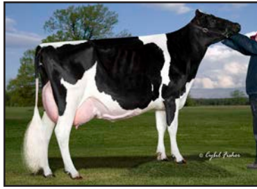
Ziems-EF Dundee Ebony-ET "EX-92 2E" (Third Dam of Lot 42)

Ziems Farms 530 E. Ellendale Rd. #326 Edgerton, WI 53534 314.406.4153