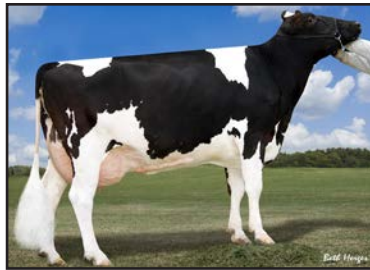
Wilstar Shottle Dreamy-ET "EX-90" GMD (Maternal Sister to Granddam of Lot 30)