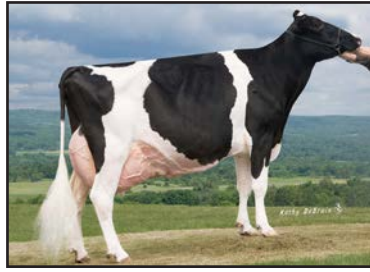
Opsal-Stiles Myron Coral "EX-92" GMD DOM (Third Dam of Lot 34)