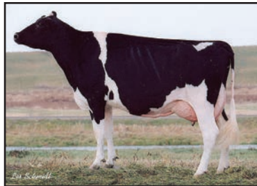
Wargo-Acres Durham Dazzle "EX-94 3E" GMD DOM (Sixth Dam of Lot 33)

Wargo Acres ~ Craig Carncross W12965 County Road J Lodi, WI 53555-9789 608.592.2560