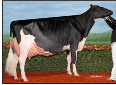
Mystique Goldwyn Boreale-ETN "EX-94-2E" 3* (Dam of Lot 15)

Breanna Wiley 2950 N. State Rd. 75 Thorntown, IN 46071-9238 317.443.3333 Newt