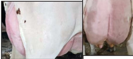
Udder Photos of Lyn-Vale Giselle-Red-ET