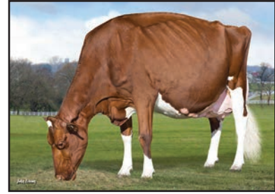
KHW Regiment Apple-Red-ET "EX-96 4E" DOM (Maternal Sister to Dam of Lot 19)