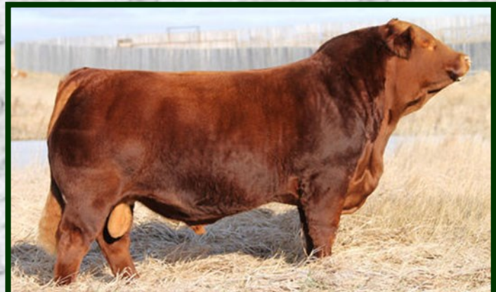
Sire of LOT 10 HUNT Credentials 37C ET

Buckshot is a heavy muscled red bull sired by the very popular HUNT Credentials 37C ET. He has extreme calving ease so he can be used on you entire herd. One look at his numbers should have everyone looking twice.