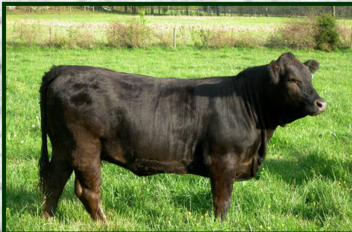
Lot 27 Pictured at 15 months

Jeni is sired by our son of COLE Architect 8A and a daughter of AUTO Dollar General 122R. Growth and maternal in one package. She will have a homo polled and double black calf this fall.