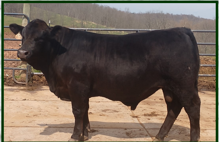
Lot 8 40 cm scrotal on 4/8/20

If you are needing replacement heifers, be sure to check out Griffin. This 75% homo polled Lim-Flex sire has maternal bred in and comes from one of our most solid producing cow families. He ranks in the top 5% for YG and FT and 4% for REA among Lim-Flex bulls. His sire, CTCA Buckeye Bull 8621U, was grand champion and high selling bull at the 2009 Ohio Beef Expo and is the grandsire of COLE Architect 08A.