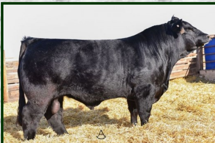
Wulfs Conversion 3970C Sire of several lots in the sale

Take a look at Flower Child. She is homo polled, purebred and carries a very functional set of EPD's, from low birth to a strong milk EPD. Here is another aged bred female to put a calf on the ground this fall by Wulfs Editor. The Editor calves have been very stylish in their make-up and perform with an abundance of muscle.