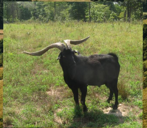
GHK ONYX STAR