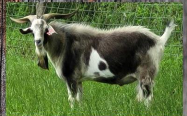
SIH SANJA BLUE PATCHES