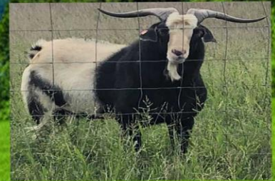
SSK WAR HORSE