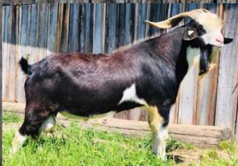
LFK OUTLAW'S IRONMAN