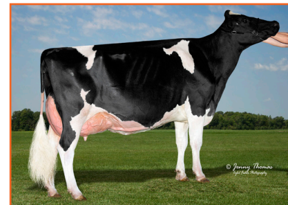
Kouwenberg Redesign A 1615 EX-95 2E Dam of Lot 38

MS:86 (FA:7 RAH:9 RAW:6) F&L:83 DS:89 RP:87 2 01 305 21367 730 3.4 653 3.1 3 08 305 26488 787 3.0 785 3.0 4 09 305 26621 1001 3.8 825 3.1 LIFE: 96566M 3891F 4.0% 2965P 3.1%