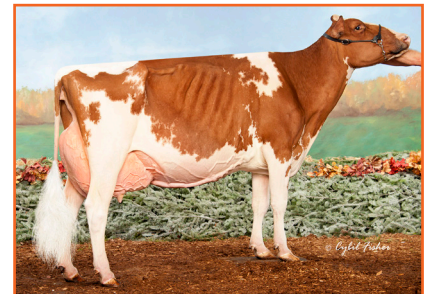
TJ-Pollema Rdlnr Shania-Red EX-95 3E Dam of Lots 2-8

TJ-POLLEMA ADVNT SHEENA-RED -61984005- EX-91 EEVEE 2 02 305 26930 1285 4.8 791 2.9 3 03 150 16120 656 4.1 496 3.1 6 11 305 29090 1133 3.9 847 2.9 • Nom. All-American R&W Sr. 2 Yr. Old '08