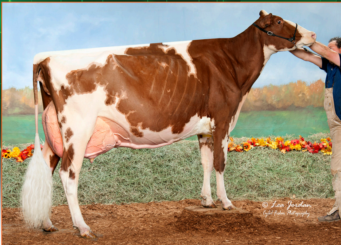
Rosedale Rumour Has It EX-94 2E GRAND CHAMPION R&W MID-EAST NATIONAL '18 4X NOM. ALL-AMERICAN Dam of Lot 53 & 54