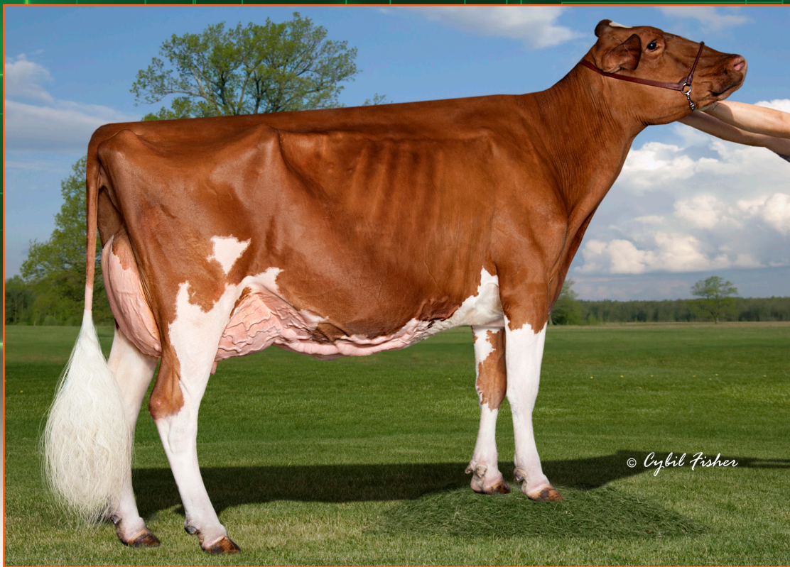
Westcoast Absolute Roulett-Red EX-93 5TH SR. 2 YR. OLD WESTERN SPRING NAT'L '16 Dam of Lot 24 & 25