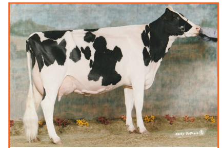
Mybrook Redmarker Becca EX-94 6th Dam of Lot 52

4-00 VG-88 EEVVV 2 09 265 20740 688 3.3 649 3.1 3 09 214 14140 539 3.8 501 3.5