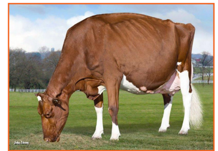
KHW Regiment Apple Red EX-96 4E 2nd Dam of Lot ??

3rd Dam: KAMPS-HOLLOW ALTITUDE EX-95 2E 4th Dam: CLOVER-MIST ALISHA EX-93 3E 5th Dam: CLOVER-MIST AUGY STAR EX-94 4E 6th Dam: D-R-AAUGUST EX-96 4E