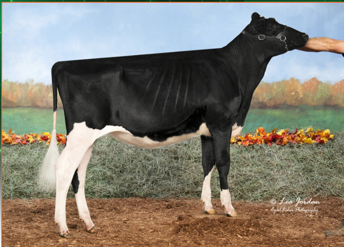
Stookeyholm Goldwyn Baby 3RD FALL CALF MID-EAST FALL NATIONAL '19 Full Sister to Lot 17