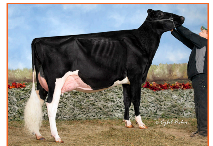
Pappys Goldwyn Rave EX-91 1* RES. ALL-AMERICAN SR. 2 YR. OLD '12 ALL-AMERICAN WINTER YEARLING '11 ALL-CANADIAN WINTER YEARLING '11 JR. CHAMPION INT'L HOLSTEIN SHOW '11 Maternal Sister to 3rd dam of Lot 24 & 25

3rd Dam: PAPPYS SEPT STORM RHONDA VG-88 4th Dam: MARKWELL DURHAM RAVEN EX-93-2E • Nom. All-American Produce of Dam '16 5th Dam: MARKWELL RUDOLPH RHODA EX-92-3E 2* 6th Dam: MARKWELL BSTAR E RAVEN EX-95-3E 5* 7th Dam: MARKWELL MARK ELITE EX-92-4E 3*