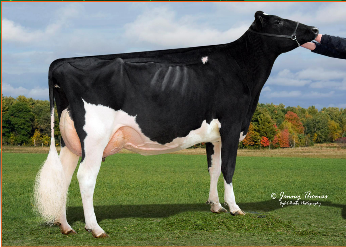
Benrise Duplex Arienne EX-95 2E 2X GRAND CHAMPION TN STATE HOLSTEIN SHOW 1ST AGED COW & HM SR. CHAMPION NAILE '17 Dam of Lots 9-12