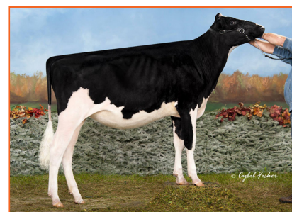
Winright Chip Of Excellence VG-88 Dam of Lot 34

3rd Dam: HOLLAND HEIGHTS MORTY JOY VG-86