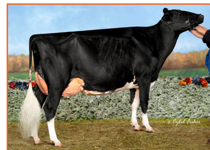
Jacobs Sid Beauty EX-95 ALL-AMERICAN JR. 3 YR. OLD '15 INT. CHAMPION INT'L HOLSTEIN SHOW '15 Full Sister to Lot 39