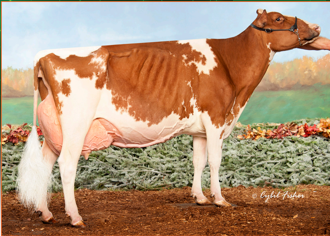
TJ-Pollema Rdlr Shania-Red EX-95 3E UNANIMOUS ALL-AMERICAN R&W 125,000 LB '18 RES. ALL-AMERICAN R&W 125,000 LB Cow '16 Dam of Lots 2-8 & 2nd Dam of Lot 8a