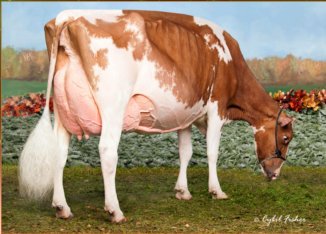
TJ-Pollema Rdlnr Shania-Red EX-95 3E UNANIMOUS ALL-AMERICAN R&W 125,000 LB '18 RES. ALL-AMERICAN R&W 125,000 LB Cow '16 Dam of Lots 2-8