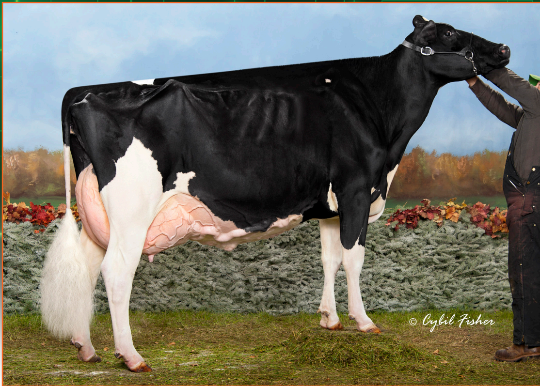
Burks-Branch G-Wyn Fara EX-92 1ST 4 YR. OLD & RES. GRAND CHAMPION KY STATE FAIR '14 Dam of Lot 35 & 36