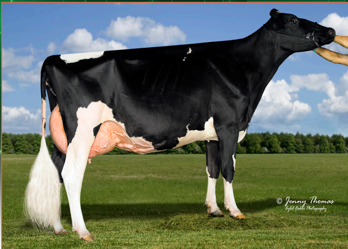
Craz-Ate Destry 838 EX-94 2E RES. GRAND CHAMPION IN STATE FAIR '16 Dam of Lot 49