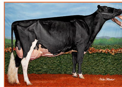
Jacobs Goldwyn Britany EX-96 2E 17* Dam of Lot 39

VG-88-4YR-CAN 21*(0/105) MS:88 (FA:9 RAH:9 RAW:7) F&L:88 DS:88 RP:88 2 08 305 22465 937 4.2 758 3.4 4 07 305 38102 1532 4.0 1243 3.3 LIFE: 65331M 2648F 4.1% 2187P 3.3%