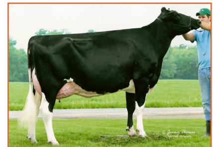
Bar-Mik Goldwyn Hope EX-91 2E 2nd Dam of Lot 27

6-06 EX-91 2E EEVVE 3 03 293 25300 1081 4.3 817 3.2 7 09 166 14480 608 4.2 497 3.4