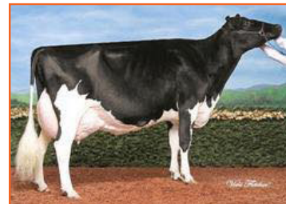
La-Par 1593 Gen 1824 EX-95 ALL-AMERICAN SR. 2 YR. OLD '06 RES. ALL-AMERICAN SR. 3 YR. OLD '07 Maternal Sister to Dam of Lot 37

6-08 EX-92 2E EEEVE 2 01 305 20010 878 4.4 609 3.0 3 01 305 23970 1037 4.3 759 3.2 4 10 305 25410 1099 4.3 726 2.9 6 07 305 25440 1116 4.4 708 2.8 8 04 243 21450 877 4.1 556 2.6 LIFE: 159,220M 7065F 4.4% 4824P 3.0%