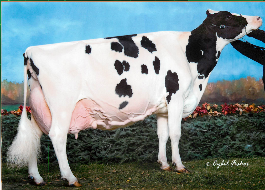
Mactalla Marker Molly EX-95 3E RES. GRAND CHAMPION INTERNATIONAL HOLSTEIN JR. SHOW '08 JR. ALL-AMERICAN AGED COW '08 NOM. ALL-AMERICAN AGED COW '08 Dam of Lot 31 & 32