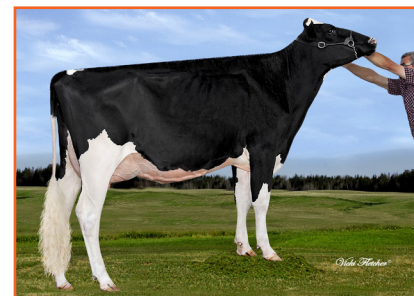
Gleann Atwood Revival VG-87 2yr Dam of Lot 40

3rd Dam: GLEANN RM RUSTICO VG-86 10* 4th Dam: GLEANN JED RAINBOW VG-88 6* 5th Dam: TERRDALE SECRET RUSS EX-90 9* 6th Dam: TERRDALE SUNSHINE VG-85