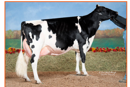
Eastside Goldwyn Millie EX-94 Maternal Sister to Lot 31 & 32

MACTALLA EXPERT MOLLY -CAN 5411106- VG-87-4YR-CAN 2*(10/0) MS:86 (FA:7 RAH:8 RAW:7) F&L:82 DS:90 RP:88 2 02 305 16881 659 3.9 545 3.2 3 03 305 22383 791 3.5 712 3.2 4 03 305 23450 851 3.3 734 3.1 5 05 305 22932 791 3.5 681 3.0 6 05 305 23005 800 3.5 681 3.0 7 09 305 23331 778 3.3 679 2.9 8 11 300 20146 794 3.9 633 3.1 LIFE: 159,388M 5736F 3.6% 4932P 3.1%