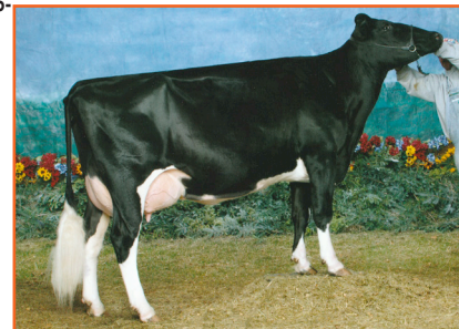
Viaduct Lee Beau EX-94 3rd Dam of Lot 17 & 18

3rd Dam: VIADUCT LEE BEAU EX-94 • Grand Champion Mid-East Spring Nat'l '07 • Res. Grand Champion OH State Fair '05 • 1st Sr. 3 Yr. Old Mid-East Spring Nat'l '03 4th Dam: THAL-VIEW MILAN BUBBLES VG-88 5th Dam: C NAYLORCROFT BROKER BIRDIE EX-93 6th Dam: NAYLORCROFT MID BERTHA VG-86