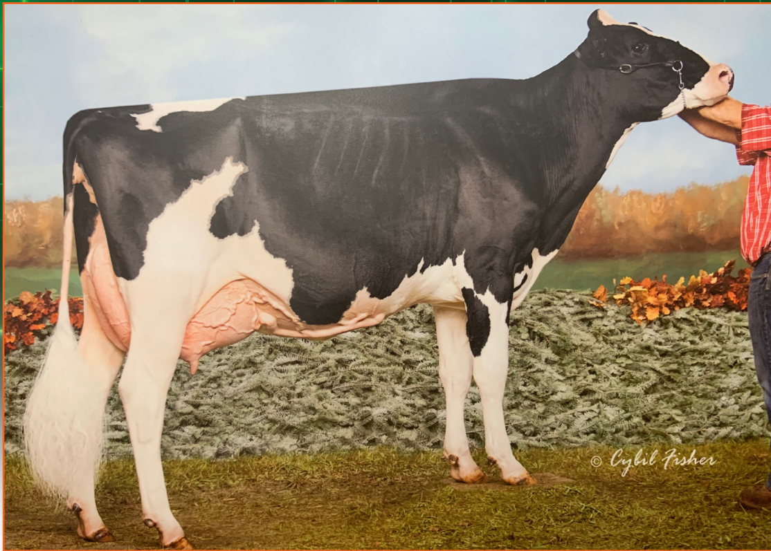
VT-Pnd-View GC Ace EX-91 2E GRAND CHAMPION TN STATE JR. SHOW '16 6TH 4 YR. OLD INTERNATIONAL HOLSTEIN JR. SHOW '16 Dam of Lot 55 & 56