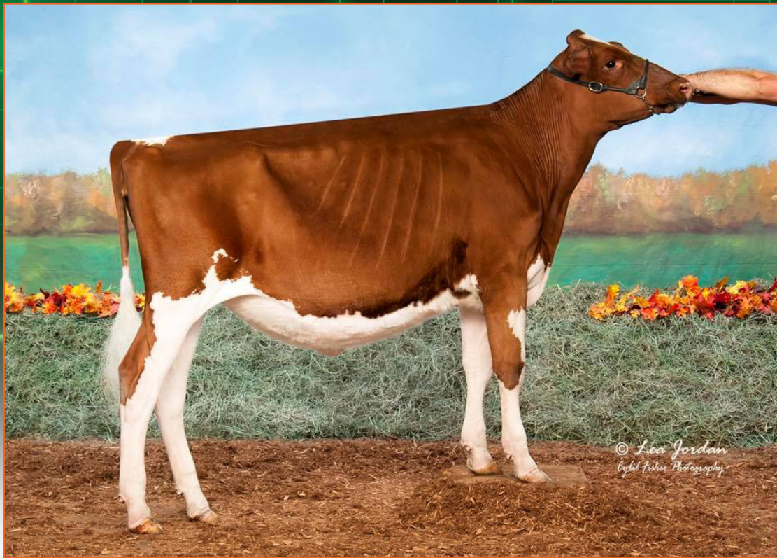
Ms Shantias Shimmer Red NOM. ALL-AMERICAN R&W WINTER CALF '19 Sells as Lot 2 & Maternal Sister to Lots 3-8