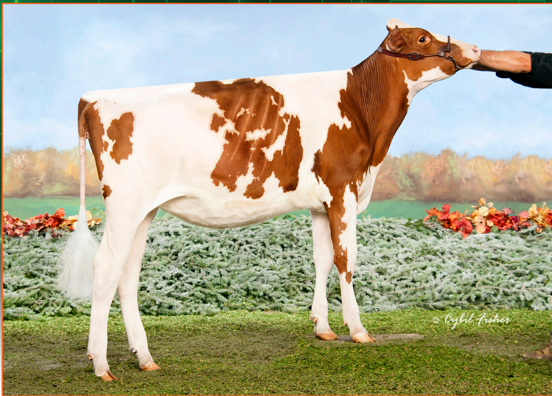
Apple-PTS Aleesa Red RES. JR. ALL-AMERICAN SUMMER YEARLING '19 NOM. ALL-AMERICAN SUMMER YEARLING '19 Dam of Lot 60