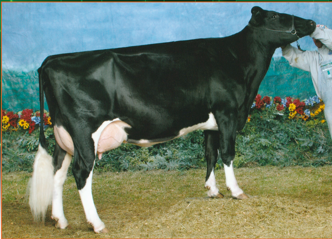
Viaduct Lee Beau EX-94 GRAND CHAMPION MID-EAST SPRING NAT'L '07 RES. GRAND CHAMPION OH STATE FAIR '05 3rd Dam of Lots 13-18 & 4th Dam of Lot 19