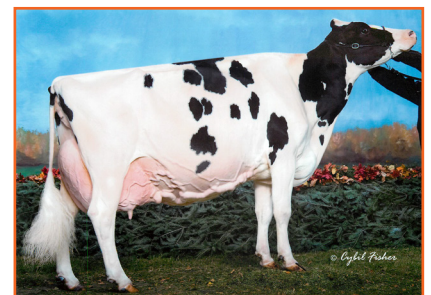
Mactalla Marker Molly EX-95 3E 2nd Dam of Lot 28-30