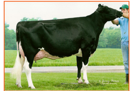
Bar-Mik Goldwyn Hope EX-91 2E 2nd Dam of Lot 26