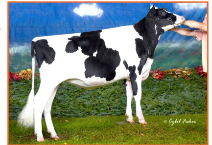
Rocky-Top Astro Lady Vol EX-93 3E 2nd Dam of Lot 41

• 1st Summer Yearling Mid-East Spring Nat'l '06