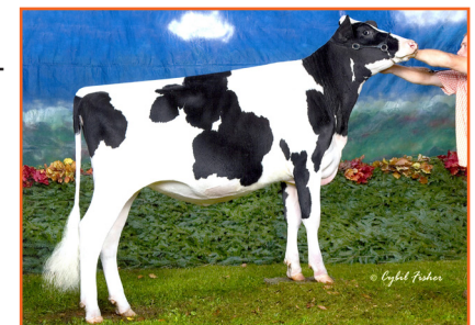
Rocky-Top Astro Lady Vol EX-93 3E 2nd Dam of Lot 42

• 1st Summer Yearling Mid-East Spring Nat'l '06