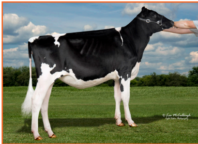
Lookwell Bonzai Hopeful EX-91 Dam of Lot 26

6-06 EX-91 2E EEVVE 3 03 293 25300 1081 4.3 817 3.2 7 09 166 14480 608 4.2 497 3.4