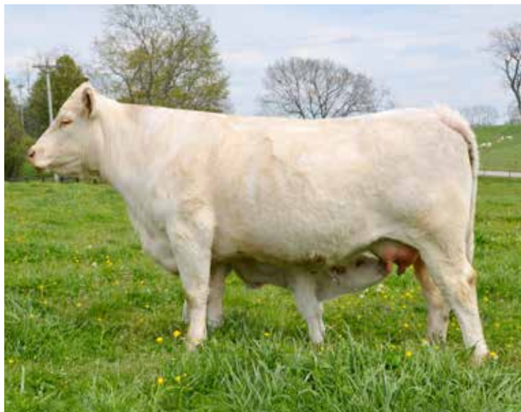
BARA MS PRESIDENT ET SELLS AS LOT 53