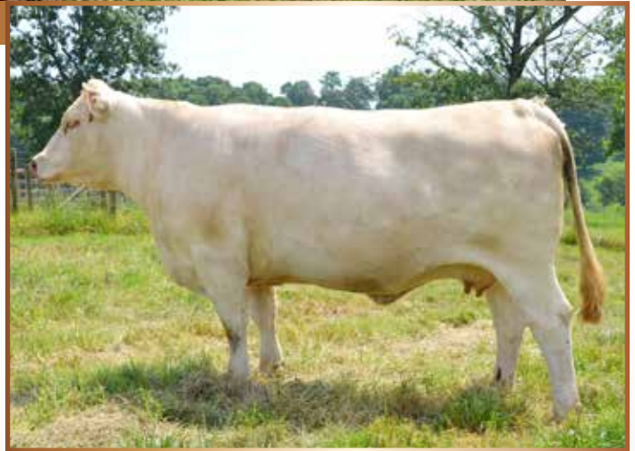
OHF SHE SMOKING D823 ET Donor Dam of Lot 1

LT RUSHMORE 8060 PLD LT RIO BRAVO 3181 P CCC WC RESOURCE 417 P M846721 LT BRENDA'S EASE 3055PLD WC CCC BLUE GIRL 1528 P LT BLUE VALUE 7903 ET CCC BAD GIRLFRIEND U146 P ET LHD CIGAR E46 LHD MR PERFECT Y416 OHF SHE SMOKING D823 ET EF1199543 LHD MS CLASSIC BELL X613 THREE TREES NANCY 9126ET LT WYOMING WIND 4020 PLD JCA ALI ET