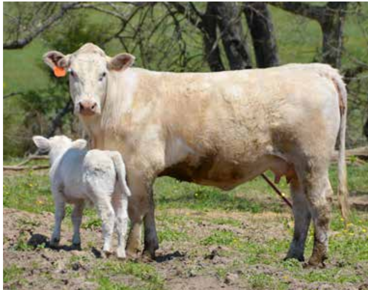
REAVES MS TIARA WRANGLER 355

20A: Pld bull calf born 3/20/21, sired by M6 Law & Order 577 P. 355's dam, 106Y is a maternal sib to Virginia Tech and Lone Oak's great Grid Maker bull, LOF/VPI Abraham. 106Y sire is also out of a Grid Maker son, EC No Doubt for a uniform genetic standing. Great numbers here, top 6% for WW, 15% YW, 35% Milk, 15% MTL, 35% CW, and 20% TSI for breed EPD rankings. Wrangler definitely adds super style and conformation.