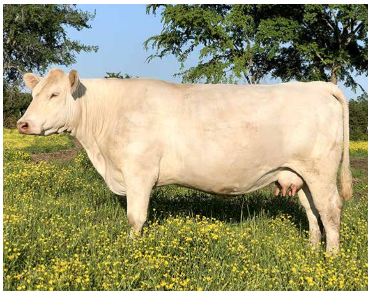
CF FAITH 631 P SELLS AS LOT 60

Sells Open. this elite 4398 daughter adds a tremendous fall born offering from a top producing pedigree. She has good numbers for CE, BW, and a top 15% ranking for REA. Her dam is sired by a former AICA National Champion, Impressed 620 and one of the most prepotent show sires, Fire Water. You also have the very successful and popular Kennedy cow family from Doubs that has 118 progenies registered with AICA.