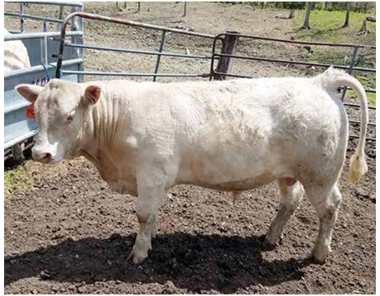
WELCOME GROVE SHELTER SELLS AS LOT 7

Selling Full Interest and Full Possession. Fertility and Trich tested. A young sire to develop under your environment, this good numbered bull will offer a very proven pedigree of successful genetics. Mokie is doing an outstanding job for Welcome Grove as you will also see in Lot 8. Shelter's dam is in Welcome Grove's ET program. A daughter of M02 is in Happy 11's, TX., herd and sired by Mokie's sire, 2323.