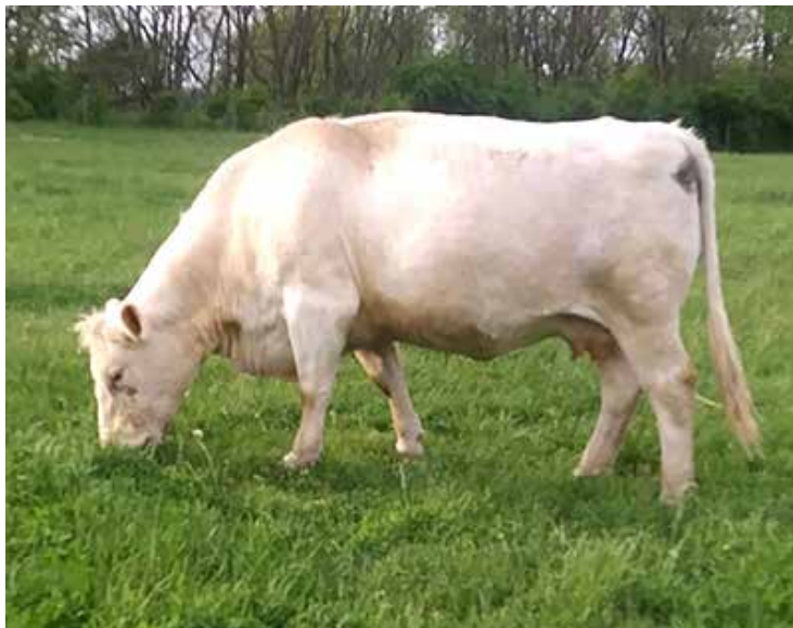
THREE TREES VANNA 1421 ET DAM OF LOT 56

Sells Open, halter broke , a super feminine made young lady here. Vanna traces back to one of the great cows of the breed, JWK Vanessa D029. Vanna's dam is still going strong at 17 years of age! Fertility and longevity are bred into this cow family. The Wind and Water females are some of the best in the KY, Jeffries Charolais herd. A great disposition enhances her value and pride of ownership in a top prospect!