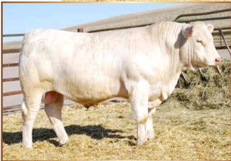
DC/BHD FRONTLINE H63 P HIGH SELLING BULL 2021 DEBRUYCKER BULL SALE