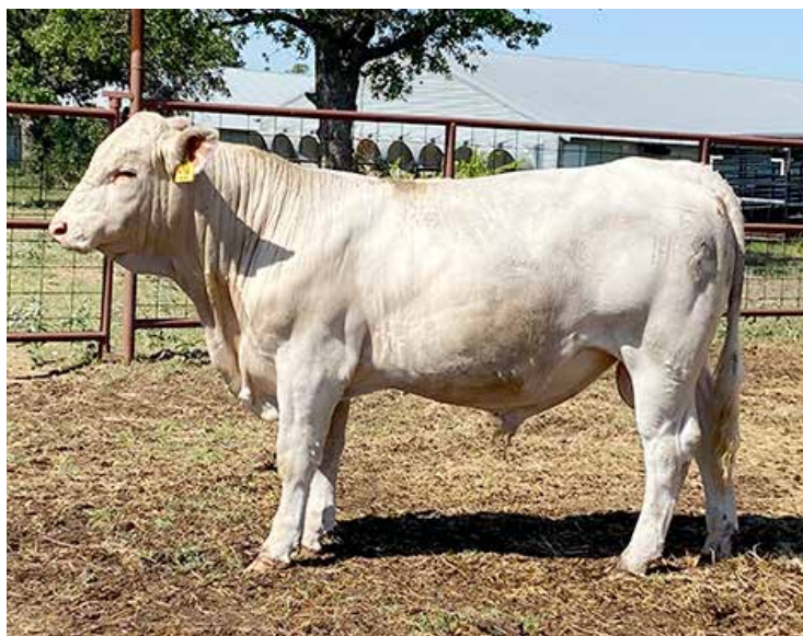
TEL FARGO H16 SELLS AS LOT 5

Selling Full Interest and Full Possession. Fertility and Trich tested. Outstanding numbers on this superb prospect, ranking in the top 6% for WW, 8% YW, 6% MTL, 15% CW, 3% REA, and 20% TSI. His dam is a heavy milking, stylish daughter of an AICA Trait Leader, Smokester. With a 72 lbs birth weight, this bull will be an asset for easy calving genetics and a good one for first calf heifers.