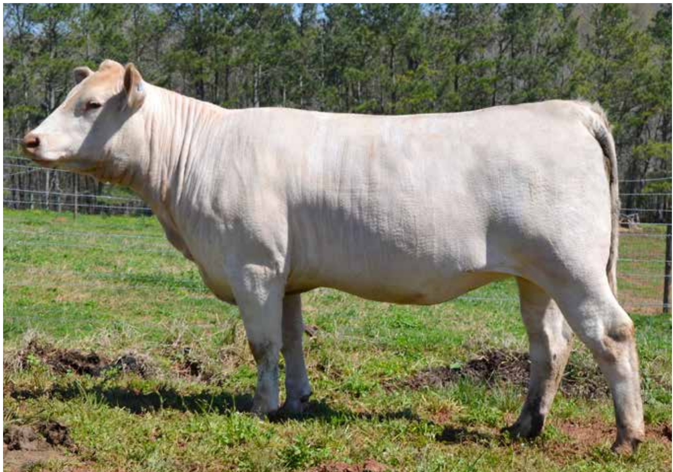
OHF LADY J830 ET