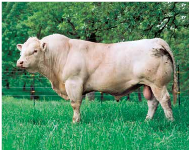
JDJ SMOKESTER J1377 PET SIRE OF LOT 36

Sells bred A-I on 3/19/20 to DC/CRJ Tank E108 P, safe in calf. A super fancy daughter of Smokester with very pleasing EPDs, ranking in top 25% WW, 45% YW, 15% Milk, 9% MTL, 9% REA, and 1% Fat. Calf by Tank will send the numbers through the roof! He ranks in top 8% CE, 20% WW, 1% YW, 1% CW, 20% REA, and 1% TSI. Out of a top producing Grid Maker cow, Yvette accelerated in growth and performance.