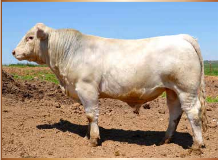
REAVES COOL STANDARD 2040 SELLS AS LOT 2