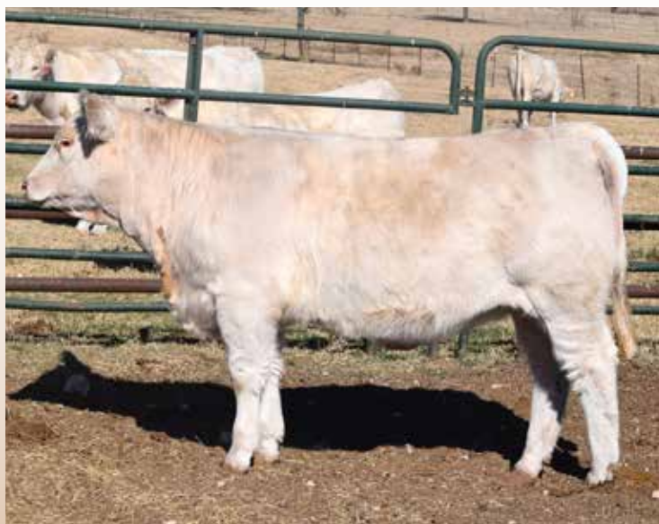
BC SMOKING DYNASTY E01 PET SELLS AS LOT 12