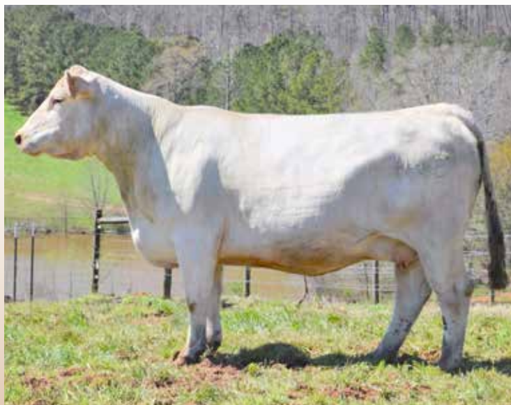
RRCA MS A594 SELLS AS LOT 46

Safe in calf 4 1/2 months sale day to Welcome Grove Rave 1824 ET . A very sharp profiling Ledger daughter with good numbers, solid pedigree, and phenotypically and structurally correct. She had a 113% Weaning ratio and 119% Yearling wt ratio for proven real-world numbers. The Rollins Ranch females are known for being great milking females and very feminine.