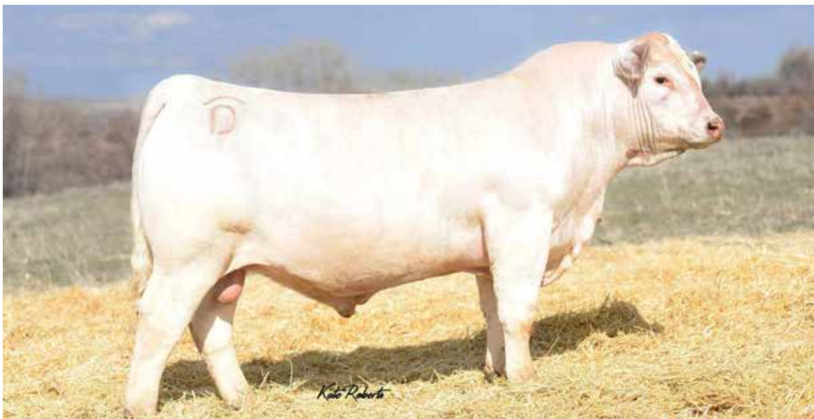
DC/CRJ TANK E108 P