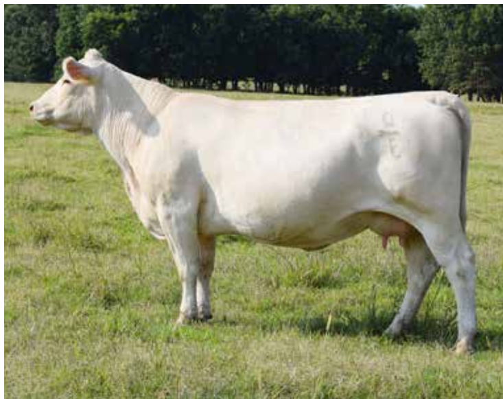
JDJ MS SMOKESTER Y207 DAM OF LOT 4