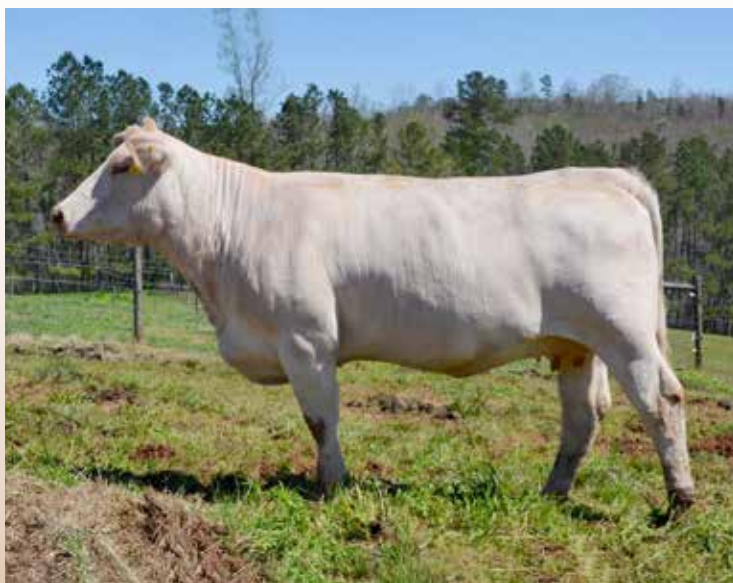
HAYDEN F810 SELLS AS LOT 43