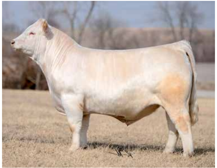
WC UNCHARTED 7328 P SIRE OF LOT 29

Sells Open , A remarkable heifer from a super profiling background. Her granddam, 7184 is also the dam of LT Polled Value, and 143 other progenies registered with AICA. On the sire side, Uncharted is the popular young sire by Resource 417 and a very strong cow family of Clarice J139 blended with the Brenda cow family of LT breeding. This heifer will have breed leading EPDs, (we will have those sale day).