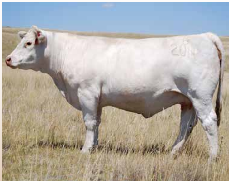
JDJ MS CIGAR B2011 P ET DAM OF LOT 49