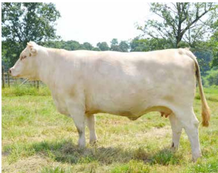
OHF SHE SMOKING D823 ET DAM OF LOT 42

Sells Open , strong maternal ability in this line-up. The dam traces to LHD Mr Silver Mark A35, used heavily in DeBruycker program and M6 Ranch. Miss Betsy 335 traces to the great NF Agatha 9581, that started her career at F&F and then on to Morley, and in a dispersal was syndicated. She has a monumental effect on the breed, one of her sons, WM Ali Star 250 was a #1 AICA Multiple Trait Sire. Several Mac 809 and Duke 914 daughters were in many ET programs.