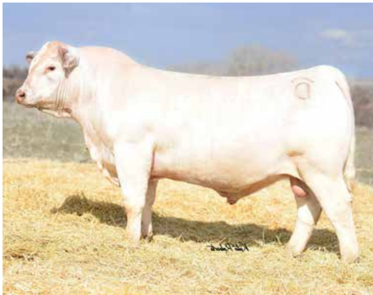
DC/CRJ TANK E108 P SIRE OF LOT 24 EMBRYOS