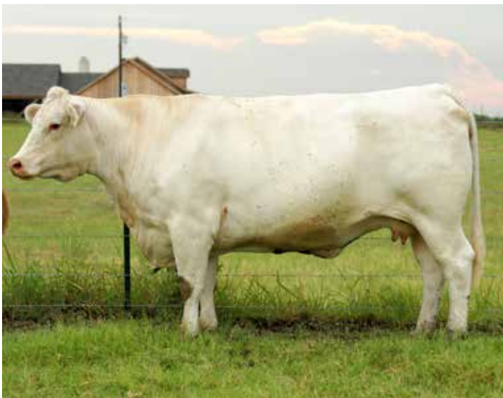
MOORES MS MAC 8241 PET DONOR DAM OF LOT 66 EMBRYOS

JOIN US FOR A Great Offering OF BOTH LIVE AND FROZEN LOTS!