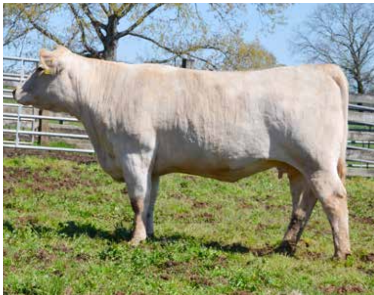
OHF MIRANDA GN25 ET SELLS AS LOT 44

Safe in calf 5 _ months sale day to Welcome Grove Rave 1824 ET . Miranda is by a bull used very successfully at Oak Hill, EC Reliable 5043. His daughters were outstanding in production and milking ability. The dam is by the very maternal sire, Dakota Wind 2074 that produced many great females for Spring Ridge Cattle, KY. Miranda 208 was a top donor for Double-H Charolais, MN. A very proven lineage on this top consignment.