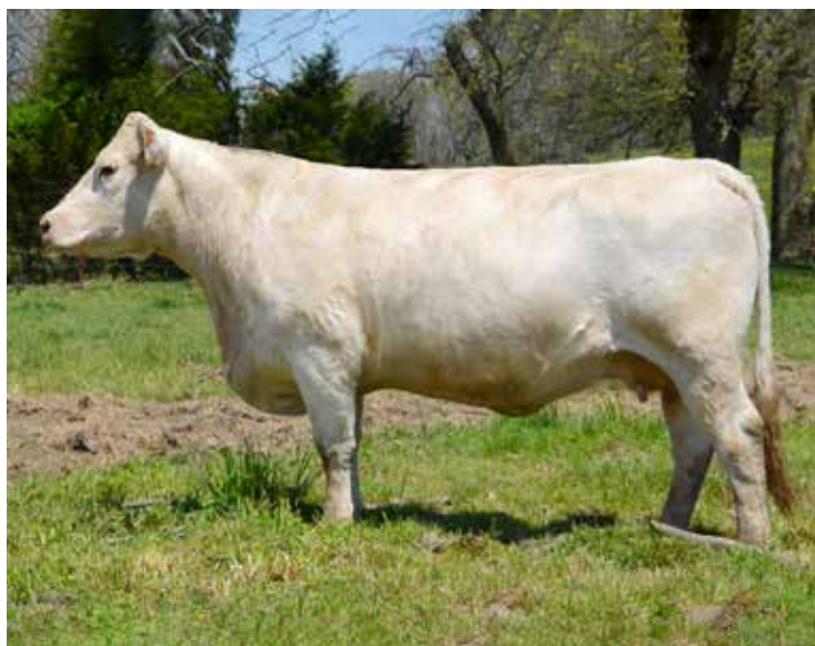
JBC PERFECT LADY 403 P ET SELLS AS LOT 11