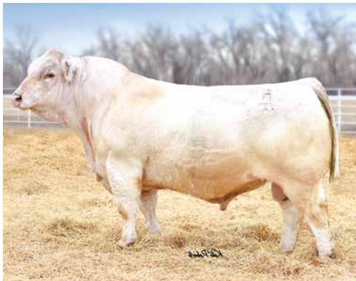
RBM FARGO Y111 SIRE OF LOT 17