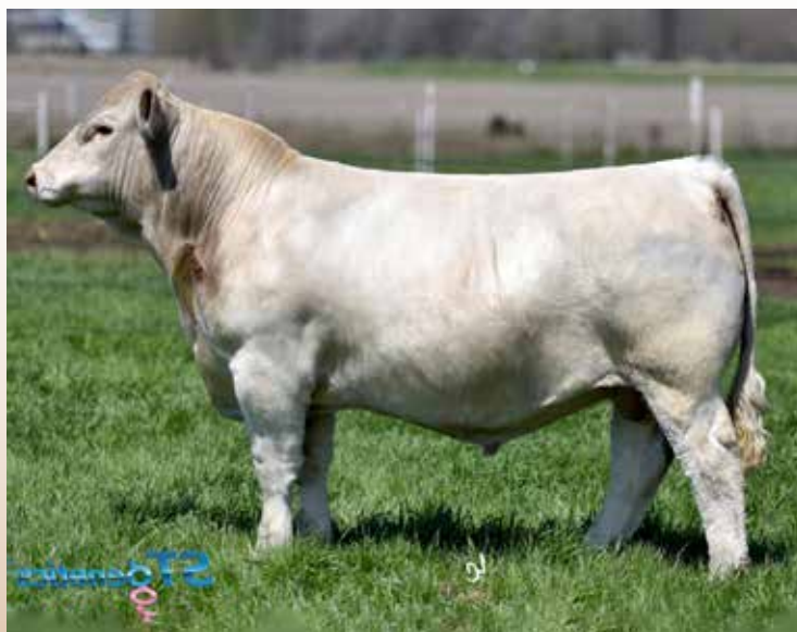
WR FOREMAN D602 SIRE OF LOT 19