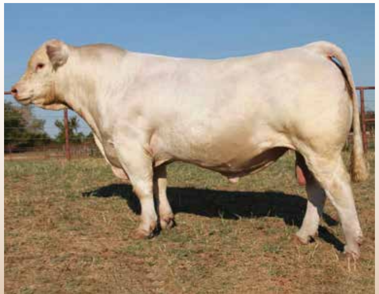
M6 FRESH AIR 8165 P ET SIRE OF LOT 9

9A: Pld bull calf born 4/20/21, bw 95, sired by RBM Fargo Y111. A very solid pedigree of functional cattle, superb numbers ranking in top 2% for WW, 5% YW, 15% MTL, 30% CW, 15% for both REA and Fat, and 7% for TGI. Fresh Air is a maternal sib to SR/NC Field Rep 2158 that is also a very proven and popular sire. This solid pedigree represents a solid foundation for any successful program.