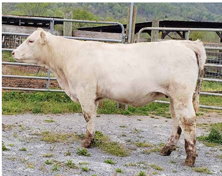
AKF AVA'S MERIDA 14H SELLS AS LOT 34

33A: Pld heifer calf # 024, born 12/30/20, bw 72, sired by WC Boulder 8535, M931039. Boulder is a LT Rushmore son out of a Blue Value x Clarice J139 granddaughter. Tremendous EPDs, top 8% WW, 6% YW, 25% Milk, 7% MTL, 9% CW, 20% REA, and 15% TSI rankings for the breed EPDs. Plenty of power on the dam's pedigree, the 361 bull is a full sib to several high selling full sibs all tracing to the great Cigar donor, 2070!