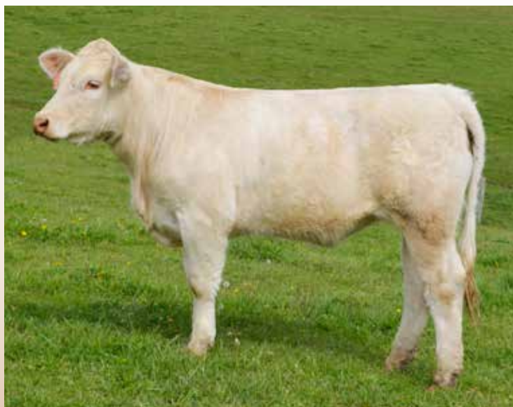
CF MS BRAXTON H180 SELLS AS LOT 52

Sells Open , this long bodied, big bone, straight top with square hip has the definite look of a broodcow in the making. She excels in design and good frame size. Her dam is a big, high volume, heavy milking Fire Water cow purchased in previous Appalachian Sale. She consistently produces one of the best calves each year and breeds back quickly. These two Braxton's would be excellent additions to any progressive program.