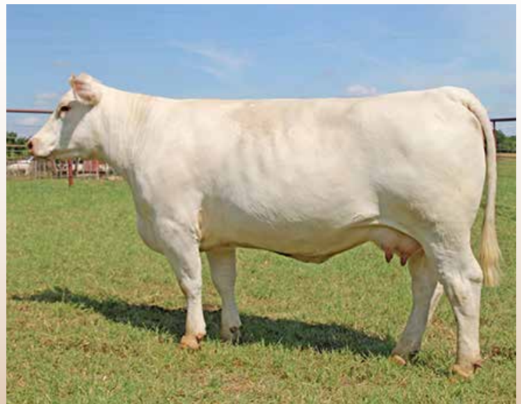
M6 MS NEW NANCY 277 P ET DAM OF LOT 16