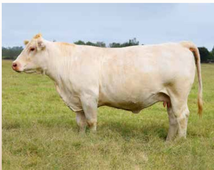
DOUBLE-H LEGENDS ANGEL 125Y ET DAM OF LOT 61