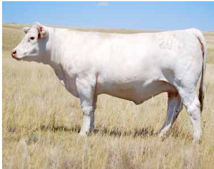
JDJ MS CIGAR B2011 P ET DONOR DAM OF LOT 68 EMBRYOS

Selling 3 embryos from mating DC/CRJ Tank E108 P x JDJ Ms Cigar B2011 P ET. A fantastic offering of newly acquired embryos from one of the great donors in the breed, B2011. She has 30 calves registered with AICA and her dam R120 has 38 calves. R120 is also the dam of JDJ Truemark T39, the sire Zeus X3041. Tank is setting all kinds of records, super marbling, great growth, one of the most popular bulls in the breed. Lindskov-Thiel just purchased an interest in Tank so you will be hearing a lot more of him!