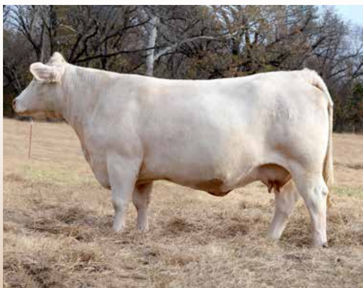
DS MS CURLING VERNA 1002 DAM OF LOT 35

Sells Open, a big boned, long-bodied heifer with appealing femininity and style. She shines in numbers, ranking in the top 20% for both WW and YW, 8% MTL, and 35% TSI. Has a very desirable birth weight for proper growth and an excellent weaning wt. Merida's dam is the Cigar x Duke 914 cross that has been one of the perfect blends in genetics for the breed.