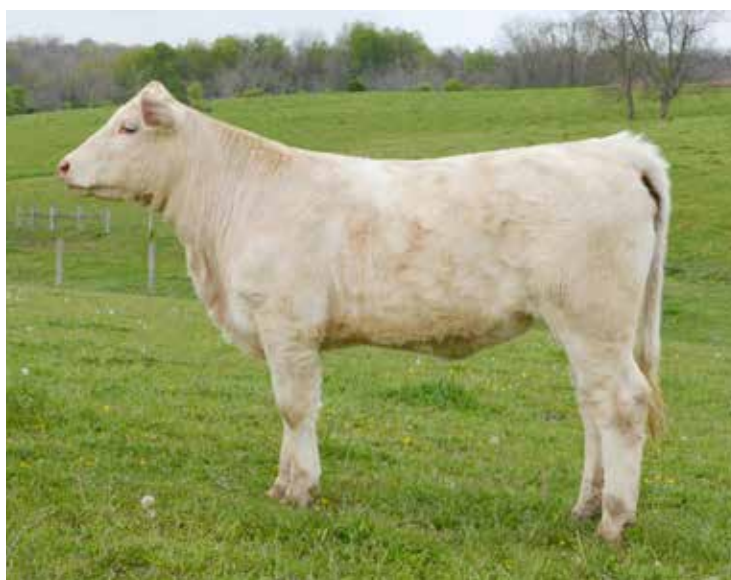
CS MS BRAXTON HF77P SELLS AS LOT 51

Sells Open , ready to breed to the bull of your choice. A Braxton that offers a Canadian outcross genetics blended with the homozygous Maximo and daughter of lot 50. This sharp, feminine necked heifer with a big square hip and big bone will certainly be one to evaluate in Knoxville. If you like them pretty, complete, stout made, and feminine with good numbers this heifer will be one to mark to take home!