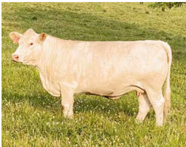
RE EQUAL DYNASTY 418 ET SELLS AS LOT 48

Safe in calf Safe in calf 5 months sale day to Welcome Grove Rave 1824 ET. Another top Ledger with the strong carcass ability of the Silver Yield background. Good CE and BW numbers with solid growth EPDs. Good CE and BW EPDs and steady growth numbers. Poll Grazer was a HEP King Grazer 25A son, one of the best in early genetics, and out of a Deacon John strong polled cow side of the pedigree.