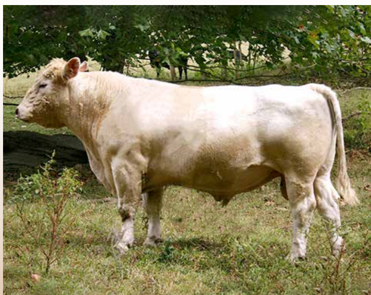
RLHS MR CLEAN PD

Safe with embryo implanted 11/18/20 from DC/CRJ Tank E108 P x BFM B30 Nancy P ET, (Lot 24). Her dam is sired by a full sib to JDJ Smokester J1377 PET, the Ali Command 310 bull. The Geisha G148 was in the Arlitt's herd, TX and a daughter of hers is in Pylar & Son herd, AR. The ET calf will enhance the value of this top PB recipient. Tank is one of the most exciting bulls in the industry now! Donor dam is from the Nancy Family!