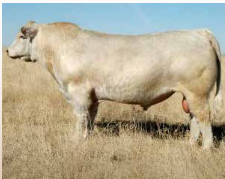
LT LONG DISTANCE 9001 PLD PATERNAL GRANDSIRE OF LOT 6

Selling Full Interest and Full Possession. Fertility and Trich tested. Another top Fargo son with outstanding numbers, ranking in the top 10% for WW, 7% YW, 15% MTL, 15% CW, and 15% TSI EPDs for the breed. The Duke Stone is a former AICA Trait Leader and sired several top selling bulls at the Rancher's Choice Bull sale in Texas. This top prospect started with a light birth weight, a 106% Weaning ratio and 108% YW ratio for ideal performance.