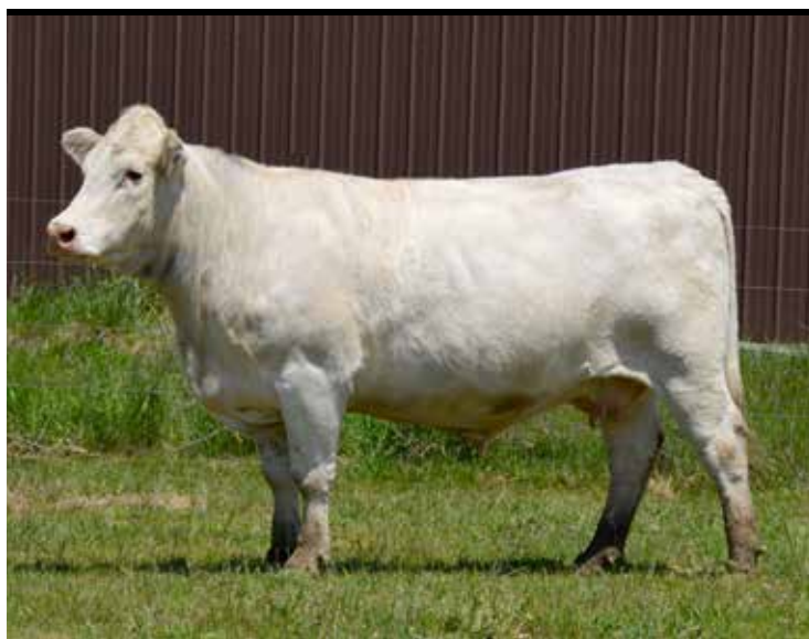
REAVES MS SHELLY FIELD 328 SELLS AS LOT 18