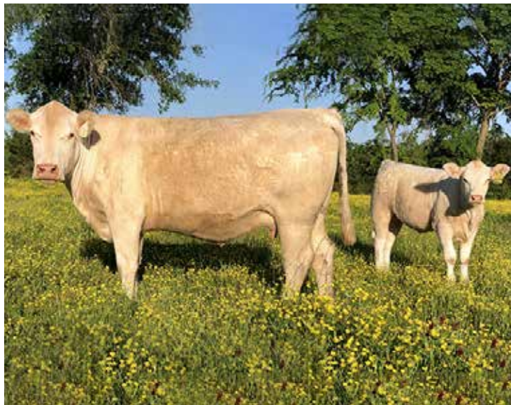
BAF/SCC LADY ASSET B1207 P SELLS AS LOT 62

62A: Pld heifer calf # 1207H, born 9/17/20, sired by Sparrows Braxton 519C. Bred A-1 on 1/24/21 to Sparrows Braxton 519C, safe in calf! The mating worked so well to Braxton, she was bred back to Braxton. This Braxton heifer is super sharp and a good show prospect! Her dam is ultra feminine with clean front, straight top, and good volume. She has a great udder and milks well. 100% DeBrycker bloodlines in this top pair!