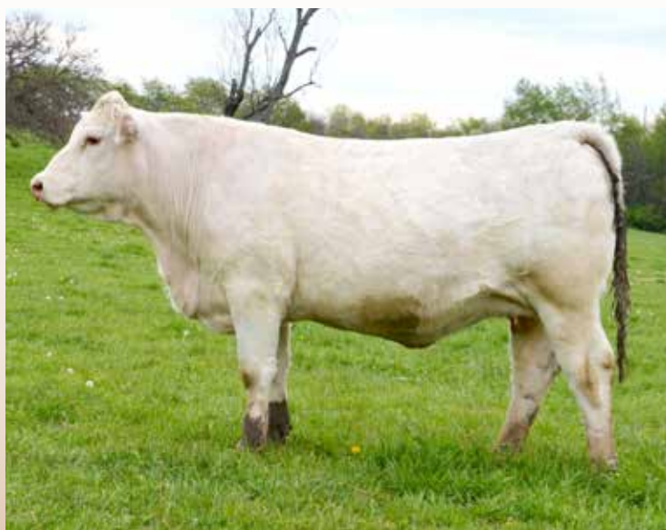
CS MS ARES F430 SELLS AS LOT 55