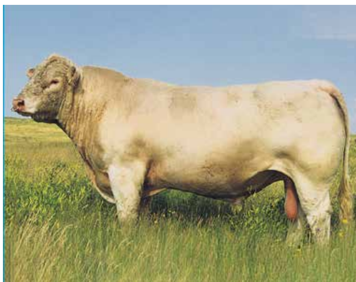
LT WYOMING WIND 4020 SIRE OF LOT 37

Sells bred A-I on 3/6/21 to DC/CRJ Tank E108 P, safe in calf. Tremendous pedigree on this ultra-feminine Wind daughter and a strong bottom side with Duke 914 and the top Donor cow, JWK Wynonna D100 ET, used in the Lee Charolais, LA, ET program. She was a member of the fabulous 4, Mac 2244 x CF Mary 146. A 107% ration at weaning and 102% yearling ratio displays her growth.