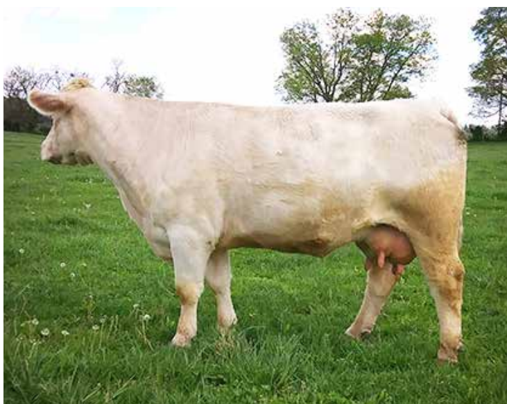
HF KATIE 4120 P SELLS AS LOT 57

Sells Open, halter broke and super gentle. Stout made and sound accurately describes this outstanding heifer. Her dam is a solid producer that milks well. Her pedigree is filled with some of the breeds most popular bulls. She is sired by a outstanding Ledger son from Bamboo, the 4398 bull. The 136 cow is a maternal sib to a many time AICA Carcass Leader in REA, M6 Big Top 268 Pld.