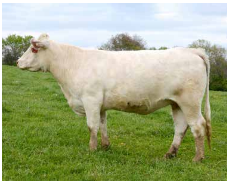
BF/HF FANCY F14B SELLS AS LOT 50

Sells bred A-I on 12/12/20 to Steppler Legacy 28G. Fancy's dam, 14B, was a top selling lot at $9,500 in the 2016 Sale of Excellence to Hudspeth & Benton, and a full sister to Sara Shephard's top selling lot in the M6 Sale at $24,000. The Cigar x Clarice 2809 has been a phenomenal mating, two of the breed's greatest insures remarkable results! This exquisite mating provides tremendous opportunity to superior production!