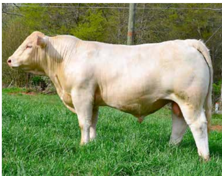
WC VULCAIN 422 P ET SIRE OF LOT 45