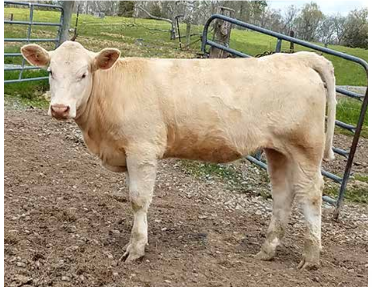
WELCOME GROVE COOL REP SELLS AS LOT 8

Sells Open, a Mokie daughter and paternal sib to Lot 7. She traces to Welcome Grove's top donor, Ms Impressive 405 mated to M6's great performance sire, Cool Rep 8108. 405 produced Welcome Grove Impressive that was shown successfully and now also in their ET program. Cool Rep is a big boned, long bodied heifer with credentials and pedigree to be a money maker! A good set of performance numbers to enhance!