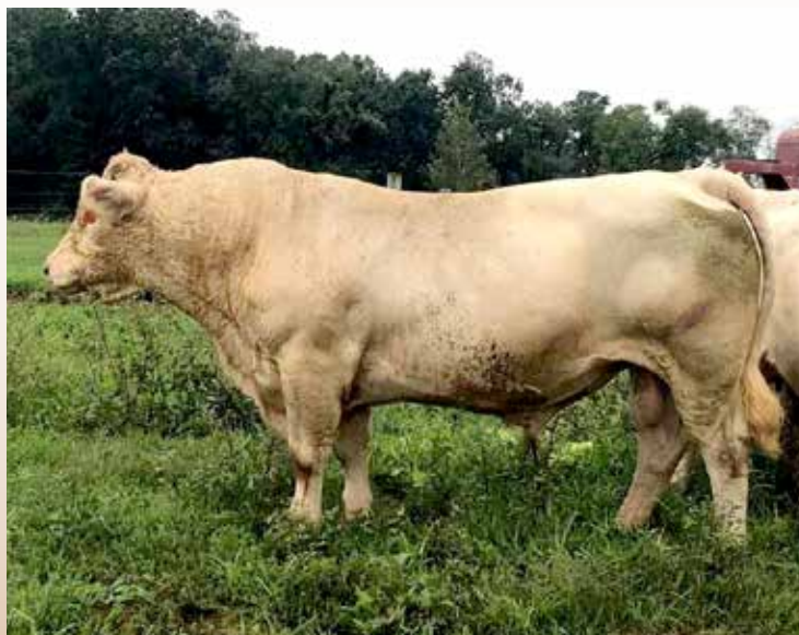
MCF KRATOS E600 SIRE OF LOT 64

Selling Full Interest and Full Possession, Fertility and Trich tested. Excellent growth numbers on this Kratos son. EPDs rank in the top 25% for both WW, WW, and MTL, and 15% for CW, 2% REA, 1% FAT, and 25% TSI for the breed. Notice the good Zen genetics for great udder qualities and maternal quality. The growth and carcass ability of the Key's genetics is well documented. 5th generation genetics in our herd.