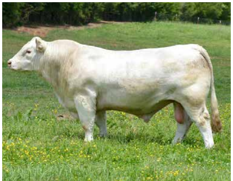
JDJ MAXIMO A18 P ET HOMOZYGOUS POLLED BULL, SIRE OF LOT 30

Sells bred PE from 12/30/20 to 5/5/21 to WC Resource 9132 P ET, M926509. 9132 is an illustrious son of 417 and the great lady, JWK Clarice J139, featured donor cow at Wright Charolais, MO. He would also be a maternal sib to WC Capital Gain 2220 P ET. This Maximo daughter excels in Milk, top 20% EPD, and 20% MTL, and 15% CW for carcass EPD rankings. Strong maternal background with Grid Maker and Fasttrack.