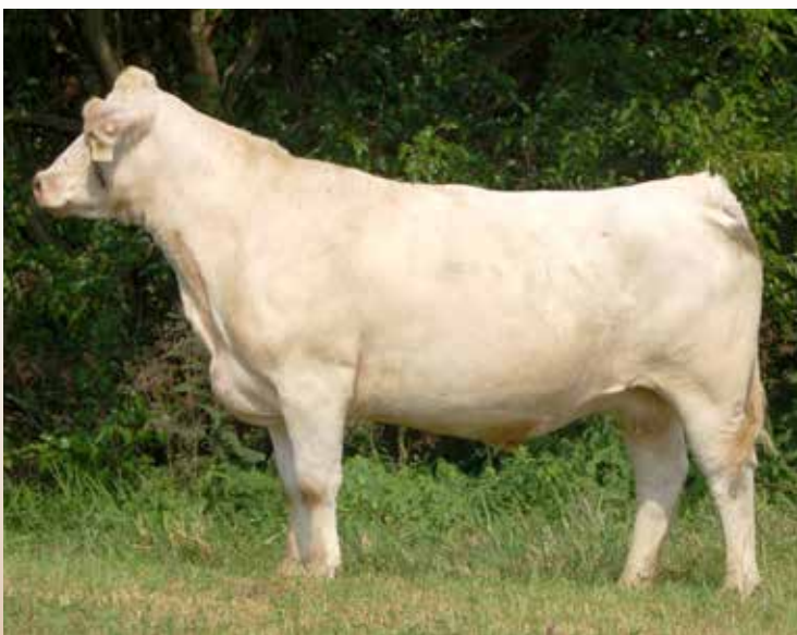
BC MS WIND 9013 ET DONOR DAM OF LOT 67 EMBRYOS