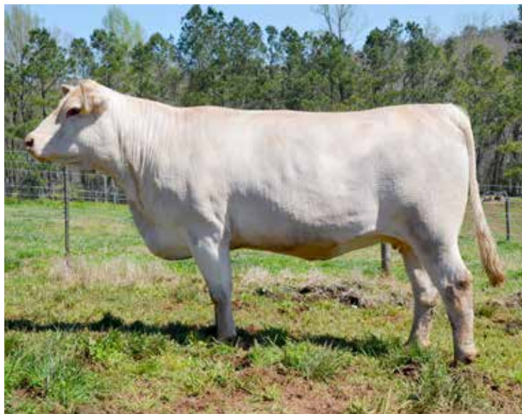
RRCA MS C158 SELLS AS LOT 47