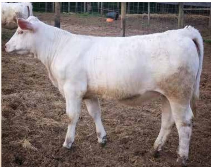
SKHC HAZELS LEGACY SELLS AS LOT 58

Sells Open. Another top daughter of Bamboo Ledger 4398. A very sharp-fronted and ultra feminine daughter from a dam and granddam that have been solid producers year after year. They trace back to the famed Elvira Cow family and blended with WCR Tradition 066 and Kojack for tremendous foundation genetics for broody females and true profitable producers. Great disposition!