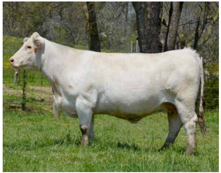
MV 2070 SIR LADY CIGAR 311 SELLS AS LOT 13

Sells safe in calf 6 months sale day to M6 Law & Order 577. One of the top selling lots in a previous Carolina Connection sale, she is also a full sister to the 2nd high selling lot in a Southern Connection sale to Bruce Roy, only surpassed by her dam, the elite Cigar 2070 cow also purchased by Mr. Roy. She is recognized as one of the greatest Cigar daughters ever in the breed. Excellent numbers, pedigree, and conformation in this top entry!