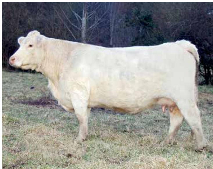
DVCR LADY CIGAR 2070 P DAM OF MV 2070 DUKE-CIGAR 361