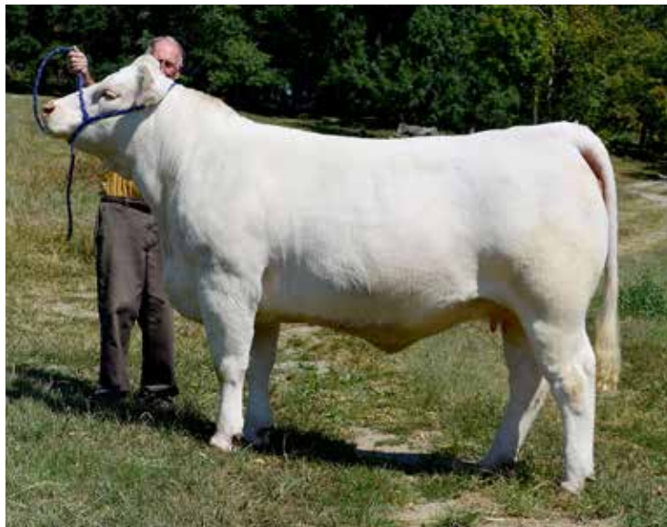
WELCOME GROVE IMPRESSIVE DONOR DAM OF LOT 10 EMBRYOS