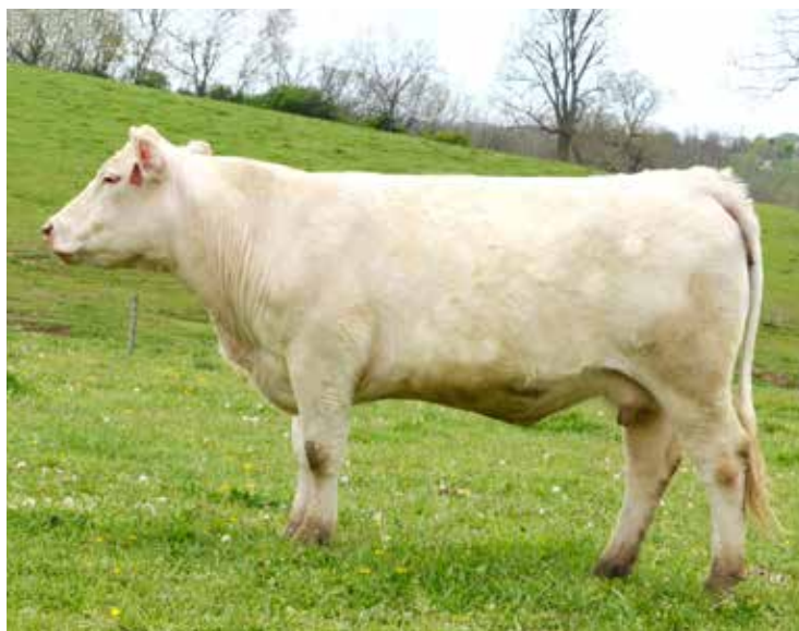
HF FERN F4026 SELLS AS LOT 54

53A: Pld Bull calf J19, born 3/20/21, bw 83 lbs, sired by Sparrows Braxton 519C. Dam was a feature donor cow for Arlitt Ranch, TX. She has 17 calves registered with AICA. This cow milks heavily with a very correct and bountiful udder. She has the capacity, volume, and size to be definite front-pasture cow with fleshing ease. This bull calf will be an outcross to a lot of herds and might be the new herdsire you will want to add to your herd!