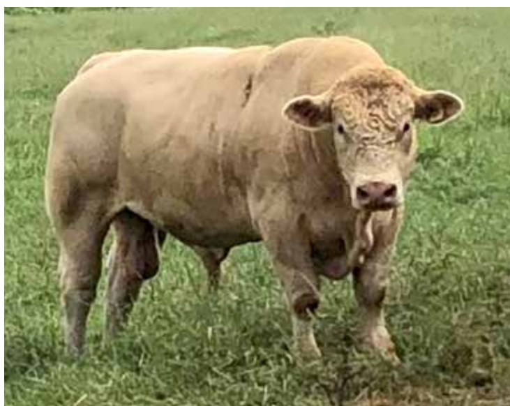
FARAWAY VALOR 3F SELLS AS LOT 63