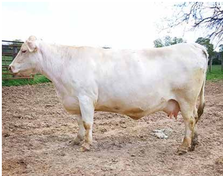
D&D HF CINDERELLA 131 ET GRANDDAM OF LOT 59