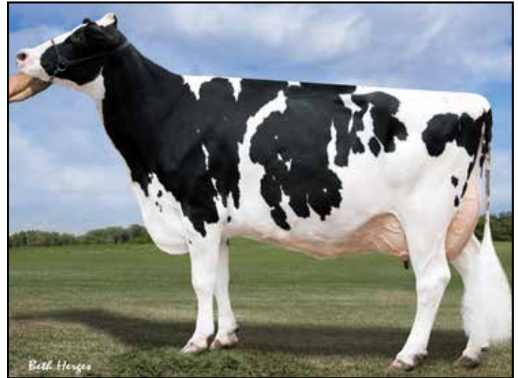
MELARRY POTTER FRECKLE-ET EX-90 EX-MS 7TH DAM OF LOTS 76 & 77