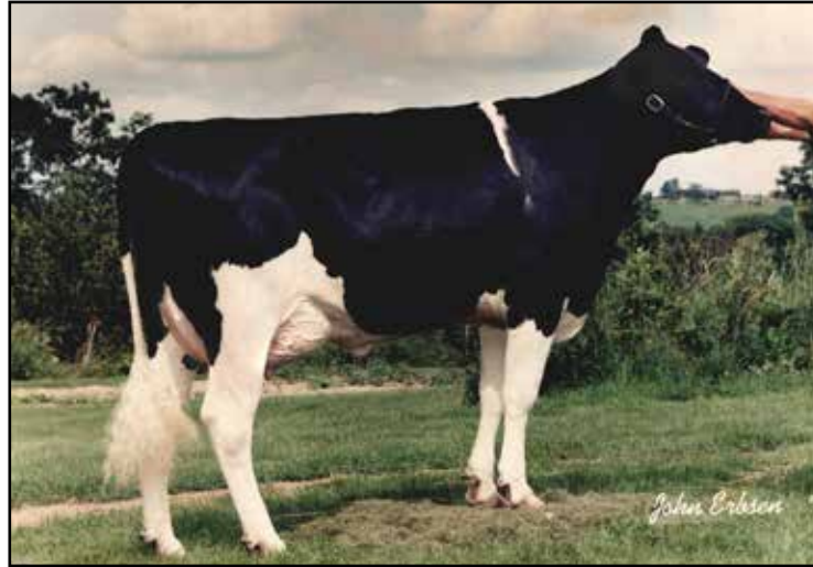
KERNDT MINK ELTON MAXIE EX-90 GMD DOM 4TH DAM OF LOTS 31 & 32