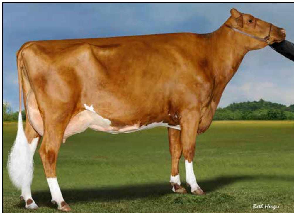
KERNDT DENISE MARLI-RED-ET VG-87 SELLS AS LOT 12