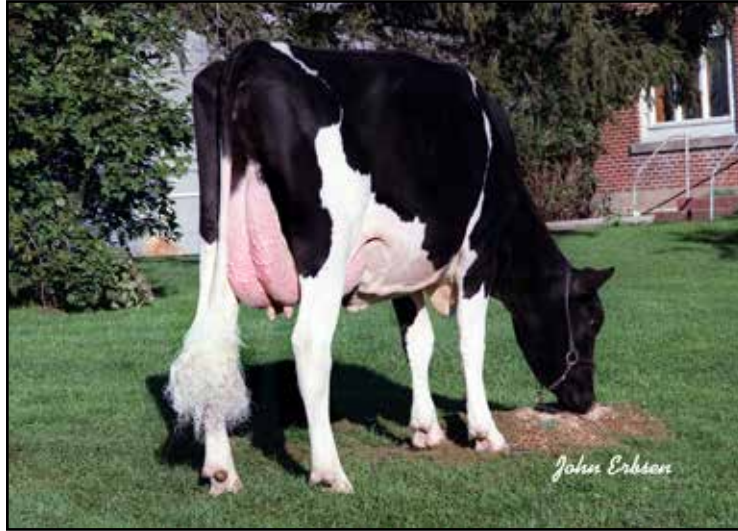
KERNDT MAXIE REMARK MATTIE EX-90 EX-MS DOM 4TH DAM OF LOT 34