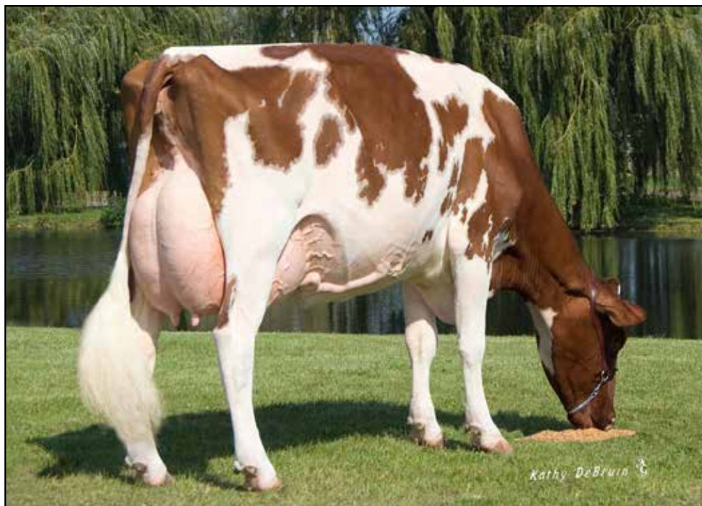
LYONS-DL RUBENS GEM-RED EX-94 EEEEE 4E 3RD DAM OF LOT 54