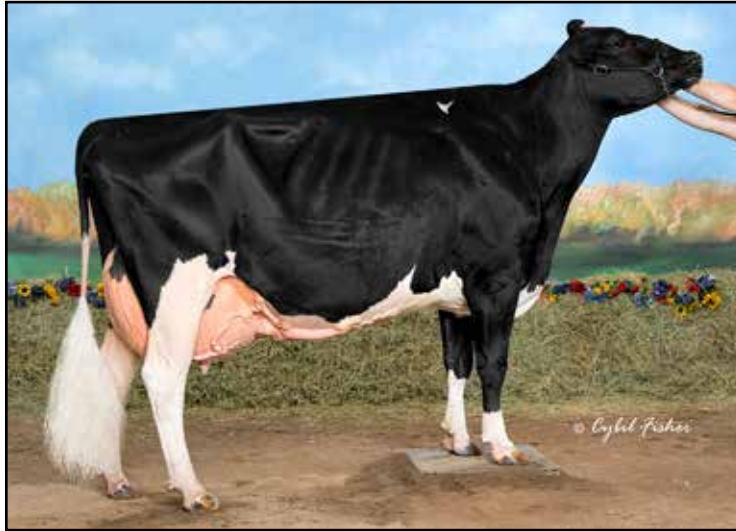
MISS DAMION MICROSOFT-ET EX-94 2E GRANDAM OF LOT 5