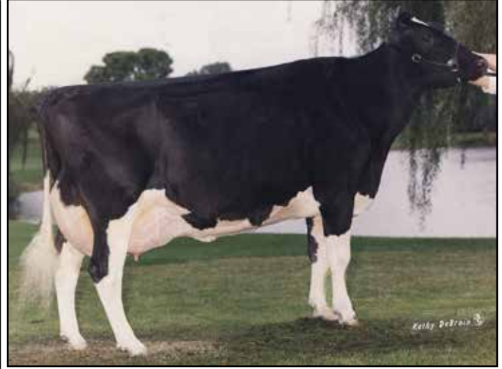
MISS MARK MAUI EX-95 2E GMD DOM 5TH DAM OF LOTS 18 & 19