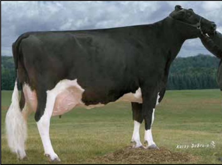
MISS LEE MAJESTIC-ET EX-91 GMD DOM 4TH DAM OF LOTS 18 & 19