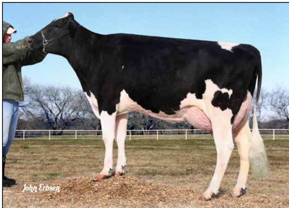
PFAFFS MORTY SEASON-ET EX-90 5TH DAM OF LOT 80