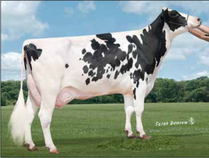
MELARRY COLBY FRECKLES-ET EX-90 EEVVE 6TH DAM OF LOTS 76 & 77