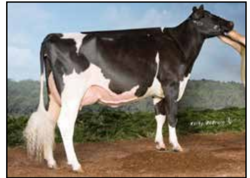
MS DUNDEE PETRA EX-94 2E

Bred: Sept. 21, 2020 to Woodcrest King Doc 29HO12961 GTPI +2836G PTA +1708M +3.40T