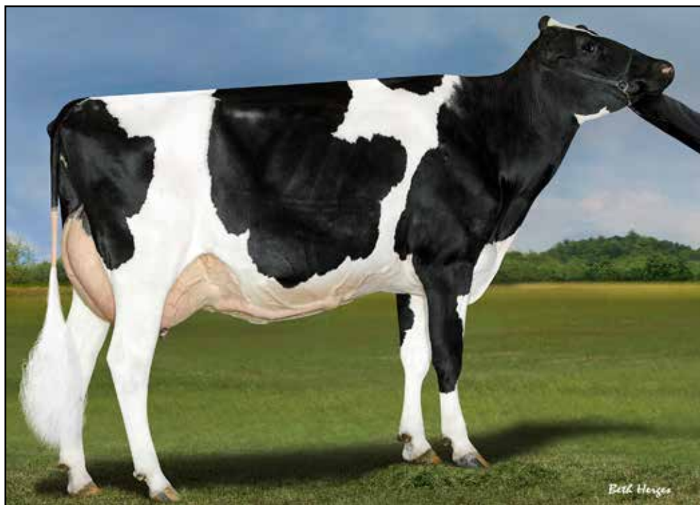
KERNDT DENISE DOCTOR-ET EX-90 RC SELLS AS LOT 1