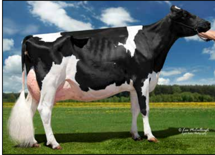
ME-DO-MEADOWS DURHAM ANNIE EX-91 2E DAM OF LOT 70