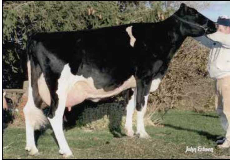
KERNDT EMEY SHIPS EMILY EX-90 3RD DAM OF LOT 47