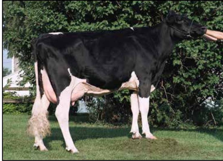
KERNDT MATTIE GRUMPY EX-92 4E DOM 4TH DAM OF LOT 41