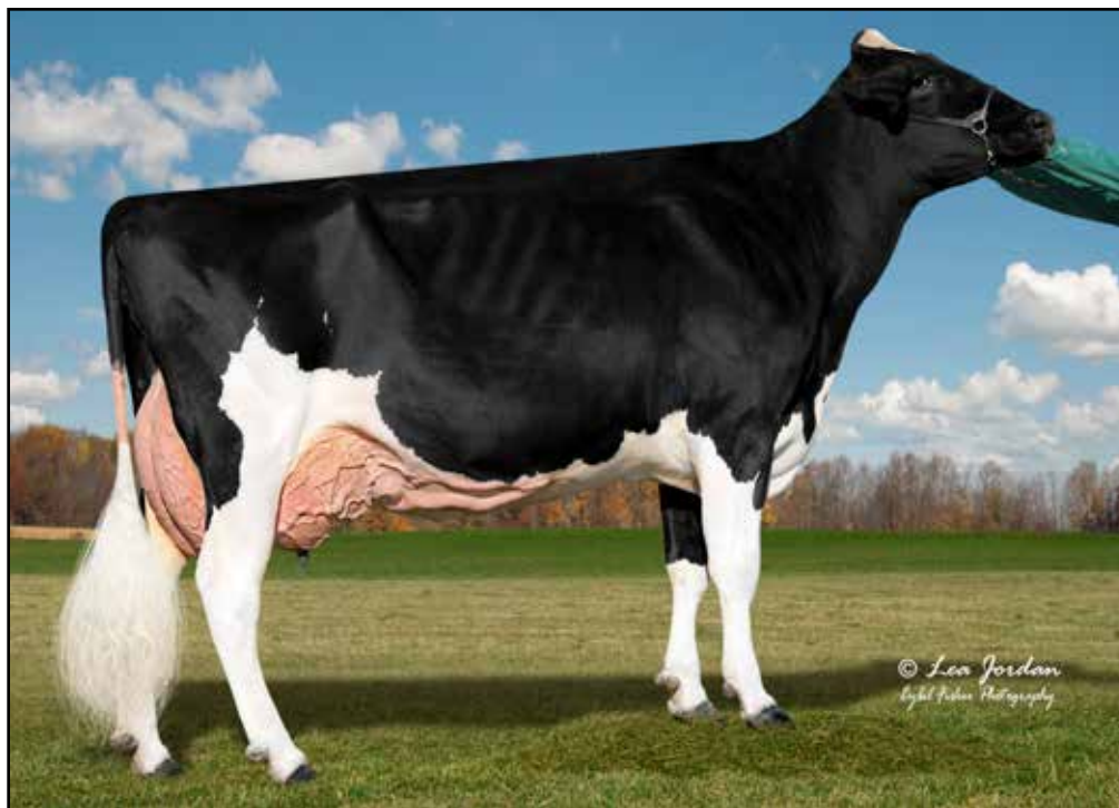
HEATHERSTONE COLLETTA-ET EX-91 DAM OF LOT 23 AND GRANDAM OF LOTS 24, 25, 26 & 27