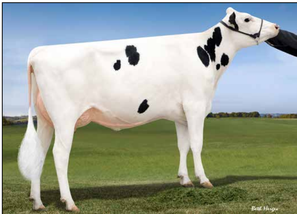
VATLAND MOGUL MOCHA 3665-ET VG-87 GRANDAM OF LOTS 65 & 66