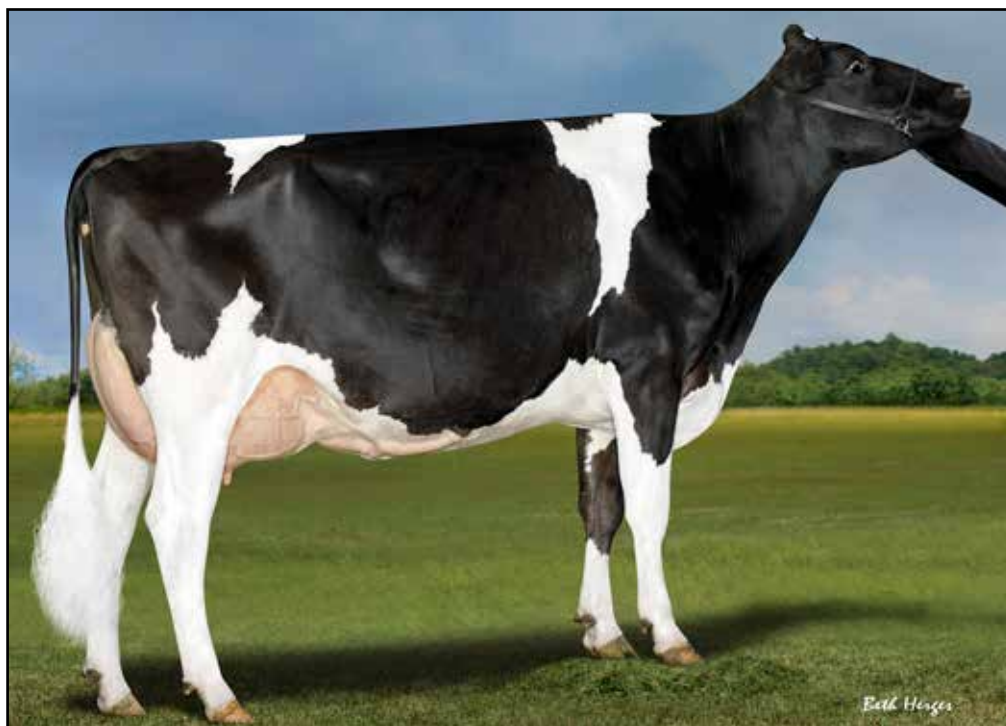
KERNDT MORGAN MONA EX-90 SELLS AS LOT 66