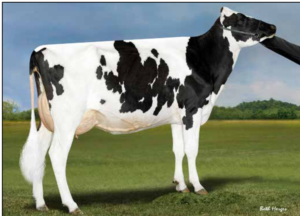
HEATHERSTONE CHEVEL-ET VG-88 SELLS AS LOT 23