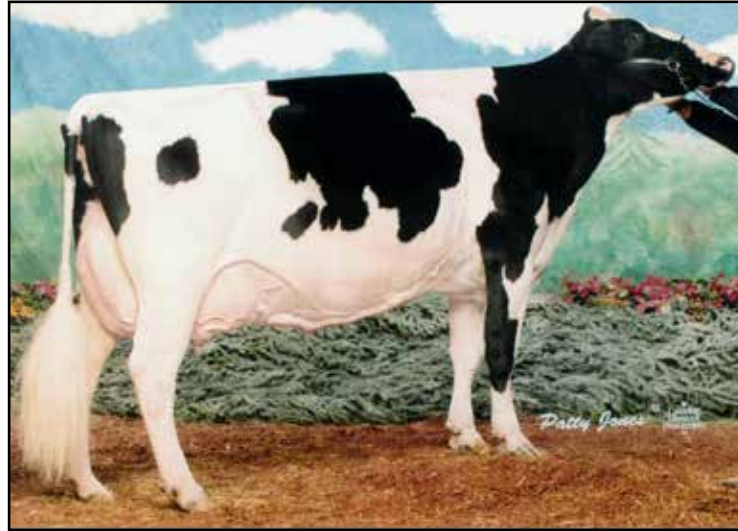
CLARMELL LINJET SUNSHINE EX-94 3E 4TH DAM OF LOT 29