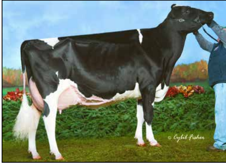
MISS CHAMPION MITZE-ET EX-93 2E 3RD DAM OF LOTS 14, 16 & 17