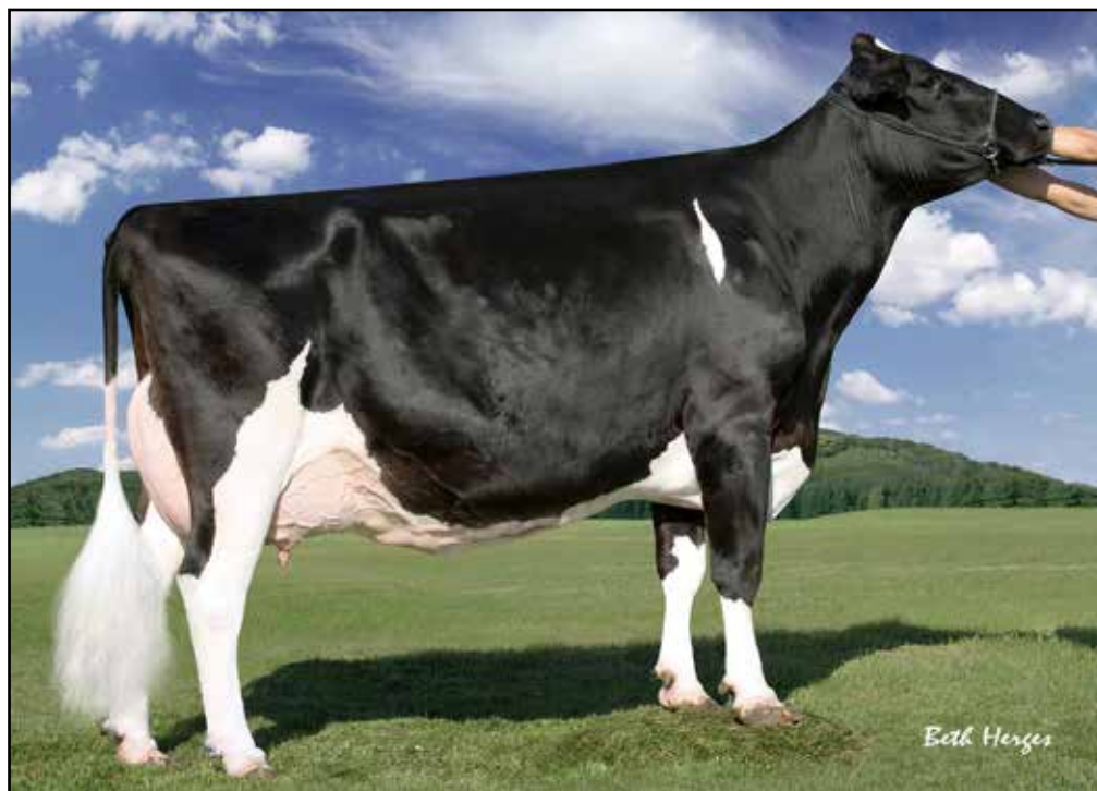
REGANCREST-PR BARBIE-ET EX-92 GMD DOM 4TH DAM OF LOT 51