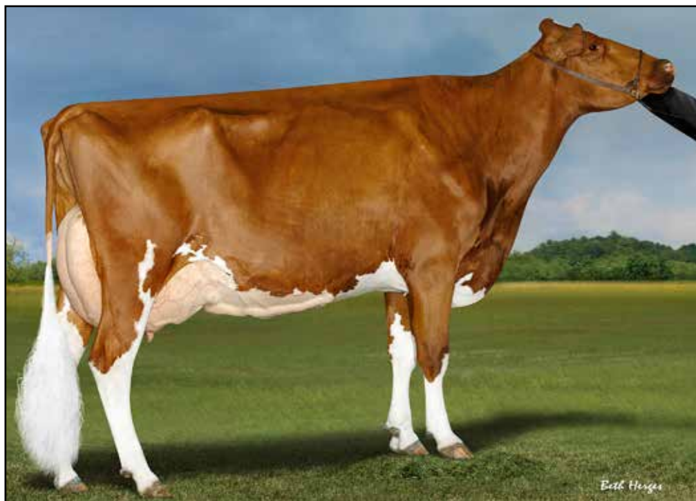
KERNDT DENISE DIP-RED-ET VG-88 SELLS AS LOT 10