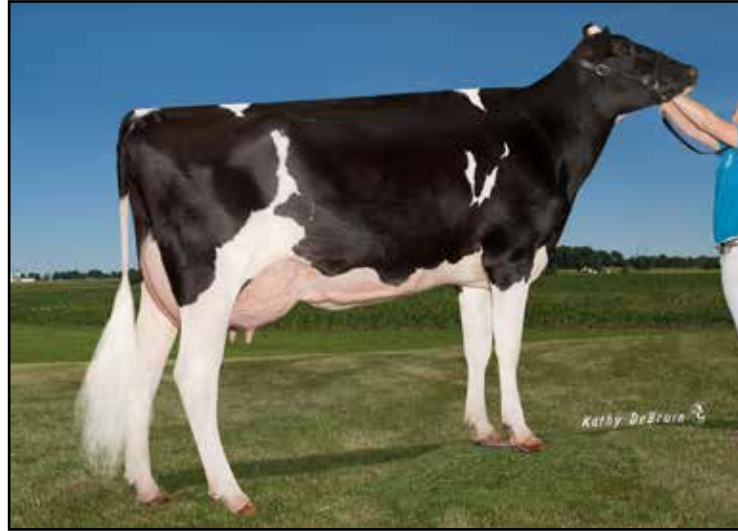
MISS DESTRY DENISE EX-93 EEEEE 3E RC DAM OF LOTS 1, 3, 5, 7, 10, 12, 14, 16, 17 & 19