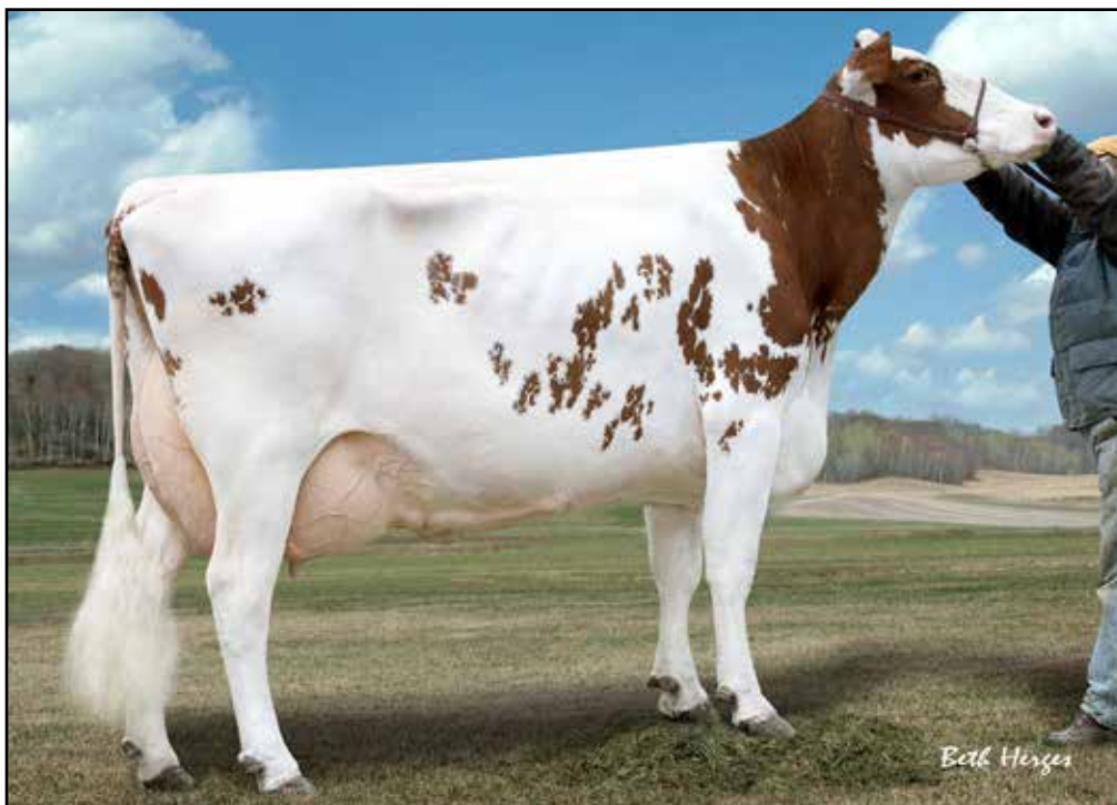
KALEIDOSCOPE R SCARLET-RED EX-90 EEEEE 2E GRANDAM OF LOT 28