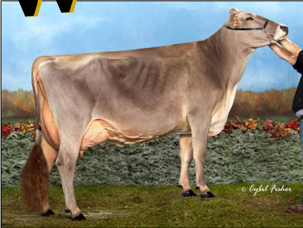
TOP ACRES GARBRO WANDA ET E91/92MS 5TH GENERATION ALL-AMERICAN HONOREE DONOR DAM OF LOT 5 & DAM OF LOT 6