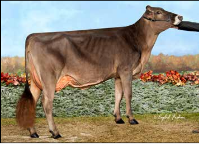
CUTTING EDGE CP SALLIE ET V88 Dam of Lot 22 | Granddam of Lot 23