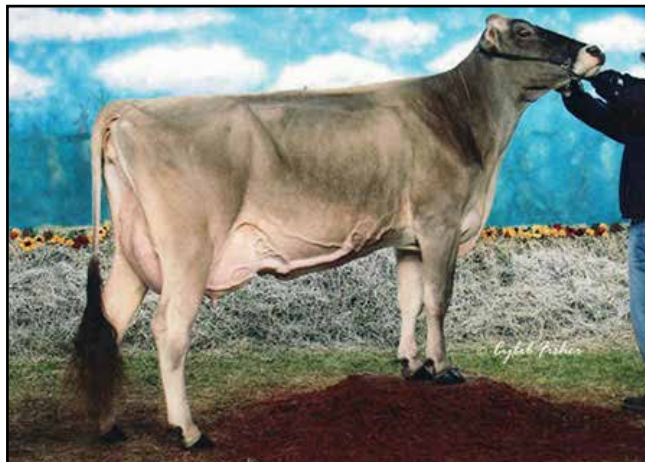
SAVAGE-LEIGH TIPSTER ET 2E93