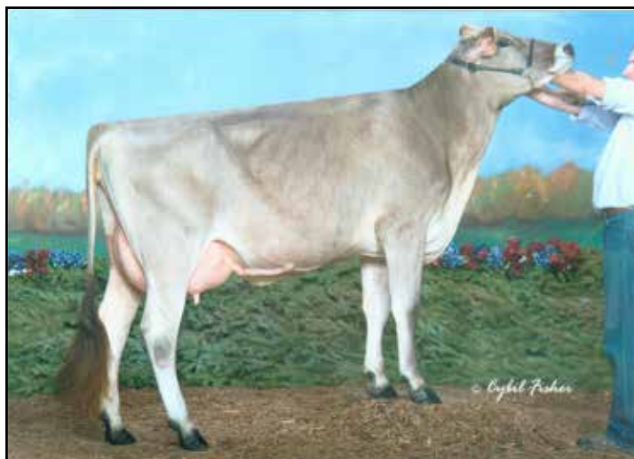
FROSTED SIEG WHYNOT ET V88/90MS RES. ALL-AMERICAN GRANDDAM OF LOT 24