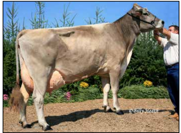
HOODSTEAD DOMINATE PANDA 2E91