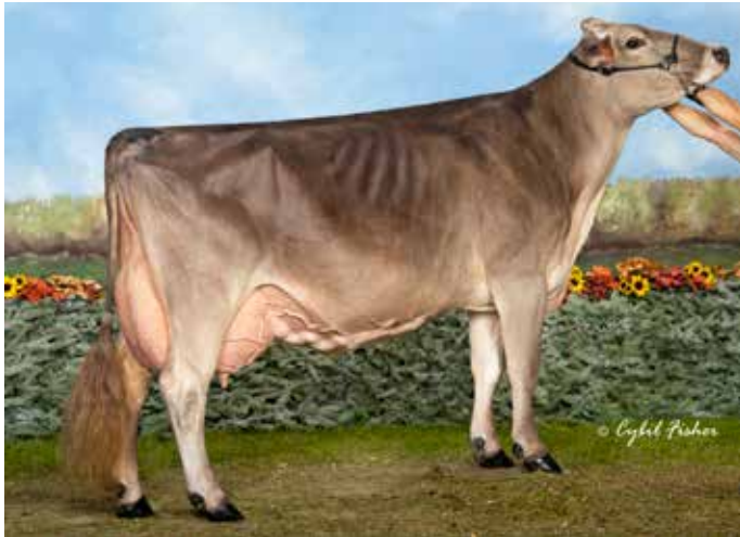
DUBLIN-HILLS TREATS 2E94