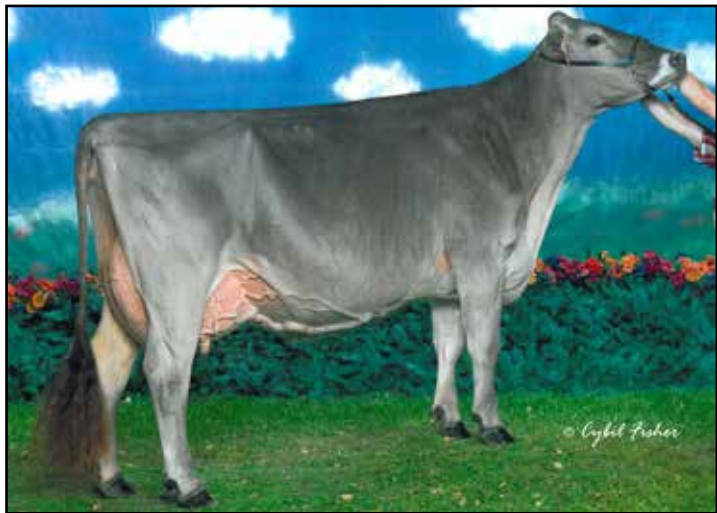
VALLIGROVE JETWAY NORA 2E93 All-American Matriarch of Lot 30