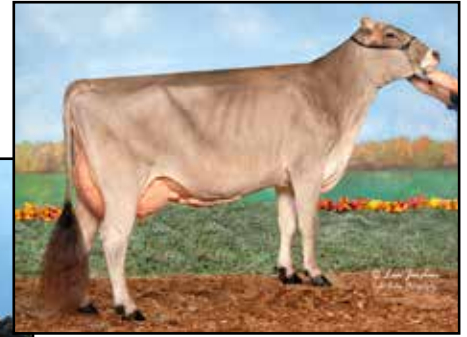
ROUND HILL TALENT WILONA ET E90/91MS