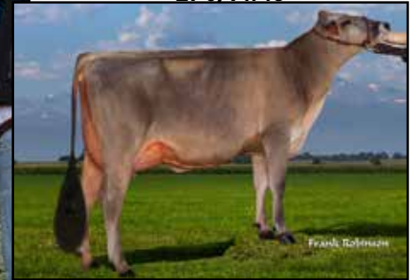
ROUND HILL TALANT WISPER ET EX91/91MS