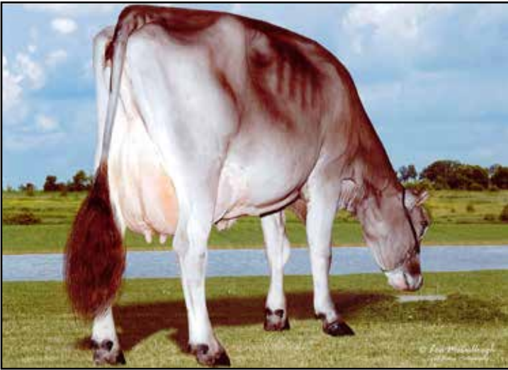
CUTTING EDGE TIT BEAUTY 2E91 Granddam of Lot 29