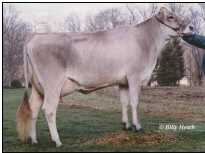
KULP-GEN EM DAFFODIL ET E91 MATRIARCH DAM OF LOTS 25 & 26 & FAMILY MEMBER OF LOT 27