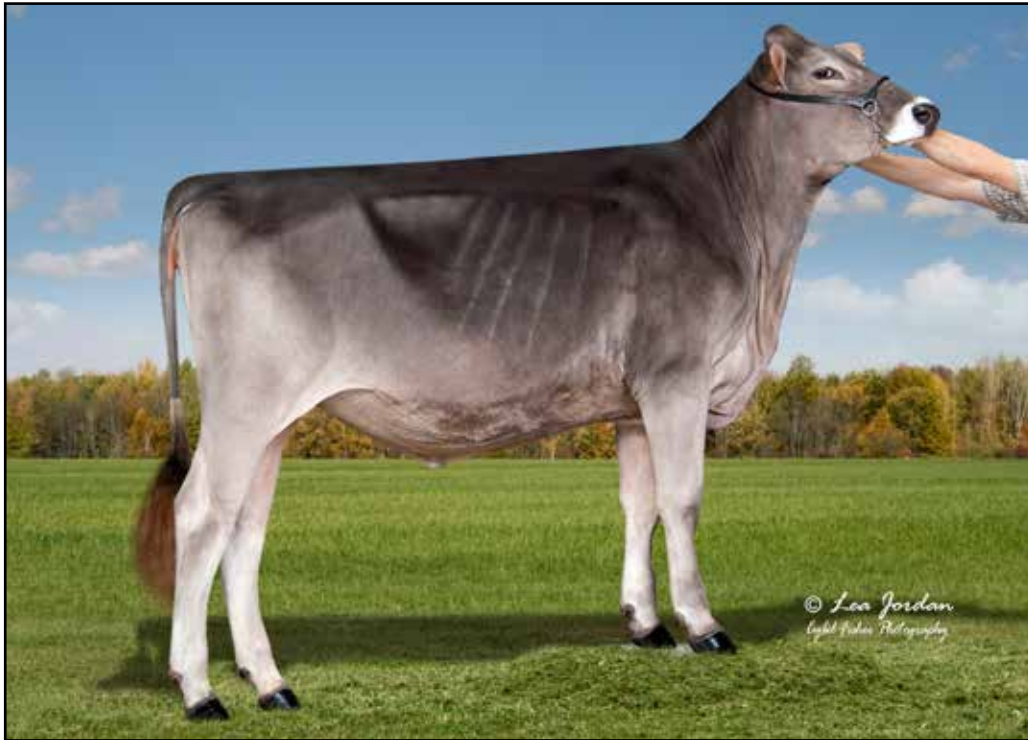
JENNINGS GAP S SHAMROCK All-American Full Sister to Lot 8