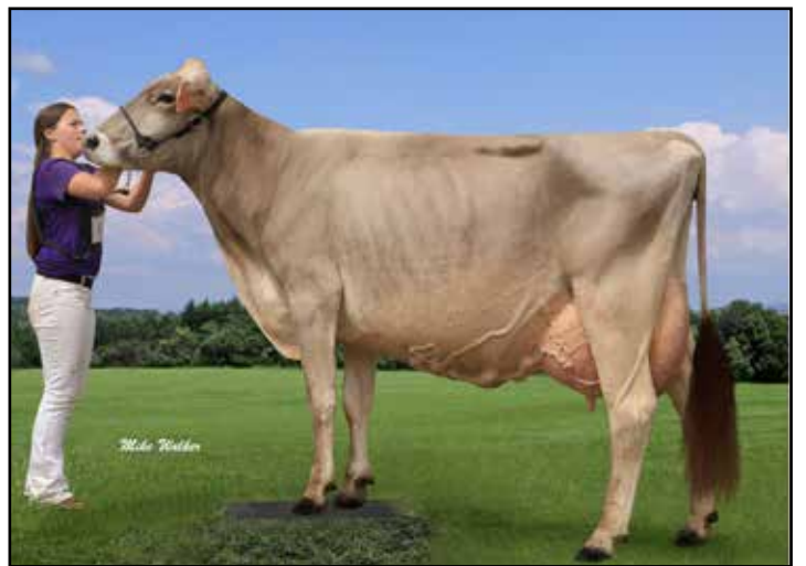
JO-DEE JAMES NEW YORK 2E91 Granddam of Lot 30