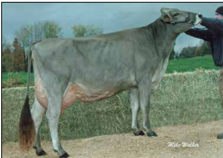
MEADOW HILL JETWAY ASHA 2E92 3rd Dam of Lot 31