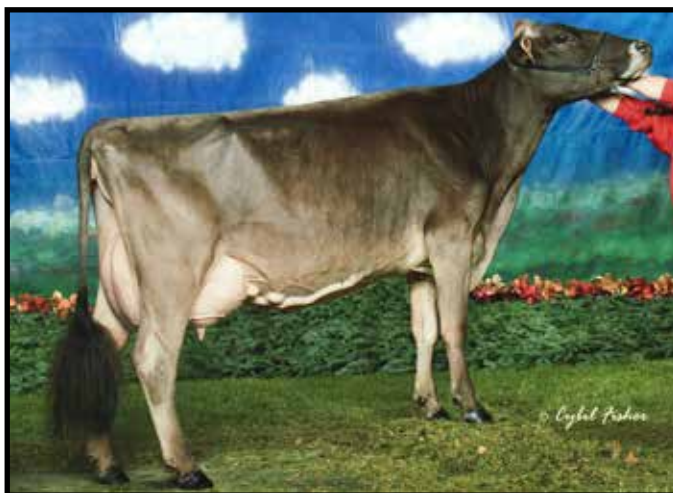
KULP GEN STARBUCK SHANIA 4E94