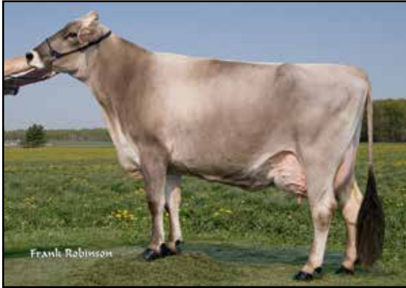
ROUND HILL PRE WISHFUL ET 2E91 ALL-AMERICAN DAM OF LOT 5 & 6