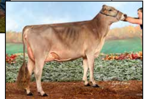
ROUND HILL BRAIDN WANITA V88/90MS | All-American