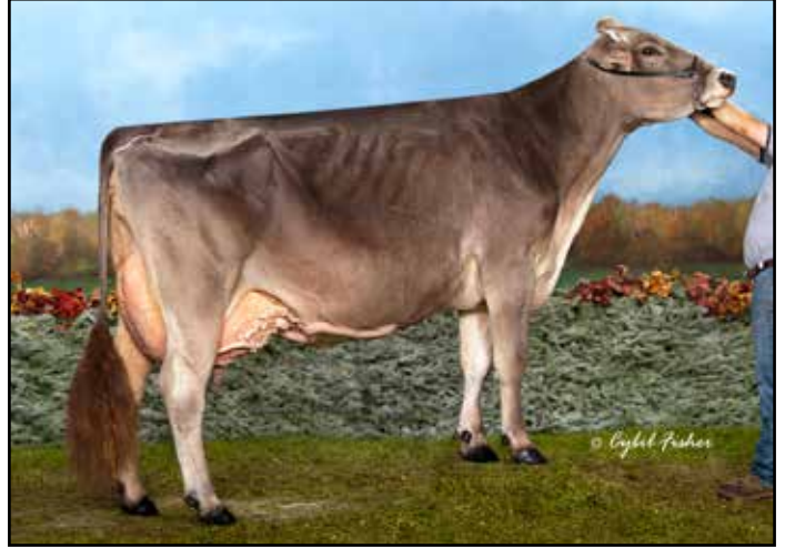
RENEGADE TITANIUM SONYA ET E92/92MS Granddam of Lot 22 | 3rd Dam of Lot 23