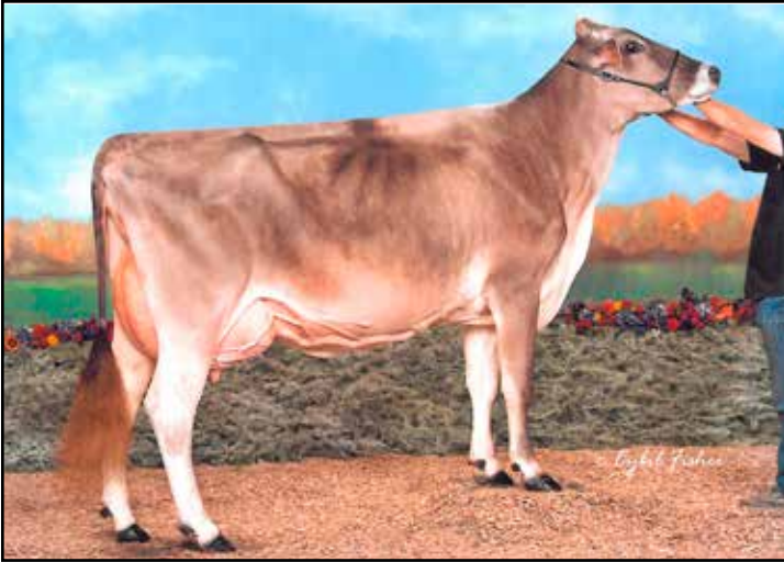
HOODSTEAD VIGOR PERFECTA 2E93