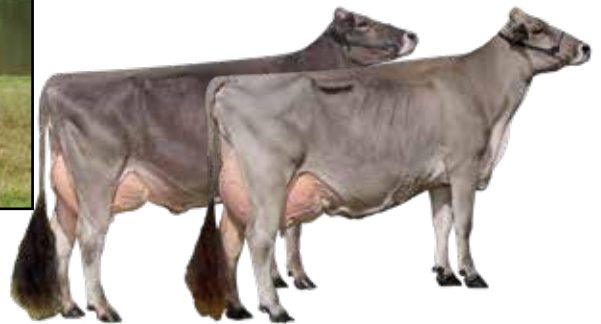
WISP 3E95/95MS WIZARD 3E95/95MS * UNAN. ALL AMERICAN PROD OF DAM '16, '15, '13 Maternal Sisters to Bonanza Whisp