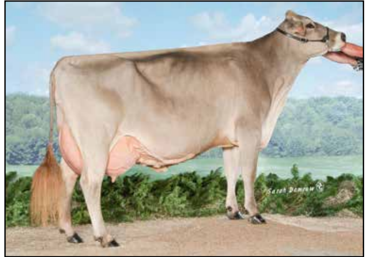
FOREST LAWN ANTHEM BUSY 3E94 3rd Dam of Lot 29