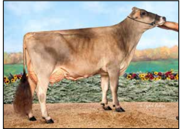
CHAMPION VIEW WF HOP E93 Dam of Choice of Lots 24