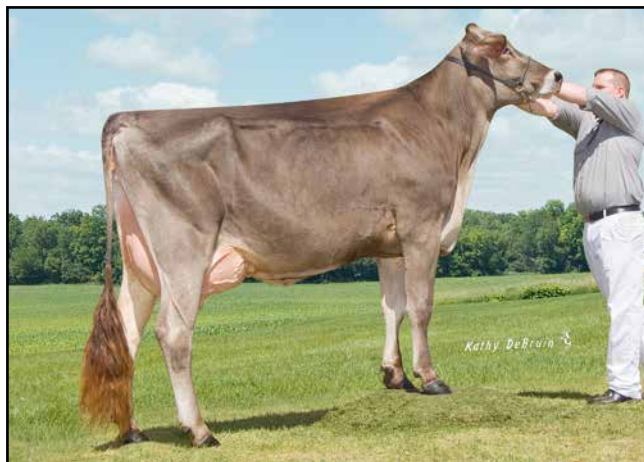
PA LYN-LEIGH JP TIPPER ET V87