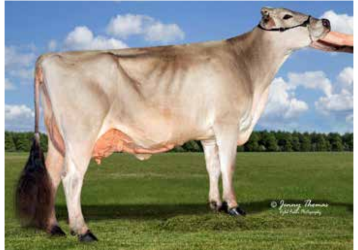
RIEDLAND LEBRON FLORAL E94/94MS