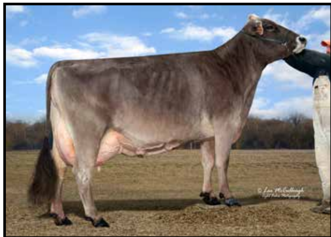
TERRA ROSE GOTCHA SHANTEL 2E93