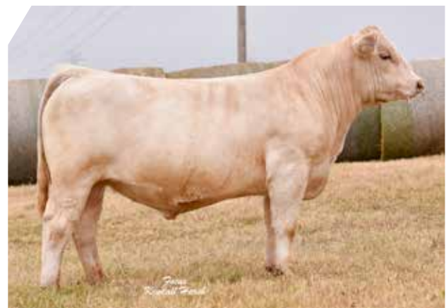
ref J&J Certified 691