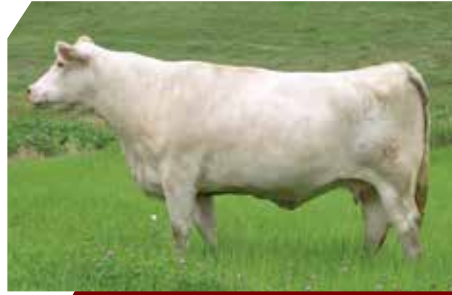
ref SCC Ms Bud 418-1128 ET