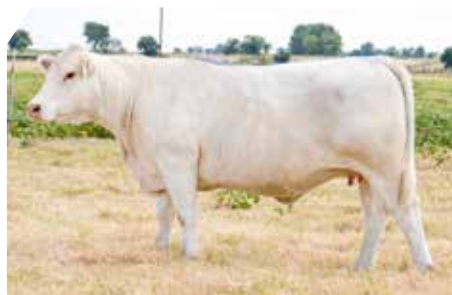
ref BC Ms E46 Bonanza 821 PET