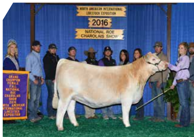
ref Full sib in blood to Lot 28