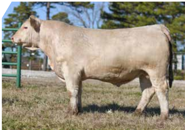
ref SAT Landmark 8057 P