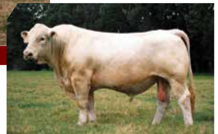
ref LT Rio Blanco 1234 P