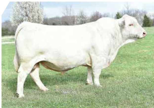
ref LT Rushmore 8060 Pld