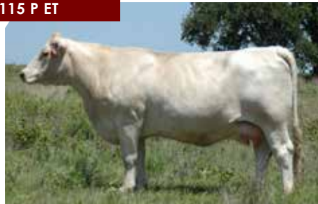
ref Southern Empress 71142