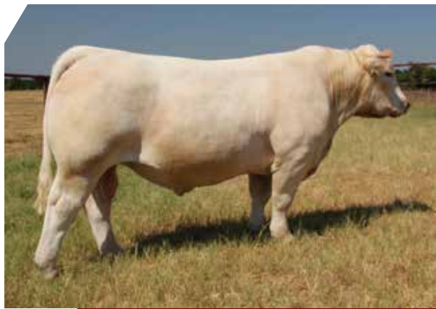
ref M6 Bells & Whistles 258 P