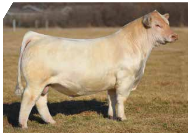
ref SHF Absolute 1508