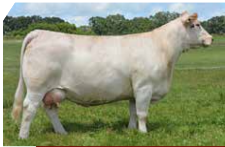
ref M&M Ms Stealth 9509 Pld ET