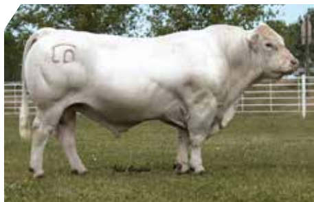
ref LHD Cigar E46