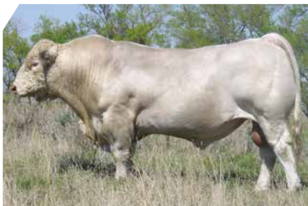
ref M6 Grid Maker 104 PET