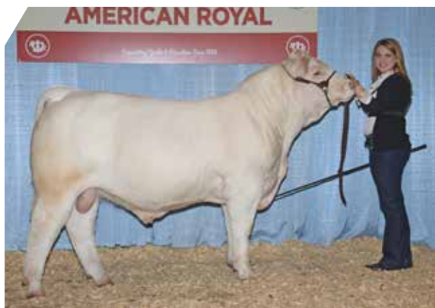
ref MJ Samacus 310