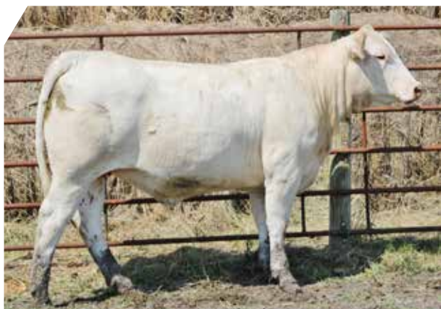
ref VCR Miss Mac 4130 P