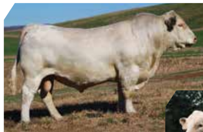
ref VPI Free Lunch 708T