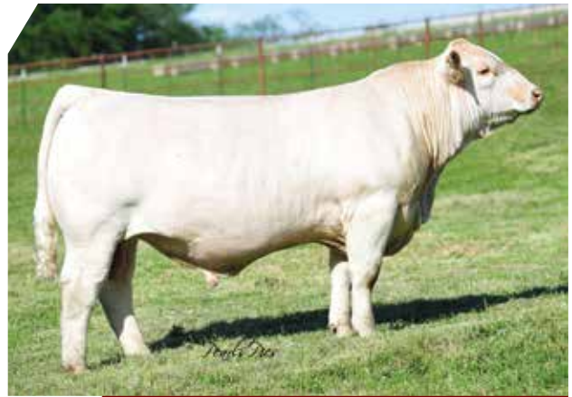
ref LT-WC Templeton 1483 Pld ET