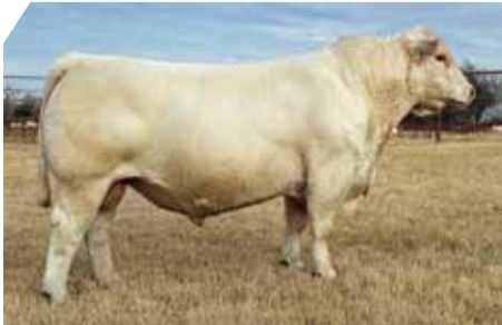
ref M6 Slam Dunk 3115 P ET