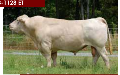
ref WCR Sir Duke 7340 P