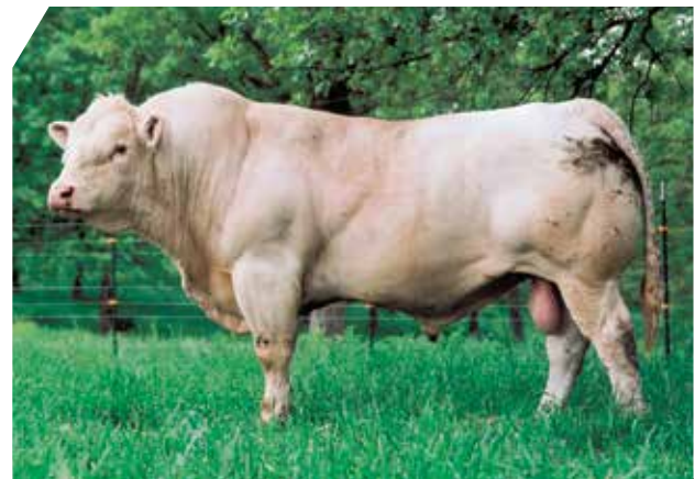
ref JDJ Smokester J1377 P ET