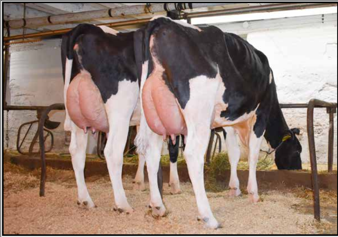
Hy-Hill Wonderboy Jasper GP-82, UG-MS (cow on left)

*Sire catalog feature photo above of early Wonderboy daus.