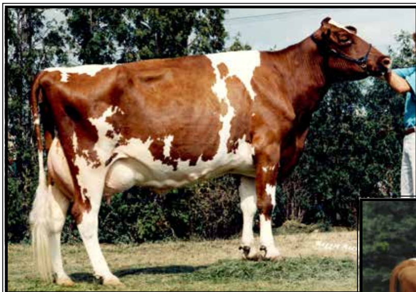
C Riversite Dynam Josie-RED EX-94,3E EEEEE

Lifetime 142120 4.4 6190 3.4 4864 (6th Dam of Lot 9)