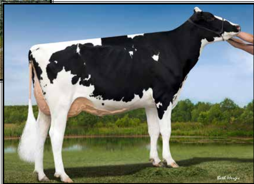
Ms Brandy Bandy-ET EX-90 EEEVE (2nd Dam of Lot 5)

*Grand Champion of the 2011 Grand International Red & White Show (3rd Dam of Lot 5)