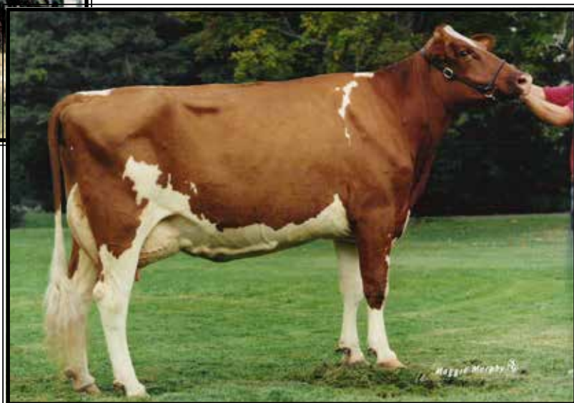
Stoncree Factor Festive-RED EX-93,2E EEEEE

Lifetime 142120 4.4 6190 3.4 4864 (6th Dam of Lot 9)