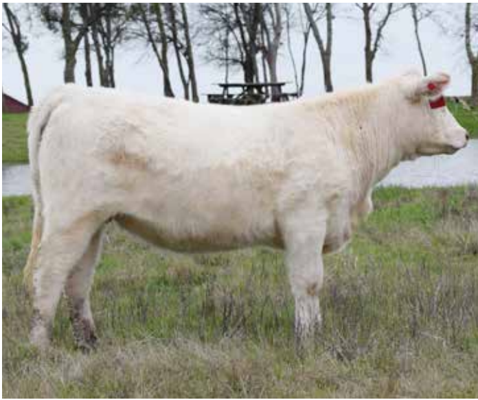
DRC MS MAX 9505 SELLS AS LOT 46 - PHOTO TAKEN AT 1 YEAR OF AGE