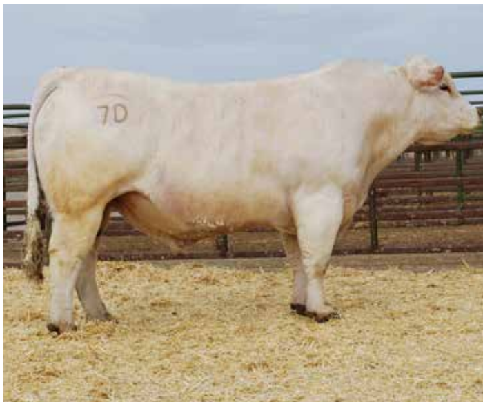
BHD ZEN X270 P SIRE OF LOT 18