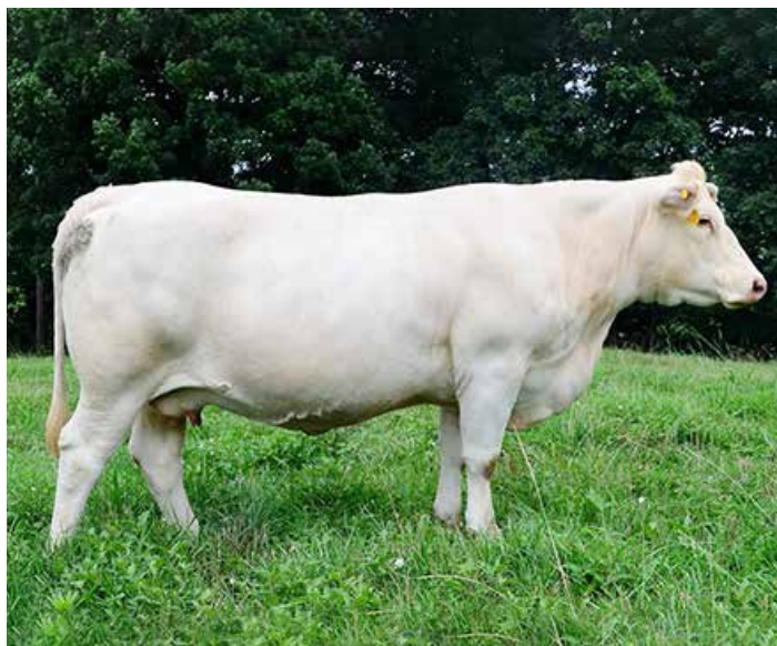
RHC RENA 004E DAM OF LOT 3