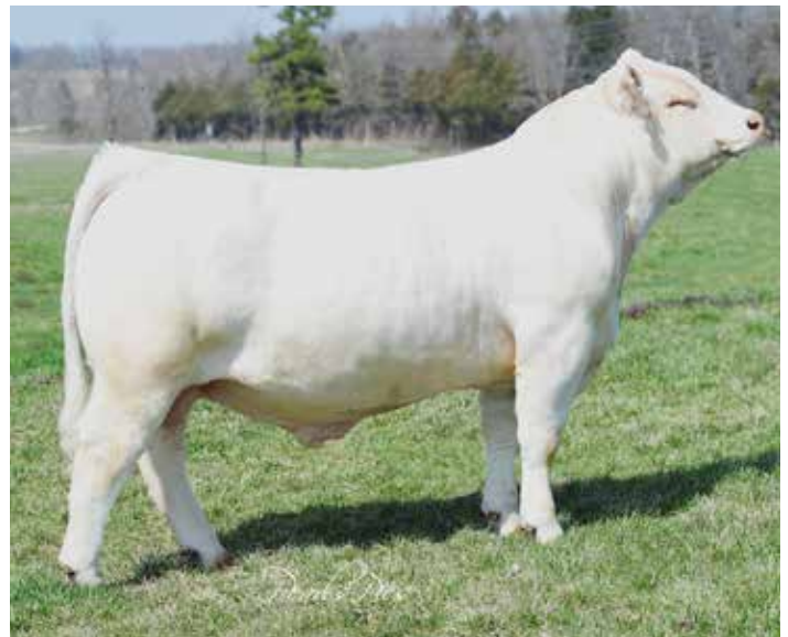
WC BENELLI 2134 P ET SIRE OF LOTS 37, 52 & 54

Sells Open. A great opportunity to acquire a Benelli 2134 daughter, who will be a paternal sib to WC Milestone 5223. Her dam is out of Raile's great performance sire, T077. Also the influence of Mr Fire Water, the sire of more winning progeny than any other sire in history. Good EPDs all across the board makes this top young prospect a good investment!