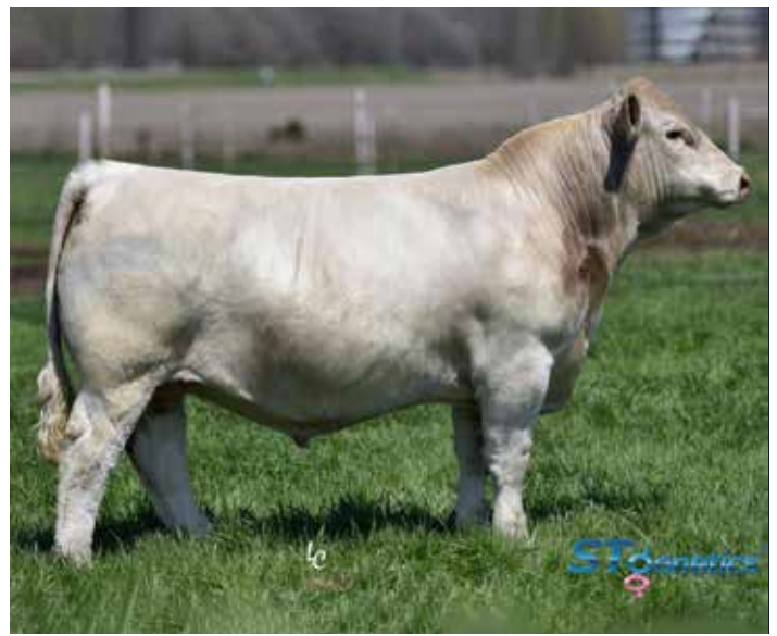
WR FOREMAN D602 SIRE OF LOT 50

3+ months Safe in calf to Hayden G840, M941791. Hayden is a calving ease son of M6 New Standard 842 P, ranking in the top 4% CE, 7% BW EPDs and in carcass in the top 15% for both CW and REA and Fat EPDs. This Foreman daughter also is tops in CE and BW numbers with good performance. Dam is sired by a former AICA National Champion sire, Turton, who has sired many champions. She is line-bred TR Mr Fire Water 5792R.