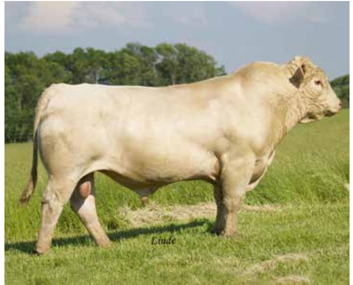
D&D INXS SIRE OF LOT 51