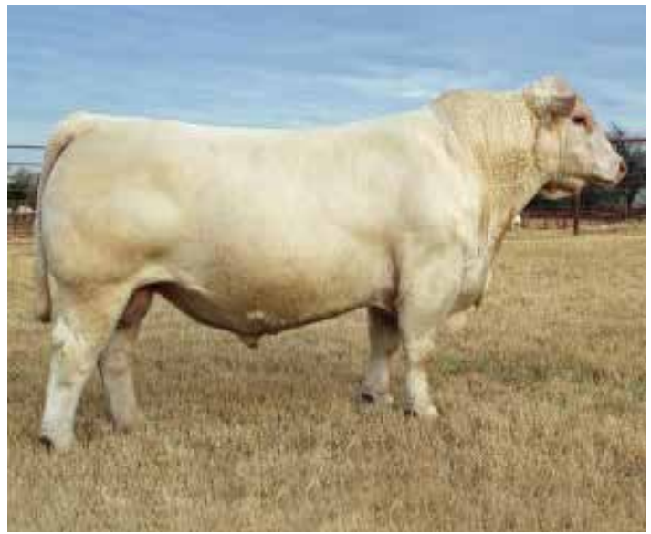
M6 SLAM DUNK 3115 P ET SIRE OF LOT 29

29A Pld heifer calf born 3/7/21, sired by WC Milestone 5223 P. Very classic M6 pedigree of the well-known top end of their production and selling power! Beef Doctor 5180 is maternal sib to the legendary M6 Ms E46's Duke 248 P ET, a many time featured donor at Double-H and Southern Cattle. This Milestone heifer will be a great addition to any herd. A top young pair in the prime of her life!