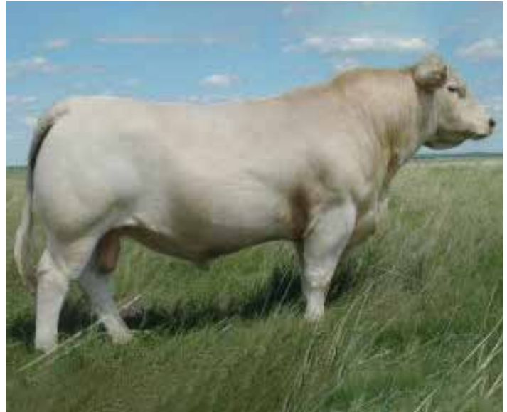
LT VENTURE 3198 PLD SIRE OF LOT 30