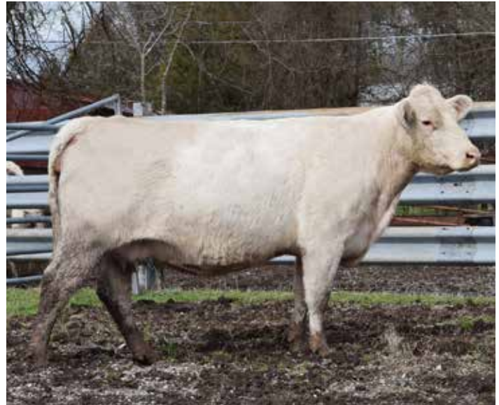
LWF DAISY 97123 DAM OF LOT 16

15A: Pld Bull calf #1121, BW 82, born 1/1/21, sired by BC E46 Duke B01 P ET. PE from 1/2/21 to sale to BC E46 Duke B01. Excellent blend of Evans' genetics on the bottom side of pedigree adds strong maternal ability. The Dakota Wind adds great udder to his daughters along with Cigar and the Miss Mac 9517 is a full sib to JCA Ali cow in Three Trees ET program, and Wienk's WCR Sir T2254 herd sire.