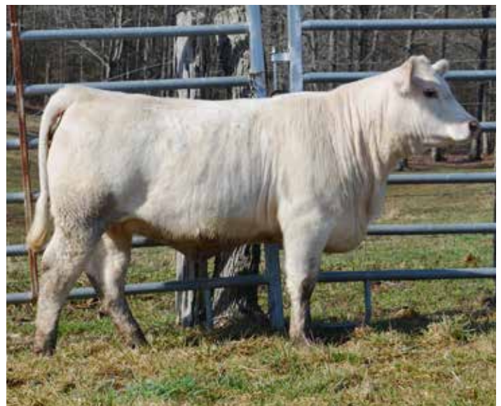
LWF FIRST PICK 1817 PURCHASED IN 2018 SALE BY RICK & CINDY EVANS BROWNWOOD, TX