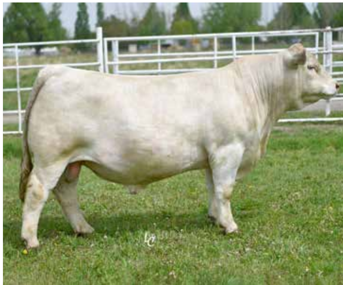
LT RIVER DANCE 4114 P TW SIRE OF LOT 49

3 months Safe in calf to Welcome Grove Rave 1824 ET, EM914413. Rave is a RBM Fargo son out of Welcome Grove's top donor cow, MR Ms Impressive 405, a Cigar Daughter. Good growth numbers, ranking in top 20% for both WW and YW EPDs. Dam is sired by a former #1 YW EPD Trait Leader, WCR Sir Impressive 8191. The Silver Yield daughters at Rollins Ranch have created a well deserved base for their program.