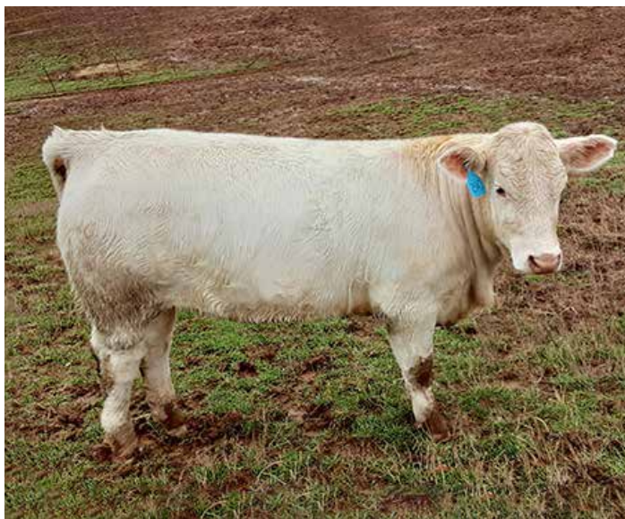
BMD DUKES VENTURE 015 SELLS AS LOT 28

Bred A-I on 10/8/20 to LT Affinity 6221; PE from 10/29/20 to 12/28/20 to BMD Double Fargo 922 TW, M928741. Traces to the 405 donor cow of Welcome Grove, a super producer in the pasture and showing. Sire is out of the LT Venture bull that is owned by LT, Alta Genetics, J&J, and Rathmourne Charolais. Dam traces to the Green Pasture raised bull Duke M23, a foundation bull of Kyle Reaves program. Assertion definitely defines the calving ease and in her EPDs and 72 lbs birth wt.