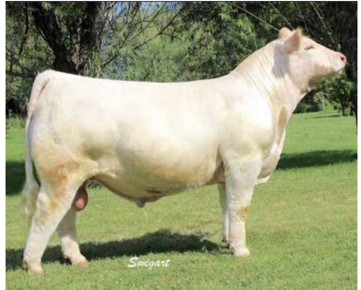
AML GHOST RIDER 210 SELLING 10 UNITS SEMEN

Selling 10 units of Semen on this son of HooDoo Slasher 1144 and a great Cigar daughter, 5J Cigarro 924 Pld donor cow. Calves by Ghost Rider should be middle of the road in size, good growth, lots of style and eye-appeal. Was the AICA Show bull of the Year 2013-2014.