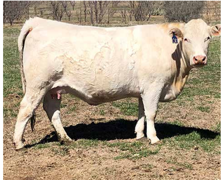
RS MS FIRST LADY E30 SELLS AS LOT 44