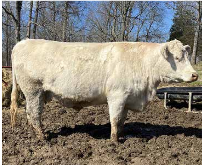
OHF LEAH LEIGHANNE 07D SELLS AS LOT 38

PE from 6/13/20 to sale to DF Milestone Whistle, M925840. Whistle is a WC Milestone son out of an M6 Bells & Whistles 258 P dam. Her sire, Benelli is also the sire of Milestone. Firewater is one of the most successful show sires in the history of the breed. He was also one of the most heavily used sire for many years. His dam was the very popular and top selling Zsa Zsa, an LHD Cigar daughter and Denver Champion.