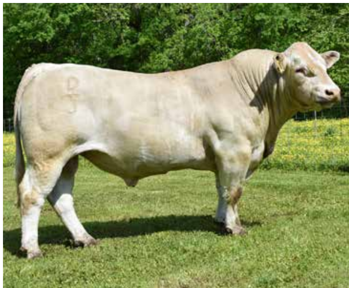
DC/JDJ PEGASUS D3330 P SIRE OF LOT 12

AT THE LITTLE W FARMS 10TH ANNUAL PRODUCTION SALE