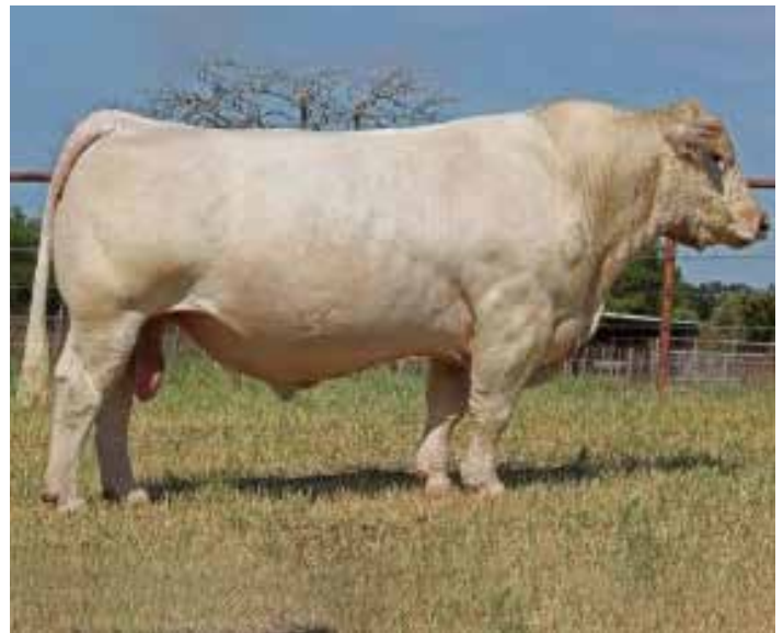
M6 COOL REP 8108 ET SIRE OF LOT 24

Safe in calf to M6 Sleep Easy 734 Pld, M739763 on 8/21/20, DUE May 29, 2021. A beautiful daughter of M6's great performance sire, M6 Cool Rep 8108 ET, with over 1200 calves registered with AICA. He would also be a maternal sib to SR/NC Field Rep 2158 P. These LMH cows always have great udder quality and raise big calves. With a light birth wt of 73 lbs and good CE and BW EPDs, you get the utmost for profitability.