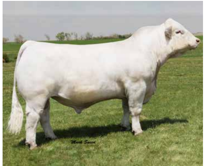
TR PZC MR TURTON 0794 ET SIRE OF LOT 24

Due early September, 2021 to TR Mr Outsider 7607E, M894574. Dazzlin has produced some great heifers for us. This rich pedigree includes the great donor cow, SCC Ms Bud 418-1128 ET, out of the 418 cow, a full sib to RC Budsmudad 225 Polled. Turton is an AICA National Champion out of the legendary Ms Impressive 0641 that has 318 calves registered with AICA, and is one of the most prolific producer of National Show and Sales winning progenies.