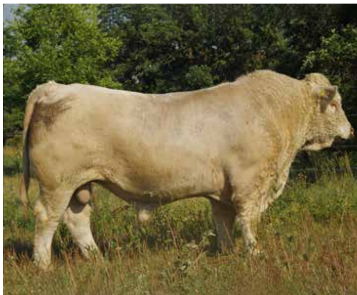
SPARROWS BRAXTON 519C SIRE OF LOTS 13 & 14