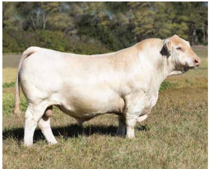
ACE-ORR LOCK N LOAD 243 P SIRE OF LOT 39