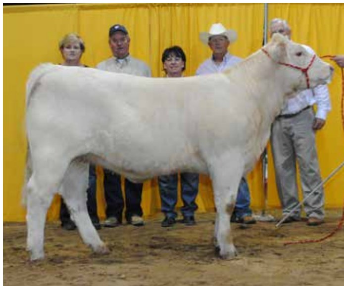
BC MS REALITY Y31 PET DAM OF LOT 6