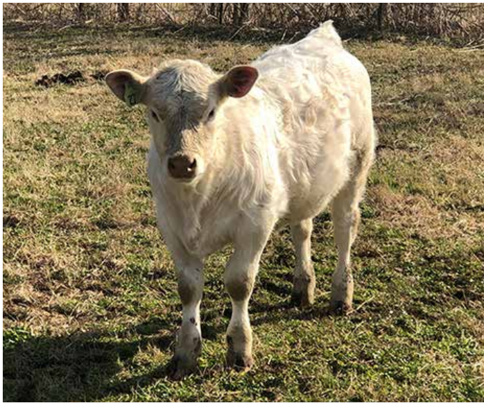
LMH LADY AIR SELLS AS LOT 26