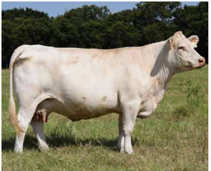
RE MRS CIGAR 908 ET DAM OF LOT 17