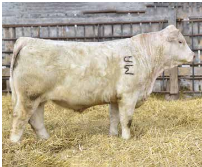
WCR SIR COUNTY LINE 551 P

Bred A-I on 8/28/20 to LT Affinity 6221; PE from 10/1/20 to sale to M6 Law & Order 577 P. Excellent growth numbers ranking in top 15% WW, 20% YW, 15% MTL and CW, 20% REA, and 20% TSI. Very profitable calving ease and BW numbers as well. The Tiara H116 is the dam of LOF/VPI Abraham 48A, one of the top sons of M6 Grid Maker 104 PET. A very correct, well-balanced heifer with numbers, pedigree, and conformation.