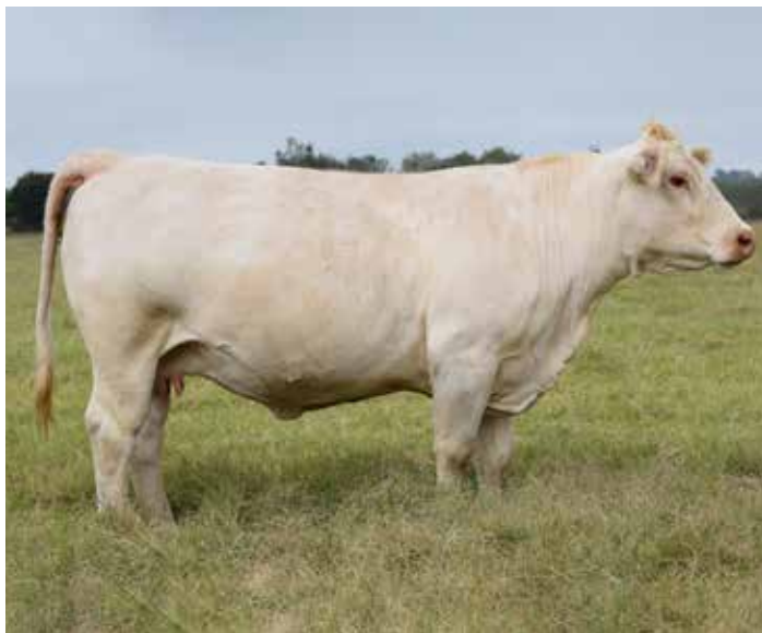
DOUBLE H LEGENDS ANGEL 125Y ET DAM OF LOT 42