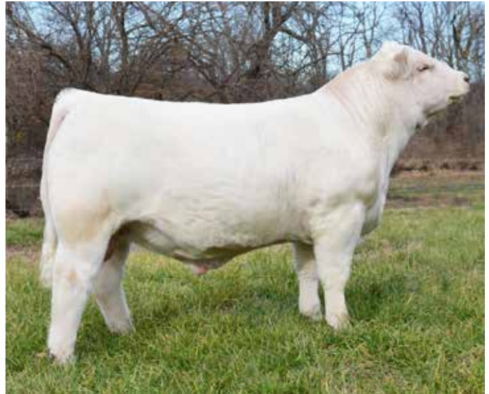
WC MILESTONE 5223 P SIRE OF LOTS 31 & 32

Bred A-I on 7/31/20 to sexed heifer semen on CCC WC Resource 417 P; PE from 8/21/20 to sale to M6 Law & Order 577 P, M875914. Great EPDs numbers across the board, calving, growth, maternal, and carcass!! Tremendous lineage of pedigree on this outstanding young heifer. She will be a tremendous advantage to a top program. Resource adds so much style and correctness to his progeny.