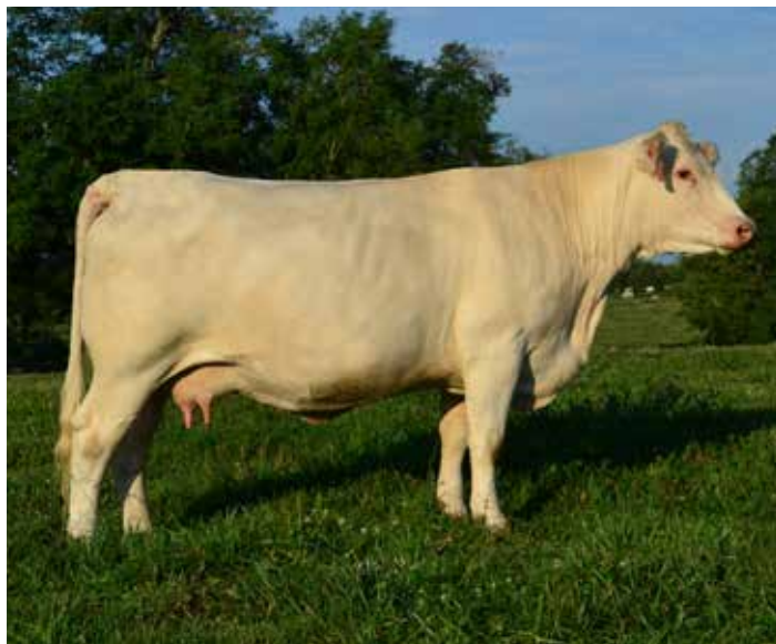
DLN MS PLAYFUL MOLLY B137 DAM OF LOT 2