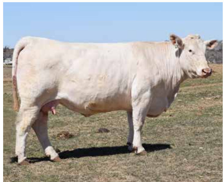
CS MS SLAM DUNK D02 SELLS AS LOT 45

Bred A-I and DUE 5/4/21 to DC/CJC Sugar Daddy G1118 P. This big, powerful cow does a fantastic job. Out of a very beautiful Smokester daughter she has an impeccable pedigree. She ranks in the top 9% for Milk, 6% for REA, and 5% Fat. Her Sugar Daddy calf will be a tremendous addition to any program. A very docile cow with good feet. Breeding privileges to DC/BHD King F2503 P, or JDJ Maximo A18 P, both homozygous polled bulls.