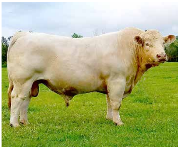
RDK SAMSON 523P SIRE OF LOT 35A HEIFER CALF