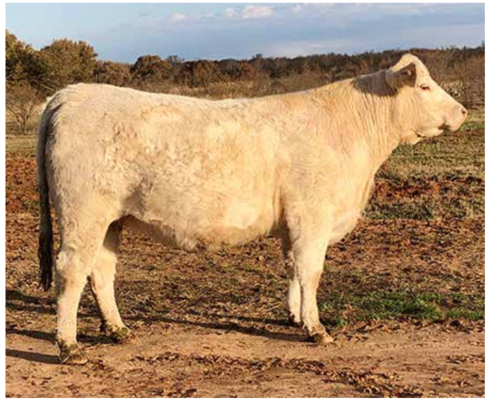
RE MS ZEN 890 SELLS AS LOT 43