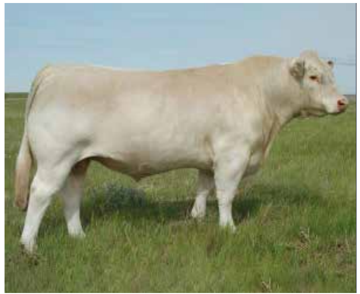
LT LEDGER 0332 P SIRE OF LOTS 23 & 36

Due early September, 2021 to TR Mr Outsider 7607E, M894574. Outsider was Thomas Ranch's lead off bull in Pen of Three at Denver 3 years ago. He should sire some outstanding show prospects. He is by the M&M Outsider 4003 and a TR Mr Fire Water 5792R daughter. Stacked pedigree on this outstanding heifer of well known performance bulls and top genetics for good milking qualities.