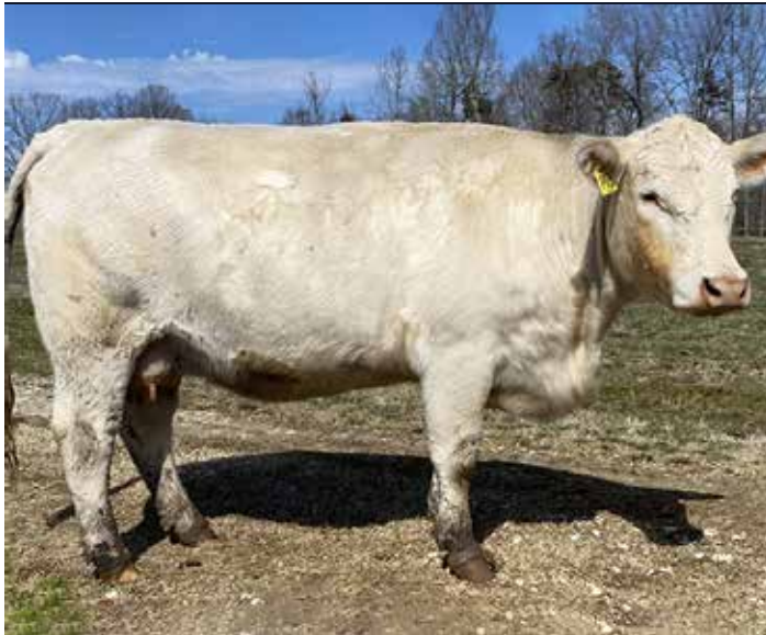
ABC AGNES 819 SELLS AS LOT 41