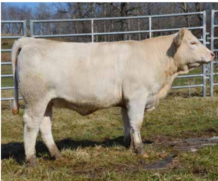
LWF JUNEBUG 1206 PURCHASED IN 2018 SALE BY ROCKING S RANCH BRISTOW, OK