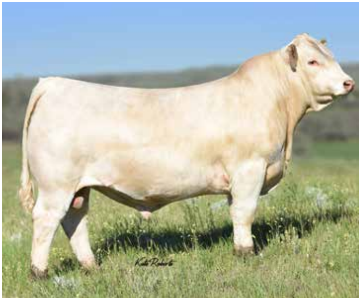
LT AFFINITY 6221 PLD

Sells Open. An own daughter of the elite Fresh Air bull, another maternal sib to M6 Cool Rep 8108 and SR/NC Field Rep 2158. Her dam, Ledger Bee also produced a daughter that sold to Chad Bradford, AL, in the 2020 Southern Sale. These are great working females, very feminine, correct, great udder quality. Light birth wt combined with good growth and maternal ability.