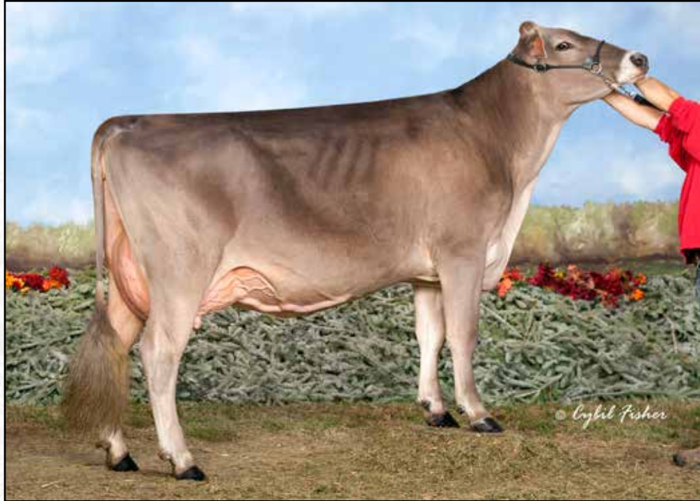
CUTTING EDGE WONDERMENT STAR '2E92' 2ND DAM OF LOT 27