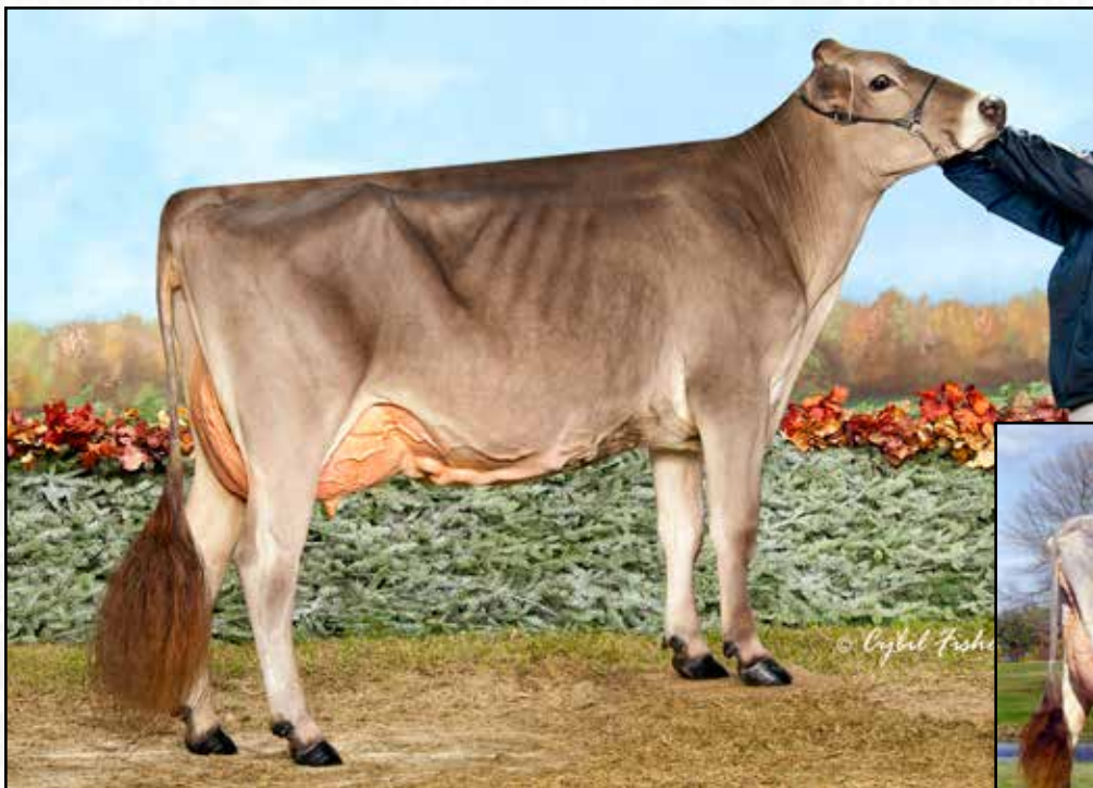
NEW VIEW TP TESSA 'E92' SELLS AS LOT 1

Reserve All-American Yearling in Milk 2017