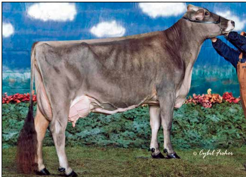
TOP ACRES PILOT SUKI ET OCS '2E92' 3RD DAM OF LOT 32 All-American Senior 2-Year-Old 2007