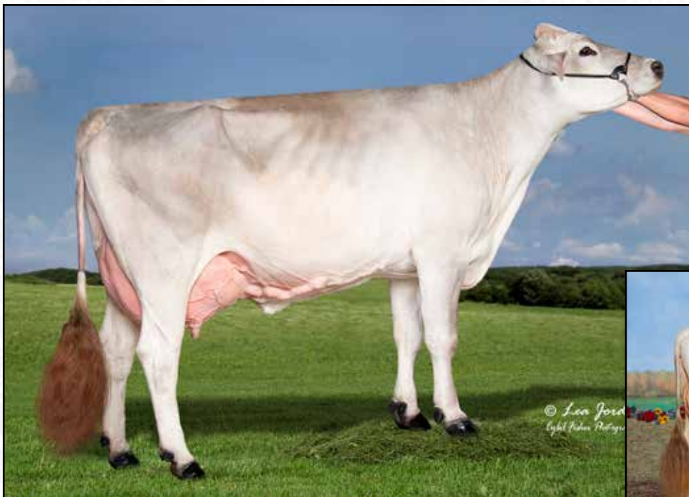
HYLIGHT LBH JONGLEUR ILIANA ET 'E90' DAM OF LOT 53; 3RD DAM OF LOT 54