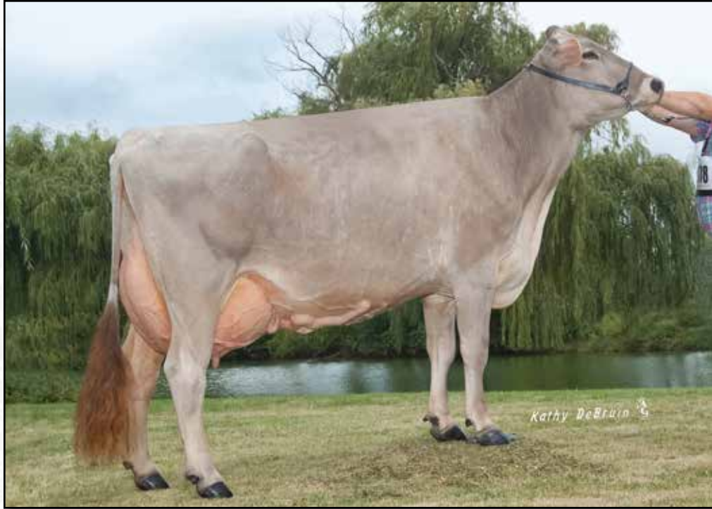
NUTMEG ACRES LEGACY PAULA '2E91' 2ND DAM OF LOT 18