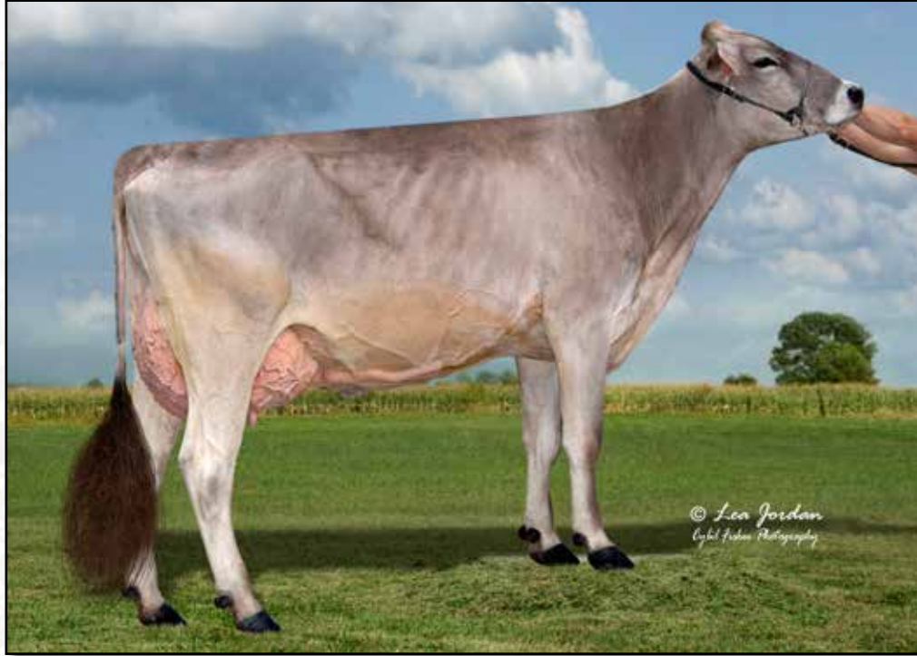
HILLS VALLEY DRDEVIL WOBBLE 'V87' MATERNAL SISTER TO 2ND DAM OF LOT 23