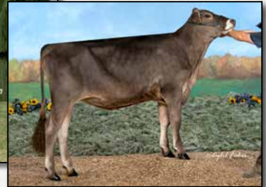
HYLIGHT TANBARK PERFECTION SAME MATERNAL FAMILY AS LOT 3 Nominated All-American Fall Yearling 2015