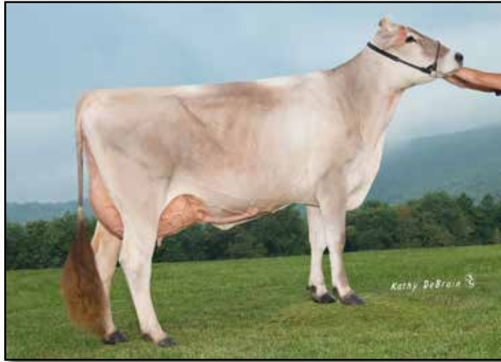
LITTLE HILL WNDRMT LOLLIPOP 'E90' DAM OF LOT 88