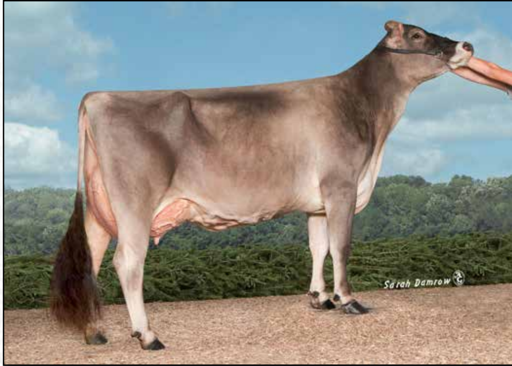
CIE HILLS VALLEY DNSTY MONSOON '2E92' 2ND DAM OF LOT 35