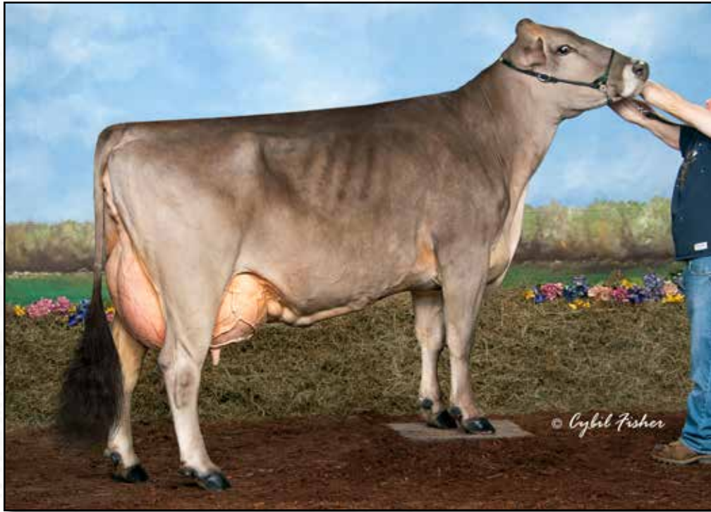
GMC WONDERMENT FRIENDLY '2E90' DAM OF LOT 43; 3RD DAM OF LOT 44