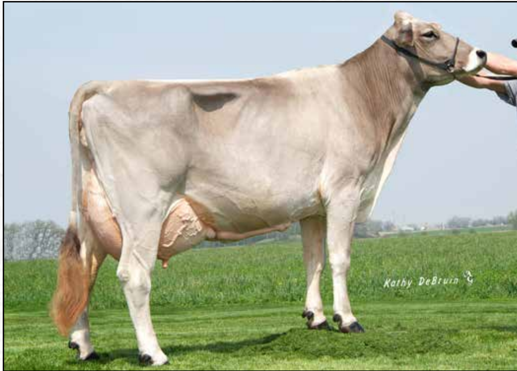
SCF JAMES VIX '3E94' DAM OF LOT 10