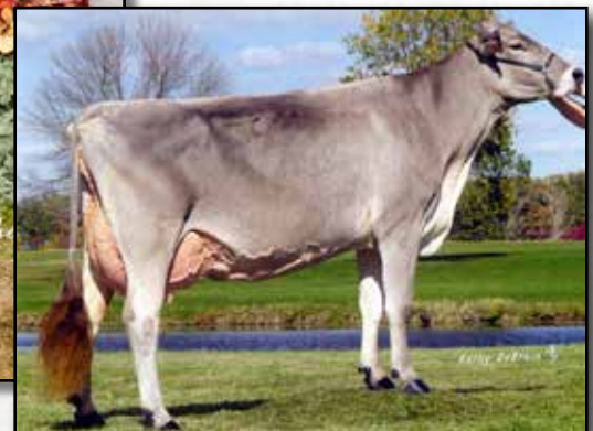
SUNNYISLE COLBY TWILITE ET '2E'93 2ND DAM OF LOT 1

Reserve All-American Yearling in Milk 2017