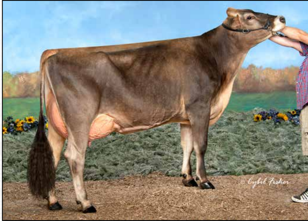
ONE TRUE HILL TIN PERI PERI 'V87' DAM OF LOT 46; 2ND DAM OF LOTS 47 & 48