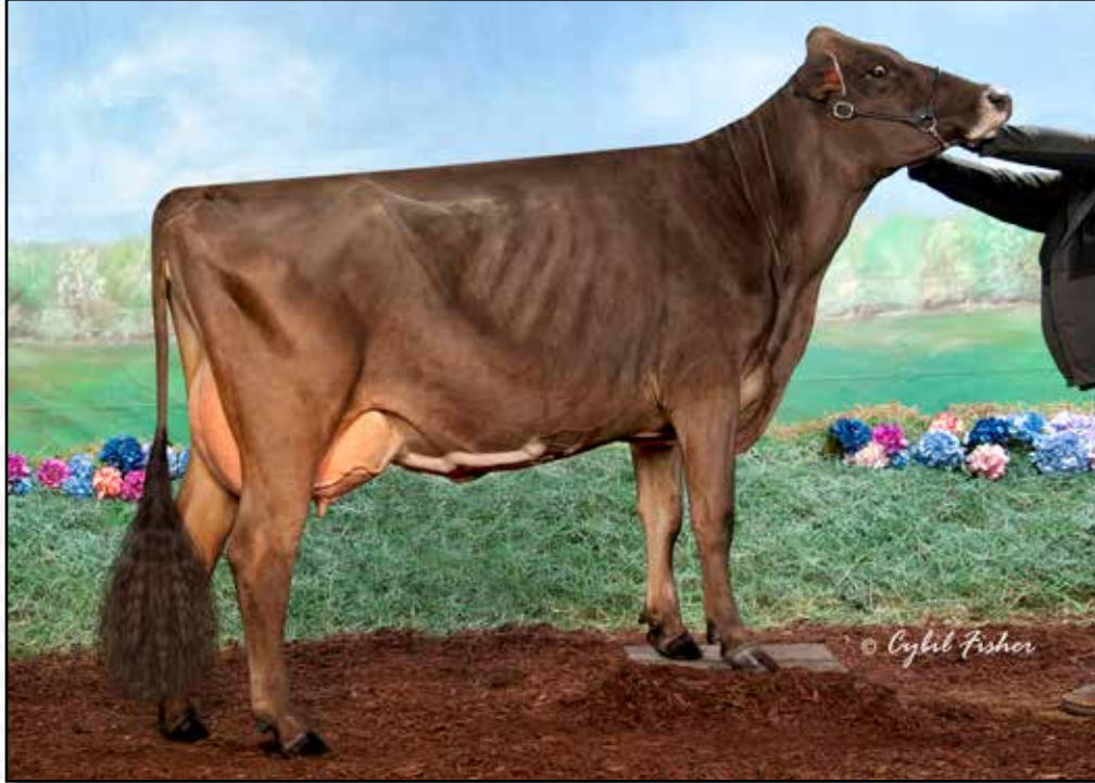
BO JOY SUPREME GOLD ET 'E93' 2ND DAM OF LOT 11