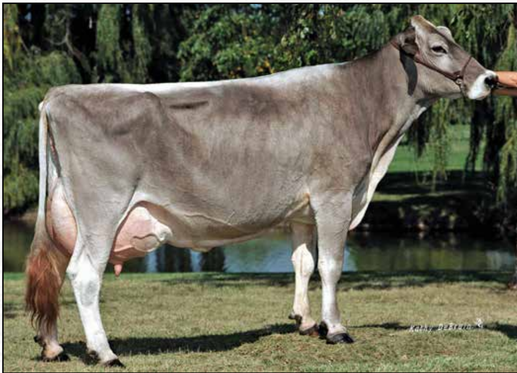
HAWTHORNE RHYTHMIC RIKI '3E94' 6TH DAM OF LOT 15 All-American Aged Cow 1995 & 1997