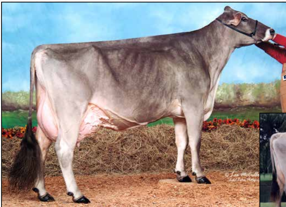
TOP ACRES JP WENDY ET '3E93' DAM OF LOT 22