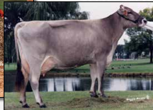
TOP ACRES EJ WHIZZBANG '5E93' 2ND DAM OF LOT 22