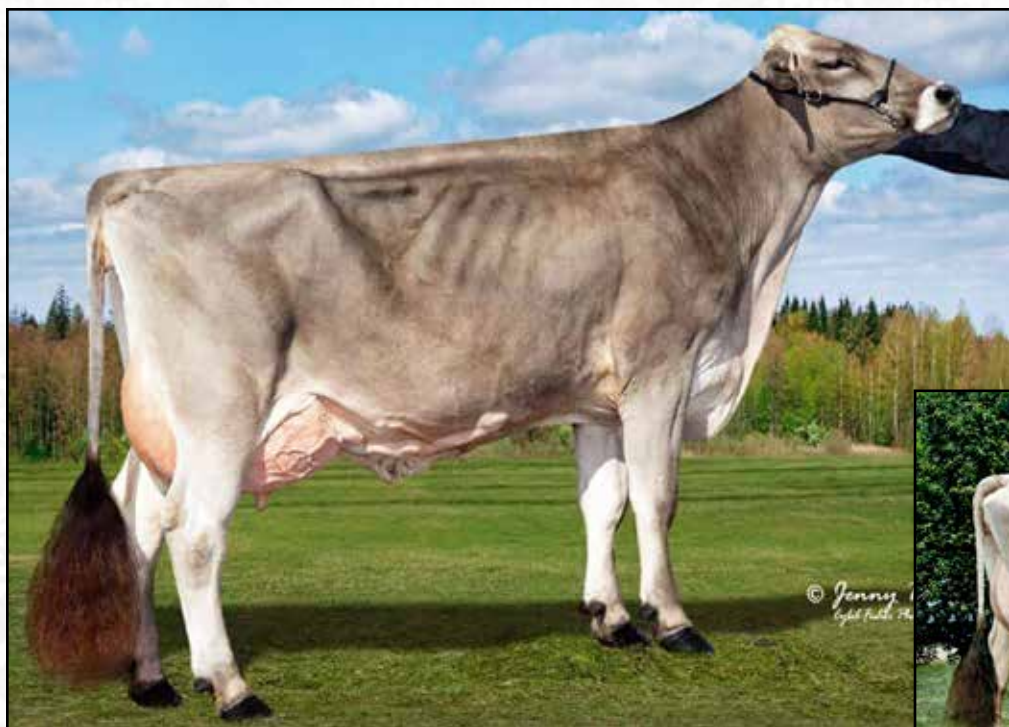
DUBLIN-HILLS SONATA ET 'V87' 2ND DAM OF LOT 2