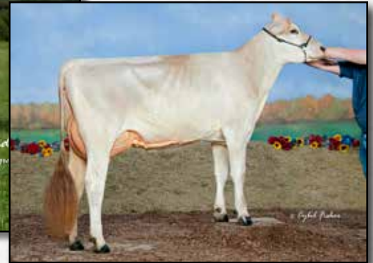
HYLIGHT LBH ILENE 'V85' MATERNAL SISTER TO DAM OF LOT 53