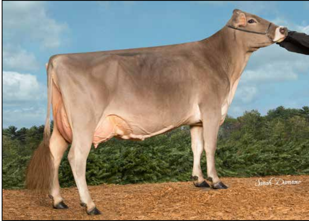
HILLS VALLEY BONANZA RUBY ET 'E91' 2ND DAM OF LOT 9 Nominated All-American Senior 3-Year-Old 2017