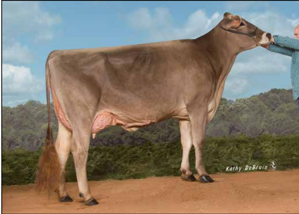
DOUBLE W PEPP CLARA 'E90' MATERNAL SISTER TO DAM OF LOT 26

Reserve Intermediate Champion, Southwest National 2015