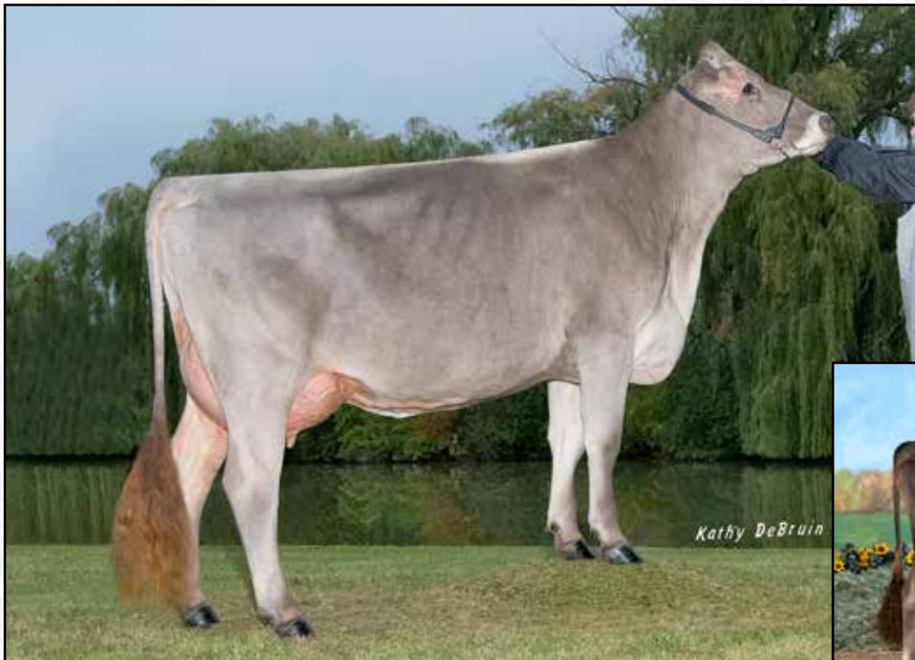
RANDOM LUCK PHANTASTIC ET 'V88' DAM OF LOT 3; 2ND DAM OF LOT 4 1st Milking Yearling, Eastern National 2014