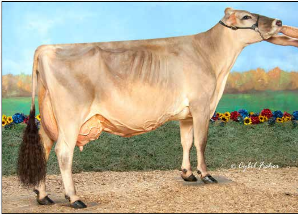
HILLS VALLEY DYNASTY RAVEN '3E-E94' 3RD DAM OF LOT 5; 4TH DAM OF LOT 6 Nominated All-American Component Merit 2020