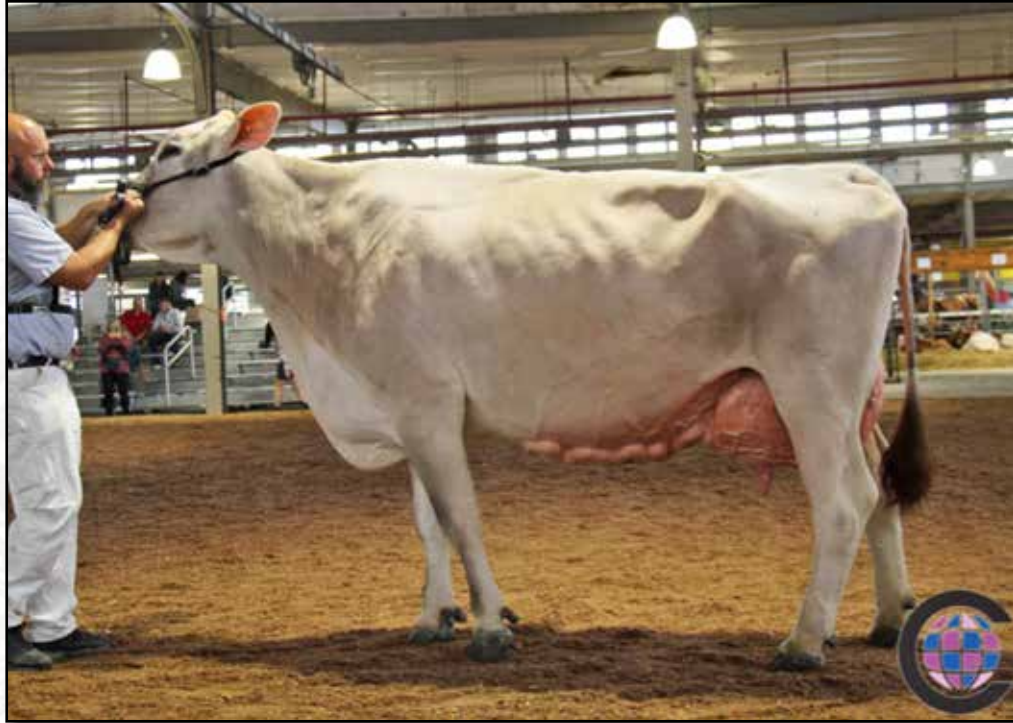
VINE VALLEY TITANIUM PATTY 'E93' 2ND DAM OF LOT 19

1st Component Merit Cow, Southeast National 2019