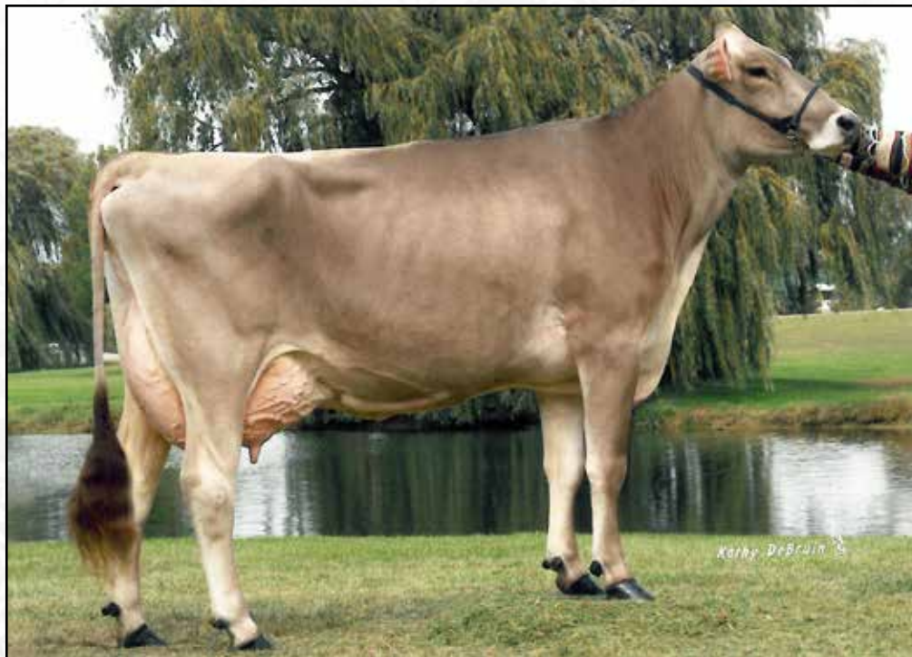
TOP ACRES COL PARTY '2E93' DAM OF LOT 16