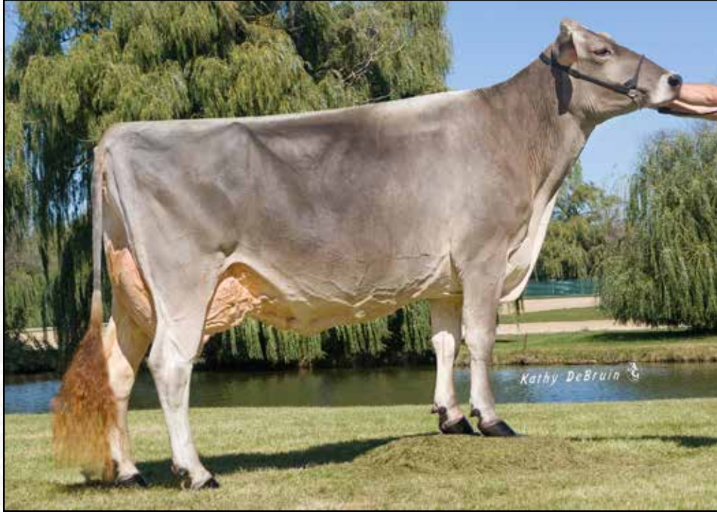
RANDOM LUCK KB PHOEBE '2E93' 2ND DAM OF LOT 3; 3RD DAM OF LOT 4 Nominated All-American Aged Cow 2010