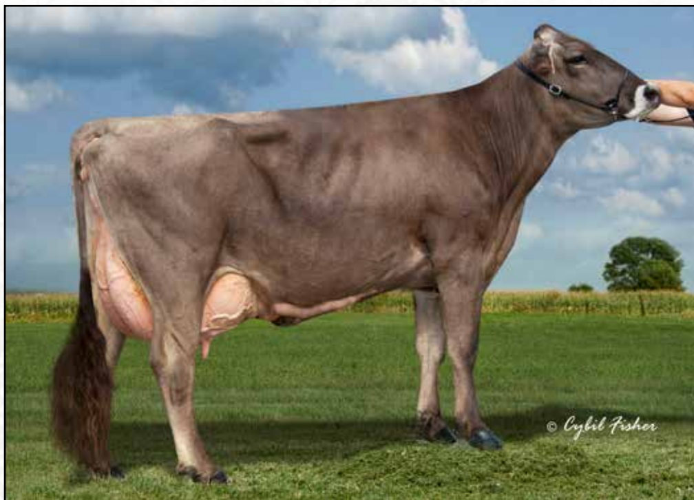
HYLIGHT ZEUS MADELIN 'E90' DAM OF LOT 55