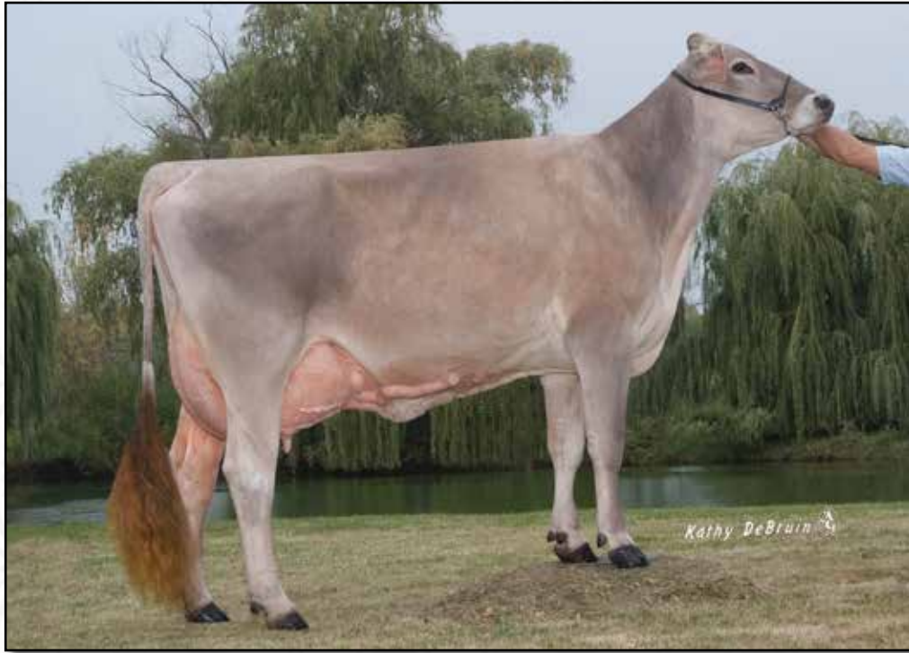
HYLIGHT LBH THEORY IZABELLE '2E92' 2ND DAM OF LOT 53; 4TH DAM OF LOT 54 1st 4-Year-Old, NY State Show 2014