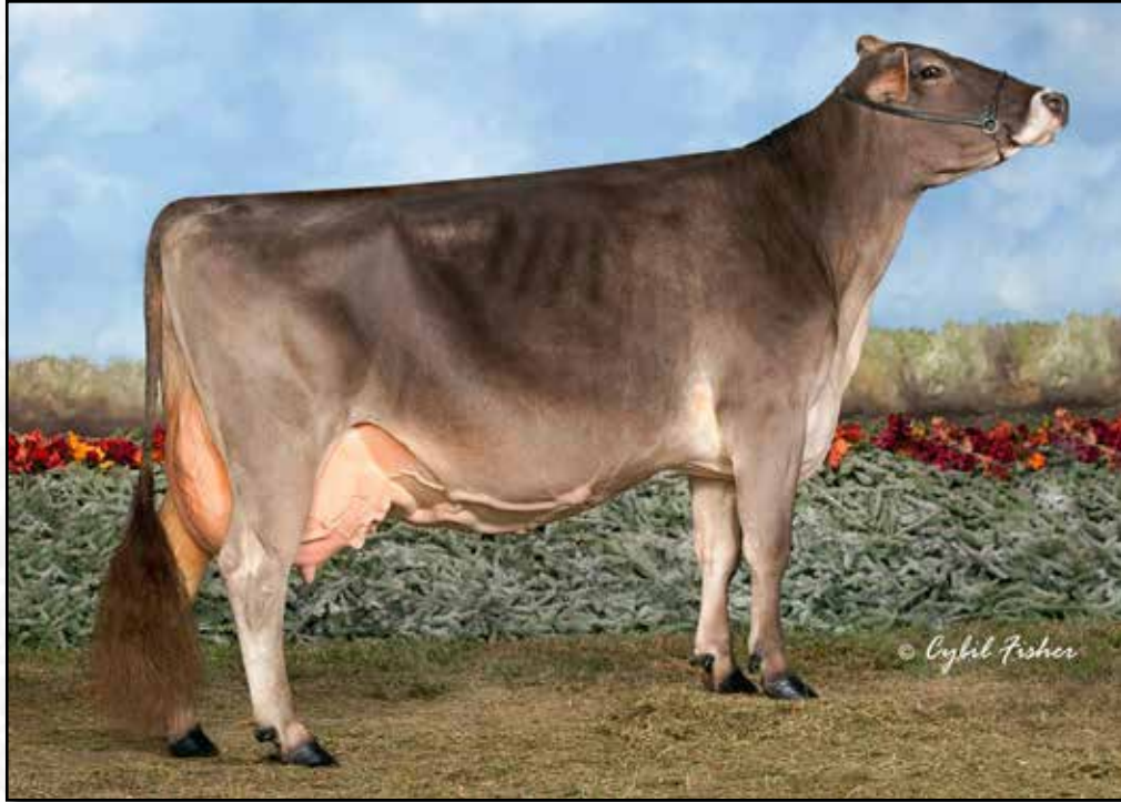
ROUND HILL LEGACY FLYHI '3E93' 3RD DAM OF LOT 38

Nominated All-American Component Merit Cow 2012