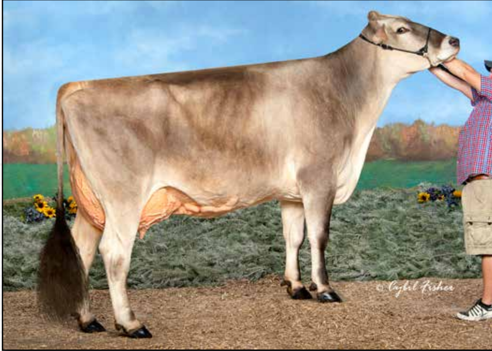
WIND MILL BONANZA BRIT 1248 '2E90' 2ND DAM OF LOTS 12 & 13