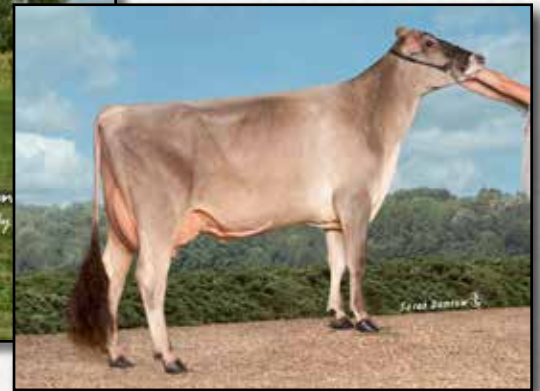
HILLS VALLEY LEGACY REESES 'V88' 2ND DAM OF LOT 5; 3RD DAM OF LOT 6