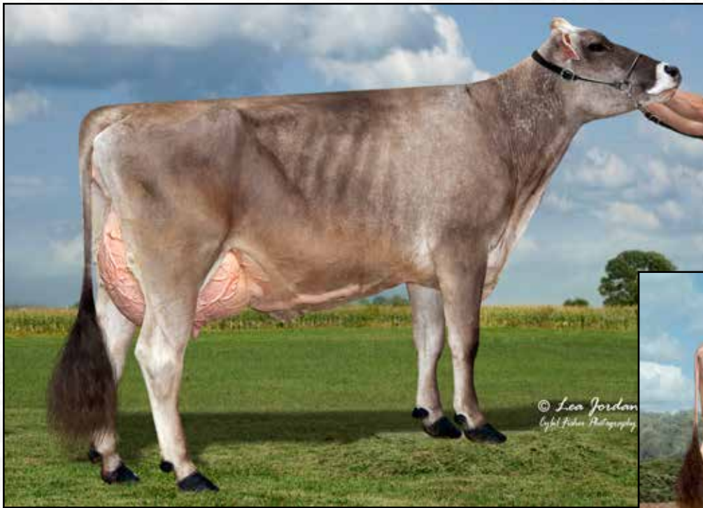
HILLS VALLEY BRAIDEN RAMADA 'V85' SELLS AS LOT 5