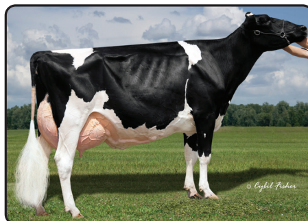
ROB-CRI STRMTIC MANITOBA-ET "EX-94 2E" Granddam of Lot 8

Bred 1/03/21 to Mr D Apple Diamondback *RC 7HO12587 (sexed semen)