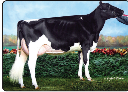
ROB-CRI TRIBUTE SHIMMER "EX-90 EX-MS" Third Dam of Lots 11 & 12