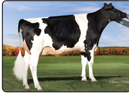
LAW-KOTA CORVETTE ALL-SPARK Lot 2