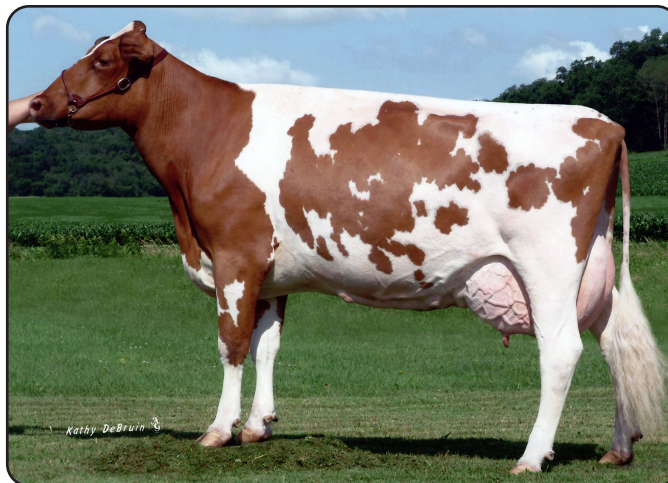
ROB-CRI RANGER MALIBU-RED "EX-90 EX-MS" Third Dam of Lot 47; Fourth Dam of Lot 48