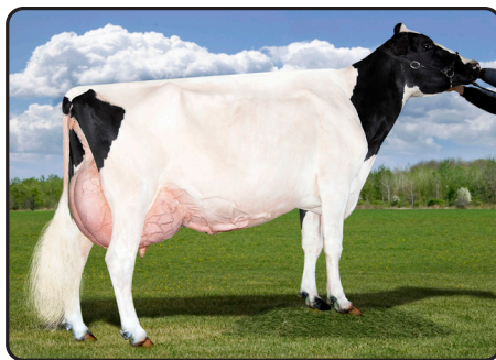
INDIANHEAD DDEE PEARL-ET "EX-91 EX-MS" Granddam of Lot 20