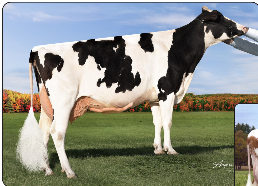
LAW-KOTA AFTERSHOCK AINSLEY "EX-92" Lot 1