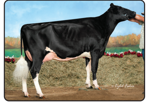
HENDEL-VATLAND TARYN 2916 "VG-87" Granddam of Lot 9