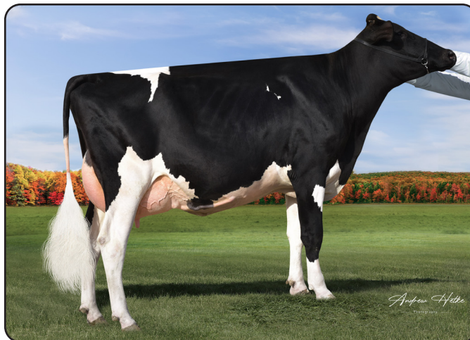
LAW-KOTA CATALST CAPTAIN-TW "VG-85 VG-MS" Lot 42