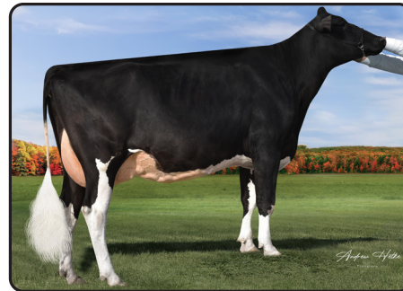
LAW-KOTA GOLDCHIP MANITOBA "VG-86"

Bred 2/28/21 to Lirr Drew Dempsey 7HO9264