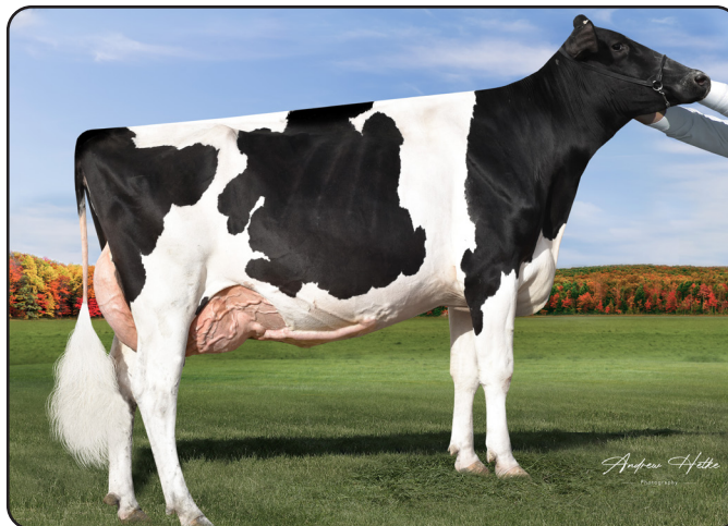
LAW-KOTA RAIMUND PIPER "EX-90 EX-MS"