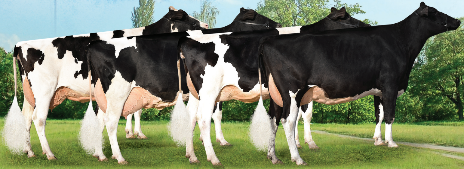
Law-Kota Aftershock AINSLEY EX-92 Law-Kota Aftershock ARIEL VG-88 Law-Kota Corvette ALL SPARK Law-Kota Gold Chip MANITOBA VG-86