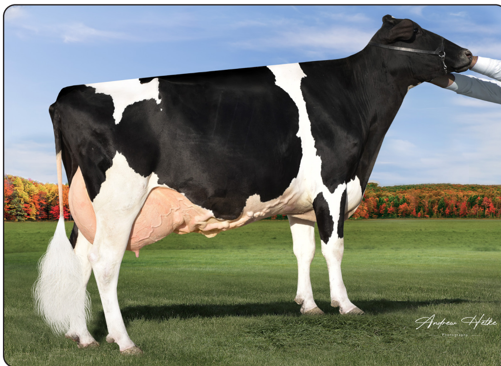
LAW-KOTA AFTERSHOCK ARIEL "VG-88"