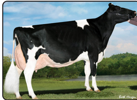
VANGOH DURHAM TREASURE "EX-96 3E" Maternal Sister to Lot 10

Due 5/21/21 to Lirr Drew Dempsey 7HO9264