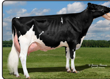
RUMMAGE ATWOOD SAMANTHA "EX-92" Same cow family as Lot 3