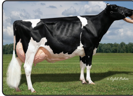
ROB-CRI STRMTC MANITOBA-ET "EX-94 2E"