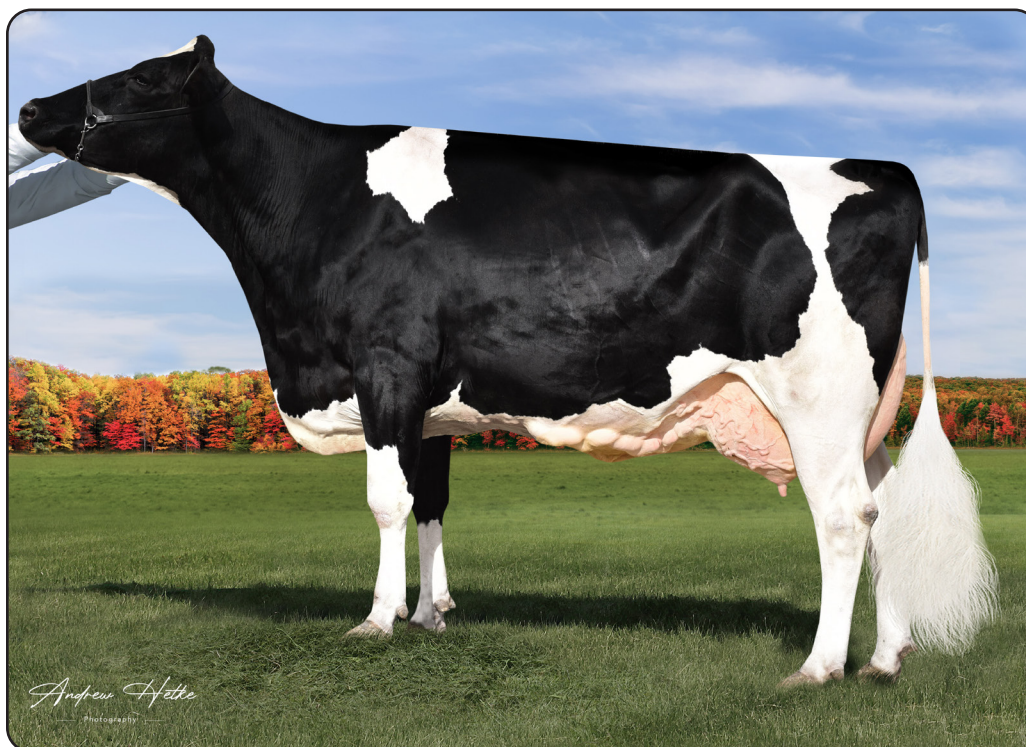
RUMMAGE ATWD SAMANTHA-ET "EX-90 EX-MS 2E"