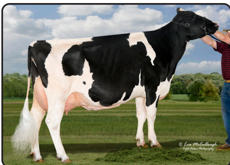
INDIANHEAD DUN BONNIE "EX-91 2E" Third Dam of Lot 35