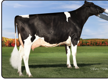
MISS DBACK TERI-ET "EX-90 EX-MS" Lot 9