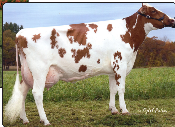
Wilstar Mar Allstar-Red-ET "EX-90 2E" Granddam of Lot 1