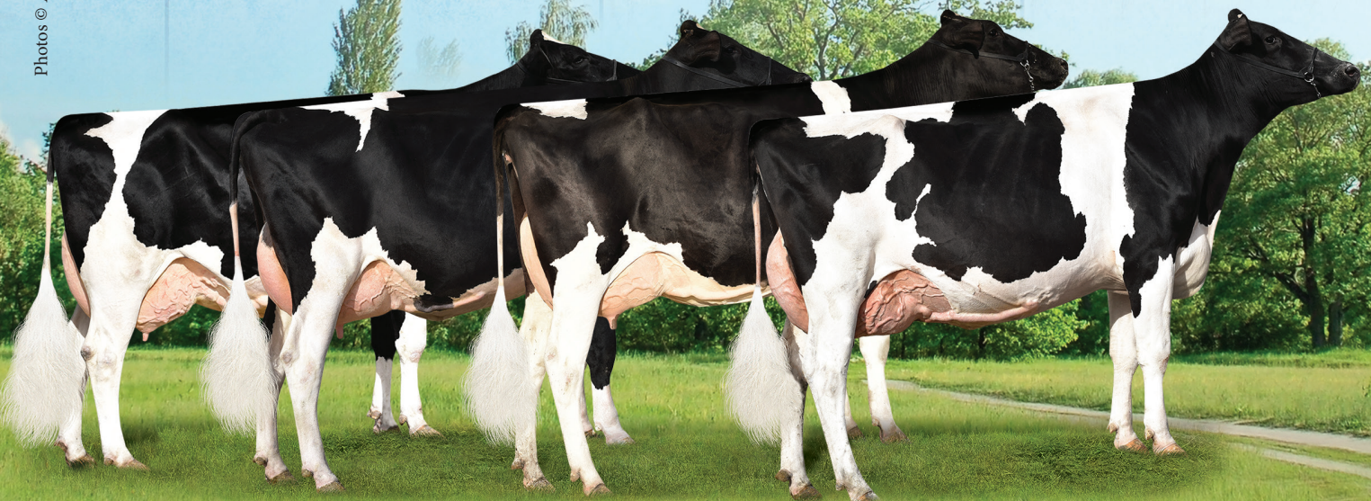
Rummage Atwd SAMANTHA EX-90 Law-Kota Catalyst CAPTAIN VG-85 Miss Dback TERI EX-90 Law-Kota Raimond PIPER EX-90