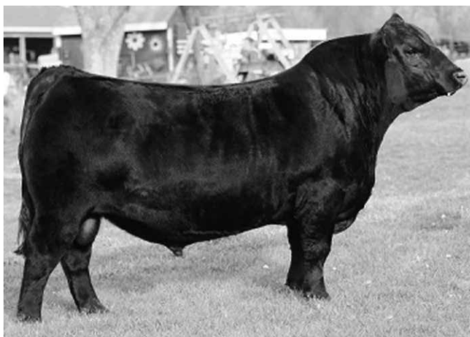
R B TOUR OF DUTY 177