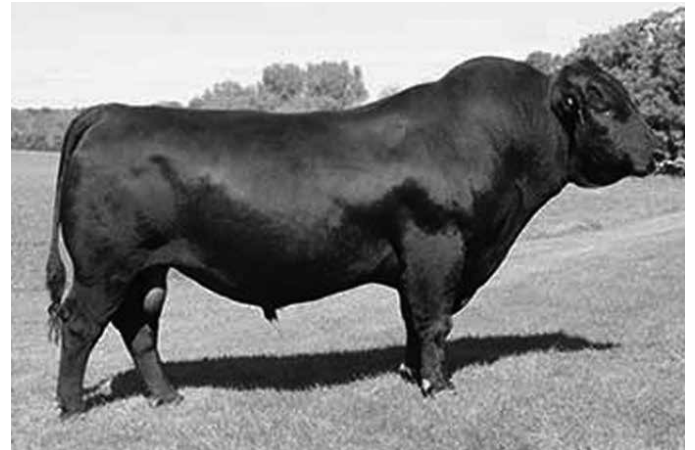
QUAKER HILL RAMPAGE 0A36