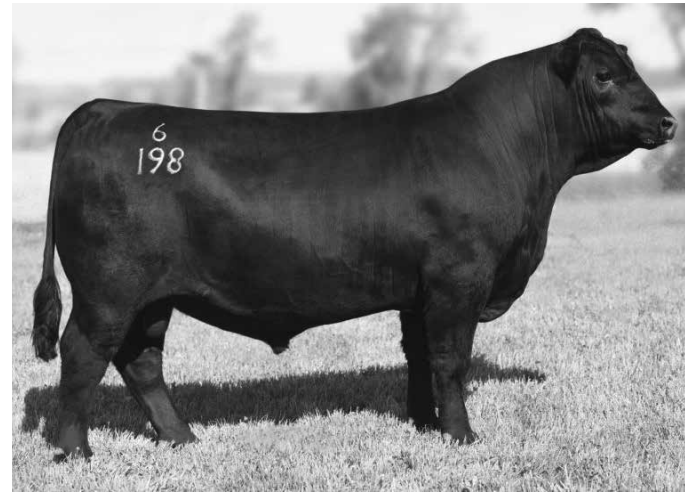
CONNEALY BLACKHAWK 6198