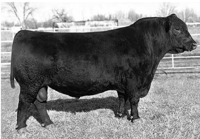
S WHITLOCK 179