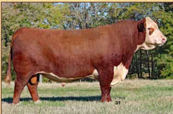
KCF Bennett Homeward C776 - Sire of Lots 2A, 4A, 5A and 16

CE 9.3 (0.41); BW 0.6 (0.49); WW 55 (0.42); YW 81 (0.41); DMI 0.2 (0.14); SC 0.9 (0.33); SCF 10.8 (0.29); MM 24 (0.27); M&G 52; MCE 9.6 (0.31); MCW 78 (0.31); UDDR 1.10 (0.47); TEAT 1.20 (0.48); CW 72 (0.25); FAT 0.034 (0.26); REA 0.43 (0.25); MARB 0.21 (0.25); BMIS 329; BIIS 350; CHBS 124 • This Slayton bred female by the popular Anodyne has a super set of EPDs and a pedigree to match. She is in her prime and is postured to be a herd builder. • Pasture exposed from Nov. 24, 2020 to March 19, 2021 to GTW C776 Kismet 817. • Consigned by W&A Hereford Farm, Providence, N.C.