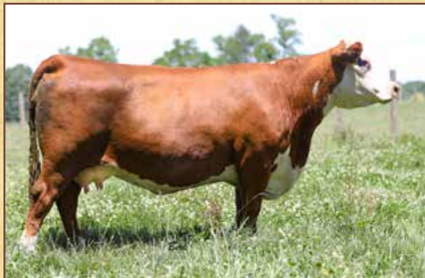
Doss My Eyes Adore U DHZ5 – Donor dam of Boyd Ft Knox 17Y X25 4040