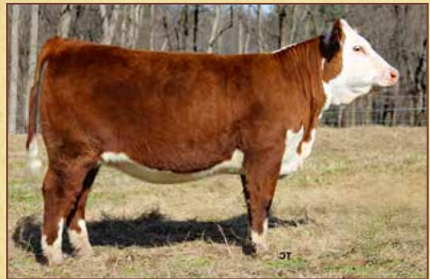
Lot 53 - PAC 27A Hometown Opal 05H