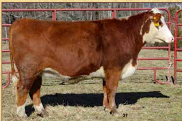
Lot 22 – JL Fancy Lady 361 415