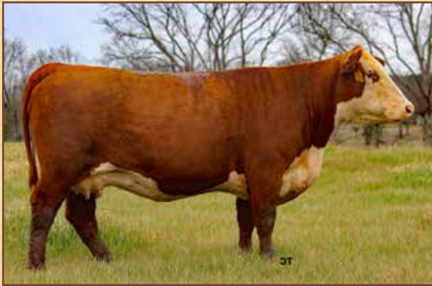
Lot 40 – GCF Sapphire 03D