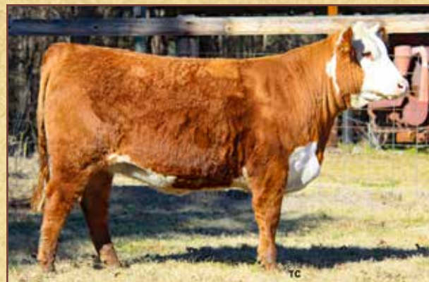
Lot 12 – Prestwood Victoria 4013 G33

• Consigned by Prestwood Beef Cattle, Lenoir, N.C.