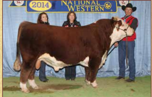
UPS Sensation 2296 ET – Sire of Lot 58