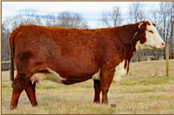
Lot 5 – DKM K158 Ms Revolution 4R 508