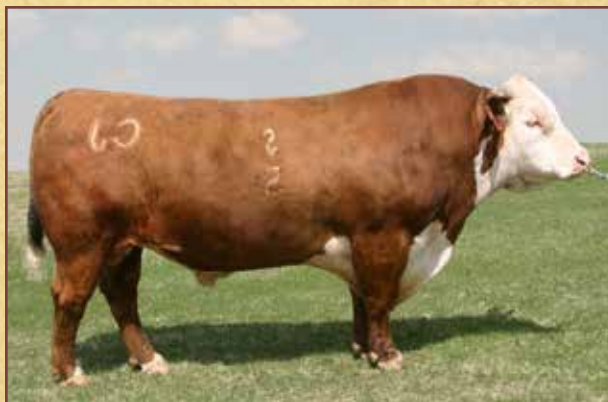
CJH Harland 408 – Paternal grandsire of Lot 35