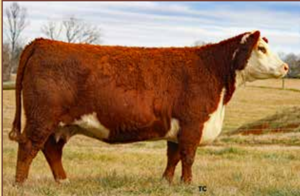
Lot 4 – WF 1595 Ms Homeplate 1500 1736

CE 0.2 (0.26); BW 3.4 (0.29); WW 66 (0.22); YW 107 (0.22); DMI 0.4 (0.08); SC 1.0 (0.15); SCF 19.8 (0.14); MM 34 (0.13); M&G 67; MCE -1.4 (0.16); MCW 87 (0.12); UDDR 1.30 (0.2); TEAT 1.30 (0.21); CW 73 (0.03); FAT 0.004 (0.03); REA 0.39 (0.03); MARB 0.16 (0.03); BMIS 408; BHS 496; CHBS 125 • A super prospect with an excellent set of numbers and paperwork to match. These young herd sires can work for you or grow into money in your bull pen. • Consigned by W&A Hereford Farm, Providence, N.C.