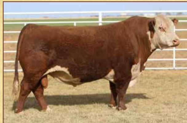
BR Hutton 4030ET - Sire of Lot 60A

Dam EPDs: CE 3.0 (.40); BW 2.6 (.33); WW 54 (.32); YW 88 (.32); DMI 0.0 (.11); SC 0.4 (.29); SCF 13.1 (.30); MM 26 (.30); M&G 53; MCE 3.1 (.34); MCW 98 (.29); UDDR 1.20 (.32); TEAT 1.10 (.32); CW 64 (.03); FAT -0.016 (.03); REA 0.39 (.03); MARB -0.09 (.03); BMIS 297; BIIS 351; CHBS 99