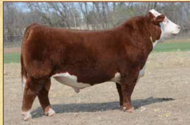
T/R BPF AmericanClassic 561CET - Sire of Lot 59

• Consigned by Day Ridge Farm, Telford, Tenn.