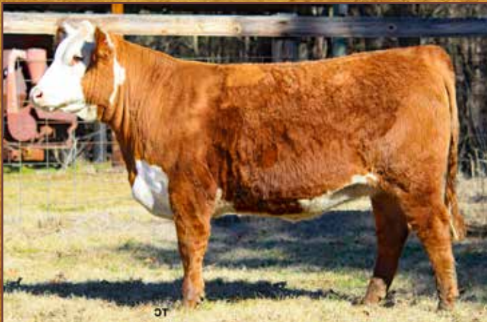
Lot 12 – Prestwood Victoria 4013 G33