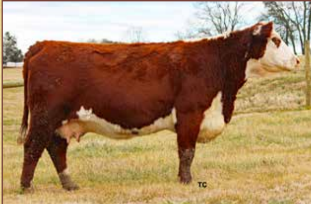
Lot 2 - Slayton 605 Devine 441/001A

CE -1.6 (0.27); BW 3.5 (0.27); WW 62 (0.19); YW 102 (0.19); DMI 0.3 (0.07); SC 0.8 (0.13); SCF 14.5 (0.12); MM 27 (0.13); M&G 58; MCE -1.5 (0.17); MCW 95 (0.11); UDDR 1.50 (0.18); TEAT 1.50 (0.19); CW 72 (0.03); FAT 0.014 (0.03); REA 0.40 (0.03); MARB 0.11 (0.03); BMIS 329; BIIS 407; CHBS 121 • Due to her age this gal will sell with her mother. This 3-in-1 package has serious value. • Consigned by W&A Hereford Farm, Providence, N.C.