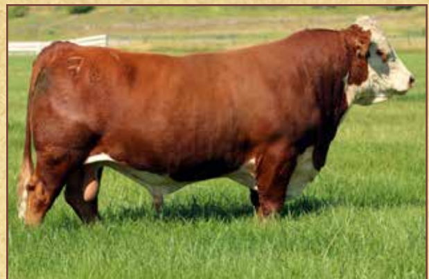
NJW 160B 028X Historic 81E ET – Sire of Lots 39 and 52