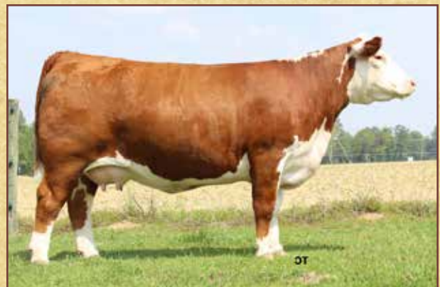
KB RB Daisy Duke 666 B835 – Donor dam of Lot 37