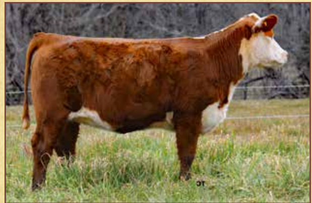
Lot 44 – 4B 385 Ms Westbrook G921