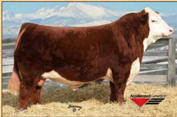
KT Small Town Kid 5051 – Sire of Lot 21