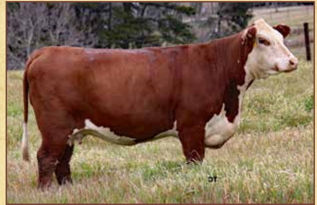
Lot 41 – 4B 909B Rosey Dream 712E

CE 3.0 (0.29); BW 2.7 (0.24); WW 46 (0.18); YW 74 (0.18); DMI 0.1 (0.07); SC 1.0 (0.13); SCF 19.9 (0.14); MM 28 (0.12); M&G 51; MCE 4.8 (0.21); MCW 54 (0.14); UDDR 1.40 (0.32); TEAT 1.40 (0.33); CW 58 (0.03); FAT 0.016 (0.03); REA 0.22 (0.03); MARB 0.01 (0.03); BMIS 381; BIIS 439; CHBS 93 • Sapphire blends R117 with horned bloodlines of Holden and Jamison. She has blossomed into a real nice, powerful cow. She is in the prime of her life and has been programmed to be productive. Take this cow home and she will pay you back! • Bred AI Dec. 31, 2020 to TF Ribeye 043 909B, then pasture exposed from Jan. 6 to Jan. 30, 2021 to JMS Victor 39B 7126. • Consigned by Four B Farms, Shelby, N.C.