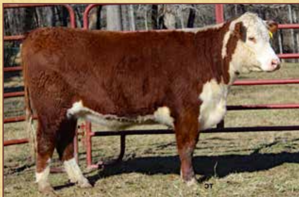
Lot 23 – JL Showoff 300 408