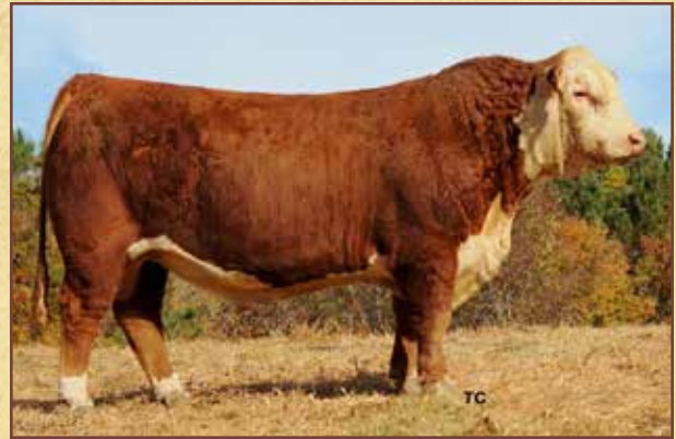
Innisfail WHR X651/723 4013 ET – Sire of Lots 25A, 30A and 31A