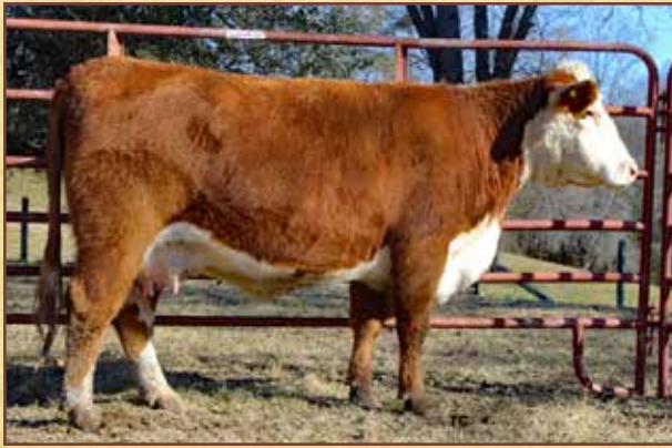
Lot 24 – JL Lady Love 384 280 441