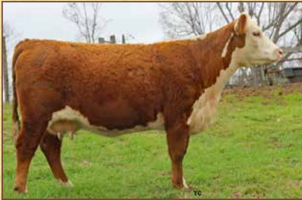
Lot 30 – Walker Erica 455B B108 697D