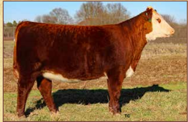
Lot 17 - MF3C Diana Who Maker 02H ET

CE -1.7 (0.29); BW 3.5 (0.25); WW 54 (0.23); YW 83 (0.23); DMI -0.1 (0.08); SC 0.8 (0.18); SCF 17.6 (0.18); MM 38 (0.18); M&G 65; MCE 0.0 (0.22); MCW 113 (0.19); UDDR 1.20 (0.25); TEAT 1.20 (0.25); CW 75 (0.03); FAT -0.026 (0.03); REA 0.67 (0.03); MARB 0.01 (0.03); BIIS 394; BIIS 456; CHBS 126 • ECR Who Maker 210ET daughters are rare, and combine that with Miles McKee and the famed Diana on the dam side, you have a pedigree that is hard to find anywhere. Her dam was the Supreme Champion Heifer at NC State Fair Open Show in 2017. This heifer is stout, big-footed and deep-ribbed. She has the pedigree to make some future stars of your own. She is halter broke if you want to show her this summer and fall! • Consigned by Mitchem Farm, Vale, N.C.