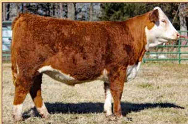
Lot 16 – DTF Belle Star C776 OH06