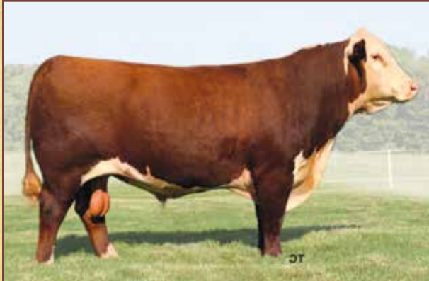
THM Made Believer 6051 – Sire of Lots 6, 7 and 8