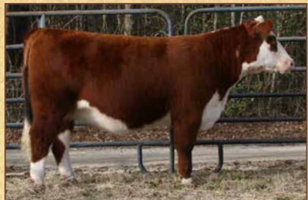
Lot 20 - TJF AM Miss Ribeye M326