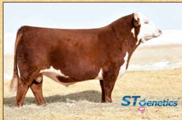
H FHF Advance 628 ET - Sire of Lot 60B

• Consigned by Day Ridge Farm, Telford, Tenn.