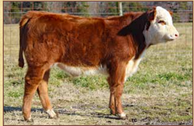
Lot 56A – Will-Via Bright Star