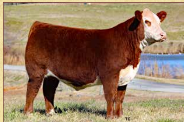
Lot 9 – NCSU Mr Pack 541 27H

• Consigned by North Carolina State University E. Carroll Joyner Beef Education Unit, Raleigh, N.C.