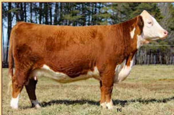
Lot 34 – PPH Penelope F57