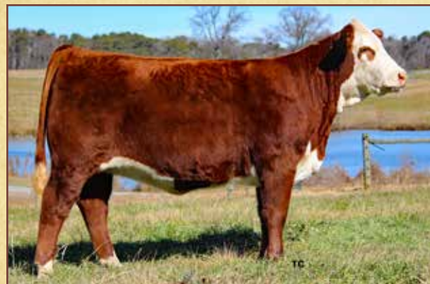
Lot 10 – NCSU Ms Pack 663 28H

• Consigned by North Carolina State University E. Carroll Joyner Beef Education Unit, Raleigh, N.C.