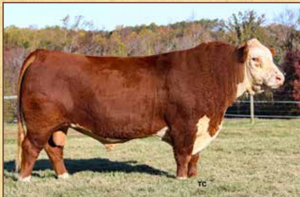
THM 100W Reliable 3018 ET – Sire of Lot 27, Grand sire of Lots 28A and 29A