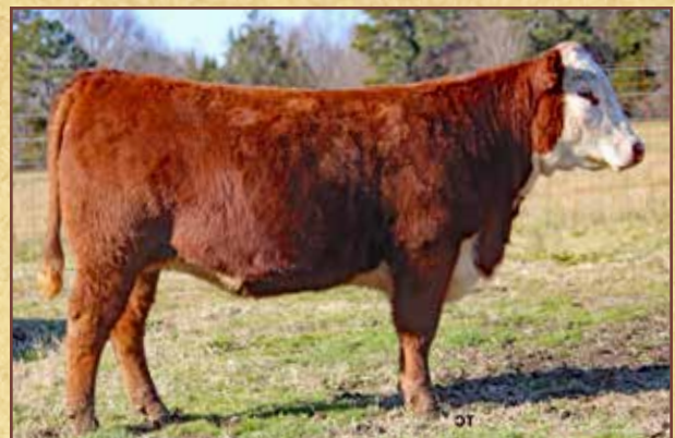
Lot 55 - Will-Via Lady Victoria