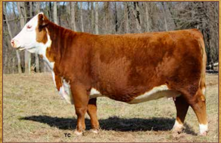
Lot 37 – KB MB Damsel 835 B900