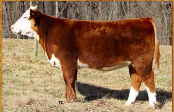
Lot 52 – PAC 81E Angel 25H