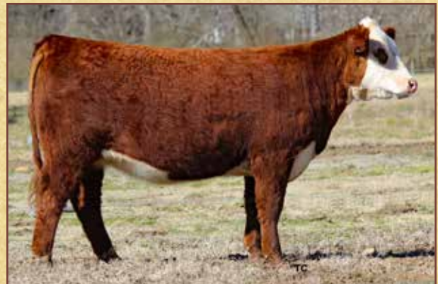
Lot 45 – KB MB Countess 827 B10