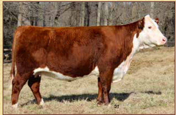
Lot 36 – PAC 320 Aces Diamond 08C