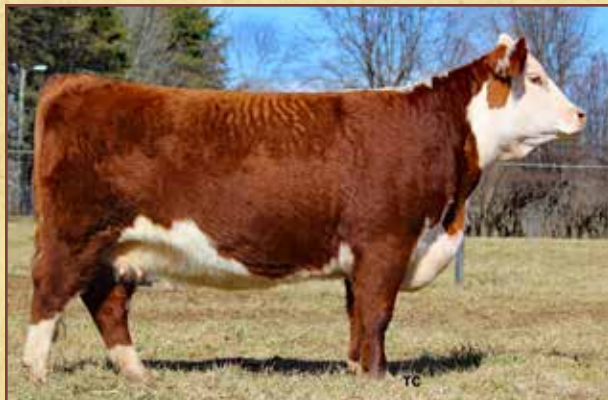
Lot 33 – MF3C Catapult 109 Gracie 04F