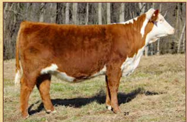
Lot 54 - PAC 485T Classy 23H