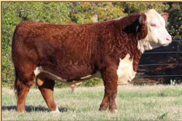
GTW C776 Kismet 817 - Sire of Lots 1A and 3A, Featured Service Sire

CE 0.0 (0.34); BW 3.2 (0.28); WW 59 (0.24); YW 96 (0.24); DMI 0.1 (0.09); SC 0.8 (0.2); SCF 10.5 (0.17); MM 27 (0.2); M&G 56; MCE 1.8 (0.27); MCW 98 (0.18); UDDR 1.50 (0.34); TEAT 1.60 (0.36); CW 68 (0.03); FAT 0.004 (0.03); REA 0.41 (0.03); MARB -0.01 (0.03); BMIS 267; BIIS 330; CHBS 110 • A beautiful first calf female bred by CES and Predistined in Georgia. She has a super pedigree, a great udder, is high quality and will be a top-end investment. • Pasture exposed from Jan. 5 to March 19, 2021 to GTW C776 Kismet 817. • Consigned by W&A Hereford Farm, Providence, N.C.