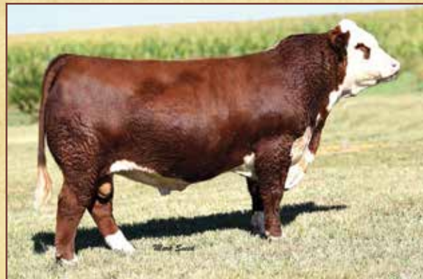
R Leader 6964 – Sire of Lots 28 and 31