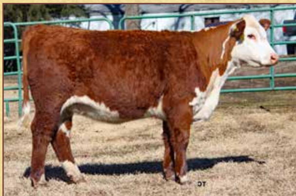
Lot 15 – DTF Morgan 4386 OH01