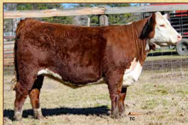
Lot 11 – CMF 1530 Rita 512G

• Consigned by Five J's Cattle Co., Clayton, N.C.