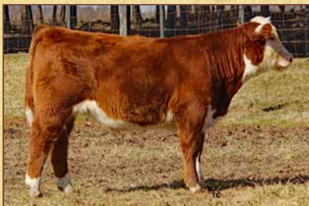
Lot 34A – Jacob's Rambo 10H