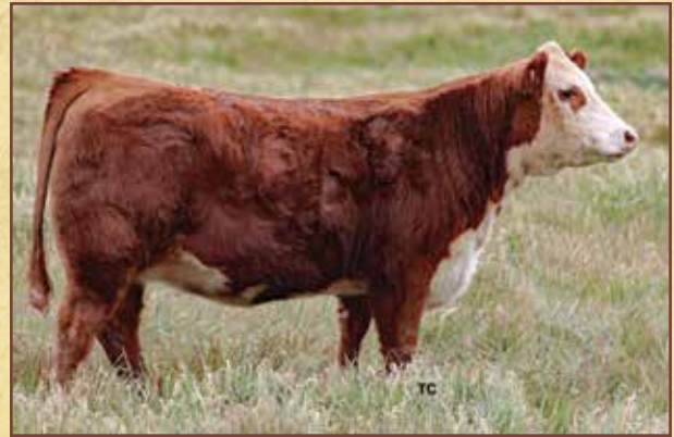
Lot 43 – 4B 66589 4013 Ms Mandate G905