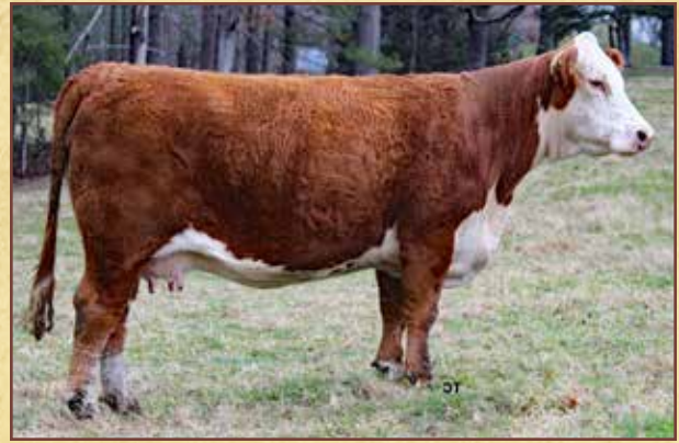
Lot 25 – JL Lady Love 335 18 441