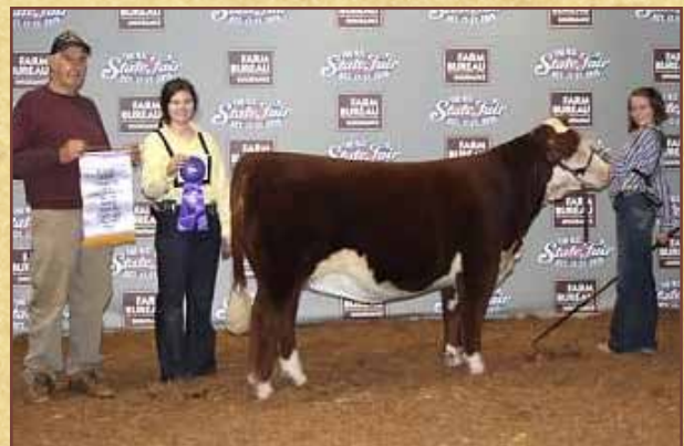
WSSC Ima 78F ET - Dam of Lot 19

CE 0.6 (0.28); BW 3.7 (0.24); WW 57 (0.18); YW 92 (0.19); DMI 0.2 (0.07); SC 1.0 (0.14); SCF 18.3 (0.14); MM 23 (0.13); M&G 52; MCE 1.2 (0.18); MCW 84 (0.13); UDDR 1.40 (0.17); TEAT 1.50 (0.18); CW 62 (0.03); FAT -0.006 (0.03); REA 0.56 (0.03); MARB 0.07 (0.03); BIIS 377; BIIS 448; CHBS 109 • Ima is a big-bodied, sound heifer with eye appeal. Her dam is a Ribeye 88X daughter of the famed SULL TCC Ms Harley 312 ET that Jordan showed and was Reserve Champion Hereford at the NC State Fair Open Show in 2019. This May heifer is a good show prospect and will make a great cow for any herd. • Consigned by Mitchem Farm, Vale, N.C.