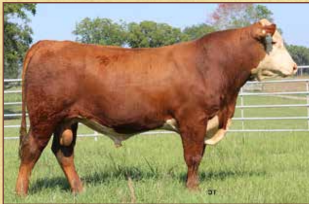
RMB 3722 Whitlock 634C ET – Sire of Lot 14