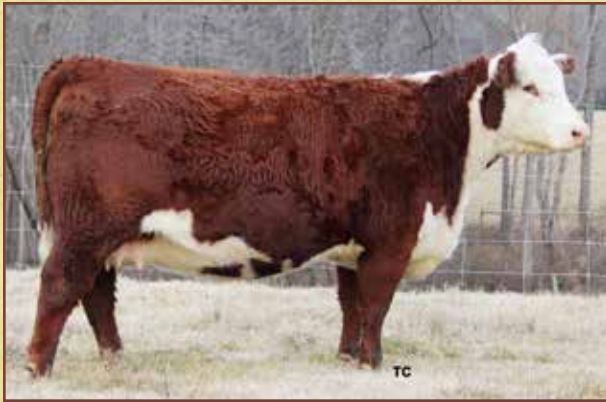
Lot 1 - CES Julia 322 T3 ET