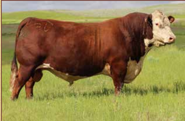
NJW 76S 27A Long Range 203D ET – Sire of Lot 57