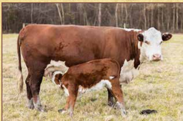
Lot 51 – TJF Buzzin Investment