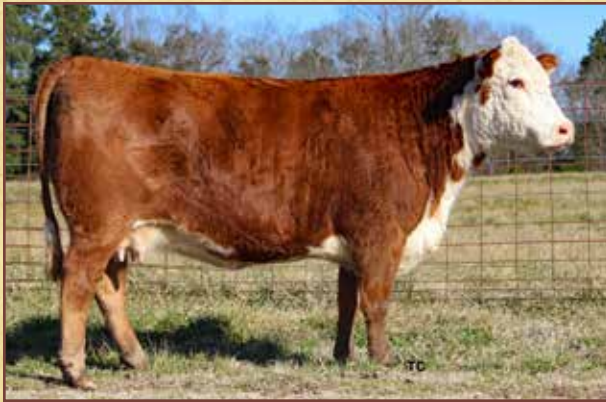
Lot 56 – Will-Via Ms Conservative T-216