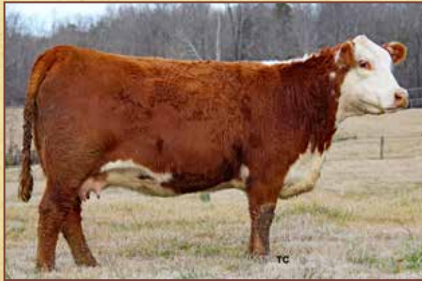
Lot 3 – GTW B716 Laura 730