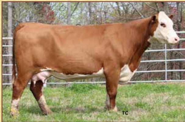
Whitehawk P152 Beefmaid 854CET – Dam of Lot 13