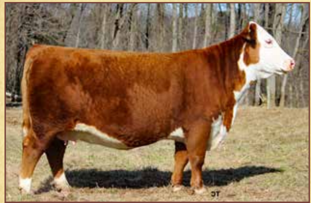
Lot 37 – KB MB Damsel 835 B900