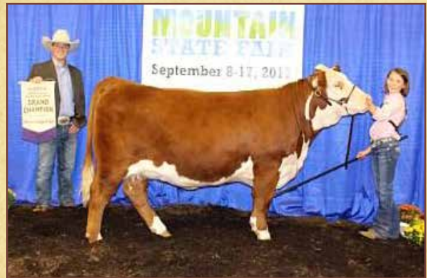
WR CH Miss Throttle 148C ET - Dam of Lot 18

CE 2.8 (0.35); BW 2.6 (0.24); WW 58 (0.24); YW 93 (0.24); DMI 0.4 (0.08); SC 0.8 (0.22); SCF 16.8 (0.22); MM 23 (0.23); M&G 52; MCE 2.4 (0.27); MCW 98 (0.21); UDDR 1.40 (0.26); TEAT 1.40 (0.26); CW 73 (0.03); FAT 0.004 (0.03); REA 0.71 (0.03); MARB 0.13 (0.03); BIIS 368; BIIS 443; CHBS 124 • This MSU TCF Revolution 4R daughter has a ton of center body dimension. She is sound-footed and has brood cow written all over her. Revolution 4R daughters are hard to come by and recognized for their snug udders and small teats. • She sells safe in calf to R Excitement 4356. Excitement is an easy calving bull with an exceptional set of EPDs. • Consigned by Mitchem Farm, Vale, N.C.