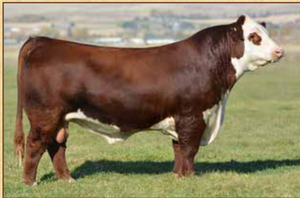
CHEZ Dante 652D ET – Sire of Lot 21A