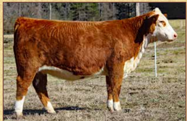
Lot 46 – KB MB Violet 6153 B12