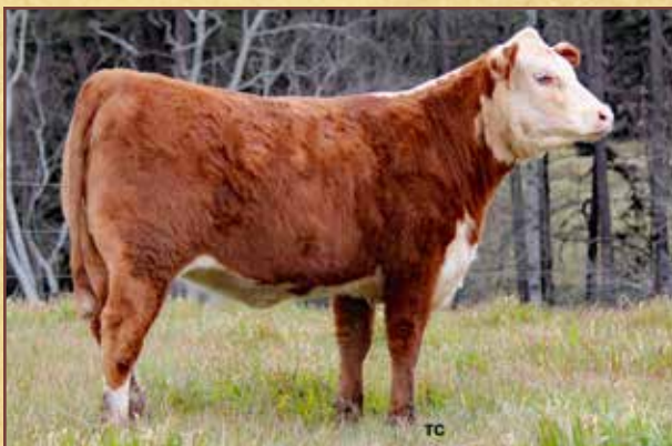
Lot 42 – 4B 724 Ms Westbrook G949

CE -0.4 (0.29); BW 4.2 (0.33); WW 52 (0.25); YW 92 (0.27); DMI 0.3 (0.09); SC 0.8 (0.15); SCF 16.2 (0.13); MM 23 (0.13); M&G 49; MCE 1.0 (0.18); MCW 96 (0.14); UDDR 1.20 (0.19); TEAT 1.20 (0.19); CW 68 (0.07); FAT 0.034 (0.11); REA 0.40 (0.07); MARB 0.27 (0.09); BMIS 354; BIIS 434; CHBS 128 • G949 comes from a great maternal bull. Her dam is our blend of Ribeye 909B and going back to our foundation sire, 735. This cow will have all the performance needed and should have an ideal udder at calving. • Scan data: REA 7.17; CWT 1.12; IMF 4.53; FT 0.17 • Bred AI Dec. 31, 2020 to /S Mandate 66589 ET, then pasture exposed from Jan. 6 to Jan. 30, 2021 to THM Nicholas 901Z ET. • Consigned by Four B Farms, Shelby, N.C.