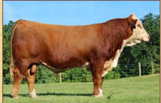
NJW 11B Authorize 79G ET – Service sire for Lot 4