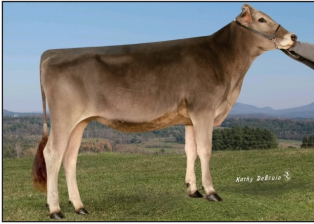
DSKM Foremost Valedictorian