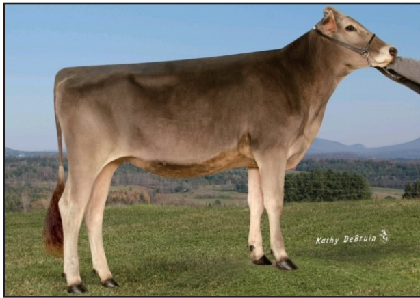
DSKM Foremost Valedictorian Grand Champion SD State Fair 2020 Junior Champion SD State Fair 2020 - Selling Lot 58