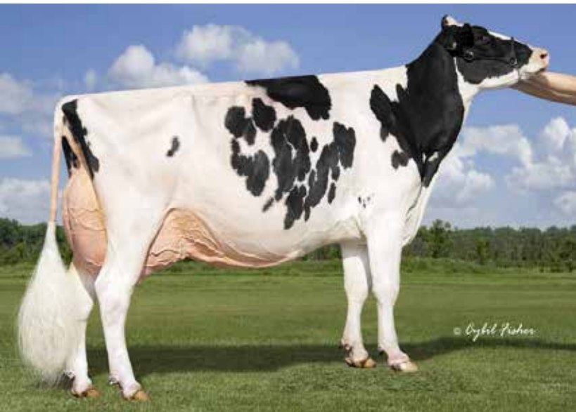
Farnear Tbr Aria Adler-ET EX-96 • 1st Lifetime Prod. Cow, Sr. & Grand Champion Midwest Fall National, Southern National & Iowa State Show 2020 • Nominated All-American Production Cow 2020