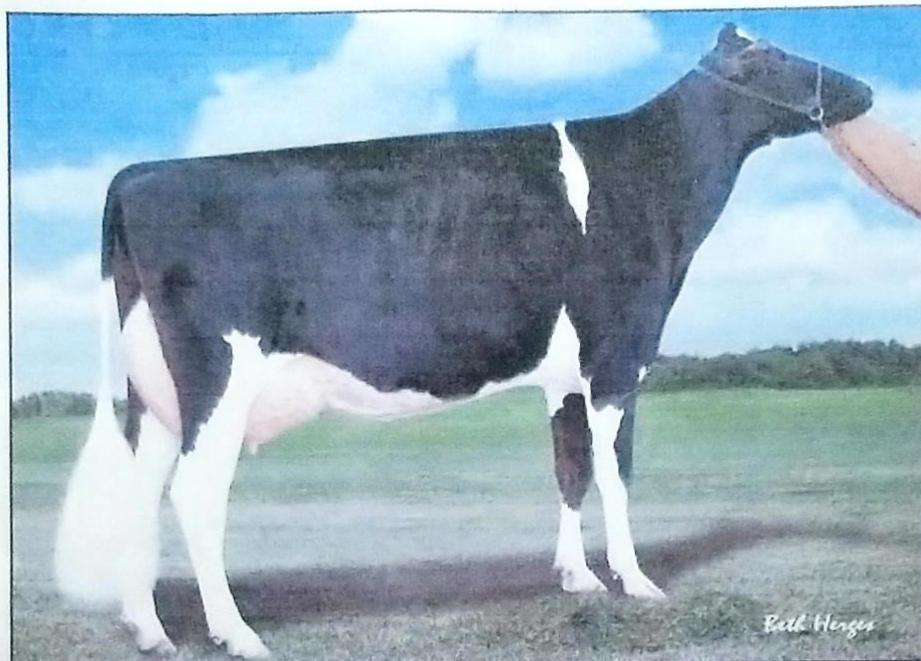
STUEWES ADVENT GIA EX-90 2ND DAM OF LOT 97