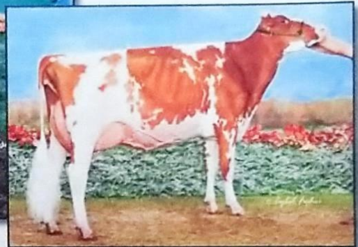
LEGEND-MAKER DEFI GYPSY-RED-ET EX-90 DAM OF LOT 96