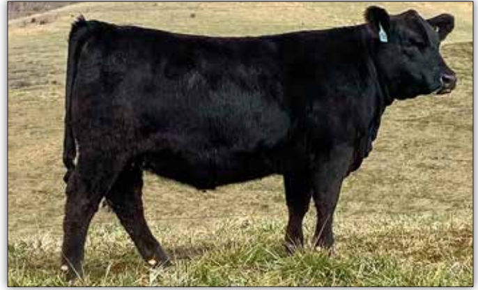
LAWSON ABIGALE H684 – She sells as Lot 5.