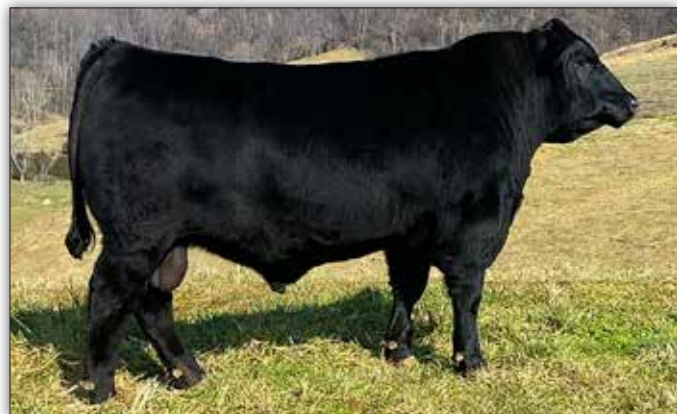
LAWSONS ENGAGE G619 – He sells as Lot 59.