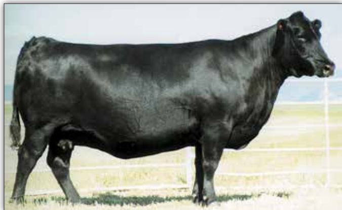
SITZ BARBARA PERFECTION 1882 – Third-generation dam of Lot 13.