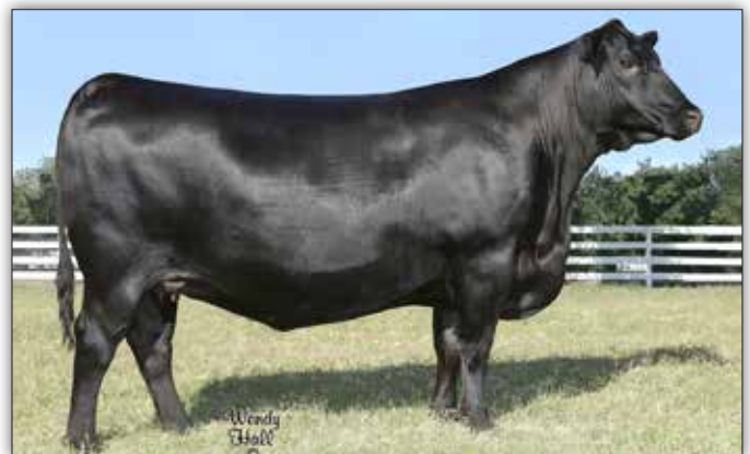
VINTAGE BLACKBIRD 4034 – The $120,000 valued granddam of Lot 8.