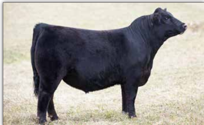
RX CONVERSATION 205H – He sells as Lot 58.