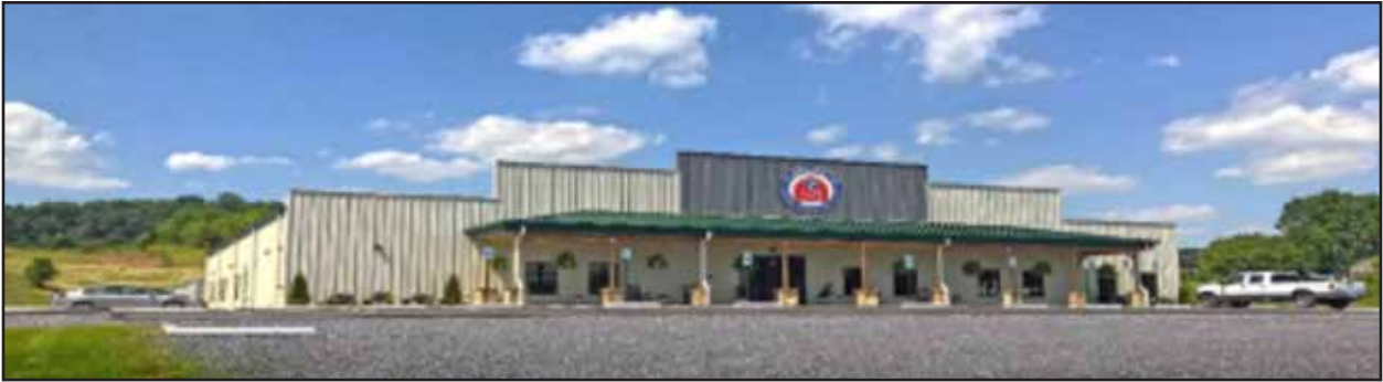
Owned and Operated by Sullivan County Cattleman's Association

140 Spurgeon Lane, Blountville, TN (conveniently located near Tri-Cities Airport)