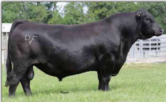
Deer Valley Growth Fund – Sire of Lot 28.