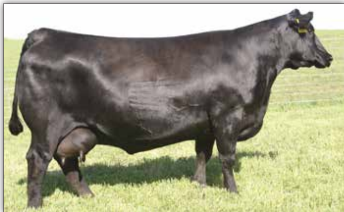
SAV EMBLYNETTE 3301 – Third-generation dam of Lot 11.