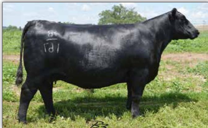
RB LADY PARTY 167-305 – The $300,000 granddam of Lot 30.