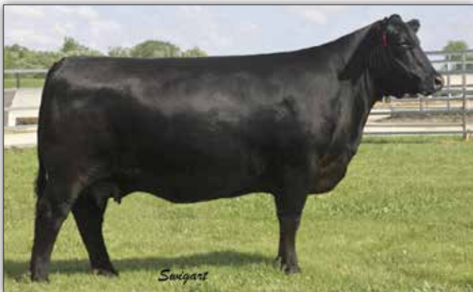
WERNER LADY JAYE 0176 – Dam of Lot 55.