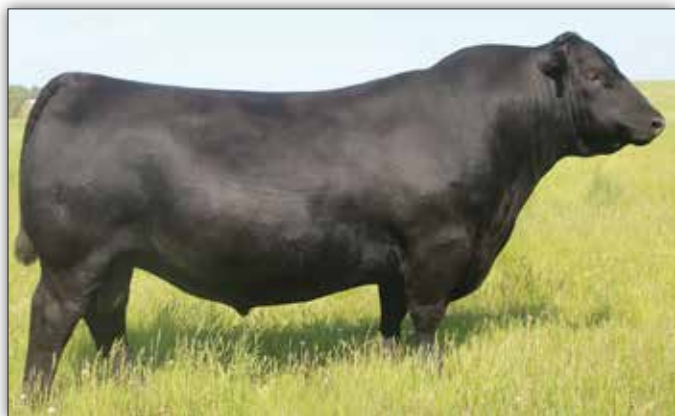
SAV Rainfall 6846 – Sire of Lots 22 and 26.