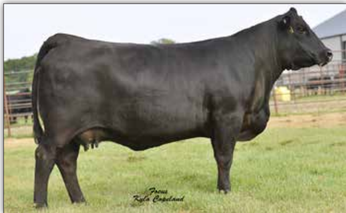
PF HENRIETTA PRIDE 1009 EXAR – Dam of Lot 1.