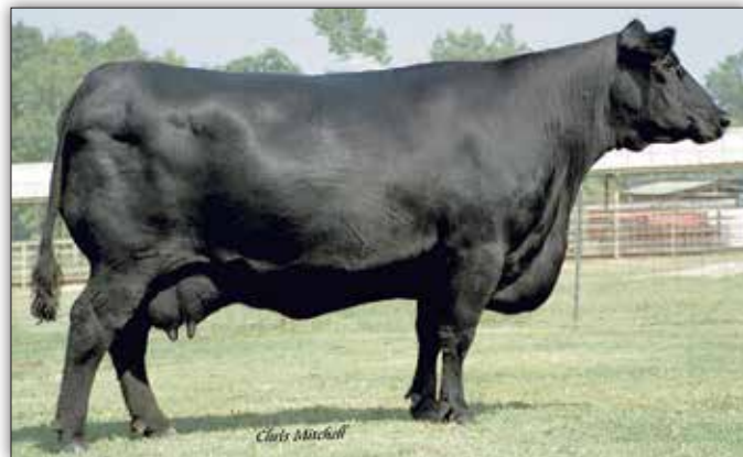
SVF Forever Lady 57D – Her influence sells.