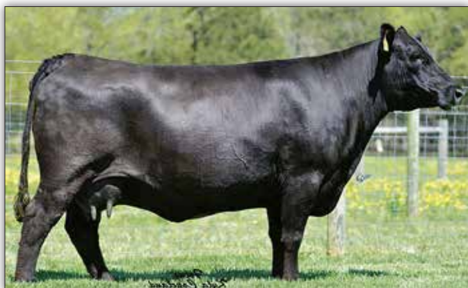
QUAKER HILL BLACKCAP 0A38 – The $150,000 full sister to the granddam of Lot 17.