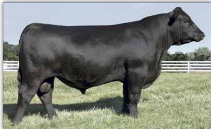
VAR Discovery 2240 – His influence sells.