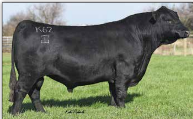
GAR Sure Fire – Sire of Lot 4.