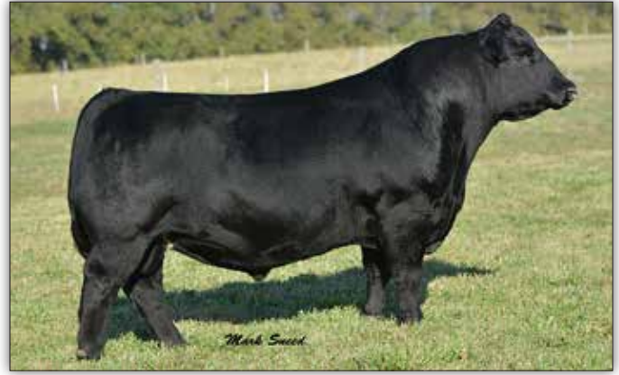
PVF INSIGHT 0129 – Sire of Lot 44.