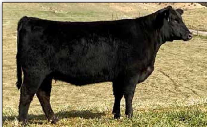
LAWSON LUCY G575 – She sells as Lot 29.