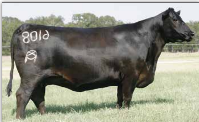
DRMCTR 111 RITA 6108 – Granddam of Lots 2 and 4.