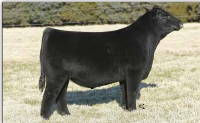
GCC NEW GAME 5654C – Sire of Lot 3.