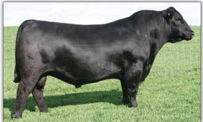
SAV BISMARCK 5682 – His influence sells.