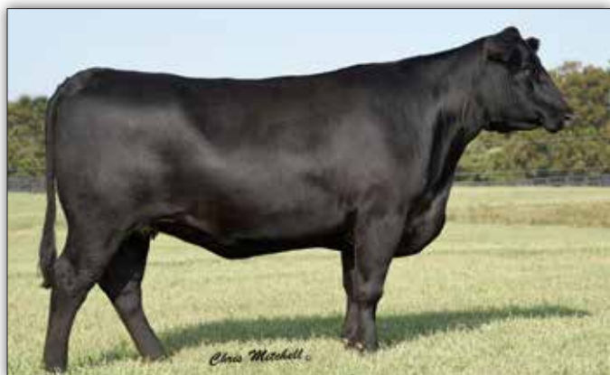
WILLIAMS PROP ERICA 255-139 – Full sister to the dam of Lot 14.