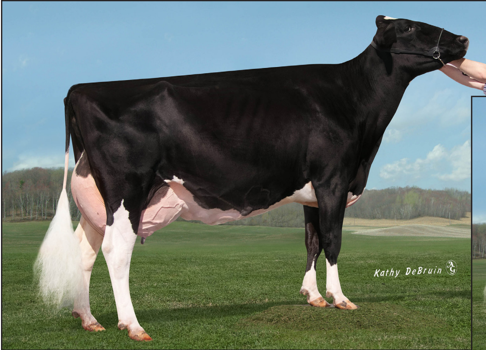
GLORYLAND-I GOLDWYN LOCKET-ET EX-94 2E DAM OF LOT H62