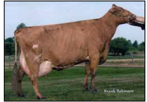
PALMYRA RAVEN S GINGER, VG-89 4-06 365D 35,760M 4.5% 1626F 2.9% 1052P GRANDDAM OF LOT 26