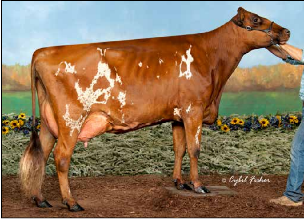
HOMESTEAD ACRES BURDETTE JACKI, EX-90 4-07 261D 16,330M 4.5% 737F 3.5% 573P DAM OF LOT 15