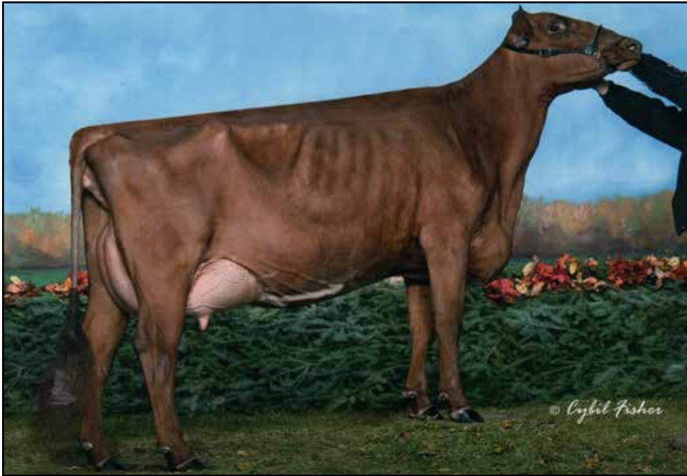
PALMYRA TRISTAR R GINGER-ET, EX-91 8-07 365D 23,590M 4.2% 998F 3.2% 745P UNAN ALL-AMERICAN SR 2-YEAR-OLD, 2009 DAM OF LOT 26