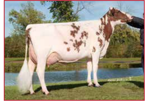
HAWVER-CREST SHIRLEY SUE NOM AA & HM JR AA SPRING CALF 2013 AA & UNAN JR AA SPRING YEARLING 2014 NOM AA & JR AA JR 2 YR OLD 2015 MATERNAL SISTER TO DAMS OF LOTS 38 & 39