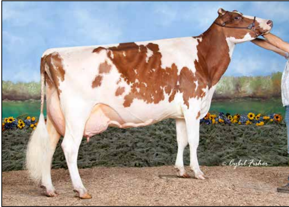
SUNNY-ACRES RATTLER'S KACIE, EX-94 3-11 349D 27,770M 4.2% 1168F 3.0% 846P 3X UNAN ALL-AMERICAN GREAT-GRANDDAM OF LOT 27