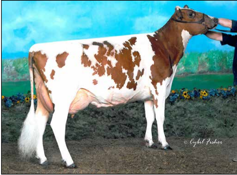
SUNNY-ACRES MASTER KENDRA, EX-93 3E 6-03 365D 31,540M 3.7% 1182F 3.0% 954P DAM OF LOT 9 & GREAT-GRANDDAM OF LOT 18