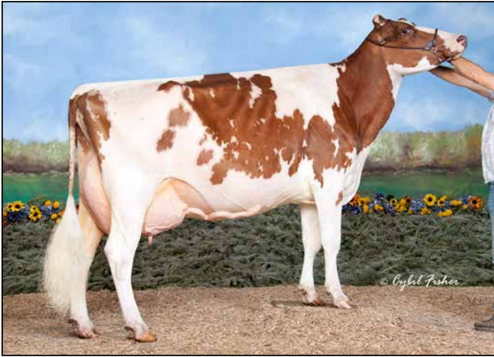
SUNNY-ACRES RATTLER'S KACIE, EX-94 3-11 349D 27,770M 4.2% 1168F 3.0% 846P 3X UNAN ALL-AMERICAN GRANDDAM OF LOT 8