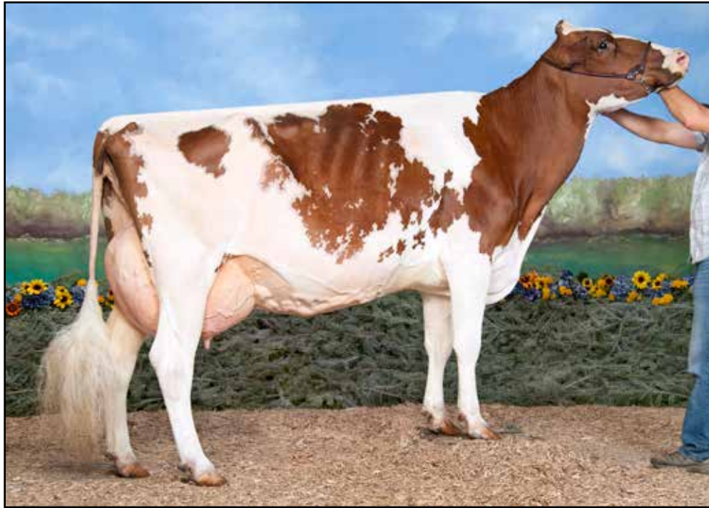
SUNNY-ACRES HARMONY'S KENNEDY, EX-94 4E 7-03 365D 32,310M 3.9% 1272F 2.9% 943 GREAT-GRANDDAM OF LOT 29