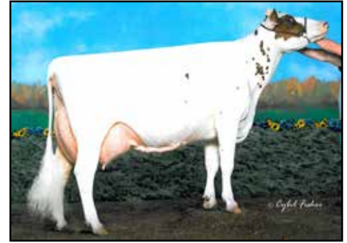
STILLMORE BBK KLASSY, EX-94 2E 6-09 365D 28,550M 3.8% 1078F 3.5% 1001P 4X RES ALL-AMERICAN GREAT-GRANDDAM OF LOT 8