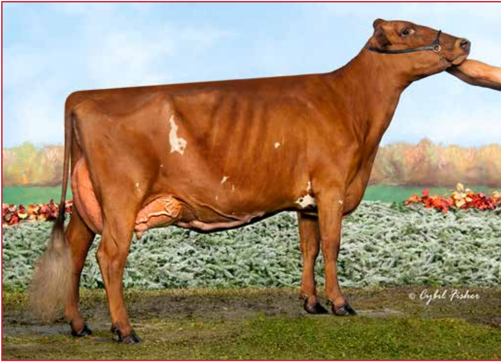
HAWVERCREST ETGEN SIZZLE, EX-91 3X HM ALL-AMERICAN 2017, 2018, 2019 MATERNAL SISTER TO DAMS OF LOTS 38 & 39