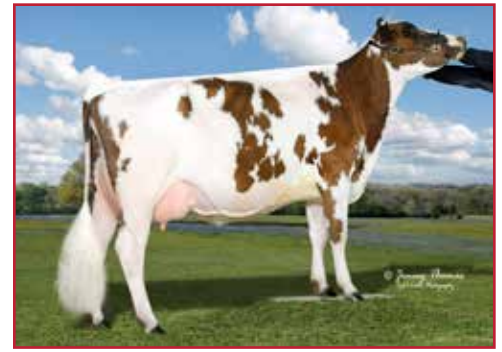
GEMINAECHO REMINGTON SHELLIE EX-91 2E GRANDDAM OF LOTS 38 & 39