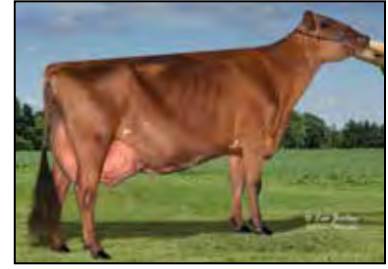
MARILIE GENTLEMAN KARMINA EX-93 DAM OF LOT 49

"Karmina is due in March for the 2021 show season"