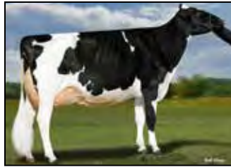
IDEE DOORMAN LYSA EX-94 EEEEE MAX DAM OF LOT 7

Four Female Pregnancies Due: March 2021 Guarantee Two