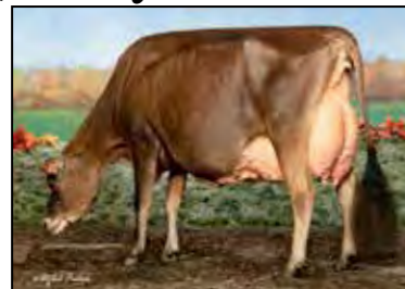
SCHULTE BROS TEQUILA SHOT-ET EX-94 DAM OF LOT 30