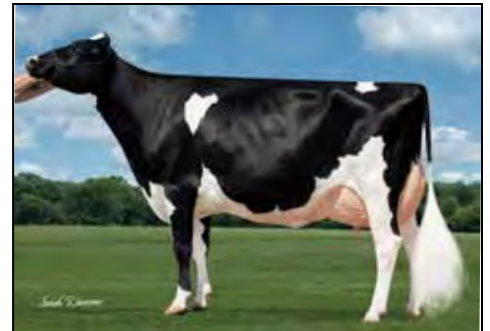
COMESTAR LARION GOLDWYN EX-95 DAM OF LOT 38