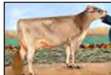
ROUND HILL TALANT WILONA ET VG-88 MATERNAL SISTER TO LOT 25