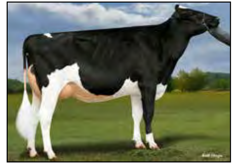
S-S-I DOC HAVE NOT 8784-ET VG-89 EX-MS DAM OF LOT 16

Guarantee Two to choose from Due: September 2021