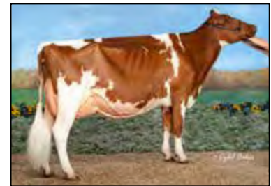
MS D APPLE DANIELLE-RED-ET EX-95 2E DAM OF LOT 46

69822207 Excellent-95 EX-MS 2E 6-05 2x 365d 35150 4.8 1700 3.2 1113 3-08 2x 365d 32780 3.9 1277 3.3 1084 • 3rd 125,000lb Cow Grand Int'l R&W 2019 • Nom All-American R&W 4-Yr-Old 2015 • Grand Champ All-American R&W Show 2014 & 2015 • Grand Champ NY Spring R&W 2015 • HM All-American R&W Sr 3-Yr-Old 2014 • 3rd Sr 3-Yr-Old Grand Int'l R&W 2014 • Nasco Type & Production Winner 2014 • Nom All-American R&W Sr 2-Yr-Old 2013