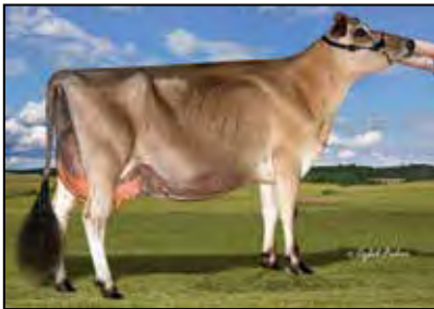
TRIPLE-T-CF SPECIAL GETAWAY-ET EX-90 DAM OF LOT 35

Three Female Pregnancies Due: March, 2021