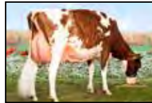
CHERRY-LOR LADD RIPPLE-RED EX-93 EEEEE 2ND DAM OF LOT 61

CAEL HEMBURY & MATTHEW BOOP C/O HEART & SOUL HOLSTEINS 1070 RANCK ROAD MILLMONT, PA 17845 570-713-4567 HEARTSOULBOOP@GMAIL.COM