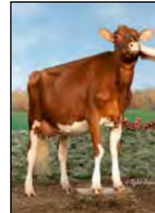
MS DB INFINITY-RED DAM OF LOT 44 & MATERNAL SISTER TO LOT 43

144698165 99%RHA-I 1-10 2x 80d 5845 3.7 214 2.8 158 RIP • 1st Milking Yrlg North American Open 2020 • Res All-American R&W Fall Calf 2019 • 1st Fall Calf & Res Jr Champ Eastern Fall Nat'l 2019 • 2nd Fall Calf Grand Int'l R&W Show 2019 "She will be scored on December 22, 2020, Guarantee VG or 100% Full Refund"