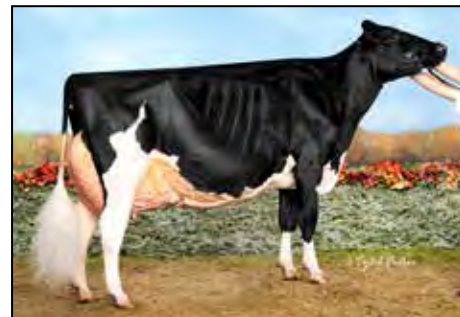
ROSIER BLEXY GOLDWYN-ET EX-97 EEEEE 3E DAM OF LOTS 4 & 4A