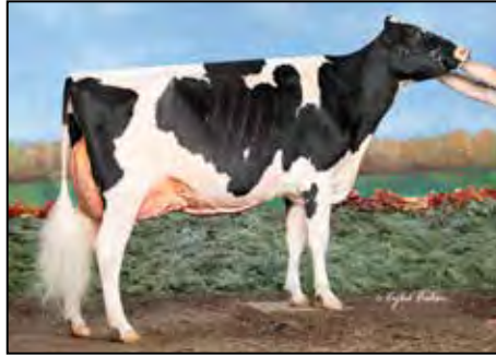
MS SID BLEXY-ET EX-92 DAM OF LOT 5