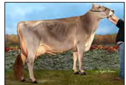
TOP ACRES GARBO WANDA ET EX-91 DAM OF LOT 25