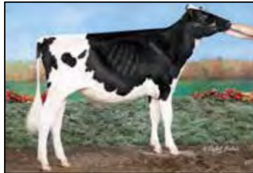
BUDJON-VAIL AVALANC EEVIE FULL SISTER TO LOT 42