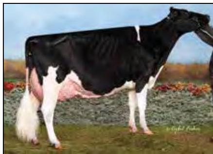
MS ATWOOD MADISON-ET EX-93-CAN 95-MS DAM OF LOT 14

JAMIE BLACK & ADAM LIDDLE C/O JAMIE BLACK 15 APT B VICTORIAN DRIVE BATAVIA, NY 14020 518-353-2602 BLACKSTAR1978@ICLOUD.COM ADAM LIDDLE 518-361-9946