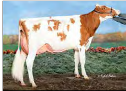
HILROSE AVALANCHE ADEL FULL/MATERNAL SISTER TO LOT 19