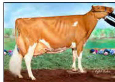
ROSEDALE LUCKY-ROSE-RED EX-94 EEEEE 2E DAM OF LOT 54

70890883 Excellent-94 EEEEE 2E *TL *TD 3-07 2x 365d 38090 4.5 1716 3.1 1175 4-11 2x 276d 29490 3.4 1014 2.9 859 2-01 2x 365d 23880 4.3 1034 3.2 770 Life: 1134d 100470 4.2 4176 3.1 3131 • 7X Nom. All-American R&W • Res All-American R&W Aged Cow 2018