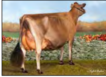
BIG GUNS JAMAICA VANILLA EX-95 DAM OF LOT 28 & 2ND DAM OF LOT 29