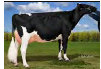
BUDJON-JK GCHIP ELLEN-ET EX-91 EX-MS DAM OF LOT 42