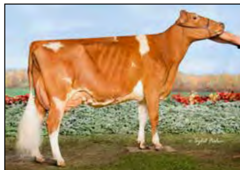
KNAPPS SPIDER BANK ON ME-ET VG-89 DAM OF LOT 48

Three Female Pregnancies Due: March 2021