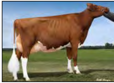
KHW REGMENT APPLE B-RED-ETN EX-90 DAM OF LOT 45

REGGIE & KRISTY KAMPS 22770 TRUMAN ROAD DARLINGTON, WI 53530 608-330-2007 KRISTY.KAMPS@GMAIL.COM