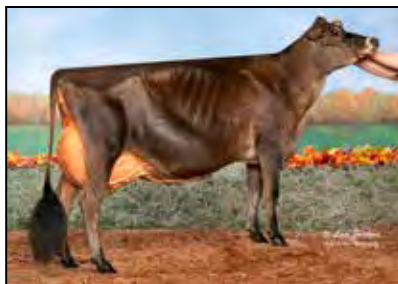
EDGELEA TEQUILA SHERATON EX-93 DAM OF LOT 31

"Projected to be the NEW #1 Genomic Type Female in Canada with December Proofs"