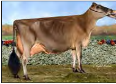
MISS TRIPLE T SERENITY EX-94 2ND DAM OF LOT 35