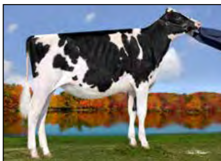
AOT AVALACHE HANGOVER-ET MATERNAL SISTER TO LOT 15