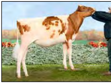
MILKSOURCE THUNDER-RED MATERNAL/FULL SISTER TO LOTS 18 & 18A