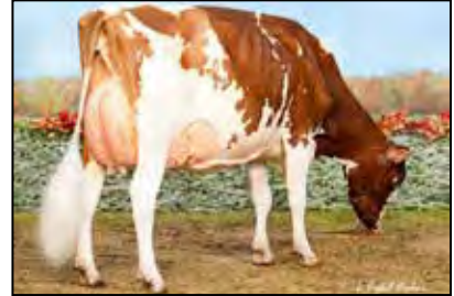
MS-AOL CNTNDR REVIVE-RED EX-94 MATERNAL SISTER TO LOT 21