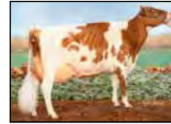
SUNNY-ACRES CA GINGER EX-94 2E DAM OF LOT 50