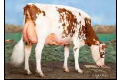
L-MAPLES DFNT CASSEY-RED-ET EX-90 EX-MS DAM OF LOT 60