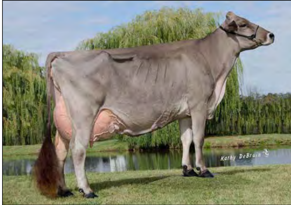
TOP ACRES SUPREME WIZARD-ET EX-95 3E DAM OF LOT 23