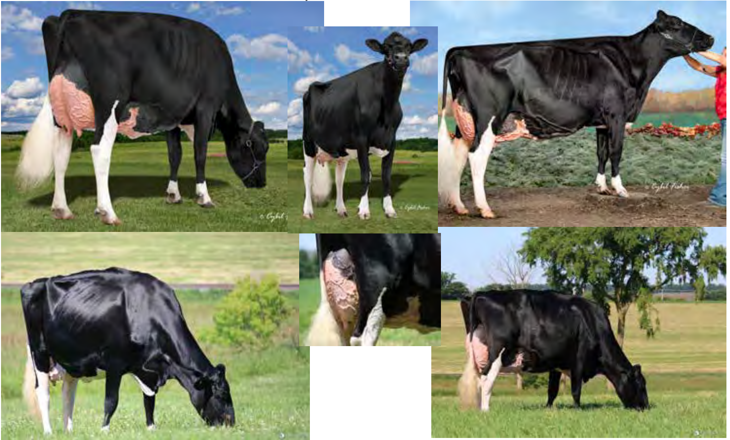
UNIQUE DEMPSEY CHEERS EX-95 96-MS DAM OF LOTS 68A, 68B, 68C & 68D