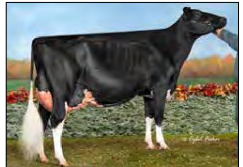
PORPO GOLDWYN BARBY-ET EX-94 EEEEE DAM OF LOT 6

106016750C Excellent-94 EEEEE *TL 7-05 2x 365d 36030 3.7 1339 3.2 1144 5-00 2x 365d 35200 3.8 1349 3.1 1094 3-08 2x 365d 33480 3.8 1264 3.4 1137 6-05 2x 320d 27660 3.5 979 3.2 894 2-04 2x 365d 25804 4.2 1084 3.3 839 Life: 2027d 174994 3.8 6626 3.3 5706 • 1st 5-Yr-Old/Res Grand Mideast Spring Nat'l 2015 • Grand/Sup Chbamp Mideast Spring Nat'l Jr 2015 • 3rd 5-Yr-Old Mideast Summer Nat'l 2015 • 3rd 4-Yr-Old Mideast Spring Nat'l 2014 • Nom All-American Sr 2-Yr-Old 2012 • Nom All-Canadian Sr 2-Yr-Old 2012