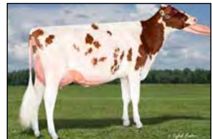
MILKSOURCE ATTICA-RED VG-89 EX-MS DAM OF LOT 22