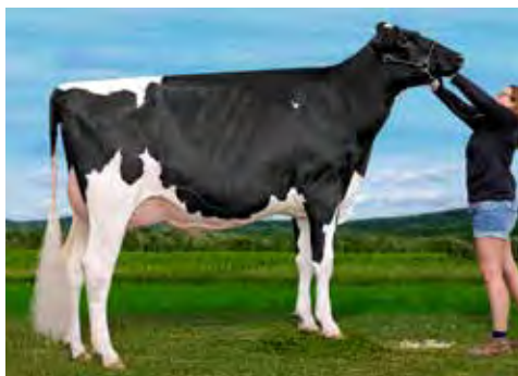
GREENPINE EMILO CHAMPAIGN VG-85 @ 2YRS MATERNAL SISTER TO LOTS 68A, 68B, 68C & 68D