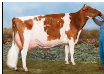
LUCK-E ADVENT KANDIE-RED EX-95 EX-MS 2E DAM OF LOT 40

• Grand Champ 3-Yr-Old II State Show 2008