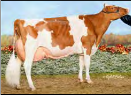
HILROSE ADVENT ANNA-RED-ET EX-94 EEEEE 3E GMD DAM OF LOT 19