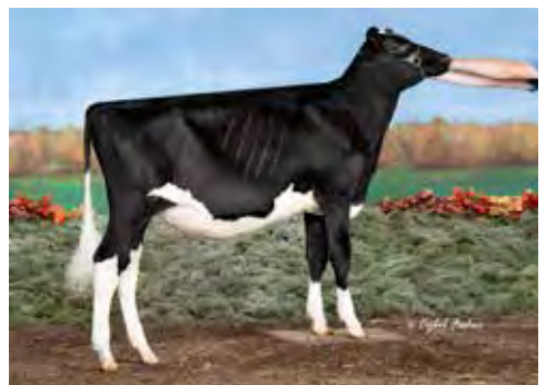
CHEERS AVALANCHE CHARLEY FULL SISTER TO LOTS 67C & 67D MATERNAL SISTER TO LOTS 67A & 67B