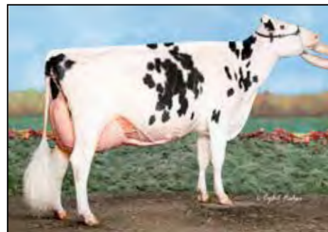
GLEANN BRADY PRIVATEER EX-94 EEEEE DAM OF LOT 65

12148969 Excellent-94 EEEEE 3-07 2x 330d 28699 3.3 944 3.2 908 2-04 2x 365d 27608 4.1 1122 3.0 832 • 5th 5-Yr-Old North American Open 2020 • 1st 4-Yr-Old/Grand Champ Mid-East Fall Nat'l 2019 • 7th 4-Yr-Old Int'l Holstein Show 2019 • Supreme Champ KY State Fair 2019 • Nom All-Canadian Sr 3-Yr-Old 2018 • 4th Sr 3-Yr-Old Royal 2018 • 1st Sr 3-Yr-Old/Int & Grand Champ Atlantic Summer Show 2018