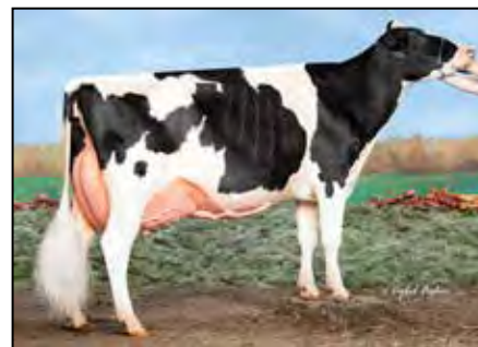
PLEASANT NOOK DOORMAN MADISON SELLS AS LOT 14