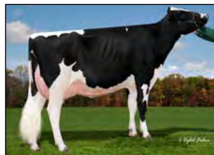
COOKIECUTTER DTA HABITAN-ET VG-89 EX-MS DOM DAM OF LOT 15