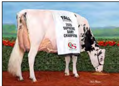
ERBACRES SNAPPLE SHAKIRA-ET EX-95-CAN 95-MS DAM OF LOT 1