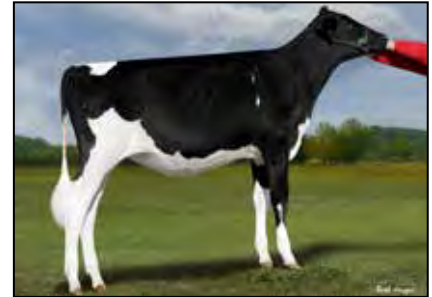
CAL-DENIER-I GLDWN ELLIS-ET SELLS AS LOT 41 CHOICE 2