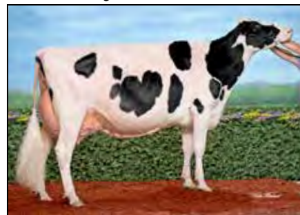
WALNUTLAWN MCCUTCHEN SUMMER-ET EX-94-CAN 96-MS