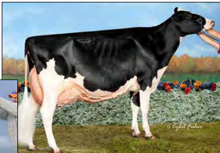
BLONDIN GOLDWYN SUBLIMINAL-ETS EX-96 EEEEE 3E DAM OF LOT 64