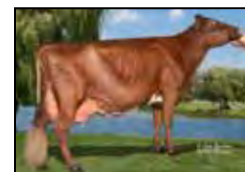
HARD CORE ORAELY ET EX-95 3E DAM OF LOT 53