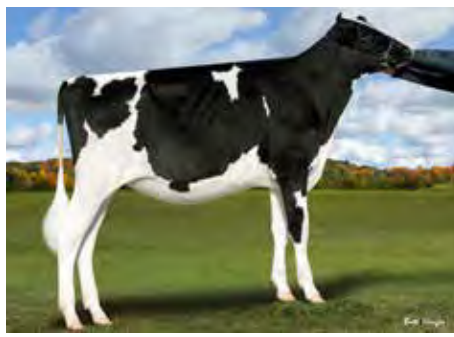
CHEERS SDKCK CHEAPTRICK-ET MATERNAL SISTER TO LOTS 68A, 68B, 68C & 68D