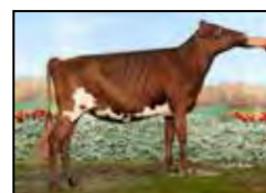
HARD CORE JUSTICE ROZLY FULL SISTER TO LOT 53

68311035 7/11 3E-95 E95 E96 E94 E93 E95 (11/19) 4-02 2x 365d 23610 3.7 863 3.2 763 7-06 2x 365d 20640 3.9 806 3.3 680 5-06 2x 305d 20240 4.1 820 3.3 659 6-06 2x 317d 18470 3.9 712 3.3 612 3-03 2x 313d 16900 4.1 698 3.3 553 2-04 2x 280d 13290 4.1 548 3.2 429 LTD: 1988d 115110 3.9 4528 3.3 3763 • HM All-American Lifetime Merit 2019 • HM All-American Age Cow 2018 • Res All-American 5-Yr-Old 2017 • HM All-American 4-Yr-Old 2016 • Nom All-American Sr 3-Yr-Old 2015