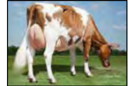
SUNNY-ACRES WOODROW'S GINNY EX-90 MATERNAL SISTER TO LOT 50