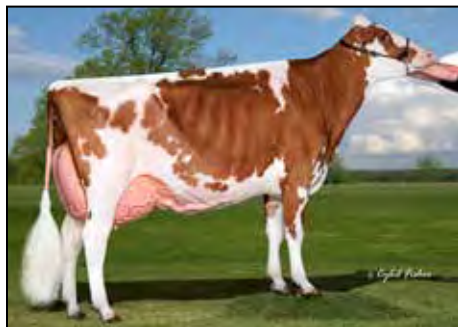
MISS APPLE SNAPPLE-RED EX-96 2ND DAM OF LOT 1 & DAM OF LOT 2