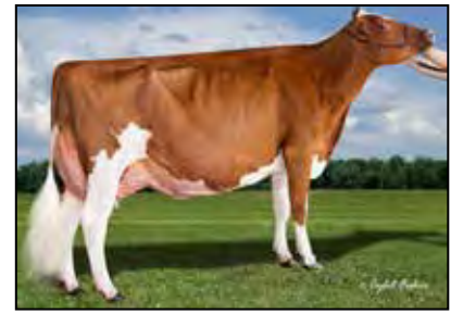
STRANS-JEN-D TEQUILA-RED-ET EX-96 EEEEE 2E DAM OF LOTS 18 & 18A