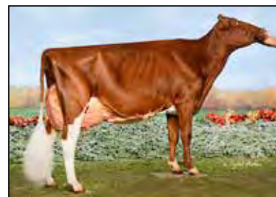
MS APPLE ARIA-ET EX-95 EEEEE 2E DAM OF LOT 63

72506370 Excellent-95 EEEEE 2E *TL 6-00 2x 365d 41490 3.8 1562 3.4 1426 4-09 2x 365d 37450 3.5 1293 3.5 1313 3-08 2x 327d 31870 4.1 1321 3.5 1121 Life: 1106d 114730 3.8 4375 3.5 4026 • 1st Aged Cow Grand Int'l R&W Show 2019 • Nom All-American 5-Yr-Old 2018 • 1st 5-Yr-Old Western Fall Nat'l B&W 2018 • 1st 5-Yr-Old Western Spring Nat'l B&W 2018