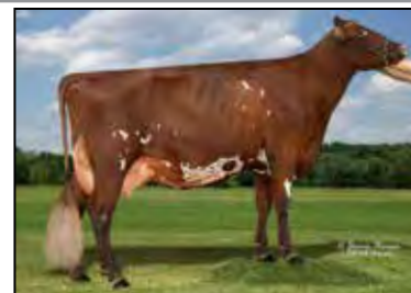
EICHLERS MD BLANCHE ET EX-90 DAM OF LOT 52 CHOICE 2

840003124891972 06/03 E93 E94 E93 E93 E93 (6/20) 3-05 2x 365d 28145 3.9 1097 3.2 905 2-03 2x 347d 23704 3.8 898 3.1 726 5-02 2x 132d 12496 3.4 419 2.8 351 RIP • 1st Aged Cow OH Summer Show 2020 • 1st 5-Yr-Old/Grand Champ WDE 2019 • All-American Jr 3-Yr-Old 2017 • Grand Champ WDE 2017 • Res All-American Jr 2-Yr-Old 2016