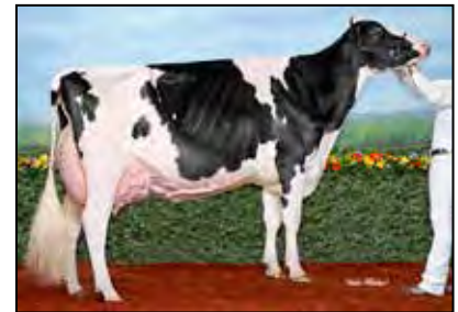
PIERSTEIN WINDBROOK ALACAZAM EX-94-CAN 94-MS SELLS AS LOT 13