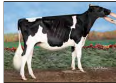
BLEXYS CRUSH BUDWEISER-ET DAM OF LOT 3