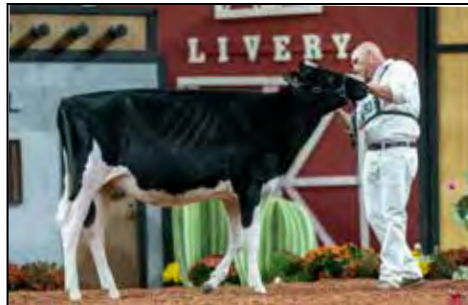
SUN-MADE CRAVE DRN DIANE VG-86-CAN MATERNAL SISTER TO LOT 38