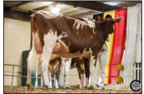
KAMPS-RX APPLEB ADDI-RED-ET MATERNAL SISTER TO LOT 45