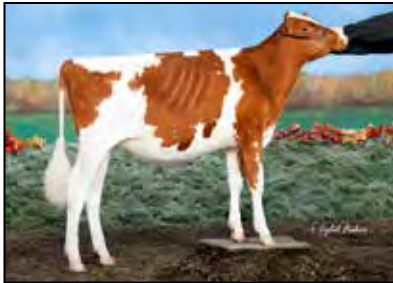
MS-AOL RELIVE-RED-ET SELLS AS LOT 21

• Nom All-American R&W Milking Yrlg 2018