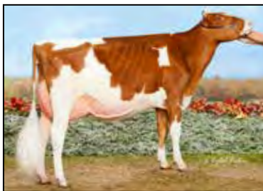
WILLOWS-EDGE REAL MINK-RED-RED EX-92

• 1st Spring Yrlg Midwest Fall Nat'l Show 2019