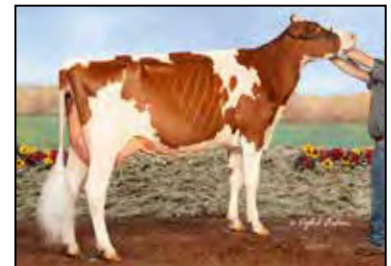
CHERRY-LOR AWE RIPPY-RED-ET EX-91 EX-MS DAM OF LOT 61 CHOICE 1

840003143928795 99%RHA-I EX-91 EEEEE 2-00 2x 290d 17807 4.3 768 3.3 588 • Res All-American Summer Jr 2-Yr-Old 2019 • Res Jr All-American Summer Jr 2-Yr-Old 2019 • 1st Jr 2-Yr-Old/Int Champ Eastern Nat'l R&W 2019 • 2nd Jr 2-Yr-Old Grand Int'l R&W 2019 • Rippy & Robin members of HM All-American Best Three Females, All-American Produce of Dam & Dam & Daughter Class Grand Int'l R&W