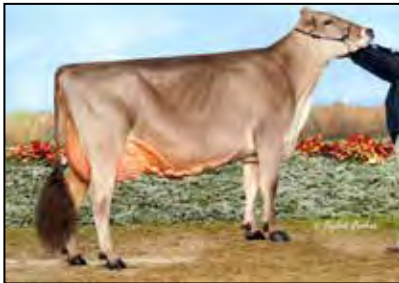
TOP ACRES GARBRO S WISH ET EX-93 2ND DAM OF LOT 24

"These will be the first heifer calves out of Waltz to hit the ground. She's had two natural bull calves so far and no ET/IVF calves born until choice is made"