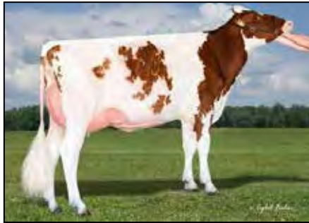
HILROSE AVALNCH ADDY-RED-ET FULL/MATERNAL SISTER TO LOT 19