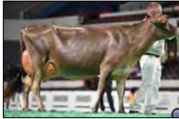
RAFFLIFF IRWIN VANCY-ET MATERNAL SISTER TO LOT 37