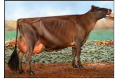
ARETHUSA TEQUILA VISION EX-95 DAM OF LOT 37

117341902 Excellent-95% 7-07 2x 305d 24130 5.6 1344 3.8 912 6-04 2x 305d 20110 5.8 1163 3.7 749 4-03 2x 305d 18230 5.3 974 3.6 662 3-03 2x 290d 16400 4.4 726 3.5 566 8-11 2x 305d 15890 5.6 895 4.2 674 2-04 2x 305d 13660 5.1 690 3.7 504 • 1st Production Cow WDE 2018 • 1st Aged Cow/Sr & Grand Champ IL 2018 • 1st Aged Cow Oklahoma Spring Jersey Show 2018 • 4th Aged Cow WDE 2016 • 5-Yr-Old Reserve All American 2015 • 4-Yr-Old Reserve All American 2014 • Res Sr Champion All American