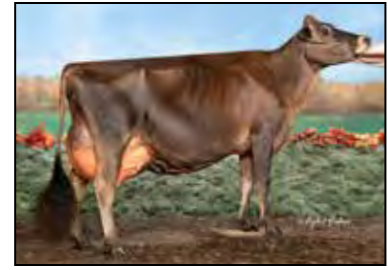
STONEY POINT IMPRESSION BLENDA EX-95 DAM OF LOT 32

118783228 Excellent-95% 2-11 2x 305d 16630 5.9 982 4.0 667 4-00 2x 305d 15000 5.7 861 4.2 631 2-00 2x 281d 10130 6.2 630 4.1 417 6-07 2x 186d 13690 4.4 602 3.7 515 RJP • 1st Aged Cow/Grand Champ Jersey Event 2020 • 1st Aged Cow North American Jersey 2020 • 1st Aged Cow All-American Jersey Show 2020 • Res All-American 5-Yr-Old 2019 • 2nd 5-Yr-Old WDE 2019