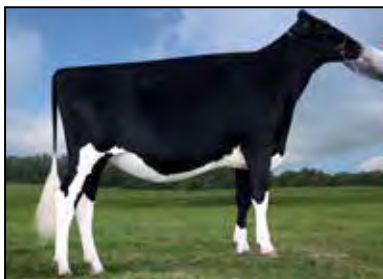
MISS CRUSH ARIANNA-ET SELLS AS LOT 63

Bred: October 5, 2020 to Peak Hotline-ET 97H041774