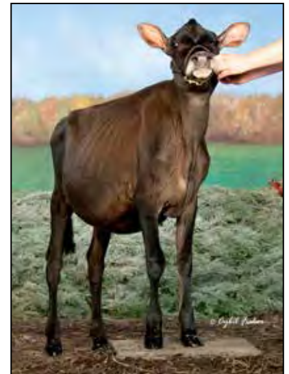
REDHOT VICTORY PARADE SELLS AS LOT 27

17255582 Excellent-90% 2-00 2x 325d 18930 5.7 1082 4.0 766