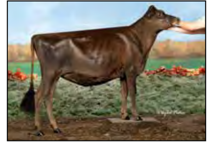
BIG GUNS ANDREAS VELVET-ET SELLS AS LOT 28

67005009 Excellent-95% 8-09 2x 365d 23516 5.1 1216 3.5 827 5-03 2x 305d 22215 4.5 1000 3.6 800 • ABA All-American Aged Cow 2016 • All-American Aged Cow 2016 • 1st Mature Cow/BU & HM Sr Champ WDE 2016 • 1st Mature Cow/BU/BBO/HM Sr Champ NAILE 2016 • 1st Mature Cow/BU/BBO/HM Sr Champ NYSS 2016 • 1st Mature Cow & BU OH Spring Show 2016 • Grand Champion, NY Spring Show 2013 • ABA HHM All-American Aged Cow 2013 • Grand Champion, WDE Junior Show 2012 • Res Sr Champion, Royal Winter Fair 2012 • All-Canadian 5-Yr-Old 2012