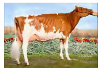
FLOWER-BROOK CORAL-RED-ET EX-92 DAM OF LOT 56

3135936121 99%RHA-I Excellent-93 94-MS 2-08 2x 310d 28163 3.7 1038 3.1 869 • 3rd Sr 3-Yr-Old North American Open Show 2020 • 2nd Sr 2-Yr-Old Grand Int'l R&W Show 2019 • HM Int Cabmp Grand Int'l R&W Show 2019 • 1st Sr 2-Yr-Old WI Champ R&W 2019 • Res All-American R&W Milking Yrlg 2018 • Res Jr All-American R&W Milking Yrlg 2018