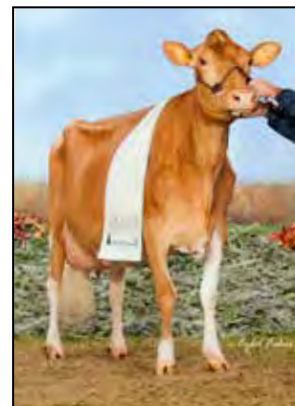
SPRINGHILL MENTOR JAZZY-ET EX-95 DAM OF LOT 47