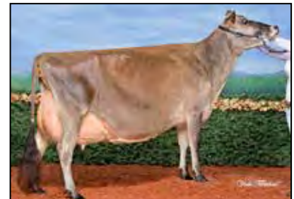
VANDEMBERG AMEDEO GORGEOUS EX-94 3E 2ND DAM OF LOT 36