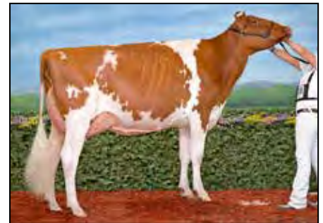
WEEBERLAC TICKLE ME RED VG-89-CAN 91-MS DAM OF LOT 17