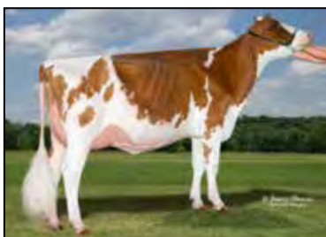
MD-HILLBROOK INSTAGRAM-RED VG-88 MATERNAL SISTER TO LOT 43