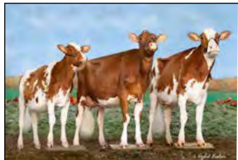
SISTERS TO LOT 43 & DAM AND SAME FAMILY AS LOT 44 L TO R ... INDABLUE-RED, INFINITY-RED, INSTAGRAM-RED