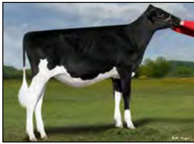
CAL-DENIER-I GLDWN ELLIE-ET SELLS AS LOT 41 CHOICE 1