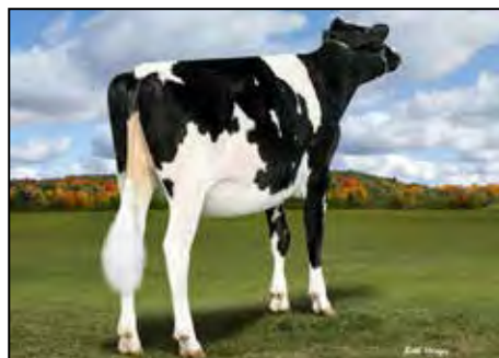
MILKSOURCE STORM SIREN-ET SELLS AS LOT 2