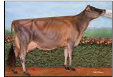
ESPERANZA GA VIVIAN EX-93 DAM OF LOTS 33 & 34