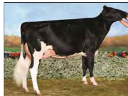
DUCKETT G CHIP TOKYO-ET EX-93 EEEEE DAM OF LOT 60

Duckett FBI Twizzler EX-94 3E 6-07 2x 365d 34230 3.4 1150 3.2 1079