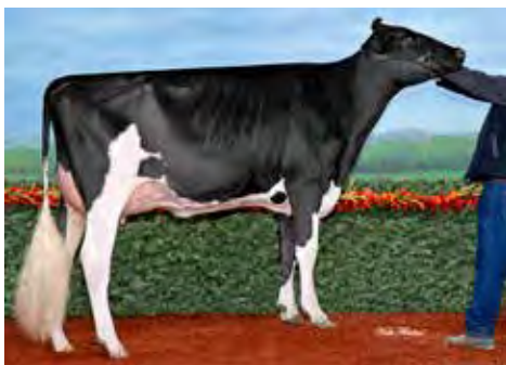
BLONDIN UNSTOPABULL CHEERS MATERNAL SISTER TO LOTS 68A, 68B, 68C & 68D