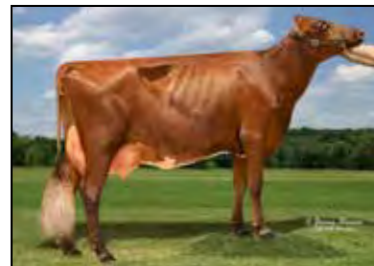
ELITE HP FIREDANCER VG-88 DAM OF LOT 52 CHOICE 1

840003128124784 3/00 V88 V86 E91 +80 E92 V87 (06/20) 1-11 2x 304d 19164 3.7 713 2.9 557 2-11 2x 155d 12154 3.6 440 2.8 338 • 1st Jr 3-Yr-Old/Int Champ OH Summer Show 2020 • 2nd Summer Yrlg Eastern Nat'l 2018