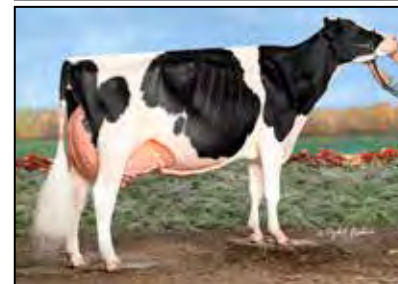
K-LAND KILO BLACK DIAMOND EX-94 EX-MS DAM OF LOT 11