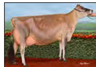
EDGELEA GENTRY SHARON VG-89 MATERNAL SISTER TO LOT 31