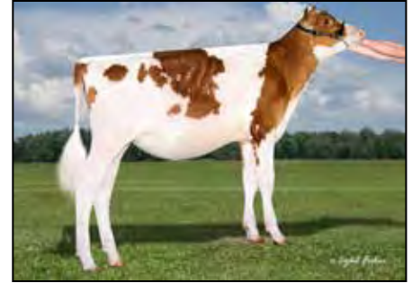
HILROSE ALTITUDE AUDI MATERNAL SISTER TO LOT 19