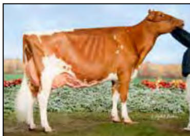
MS BARB ACT BEAUTY-RED-ET EX-94 EEEEE DAM OF LOT 55