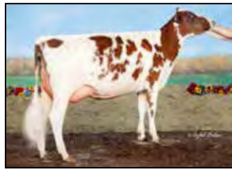
BELLEROUTE BARREL AIMO-ET DAM OF LOT 51

Guarantee Two Females or 100% Satisfaction with One