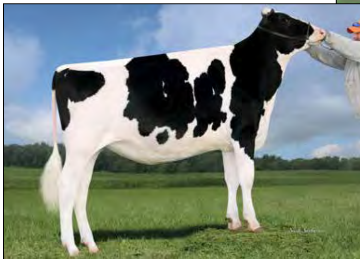
BUDJON-VAIL SCREEN SHOT-ET SELLS AS LOT 64