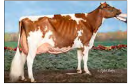
WIL-O-MAR DIAMNDBK ROSE-RED EX-92 EEEEE DAM OF LOT 20