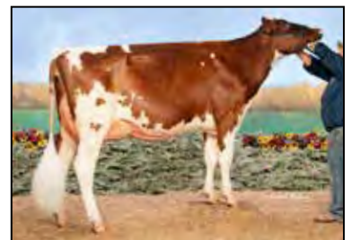
CHERRY-LOR DBK ROBIN-RED-ET EX-91 EEEEE DAM OF LOT 61 CHOICE 2