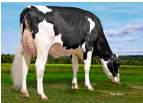
BLONDIN UNSTOPABULL CHERIOS VG-85 @ 2YRS MATERNAL SISTER TO LOTS 68A, 68B, 68C & 68D