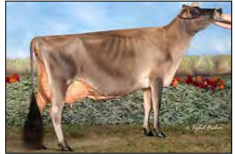
ARETHUSA VERONICAS COMET-ET EX-95 DAM OF LOT 26

• Nom ABA All-American Aged Cow 2013 • Unanimous All-American 5-Yr-Old 2011 • Res ABA All-American 4-Yr-Old 2010 • All-Canadian 4-Yr-Old 2010 • All-Canadian Sr 3-Yr-Old 2009