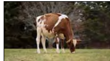
MS STOP MINKSTER-RED-ET SELLS AS LOT 62

840003126460108 Excellent-92 EX-MS 3-07 2x 365d 30155 5.5 1656 3.4 1029 2-03 2x 365d 29639 5.2 1533 3.3 1005 • All-WI R&W Sr 2-Yr-Old 2017 • 4th Sr 2-Yr-Old Grand Int'l R&W Show 2017 • Nom All-American Winter Yrlg 2016 • Um All-American R&W Winter Calf 2015 • 1st Winter Calf Grand Int'l R&W Show 2015