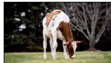
MS AWESOME MINKY-RED SELLS AS LOT 62