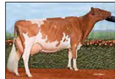
DE LA PLAINE PRIME ROCKY-ET EX-95-CAN 2E 2ND DAM OF LOT 51