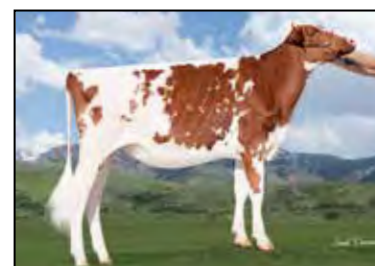
MS UNSTOPABUL BEAUTY-IN-RED MATERNAL SISTER TO LOT 55

840003125564023 Excellent-94 EEEEE *TC *TL 4-05 2x 348d 37190 3.8 1417 3.3 1217 3-06 2x 280d 28790 3.6 1025 3.2 933 5-07 2x 189d 21139 3.2 670 2.9 614 RIP • 4th 5-Yr-Old North American Open R&W 2020 • HM All-American R&W 4-Yr-Old 2019 • 3rd 4-Yr-Old Grand Int'l R&W Show 2019 • HM All-American R&W Sr 3-Yr-Old 2018