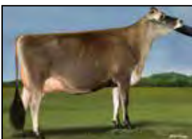
BIG GUNS TEQUILA VENOM-ET EX-90 DAM OF LOT 29 & MATERNAL SISTER TO LOT 28

840003142494167 Excellent-90% 2-00 3x 245d 10010 5.3 534 3.8 385 2-11 3x 230d 7990 5.3 425 3.6 289 R1P