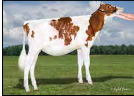
HILROSE ALTITUDE AERO MATERNAL SISTER TO LOT 19