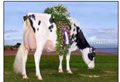
IDEE WINDBROOK LYNZI EX-95 2E MATERNAL SISTER TO LOT 8 & FULL SISTER TO LOT 9 2ND DAM OF LOT 7

Three Female Pregnancies Due: June 2021 Sire: Val-Bisson Doorman