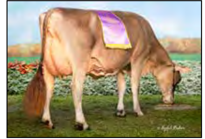
JENIAR CARTER WALTZ-ETV EX-91 DAM OF LOT 24