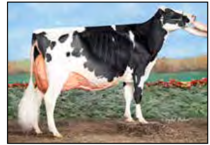
OAKFIELD SOLOM FOOTLOOSE-ET EX-92 MS-94 DAM OF LOT 12