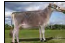
ROUND HILL CARTER WATSON ET VG-89 MATERNAL SISTER TO LOT 25