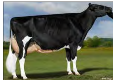
OAKFIELD GC DARBY-ET EX-95-CAN 95-MS DAM OF LOT 10