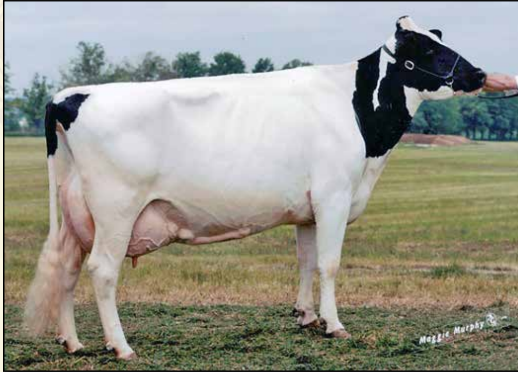
BROOKVIEW TONY CHARITY EX-97 3RD DAM OF LOT 29