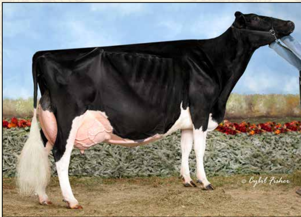
SAVAGE-LEIGH LEONA-ET EX-96 2E 2ND DAM OF LOT 18 Reserve All-American 125,000 Lb Cow 2012