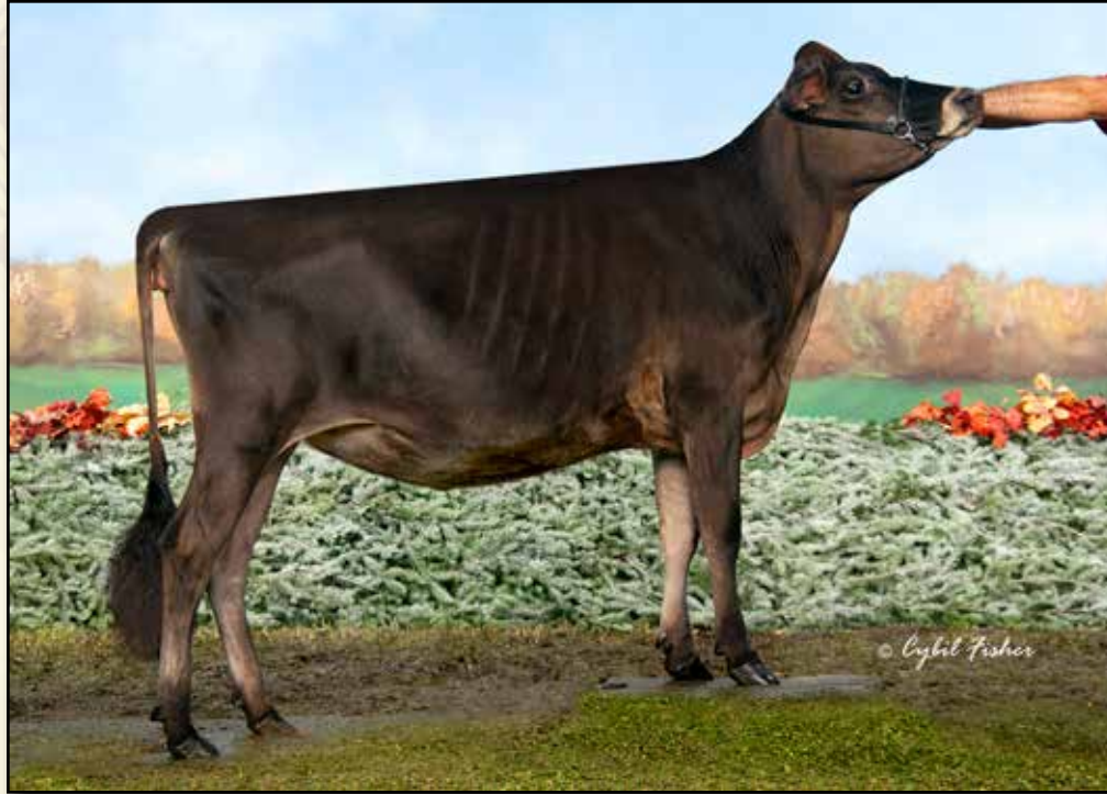
GLAMOURVIEW PREMIER SPADE SAME MATERNAL FAMILY AS LOT 59 AJCA All-American Winter Calf 2018