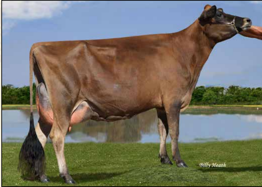
SVHEATHS COLTON MONIQUE EX-92% SAME FAMILY AS LOT 63

3X Top Ten in Milking Form, All American Show