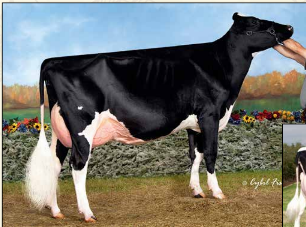
BVK ATWOOD ANDREA-ET EX-92 2ND DAM OF LOT 6