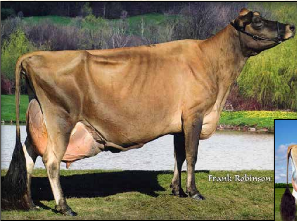
WAYMAR PATRICK NADINE EX-97-6E-CAN 3RD DAM OF LOT 41 4X All-Canadian in Milking Form