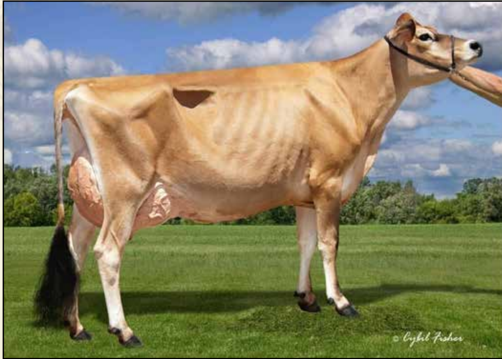
KEVETTA CHROME VIOLIN-ET VG-89% MATERNAL SISTER TO LOTS 39 & 40