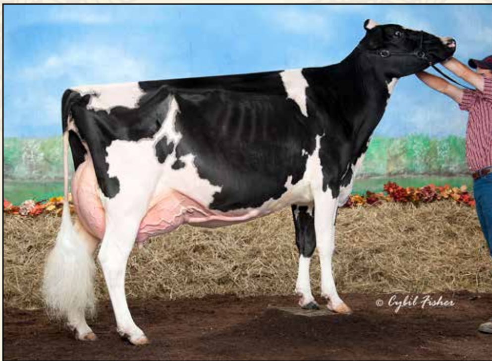
ARETHUSA GOLD VALENCIA-ET EX-95 3E 2ND DAM OF LOT 23