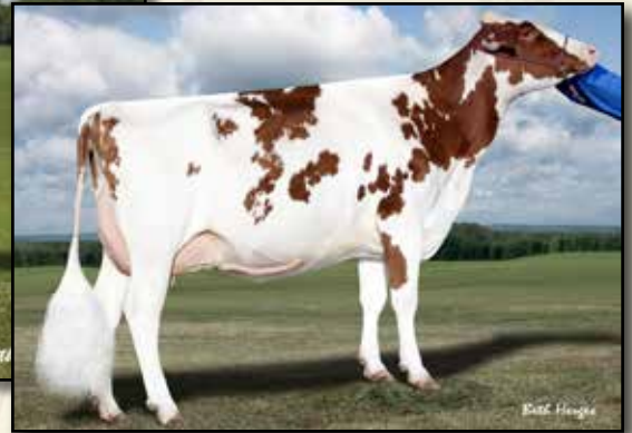
MERGOLD RL SHEAR-RED-ET EX-91 2ND DAM OF LOT 14