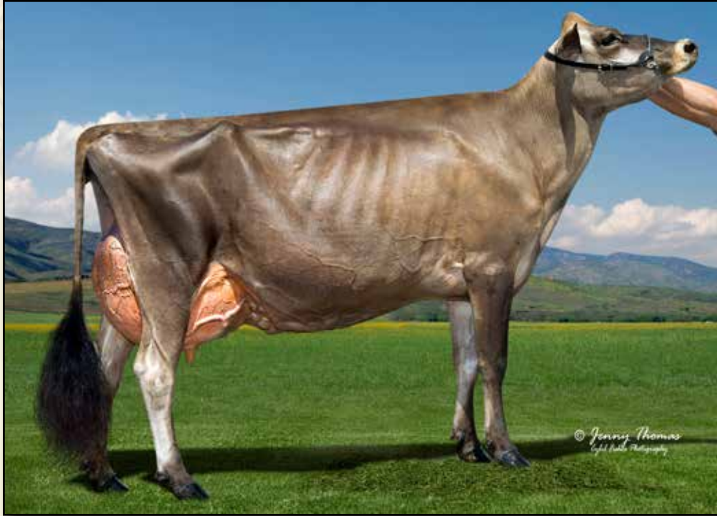
STONEY POINT IMPRESSION BLENDA EX-95% SAME FAMILY AS LOT 57 Grand Champion, The Jersey Event 2020