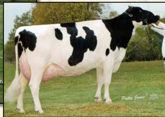
TRI-DAY ASHLYN-ET EX-96 2E 3RD DAM OF LOT 17 All-American 4-Year-Old 2001