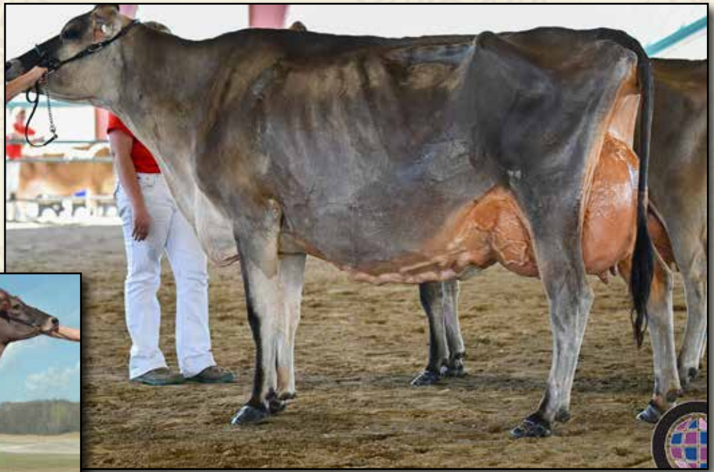
LYLESTANLEY TEQ HELLO DOLLY 3620-ET EX-93% DAM OF LOT 62

Grand Champion, OH Summer Junior Jersey Show 2020