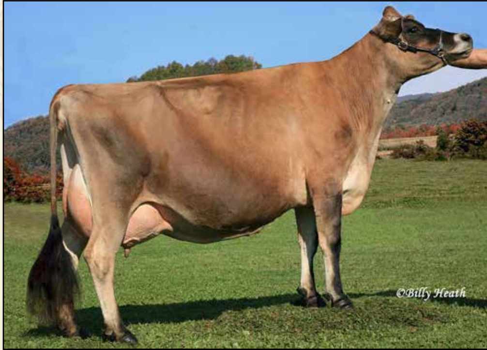
MID-DEL NATE MAMIE EX-94% 3RD DAM OF LOT 60