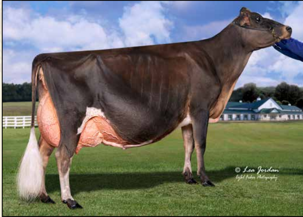
SV IMPRESSION HOLLY EX-94% MATERNAL SISTER TO 2ND DAM OF LOT 61 Grand Champion, WDE Junior Show 2018