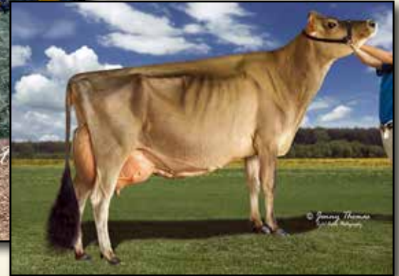
UNDERGROUND HAZELS HOLLY EX-93% 2ND DAM OF LOT 58 Reserve Grand Champion, NY State Fair 2014