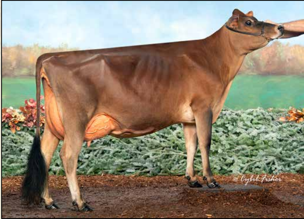
BILLINGS TEQUILA SERENA EX-91% SAME FAMILY AS LOTS 42 & 43