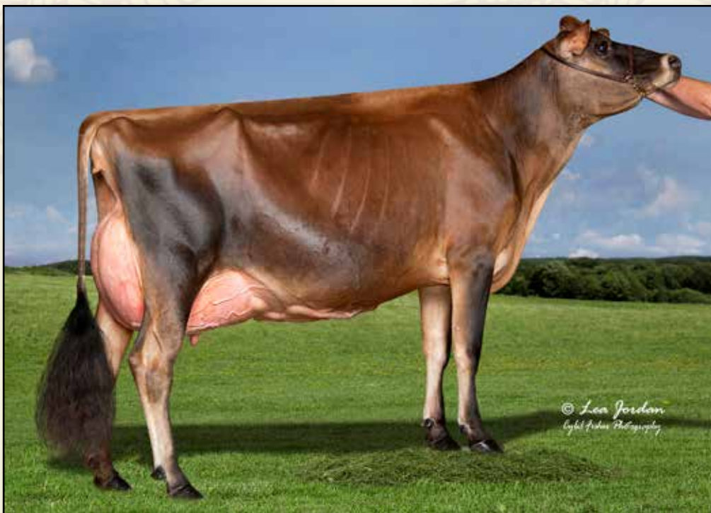
STONEY POINT BELMONT FASHION EX-94% MATERNAL SISTER TO DAM OF LOT 50 Grand Champion, New York SF 2017