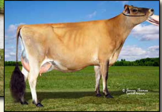
TOWNSIDE VIRTUOSO NADINE EX-93% DAM OF LOT 41