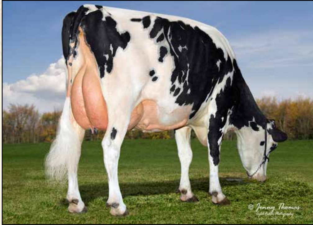
MS WABASH-WAY SUP ELLORA-ET EX-93 3E 2ND DAM OF LOT 27