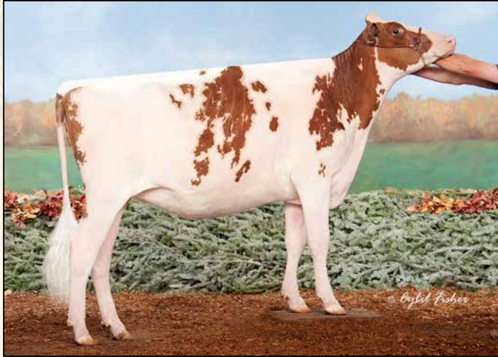
ENTOURAGE-LC FELICIA-RED-ET MATERNAL SISTER TO LOTS 11 & 12 All-American R&W Fall Yearling 2018