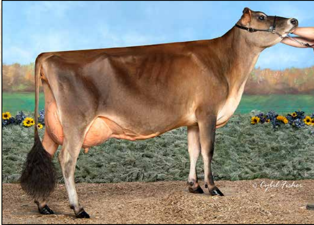
STEESHANIE IATOLA TINKERBELL EX-91% DAM OF LOT 53