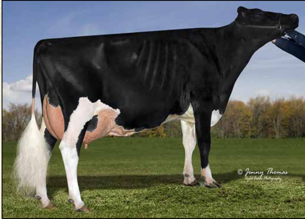
RIDGEDALE VALOUR EX-93 2E DAM OF LOT 9; 2ND DAM OF LOT 9 1/2