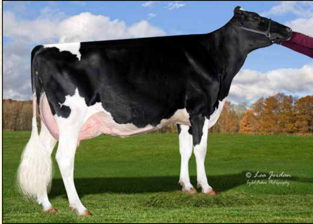
ASPIRATION LEXI EX-92 SAME MATERNAL FAMILY AS LOT 25 HM Grand Champion, O-H-M (NY) Holstein Show 2017