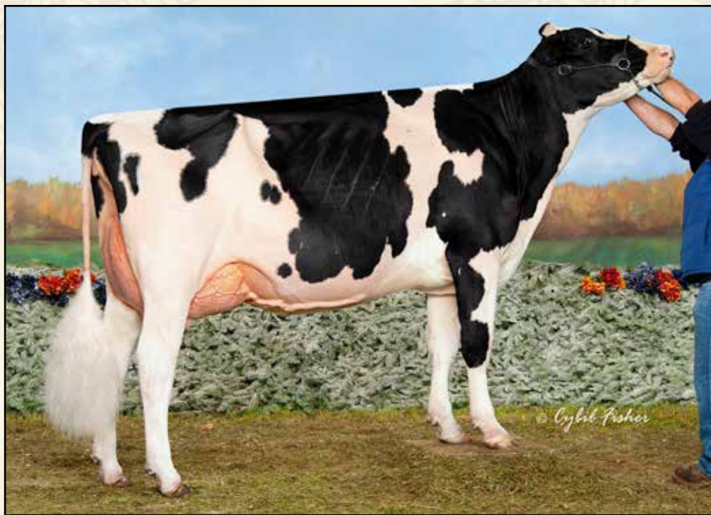
WENDON WINDBROOK MERCY-ET EX-93 DAM OF LOT 13