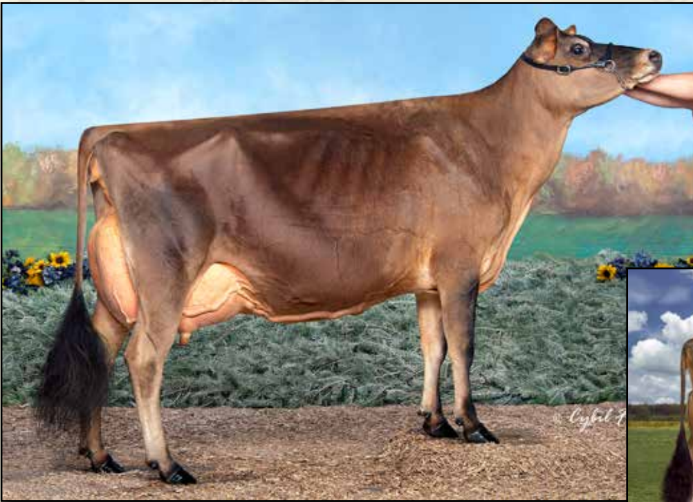
UNDERGROUND HOLLYS HOPE EX-94% MATERNAL SISTER TO DAM OF LOT 58 ABA Reserve All-American 4-Year-Old 2016