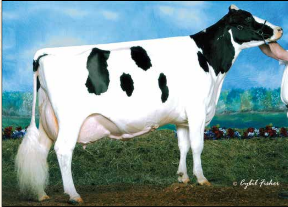
RIDGEDALE EMERA EX-95 5E 2ND DAM OF LOT 20