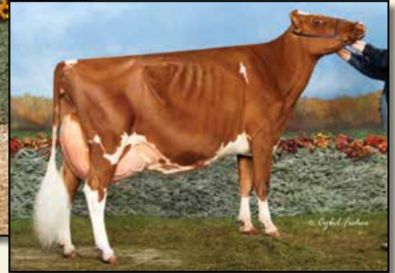
MS DELICIOUS APPLE-RED-ET EX-94 2E 2ND DAM OF LOT 2

Nominated All-American R&W 4-Year-Old 2015