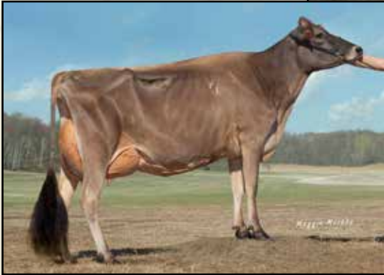
HUMMING BT FINALIST DOTTIE EX-94% 2ND DAM OF LOT 63

Grand Champion, OH Summer Junior Jersey Show 2020