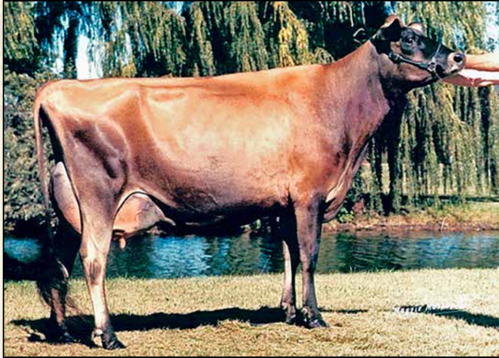
JASPAR RENAISSANCE'S EVENING EX-91-3E-CAN 3RD DAM OF LOT 44 All-Canadian Senior Three-Year-Old 1999