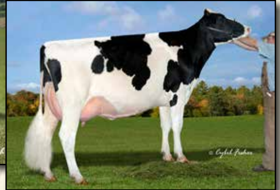
MAPLE-DOWNS-CC DU AMELIA-ET EX-92 2E 2ND DAM OF LOT 5