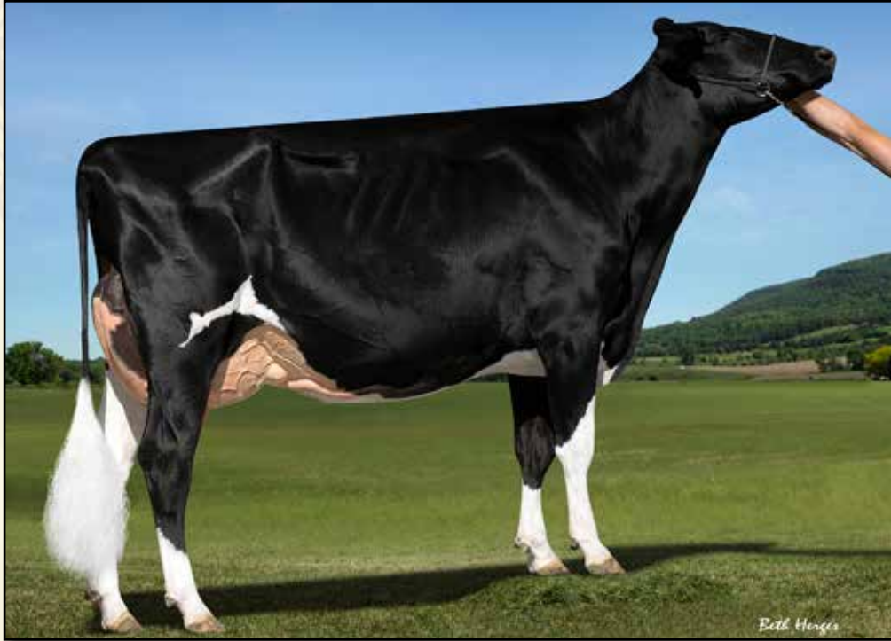
MAPLE-DOWNS-AL GCHIP GALINA EX-94 FULL SISTER TO DAM OF LOT 22