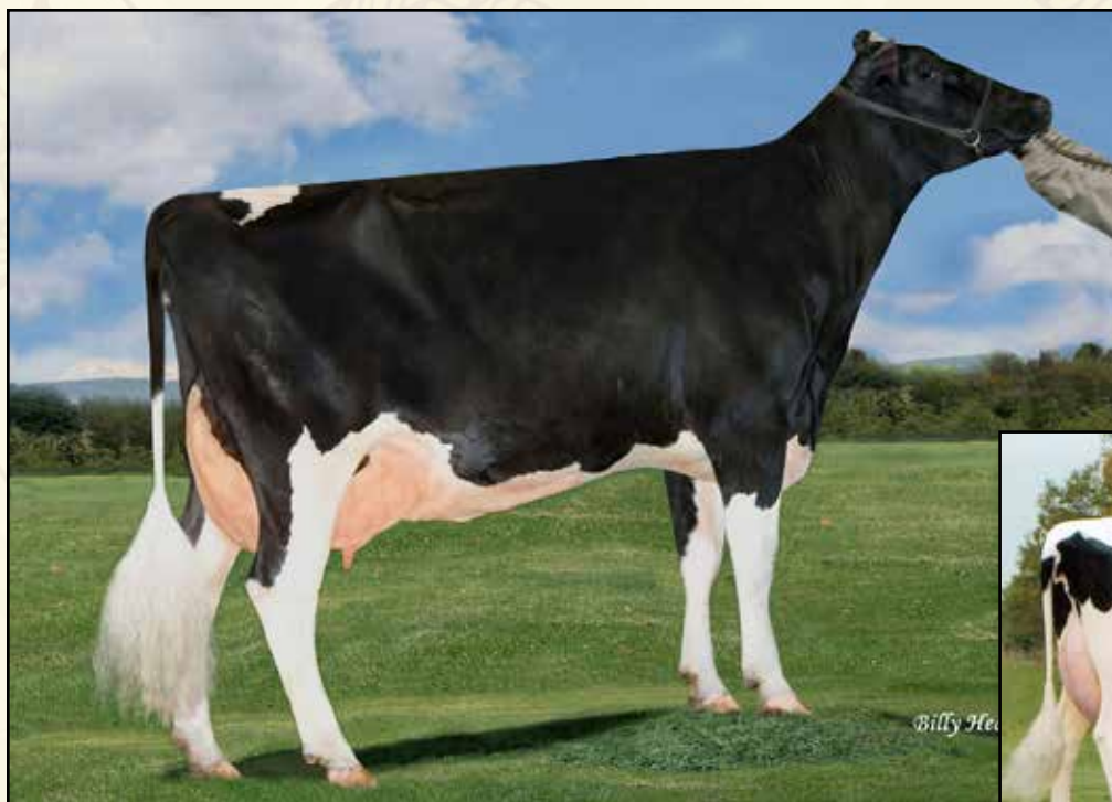
KINGSMILL ASHLYNS ADMIRE-ET EX-90 2ND DAM OF LOT 17