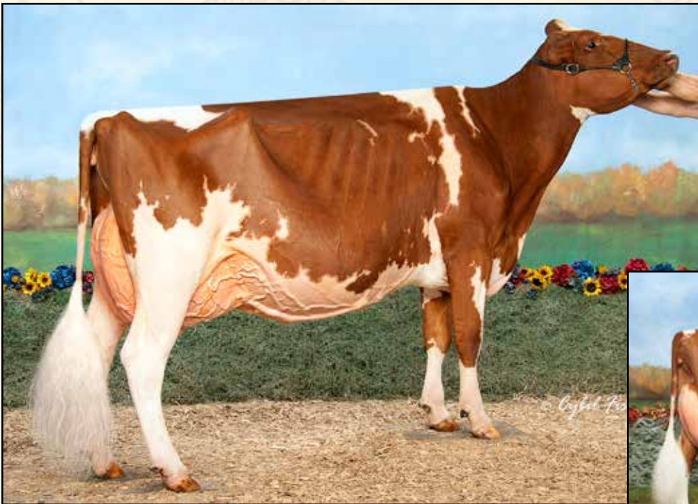
MS D APPLE DANIELLE-RED-ET EX-95 2E DAM OF LOT 2

Nominated All-American R&W 4-Year-Old 2015