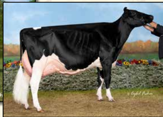
CRAIGCREST RUBIES GOLD REJOICE EX-94 2ND DAM OF LOT 3 All-American Senior 2-Year-Old Cow 2011