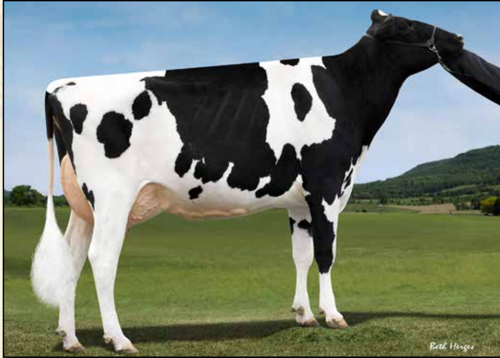
MAPLE-DOWNS ANNABELLE-ET EX-92 MATERNAL SISTER TO DAM OF LOT 4