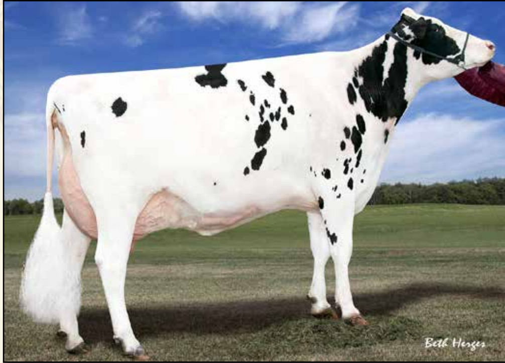
SCHILLDALE BUTTER COOKIE-ET EX-94 2E 3RD DAM OF LOTS 15 & 16