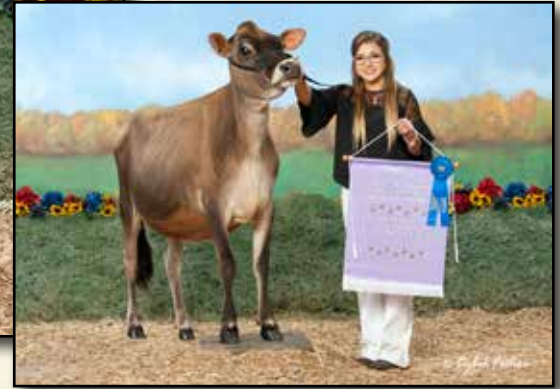
LLR PREMIER TOO LEGIT-ET EX-91% DAM OF LOT 54 Junior Champion, WDE Junior Show 2017