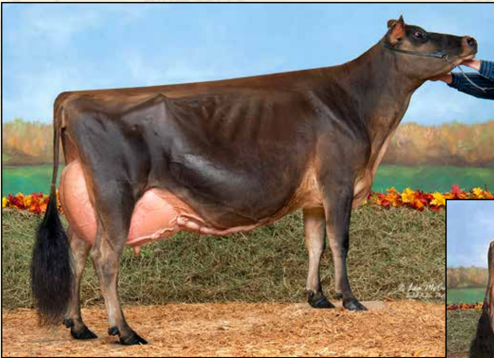
HARMONY-CORNERS FOZZY EX-95% FULL SISTER TO DAM OF LOT 48

HM Grand Champion, All-American Show 2015