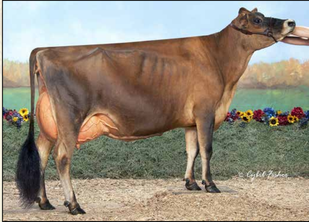
HARMONY-CORNERS FEATHER-ETN EX-93% SAME FAMILY AS LOT 49