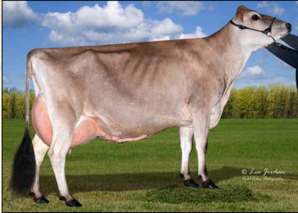
KEVETTA ECLIPES PUMPKIN-P EX-93% DAM OF LOT 55; MATERNAL SISTER TO DAM OF LOT 67