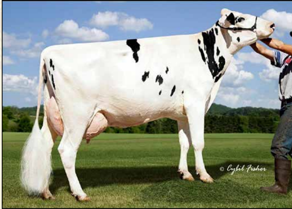
LEASEWAY BAXTER EMBERS-ET EX-90 2ND DAM OF LOT 19