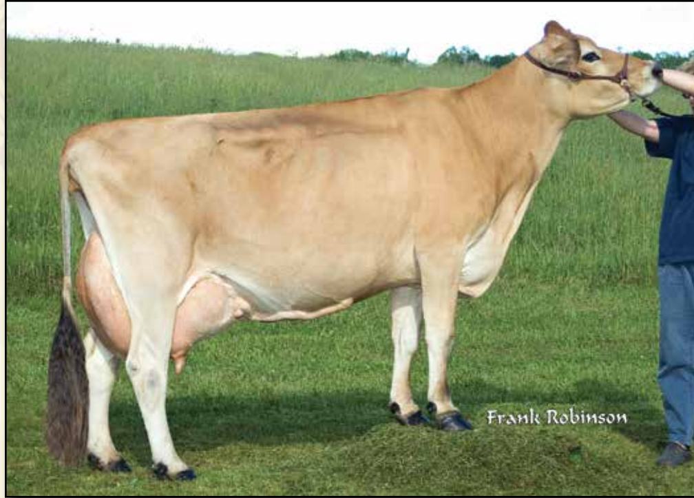
NOBLEDALE VICTORIAS SYBIL-ET EX-93% MATERNAL SISTER TO 2ND DAM OF LOT 70