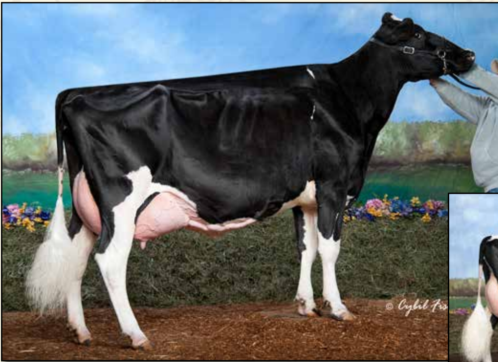
RIDGEDALE GREETING EX-94 3E DAM OF LOT 26