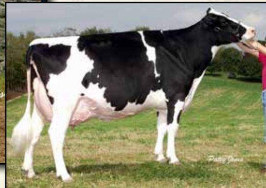
MS KINGSTEAD CHIEF ADEEN-ET EX-94 2E 3RD DAM OF LOT 6