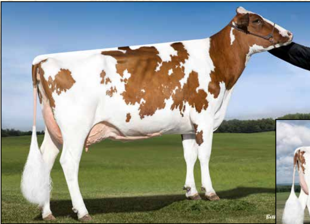
WILS-GOLD CLT SUNDAE-RED-ET EX-93 2E DAM OF LOT 14