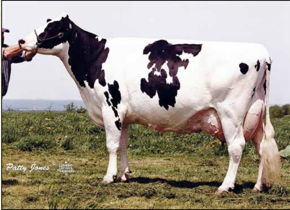
RIDGEDALE ESTELLE-ET EX-95 3E 2ND DAM OF LOT 21