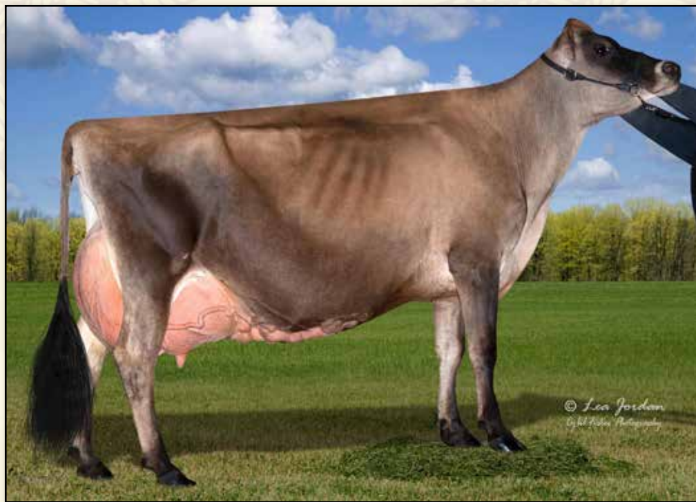
OAKFIELD TBONE VIVIANNE-ET EX-96% DAM OF LOTS 39 & 40