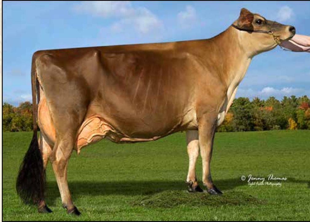
WHITE ROCK LADD PAPAYA EX-93% SAME FAMILY AS LOT 99

Nominated ABA Junior All-American 4-Year-Old 2019