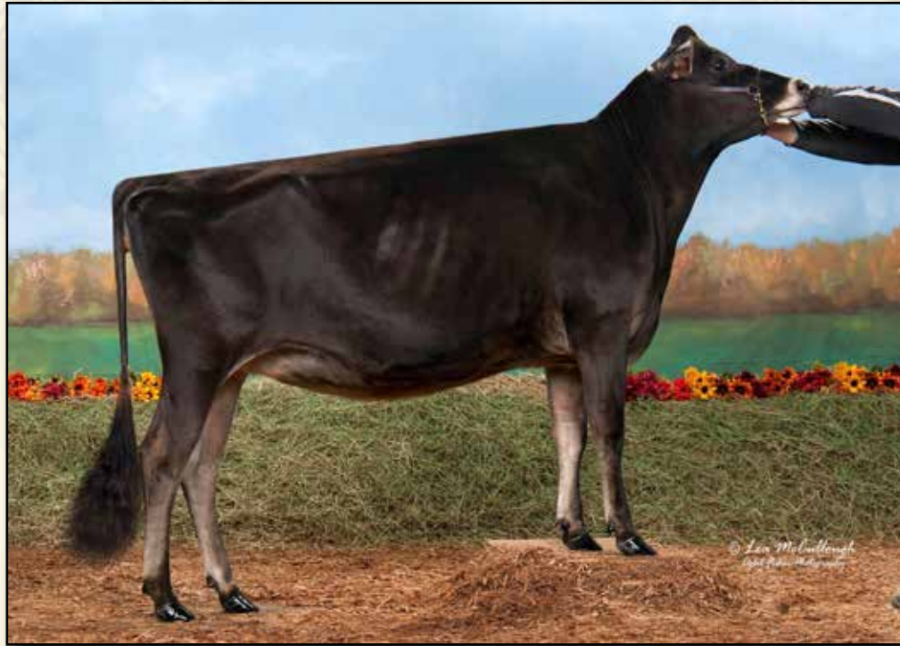
MVUE IMPRESSION ADELLE DAM OF LOT 66

Reserve All-American Winter Yearling 2014