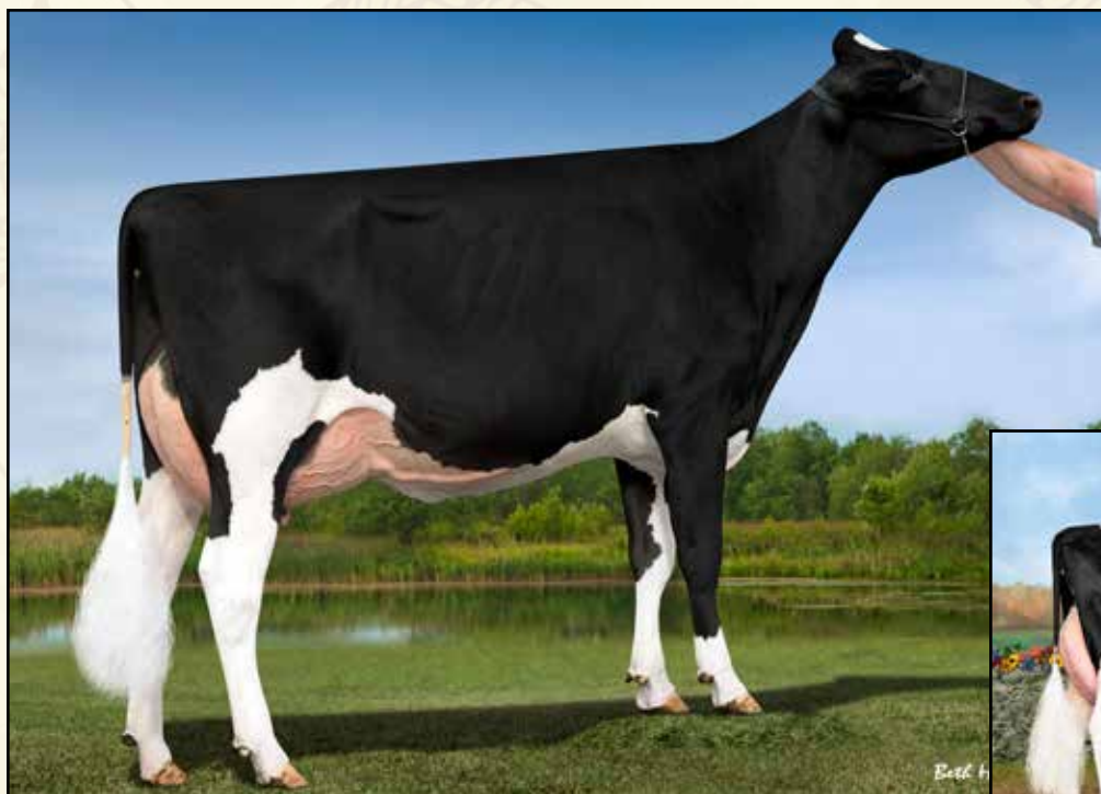
CRAIGCREST REJOICES SIDNEY-ET EX-94 DAM OF LOT 3