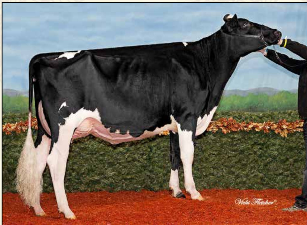
ARETHUSA SANCHEZ VALISE-ET EX-94 3E FULL SISTER TO 2ND DAM OF LOT 24