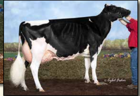
RIDGEDALE GLAMOROUS EX-94 2E MATERNAL SISTER TO LOT 26 Reserve Junior All-NY 5-Year-Old 2015