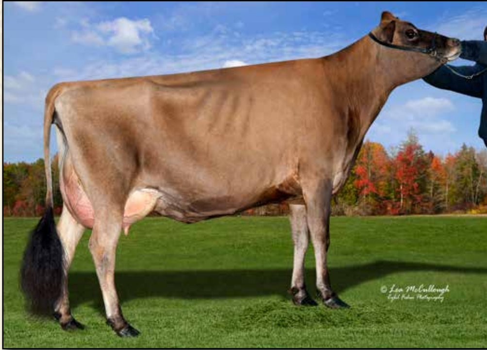
HILLACRES EXCLAMATION EXCLAIM EX-91% 2ND DAM OF LOT 69 Grand Champion, PA Farm Show 2015