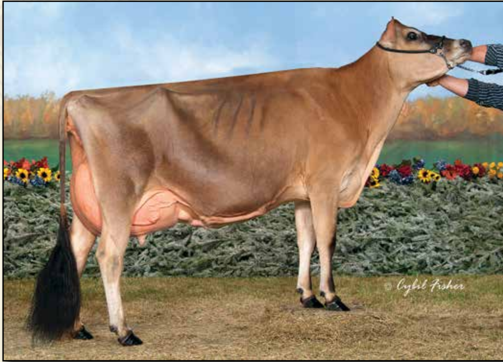
STONEY POINT GILLER FARAH-ET EX-93% FULL SISTER TO 3RD DAM OF LOT 52 Nominated ABA All-American 4-Year-Old 2014