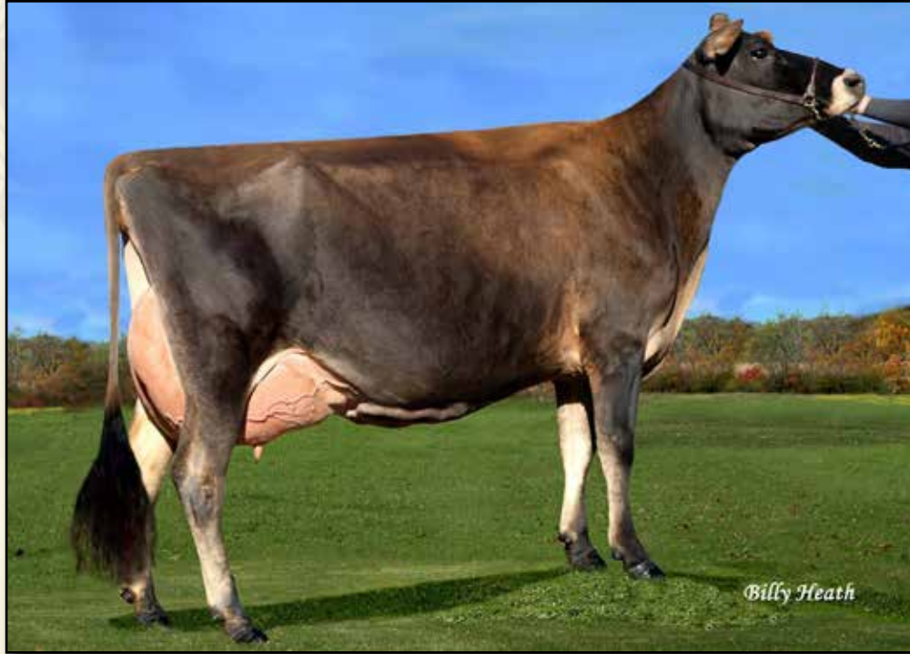
STONEY POINT VINDICATION FALINE EX-95% SAME MATERNAL FAMILY AS LOT 51