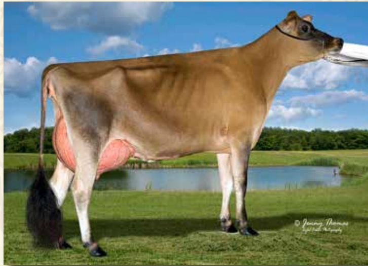
DREAM-VALLEY TEMPTATIONS TEASER EX-90% DAM OF LOT 79