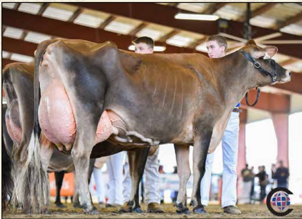
THERIHOF FIRE P WYNONNA EX-92% DAM OF LOT 45

HM Senior Champion, North American Open Jersey Junior Show 2020