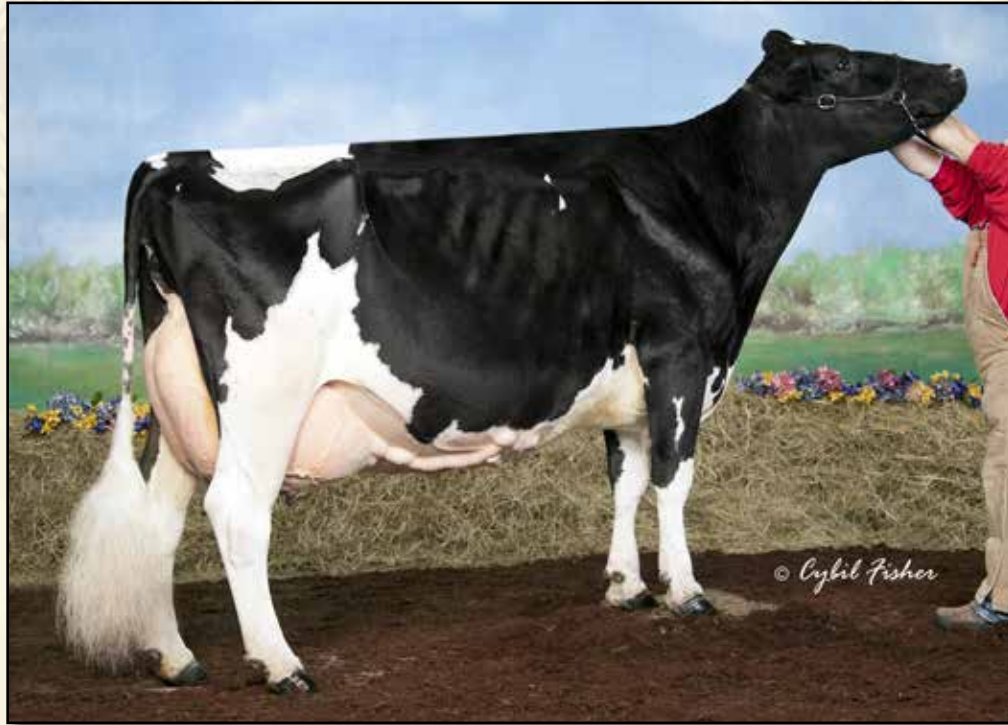
RIDGEDALE FOLLY EX-96 5E SAME FAMILY AS LOT 28