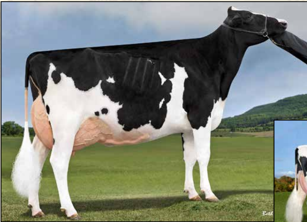
TILLAPYKE WINBROOK ABBIE-ET EX-92 FULL SISTER TO DAM OF LOT 5