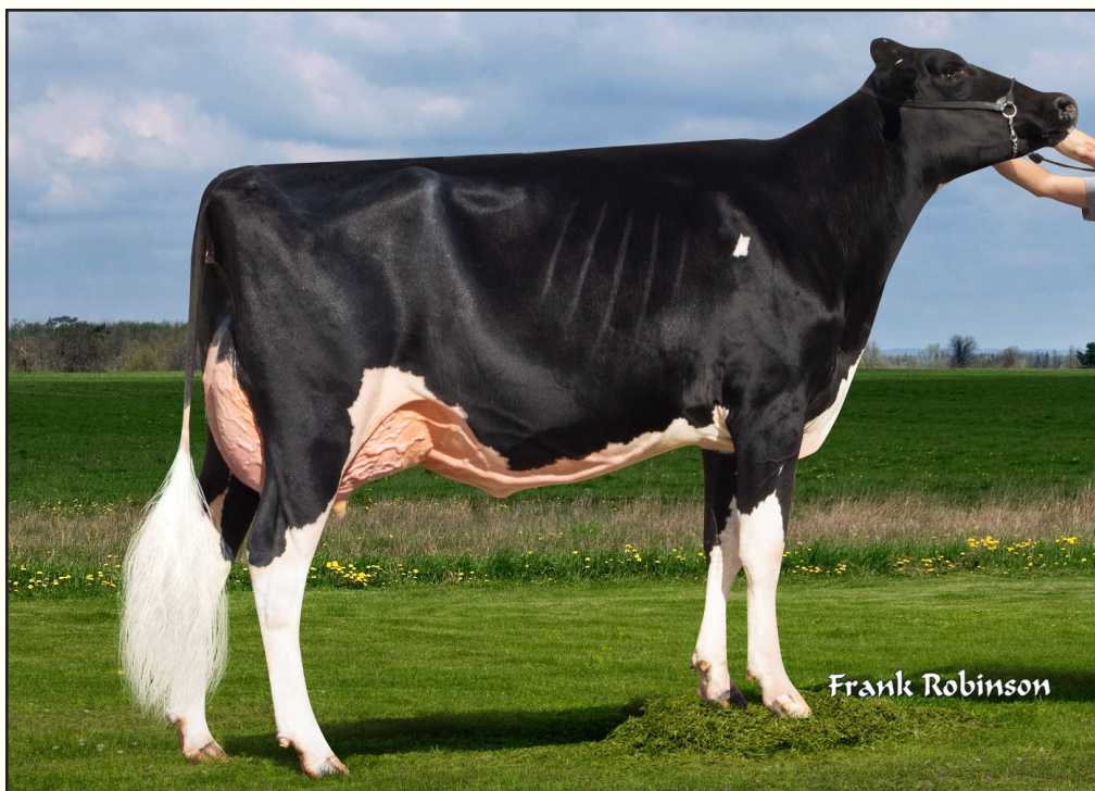
WHEY-MAT DB PAIGE-ET EX-91 2ND DAM OF LOT 6

Grand Champion, Western Classic Junior Show 2023