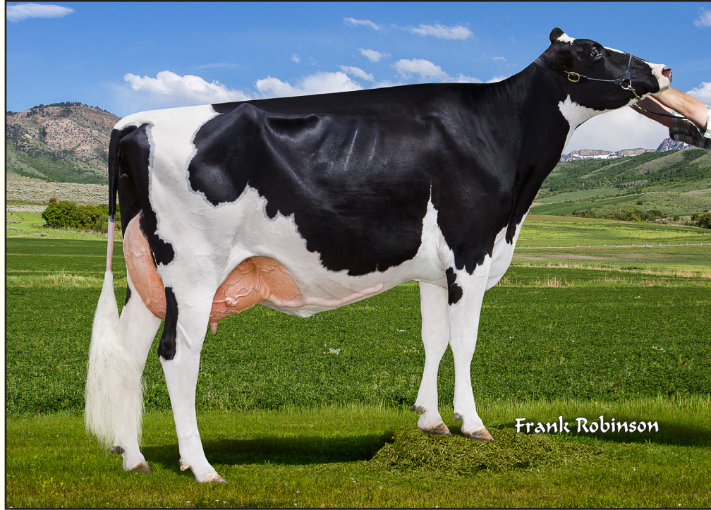
UTAG GUTHRIE ZEEZLER EX-94 2E 3RD DAM OF LOT 9

Grand Champion, Western Spring National 2016