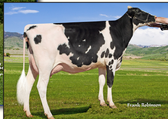
BUTLERVIEW JACOBY AILIS-ET VG-86 DAM OF LOT 12