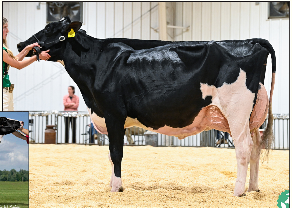
CAL-DENIER-I GOLDWYN HEZ-ET EX-91 DAM OF LOT 8

Grand Champion, Southern Spring National Show 2026