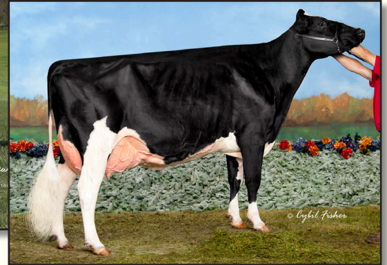
LUCK-E GOLDWYN AALIYAH-ET EX-94 3E 3RD DAM OF LOT 14 Nominated Junior All-American Aged Cow 2016