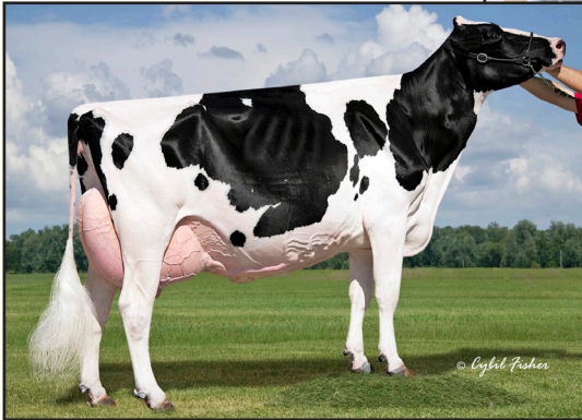
DUBEAU DUNDEE HEZBOLLAH EX-92 3RD DAM OF LOT 8

Grand Champion, Southern Spring National Show 2026