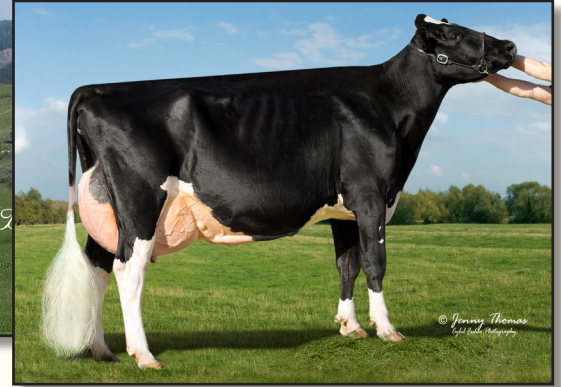
AIR-OSA REDBULL 12417 EX-95 2E 4TH DAM OF LOT 13 Holstein USA Star of the Breed 2015