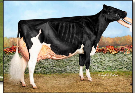
ROSIIERS BLEXY GOLDWYN EX-97 3E 2ND DAM OF LOT 3