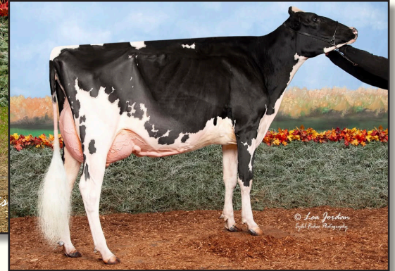
HIGHWAYMEN MALIBU-ET EX-90 DAM OF LOT 7