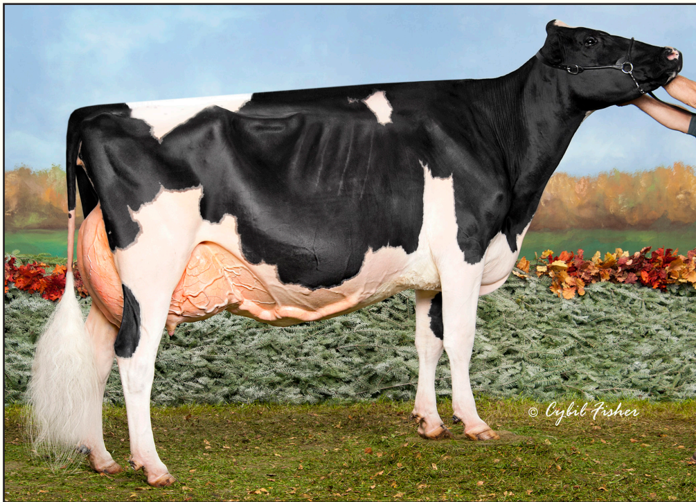
WENDON DEMPSEY PRUDE EX-95-2E-CAN 2ND DAM OF LOT 11 All-American 4-Year-Old 2716