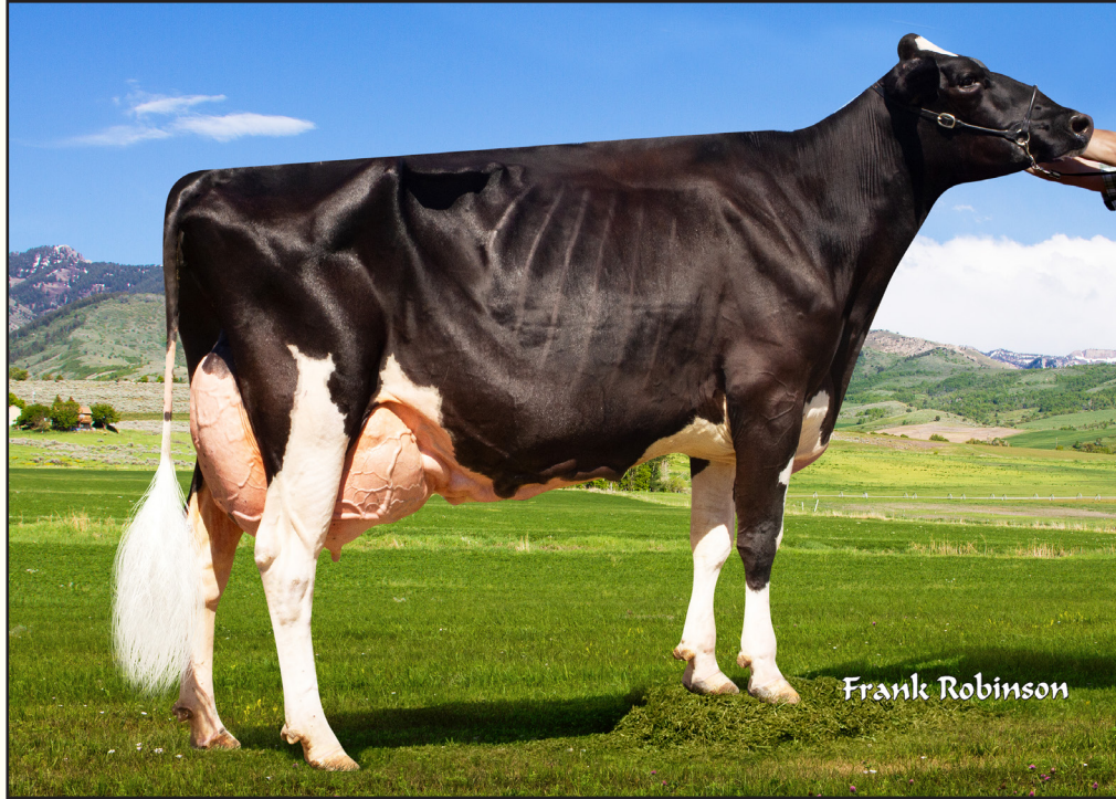
PAPPYS EMPHASIS VELVET EX-94 4E 3RD DAM OF LOT 2

HM Senior Champion, Western Spring National 2019