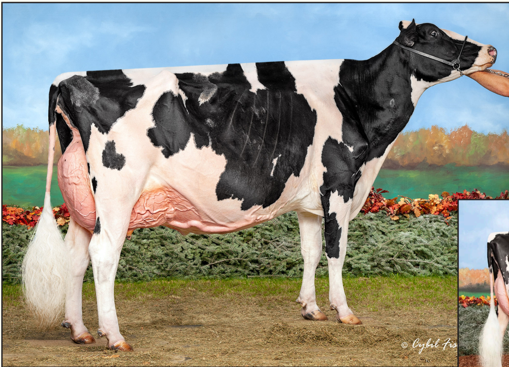
TEAM O'KALIBER MALLORIE EX-96 2E MATERNAL SISTER TO DAM OF LOT 7 Nominated All-American Aged Cow 2021