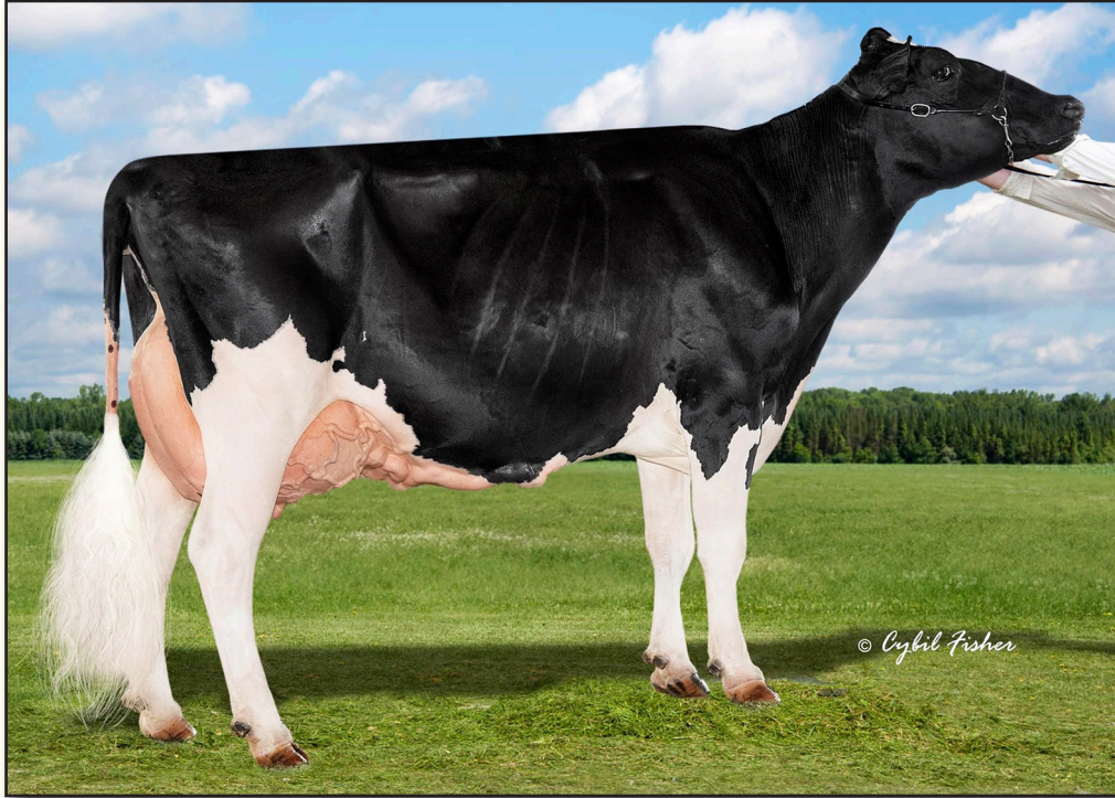
RIDGEDALE ELYSIAN-ET EX-95 EEEEE 3E 2ND DAM OF LOT 1

1st Aged Cow, NY State Holstein Show 2022