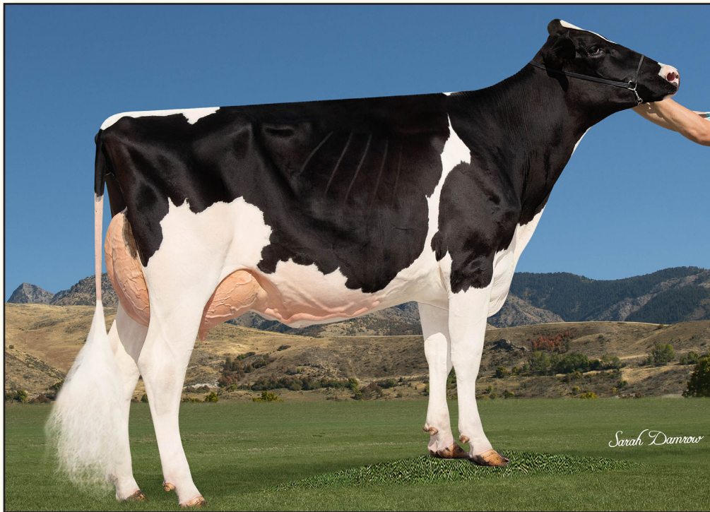
MS ESKDALE CRSBL AMOUR-ET EX-92 DAM OF LOT 4 Grand Champion, Utah State Fair 2022