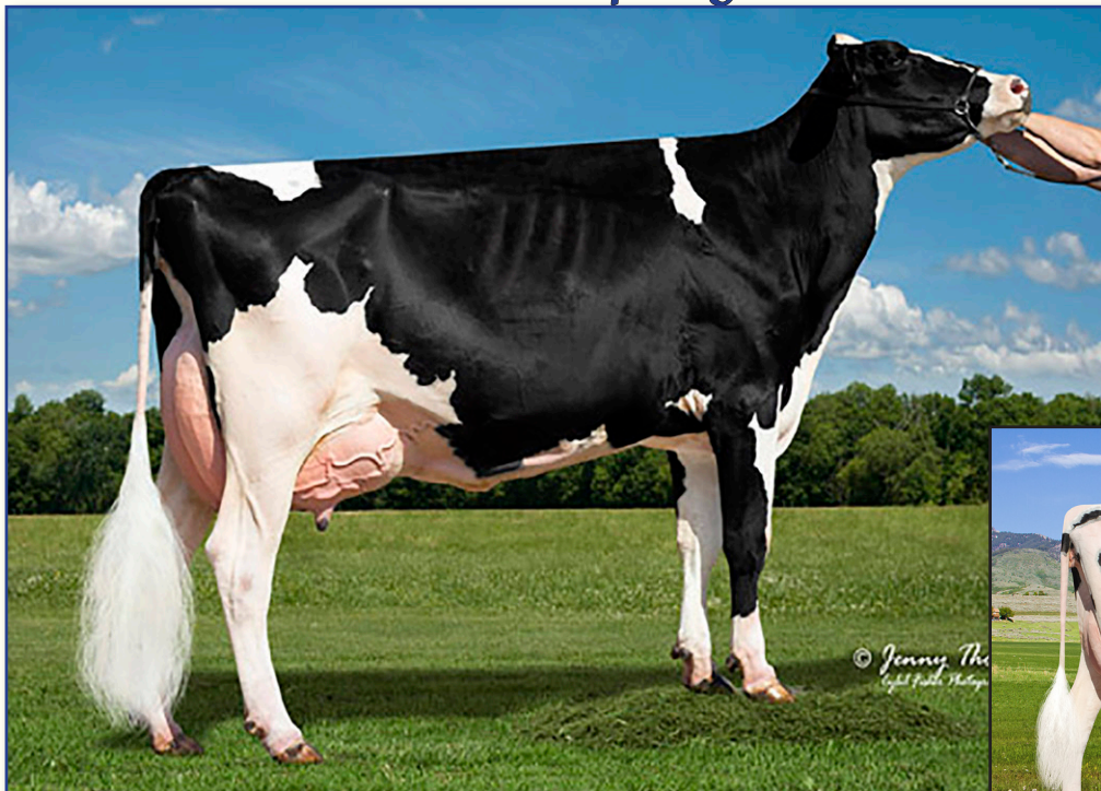
KINGSWAY GOLDWYN ARTICHOKE-ET EX-94 2ND DAM OF LOT 12 All-Illinois 5-Year-Old 2016