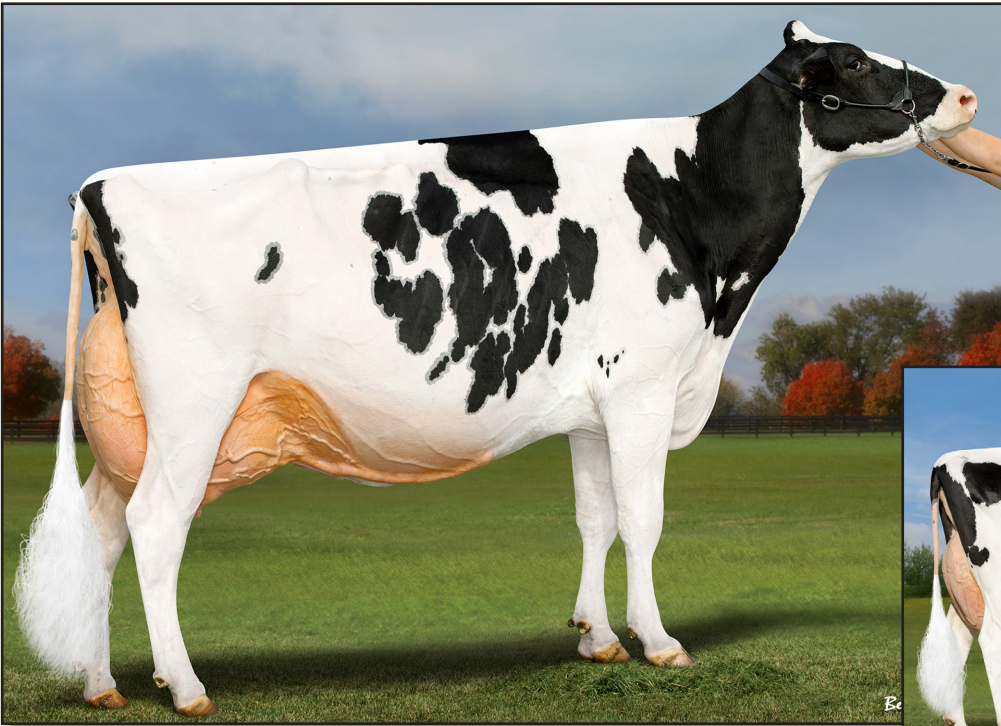
FARNEAR TBR ARIA ADLER-ET EX-96 2E 2ND DAM OF LOT 5

All-American Lifetime Production Cow 2021