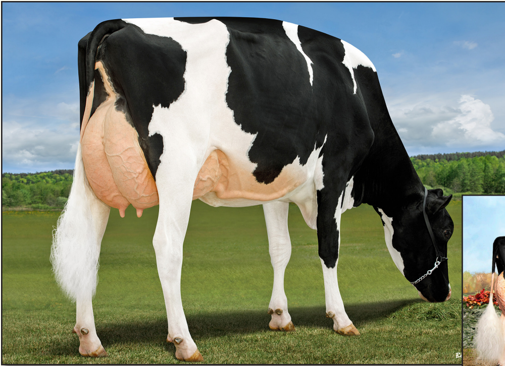
BLEXYS CHIEF BLOODY MARY-ET EX-92 DAM OF LOT 3