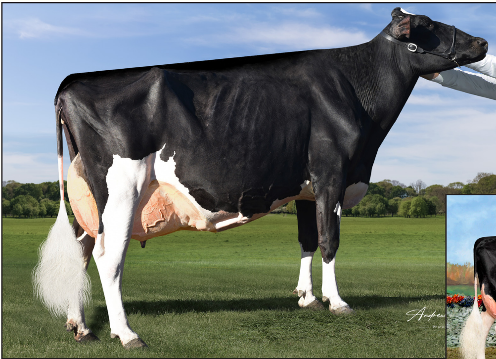
LUCK-E AWESOME AYTHYA-ET EX-92 2E 2ND DAM OF LOT 14