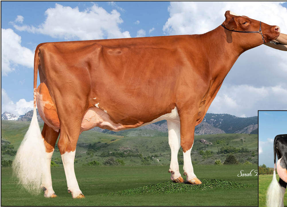
AIR-OSA RBULL RUBY23931-RED EX-93 2ND DAM OF LOT 13