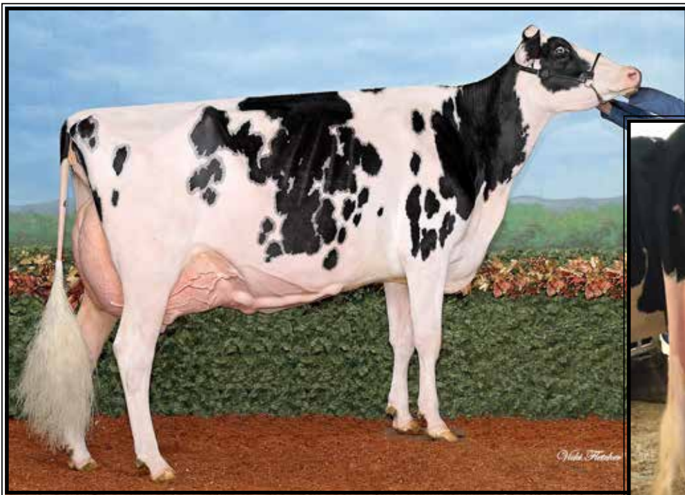
Idee Windbrook Lynzi EX-95,2E-CAN 95-MS

*All-Canadian 5yr-old 2019 (Maternal sister to the Dam of Lot 115)