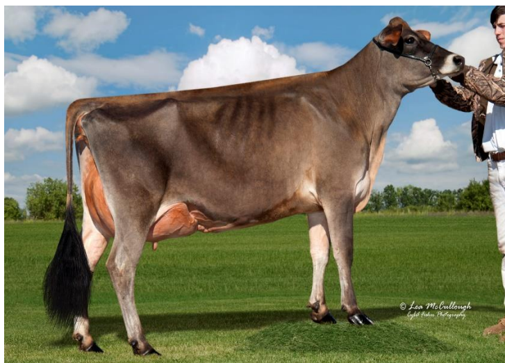
Her-Man Applejack Mindy VG87 3 rd Dam of Lot 1

I love the heifer project because I get to spend time with my cows and friends. I love Mindy because she is sassy like me.