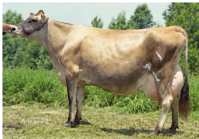
Sunny Day Yankee Becky EX90 8 th Dam of Lot 6 Her Dam sold in the SC Heifer Project Sale