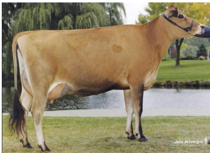
Ronada Ren Suzi EX94 5 th Dam of Lot 4