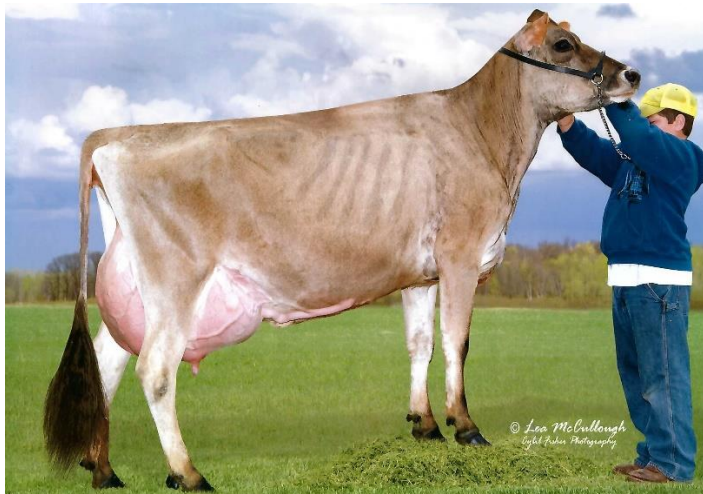
CTH Sultan Dolly EX 90 2 nd Dam of Lot 9