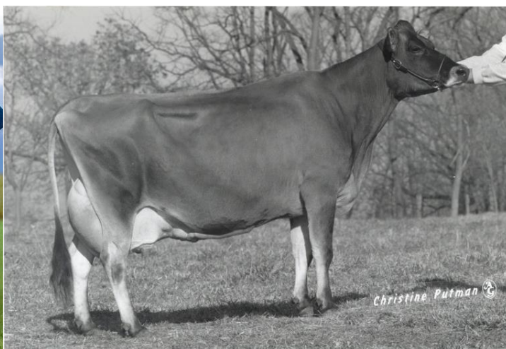
SAR Topcats Dolly Ex 92 5 th Dam of Lot 9