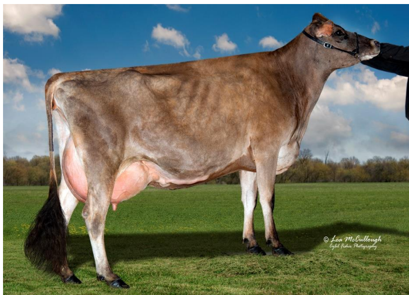
Her-Man Shocker Allegra-ET EX90 2nd Dam of Lot 10