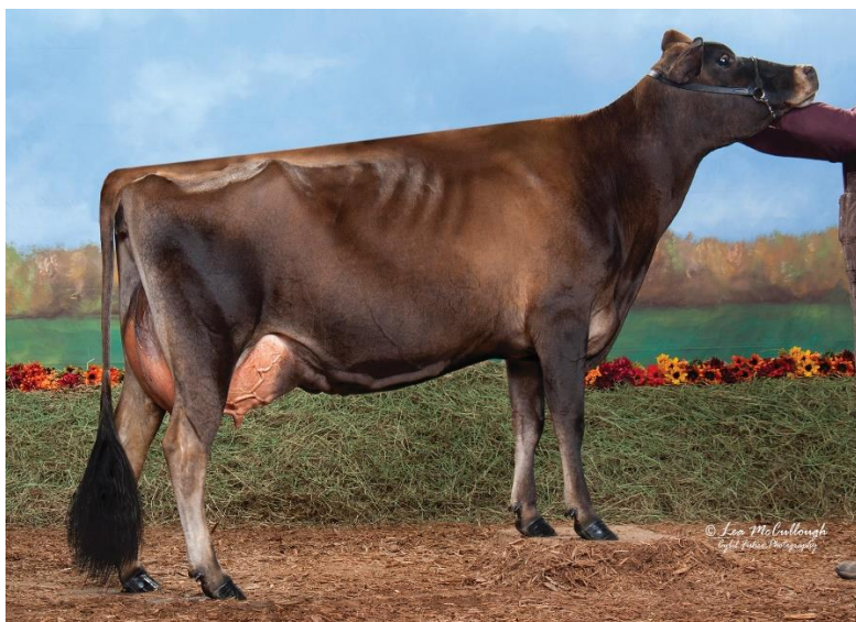
Senn-Sational Sparky Flyer EX91 2nd Dam of Lot 3 - Sold in 2012 SC Heifer Project Sale