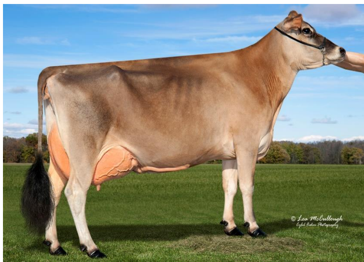
Her-Man Academy Belle EX 92 Dam of Lot 8