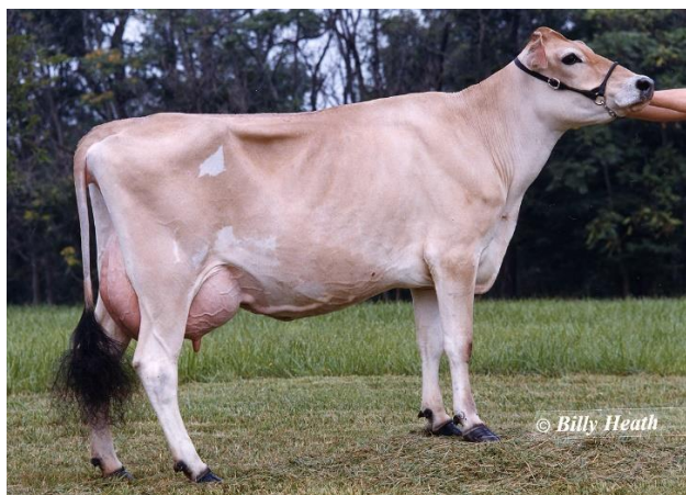
Sunny Day Montana Belinda EX 91 5 th Dam of Lot 6