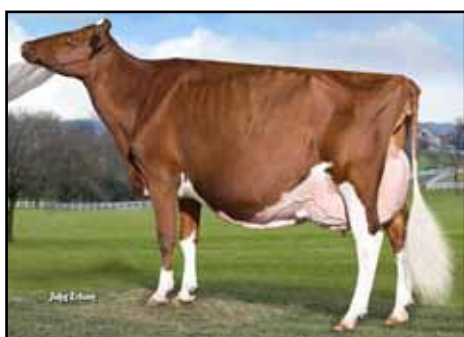
KHW REGIMENT APPLE-RED 4E-96 Grand Champion International R&W 2011 Fall Yrlg High Octane from an EX Appl Jax-Red; 3rd Dam is Apple - Rokey 6/19 Diamondback from Apple B-Red- ETN EX-90 - Kamps