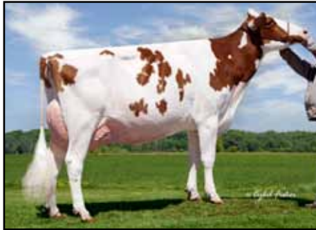
SILVERMINE ADV TALLY-RED-ET 2E-93 All-American R&W Sr. 2 & Sr. 3 Her Avalanche Fall heifer sells with 5 mat sisters nominated All-Am - Milksource