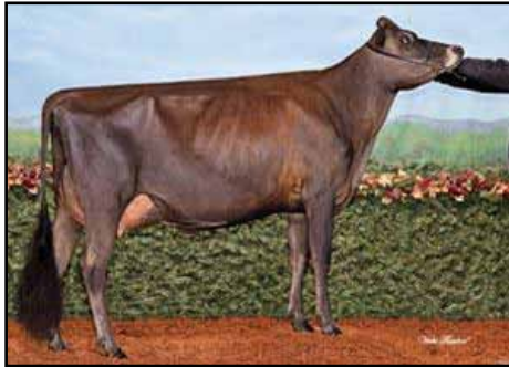
GENESIS PREMIER VISTA EX-91 2019 All-Canadian Sr. 2-Yr Old Her maternal sister sells. A big time deep pedigreed Black Apple fall calf - Schirm