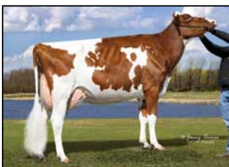
MISS CALIFORNIA-RED-ET 2E-93 HM Int Champ, 1st Jr. 2, RWF 2012 VG Barbwire from EX-93 Destry, then Apple 2-Red 2E-93 DOM - Steinberger