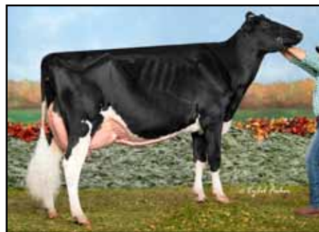
SPRINGBEND AFTERSHOCK DANICA 2E-94 Res. Grand Mid-East Fall National 2015 Her sweet Milking Fall Yrlg Avalanche sells fresh Sept. 1 ready to compete. - Erbsen