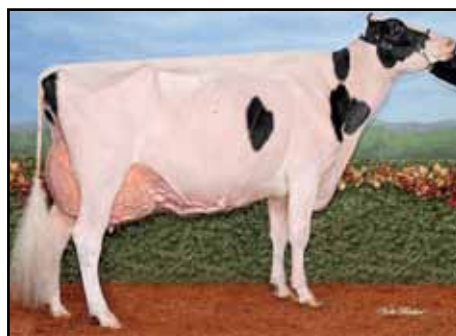
KINGSWAY SANCHEZ ARMADILLO 3E-96 Nom. All-Canada Production Cow 2019 Her show topper EX-91 Sr. 3 Maternal Sister sells fresh in July from 2E-92 Goldwyn and 5 Ex dams - Esau & Winter