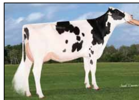
CARTERS-CORNER WH PRESLEY Res. Int Champ, IL State Show 2020 Proven show winning Jr. 3 sells! From a VG-87 Atwood, then 3E-94 - Carter