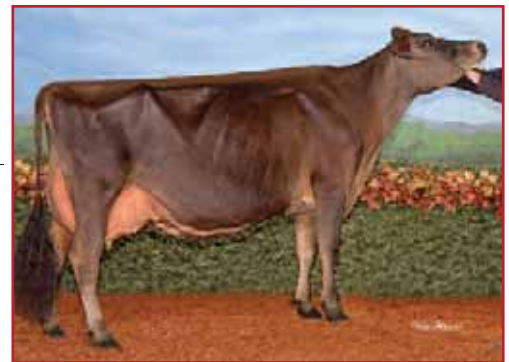
PLEASANT NOOK PREMIER MISS ME EX-93

JECANM 11950683 GPA:(08/20) -503M, -12F, +0.21% -22P, -0.01% RPT.70% CAN-ETA:(08/20) +4(PA) FC.61% RPT.76 RK, +1070(PA) GLPI, -665 PROS MR :105(PA), Inbr.Coeff. +6.44%, R-Value: +14%