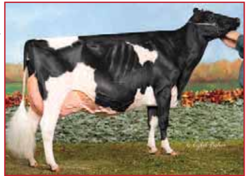
WEEKSDALE JUDGES HARMONY EX-95 1 st & Best Udder 5-Yr-Old & H.M. Grand ChamP. WDE 2016