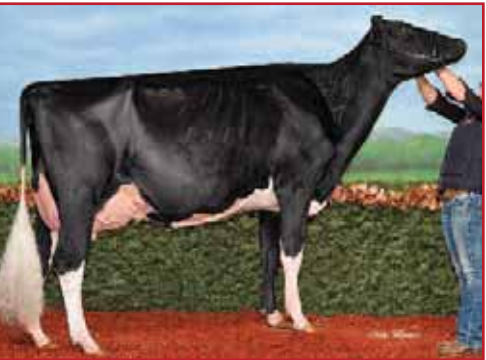
MORSAN SID LOVELY 3 EX-92 2E (SM:95) Tout-Quebec Jr. 3-Yr-Old 2015 6th Jr. 3-Yr-Old WDE 2015 Dam

PINE-TREE SID-ET PB HOUSAM62175895 B&W *POF*A1A2*CVF*RDF*BYF* VG-86-2YR-CAN ST'10 CAN-GEV Aug*20 99%Rel GLPI 1974/99% KG M-672 F-13 %F 0.12 P-18 %P 0.03 CAN-GEV Aug*20 99%Rel CONF 6 LYSTEL TITANIC LOVELY THREE PB HOCANF102680609 B&W ET B:07 Sep 2004 VG-88-4YR-CAN 10*(0/51) 02-02 305 10519 402 3.8 332 3.2 BCA 252 259 250 03-09 305 13529 501 3.7 420 3.1 BCA 289 290 278 05-08 305 15566 611 3.9 465 3.0 352 17042 673 3.9 522 3.1 BCA 307 328 292 3 LACT: 44538 1705 3.8 1396 3.1 KG Avg BCA: M283(29) F292(35) P273(16) 1 Superior Lactations HM. ALL-WEST SR.3-YR 2008 2ND SR.3-YR WESTERN CHAMP. 2008 3RD SR.2-YR CALGARY SPRING 2007 Progeny Data: 5EX 8VG 3GP 0G 0F 17 DAUS ME AVG: 13391 519 3.9 414 3.1 AVG BCA: M253 F266 P250