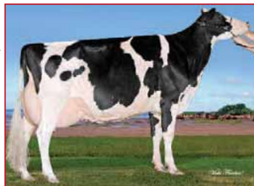
SHADOWAVE TRI GHOST EX-92 2E 3-05 300 11,062 kg 3.4% 3.0% (235-219-224) 3rd Dam

HOCANF11106740 B&W ET B:15 Aug 2011 VG-86-2YR-CAN 02-04 305 8483 326 3.8 267 3.2 318 8705 338 3.9 275 3.2 BCA 200 208 198 03-03 52 2174 95 4.4 73 3.4 2 LACT: 10879 433 4.0 348 3.2 KG Avg BCA: M200(4) F208(8) P198(0) Progeny Data: 1EX 0VG 0GP 0G 0F 1 DAUS ME AVG: 9686 365 3.8 309 3.2 AVG BCA: M183 F187 P187