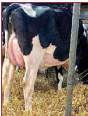
Dam of Lot 3

HOCANM107281711 B&W *POF*A2A2*CDF*CVF*RDF EX-90-5YR-CAN ST*16 F&L:90 DS:92 RP:86 CAN-GEV Aug*20 99%Rel GLPI 2974/99% KG M-154/14% F 30/41% %F 0.32 PRO$ MR 106 P 28/41% %P 0.28 1434 CAN-GEV Aug*20 99%Rel CONF 11/98% MS 10 F&L 8 DS 11 RP 1 Progeny Data: 13131 Daus: 88.00% GP+ 578EX 4886VG 6180GP 1461 G 26F 14002 DAUS ME AVG: 12224 501 4.1 407 3.3 AVG BCA: M231 F257 P246