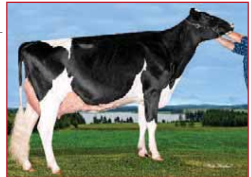
ARDROSS GOLDWYN PUZZLE EX-91 3E

Consigned By: BONNIELM FARM LTD Tel: 506-785-2973 Fax: 506-785-4352