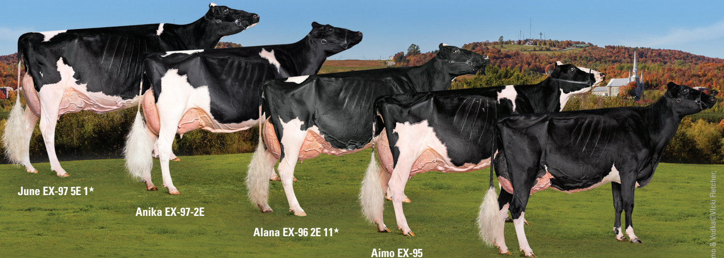
June EX-97 5E 1*

85 head will sell - 70 fresh Holsteins & Jerseys