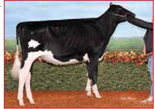
HAMMERTIME DOORMAN NOVA

HOUSAF136102269 B:03 Oct 2004 EX-90-USA Life: 73,428 kg 3.5% 2583 3.0% 2190