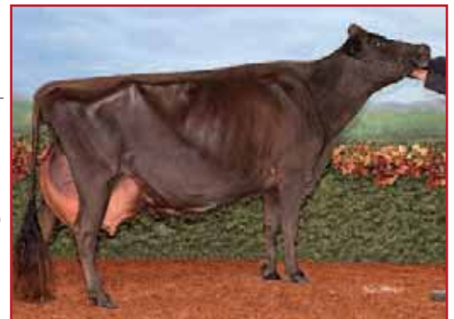
PLEASANT NOOK ACTION FRISKY EX-96 4E Nom. All-Canadian & Nom. All-Ontario Mature Cow 2019 2 nd Dam