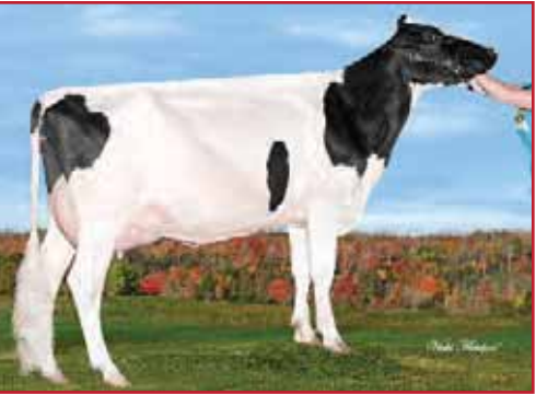
BELLTON SVB STAR LEE II EX 3E 2* 6-09 305 11,646 kg 4,8% 3,4% (213-276-231) Deep pedigree from the Star Lulu Family 2nd Dam

CRACKHOLM FEVER PB HOCANM103631566 B&W *POF*A1A1*RDF*BYF*BLF EX-95-11YR-CAN ST*10 CAN-GEV Aug*20 99%Rel GLPI 2668/99% KG M-112 F 14 %F 0.16 P-5 %P-0.01 CAN-GEV Aug*20 99%Rel CONF 6 BELLTON SVB STAR LEE II PB HOCANF9674005 B&W ET B:12 Mar 2009 EX-90-3E-CAN 2*(11/0) 03-06 305 8849 408 4.6 306 3.5 BCA 183 225 197 05-09 305 11141 529 4.7 373 3.3 BCA 203 262 218 06-09 305 11646 555 4.8 391 3.4 328 12182 583 4.8 412 3.4 BCA 213 276 231 07-10 305 10839 452 4.2 352 3.3 BCA 200 228 211 6 LACT: 60584 2798 4.6 2048 3.4 KG Avg BCA: M190(9) F235(50) P202(21) Progeny Data: 1EX 3VG OGP 0G 0F 2 DAUS ME AVG: 11274 478 4.2 357 3.2 AVG BCA: M213 F245 P216