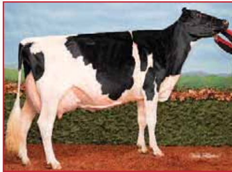
KINGSWAY DUNDEE ALABAMA EX-93 2E 4* Grand Champion Hastings 2011 • H.M. All-Canadian 2008 3 rd Dam

MR CHASSITY GOLD CHIP-ET PB HOUSAM140145553 B&W *POF*A1A2*CVF*RDF*BYF EX-94-6YR-USA ST*14 CAN-GEV Aug*20 99%Rel GLPI 2531/99% KG M-186/13% F-9/7% %F-0.01 PRO$ MR 106 P-31/0% %P-0.20 547 CAN-GEV Aug*20 99%Rel CONF 11/98% MS 9 F&L 10 DS 2 RP 7 Progeny Data: 6296 Daus: 91.00% GP+ 440EX 2582VG 2737GP 520G 17F 6698 DAUS ME AVG: 12122 472 3.9 375 3.1 AVG BCA: M229 F242 P227