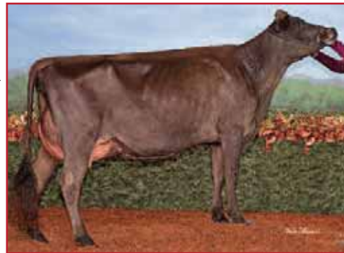
PLEASANT NOOK MUST HAVE VENUE VG-86

JEU SAM 115093063 CAN-GBV:(08/20) -1051M, -38F, +0.23% -32P, +0.13% RPT.97% CAN-ETA:(08/20) +6 FC, 91% RPT, 88 RK, +1161 GLPI, -487 PROS MR :100, Inbr.Coeff. +8.56%, R-Value: +10%