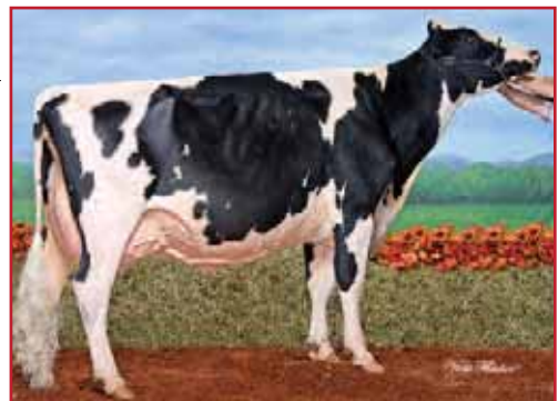
WEEKSDALE ALLEN LOLA EX-92 4E 1st 5-Yr-Old & Res. Grand Champion Egmont Bay Ex. 2011 2nd Dam

WEDGWOOD PURE GOLD PB HOCANM7807925 B&W *CVF*BLF ET EX-90-3YR-CAN CAN-GEV Aug*20 97%Rel GLPI 1933/95% KG M-540 F-14 %F 0.06 P-12 %P 0.05 CAN-GEV Aug*20 95%Rel CONF -2 WEEKSDALE ALLEN LOLA PB HOCANF7718343 B&W B:13 Sep 2005 EX-92-4E-CAN 04-06 305 11113 408 3.7 376 3.4 331 11637 429 3.7 399 3.4 BCA 222 222 239 05-07 305 10755 389 3.6 377 3.5 BCA 212 209 237 07-00 305 11640 484 4.2 381 3.3 BCA 213 238 223 6 LACT: 63995 2502 3.9 2196 3.4 KG Avg BCA: M210(13) F223(27) P227(34) RES. GRAND EGMONT BAY EX. 2011 3RD 5-YR ATLANTIC CHAMP. 2011 1ST 5-YR EGMONT BAY EX. 2011 Progeny Data: 1E X 0VG OGP 0G 0F 1 DAUS ME AVG: 9898 330 3.3 321 3.2 AVG BCA: M187 F169 P194