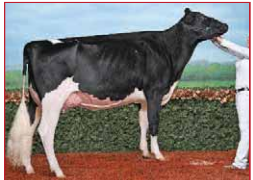
VALE-O-SKENE GOLDWYN KARMILLA VG-87 2YR

HOCANM10705608 B&W *A1A2*CDC*CVF*BYF*BLF GP-84-8YR-CAN GM*12 EXTRA*05 CAN-GEV Aug*20 99%Rel GLPI 2568/99% KG M-340 F 17 %F 0.27 P 3 %P 0.13 CAN-GEV Aug*20 99%Rel CONF 5 TINY ACRES DUNDEE KATHLEEN PB HOCANF8965013 B&W *CVF*BYF*BLF EX-92-2E-CAN 02-01 305 11662 400 3.4 360 3.1 342 12543 434 3.5 395 3.1 BCA 302 276 288 04-11 305 15201 466 3.1 461 3.0 BCA 307 255 294 4 LACT: 62784 2085 3.3 1991 3.2 KG Avg BCA: M266(38) F233(5) P254(26) NOM. ALL-ONTARIO JR.3-YR 2010 NOM. ALL-ONTARIO JR.2-YR 2009 HM. GRAND ONTARIO SUMMER 2008 RES. GRAND & 1ST 4-YR LINDSAY EX. 2011 1ST MATURE COW LINDSAY EX. 2014 Progeny Data: 1EX 6VG 1GP 0G 0F 13 DAUS ME AVG: 10268 359 3.5 321 3.1 AVG BCA: M194 F184 P194