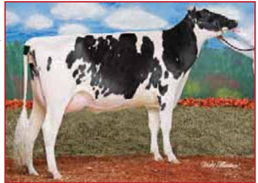
LINDENRIGHT SHOTTLE RADIANT VG-87 2YR 5*