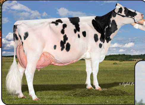
Jacobs Fitz Laurance-ET "EX-95 2E" HM Jr. All-American Aged Cow 2024 Granddam of Lot 74