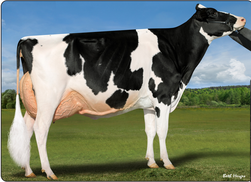
Ladyrose Caught Your Eye-ET "EX-95" 3x All-American in milking form Granddam of Lot 75