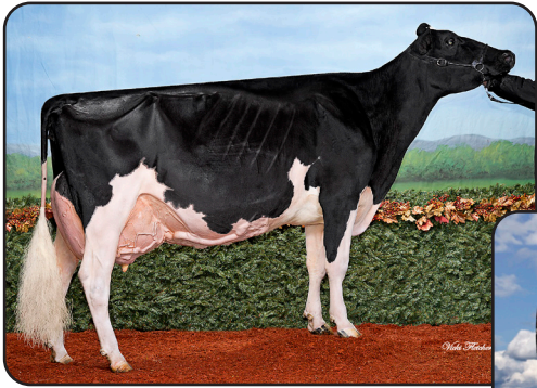
Jacobs Goldwyn Lisamaree-ET "EX-94 2E" All-Canadian Longtime Production Cow 2017 Third Dam of Lot 74