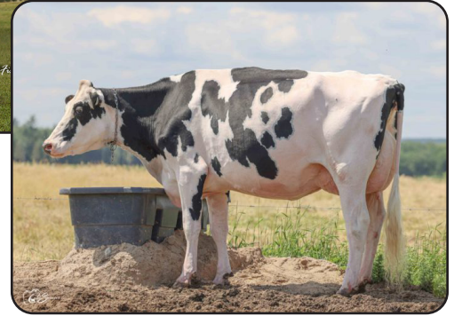
Jacobs Lambda Laurel-ET "VG-88" 1st Sr. 2 Year Old Portneuf 2023 Dam of Lot 74