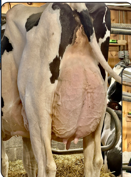
Liddleholme Kingdoc Morgan "EX-92" Lot 73