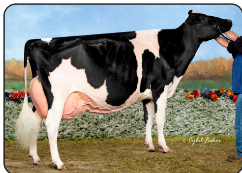
Team Durham Morgan-ET "EX-96 4E" HM All-American 150,000 lb. Cow 2015 Granddam of Lot 73