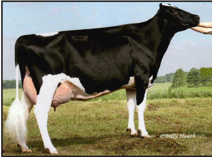
4th Dam of Lot 17: Miley Leduc M Butterfly-ET EX-93 3E