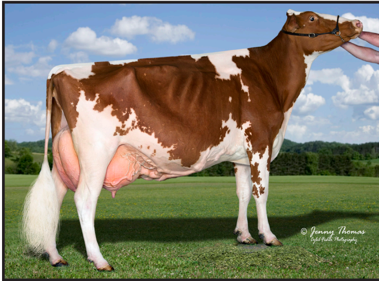
3rd Dam of Lot 13: Miley Advent B Gemini-Red EX-91 2E