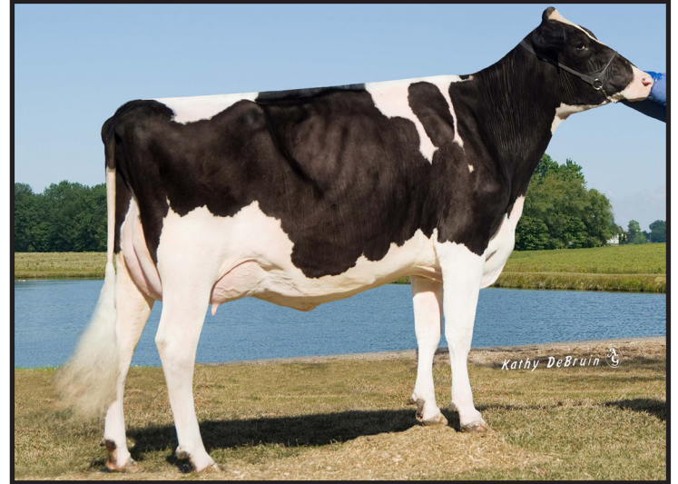
3rd Dam of lots 28 & 29: Miley Durham March Madness EX-92