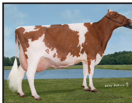
3rd Dam: Miley Debonair Glitter-Red EX-94 2E