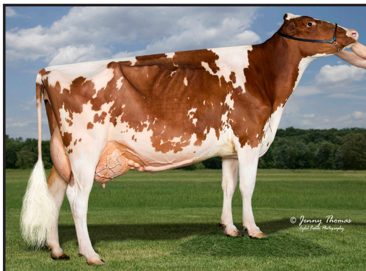
Maternal sister to Granddam of Lot 14: Miley Attitude Gloss-Red-ET EX-90 2E