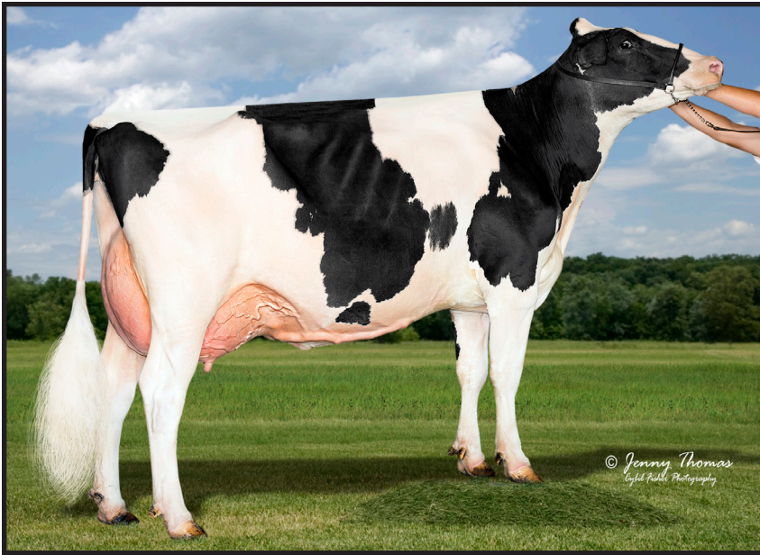
3rd Dam: Miley Woodbrook Glee EX-91