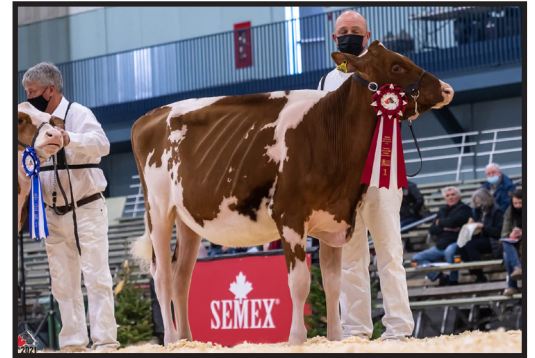
Same family as Lot 19: Miley Analyst Harmony-Red VG-85 CAN 1st R&W Winter Calf Canadian Nat'l Show 2021