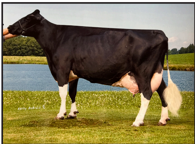
4th Dam of Lots 1 & 2 Miley Durham SW Gava EX-91 2E DOM