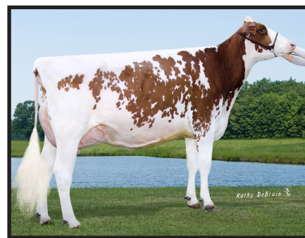
Sister to dam: Miley Awesome Gerri-Red VG-88 EX-MS