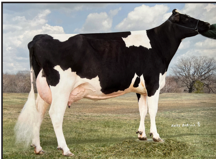
5th Dam: Miley Dundee Holiday-ET EX-90