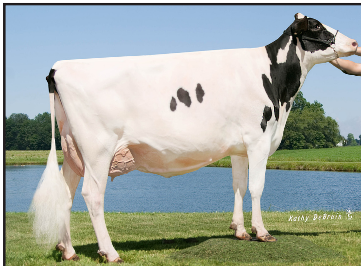
Dam of Lots 1 & 2: Miley Windbrook Grandslam EX-91