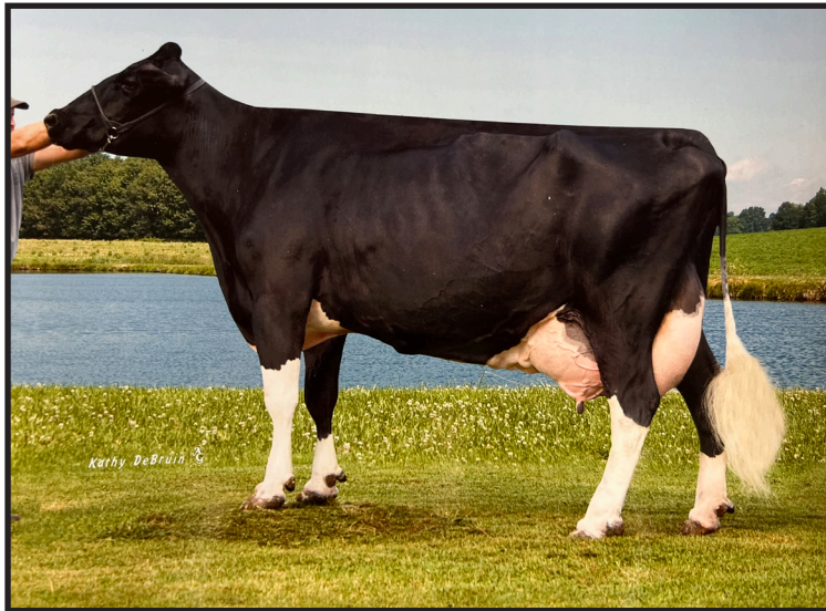
5th Dam: Miley Durham SW Gava EX-91 2E DOM