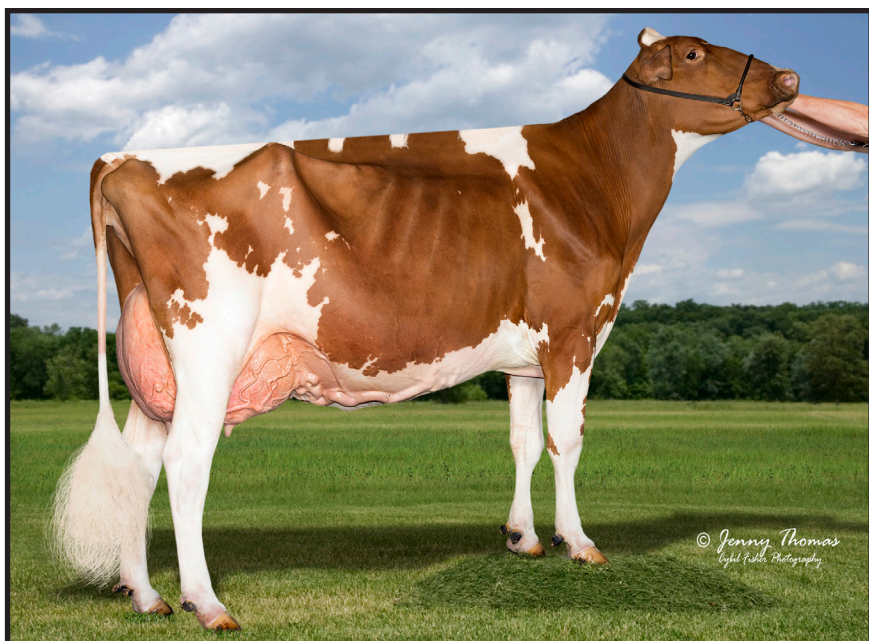
2nd Dam: Miley Redburst Glitz-Red EX-93 2E