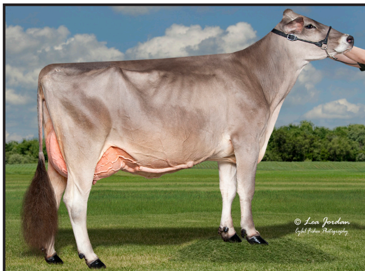
Granddam: Miley Bosphus Princess EX-91 2E Nominated All-American 4-Year-Old 2023