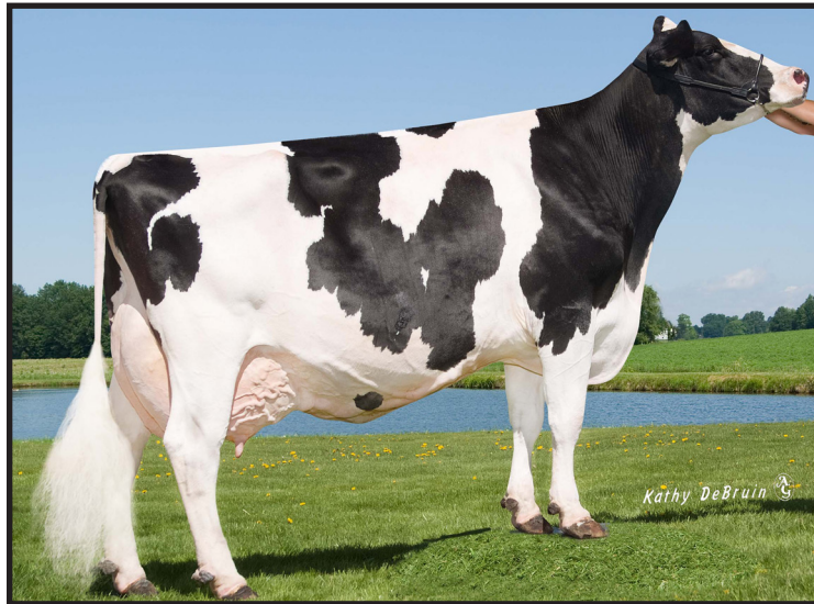
5th Dam: Miley Affirmed W Tiffany-ET EX-94 4E