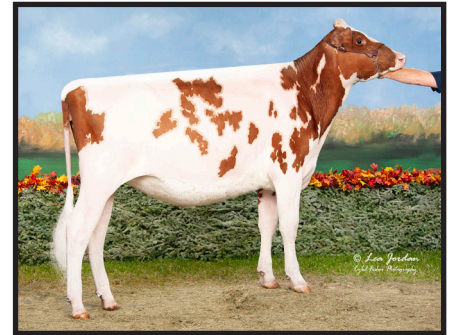
Daughter of Glider: Miley Warrior Grande-Red-ET Nominated All-American R&W Winter Yearling 2024