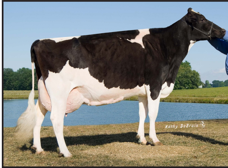
4th Dam: Miley Roy Lee Maisie EX-94 3E