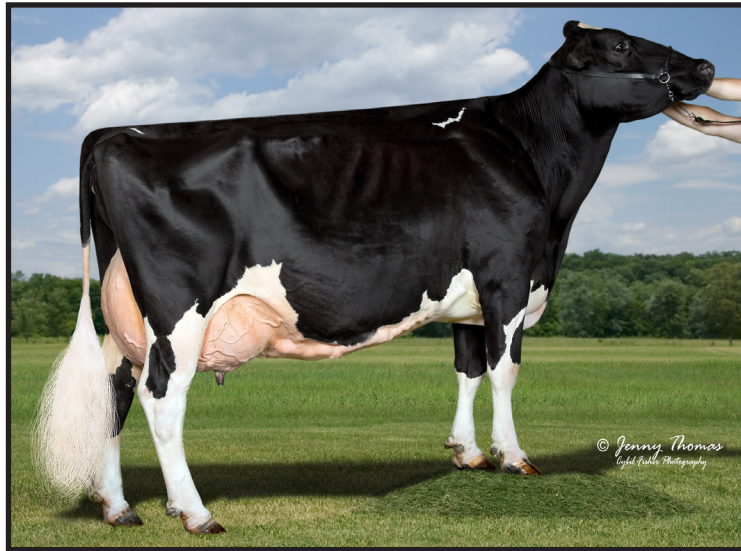
4th Dam of Lot 16: Miley Roy Select Excitement EX-94 3E Grand Champion OH State Fair Jr Show 2012