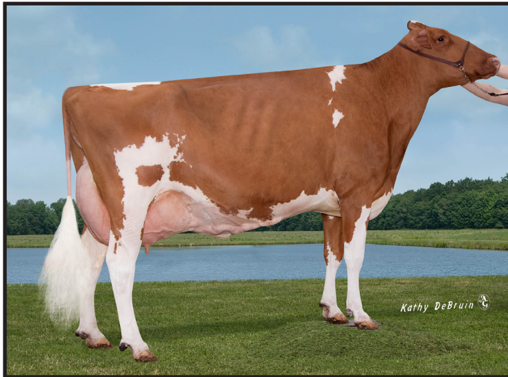
Maternal Sister to Dam: Miley Reality Gisele-Red EX -90 2E