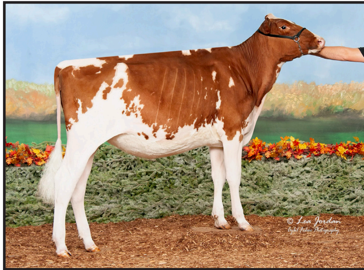
Same Family as lot 15: Miley Warrior Graceful-Red VG 87 Nominated All-American Summer Yearling 2023