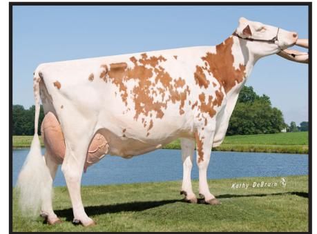
3rd Dam: Miley Redliner Gemma-Red EX-90