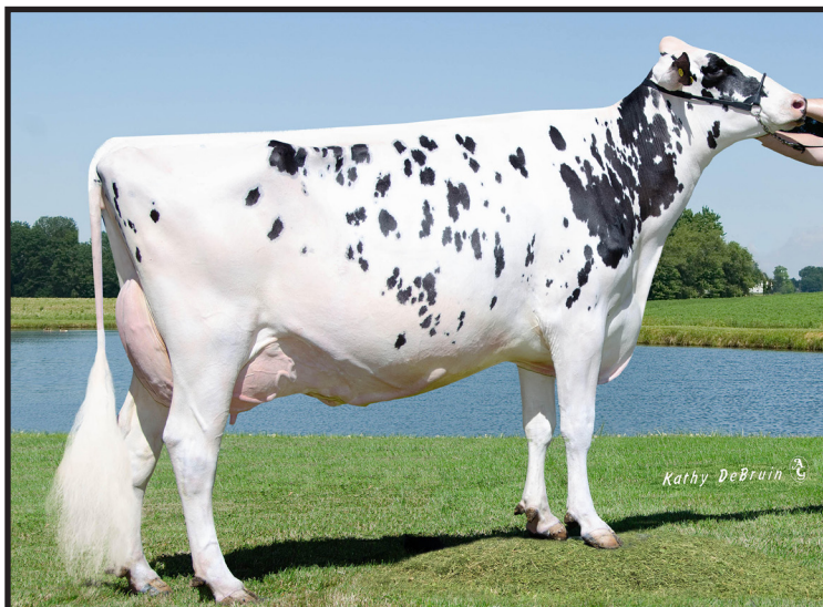
Granddam: Miley Solomon Gospel EX-94