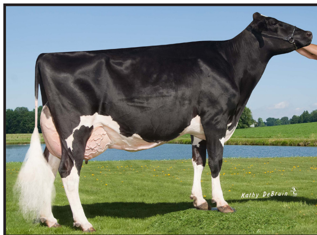
Maternal sister to Granddam of Lots 1 & 2 : Miley Planet Best Glow EX-90