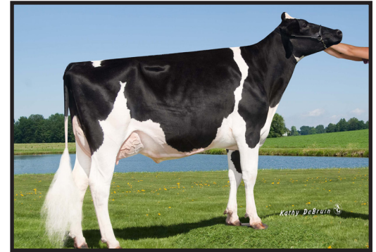
4th Dam: Miley Atlantic DD Ginelle VG-87