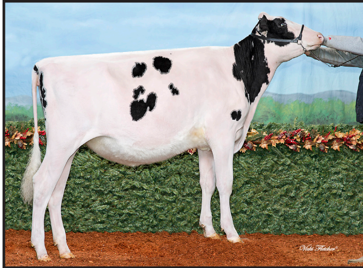
Full Sister to Dam: Miley Avalanche Genessee-ET VG-87 Nominated All-Canadian Fall Calf 2018 Supreme Jr Champion Spring Dairy Expo 2019