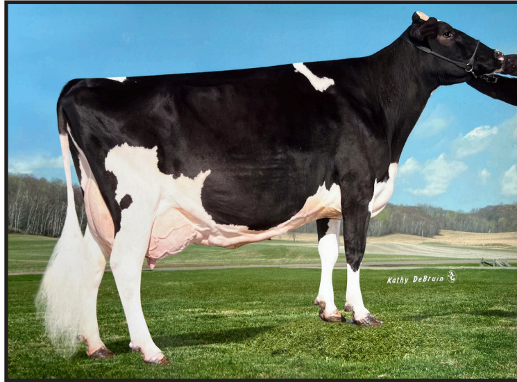
4th Dam: Miley Roy Bumblebee EX-93