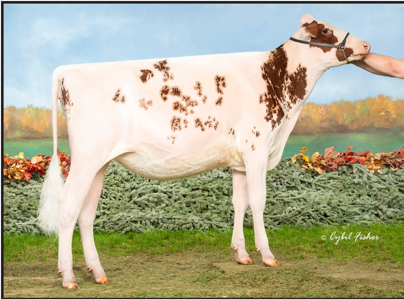
Full Sister to Lot 11: Miley Warrior Gentle-Red VG-86 Reserve All-American Summer Yearling 2023