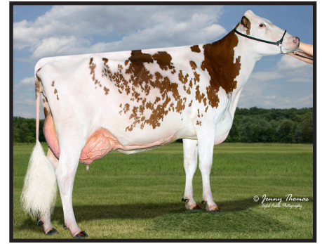
Granddam: Miley Ladd Grasshopper-Red EX-94 3E