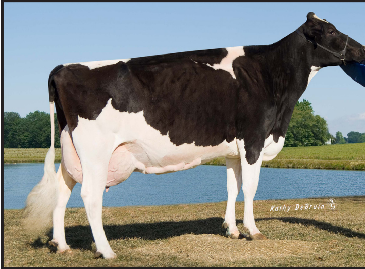
3rd Dam of Lot 27: Miley Roy Lee Maisie EX-94 3E