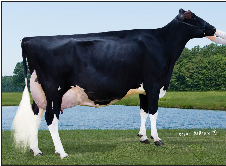
Dam: Miley Diamondback Glide EX-94