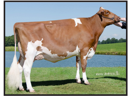
Full sister to Glide: Miley Diamondback Glider-Red VG-88