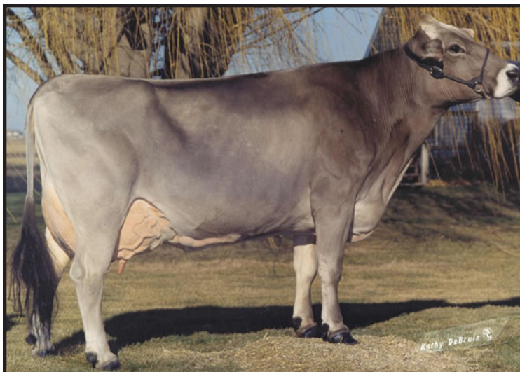
6th Dam of lots 21 & 22: Top Acres Present ET EX 94 5E