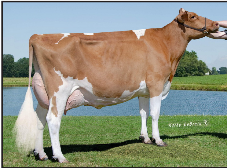
Maternal sister to Granddam of Lot 12: Miley Awesome Gemini-Red EX-91 2E