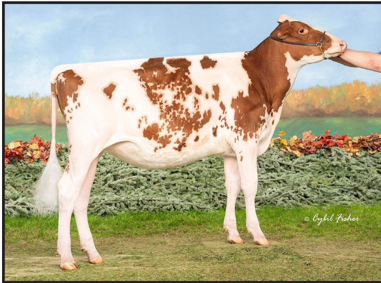
Maternal Sister to Dam: Miley Warrior Galore-Red Nominated All-American R&W 2023 & 2024