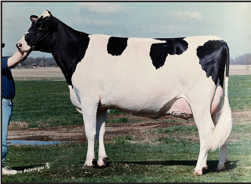
4th Dam: Miley Charles BS Henna EX-93 4E DOM