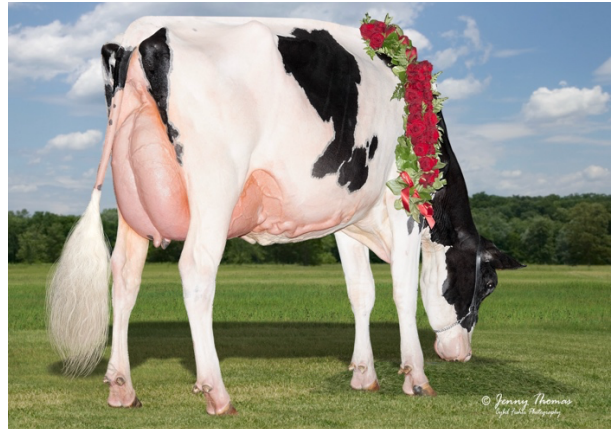
Maternal Sister to Lot 6 Bucks-Pride Hancock County EX 91 2024 National Holstein Futurity Champion Ohio State Fair