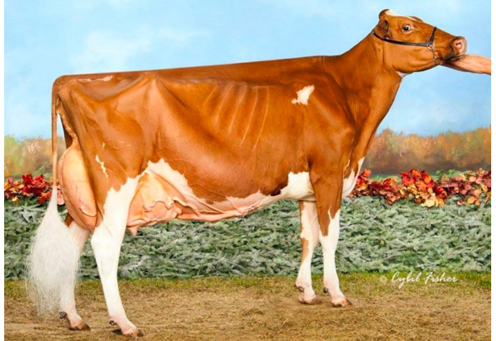
3 rd Dam