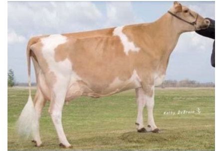
2 nd Dam