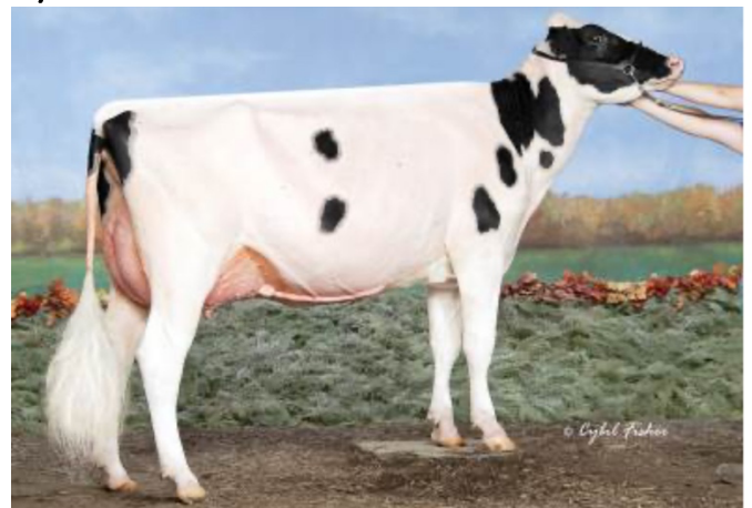
2 nd Dam