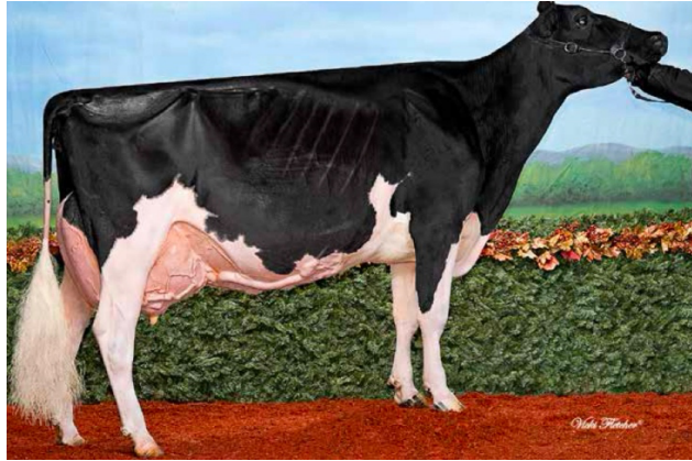
3 rd Dam

3 rd D: Jacobs Goldwyn Lisamaree EX 94 CAN