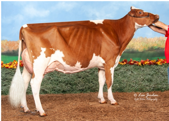
Dam of Lot 29