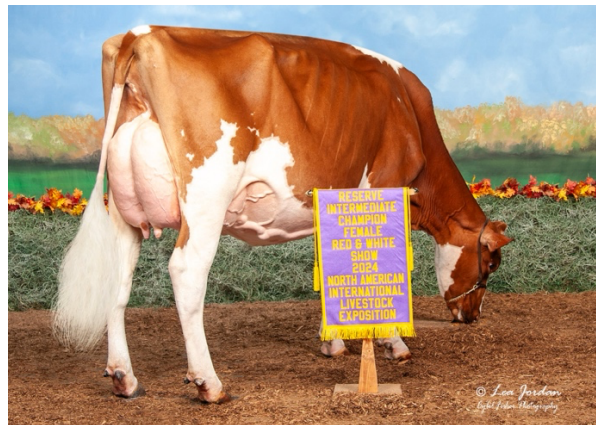
Dam of Lot 29