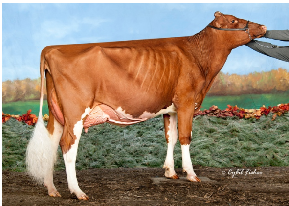
Maternal Sister to Lot 25 EX 93