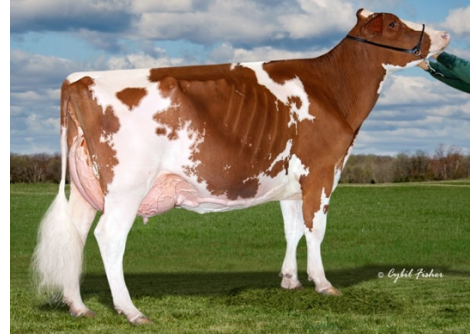
2 ND Dam of Lot 17