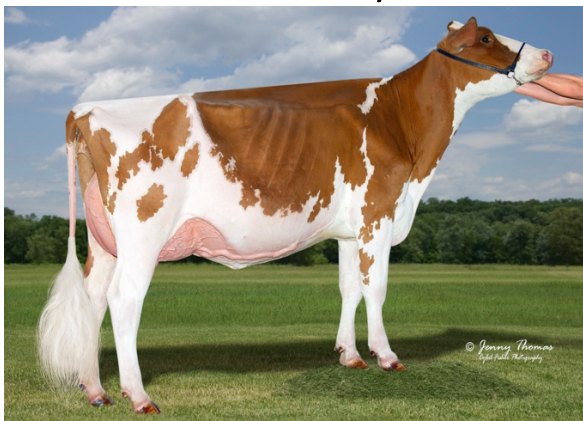
Maternal Sister to Lot 25 VG 88 2 yr.