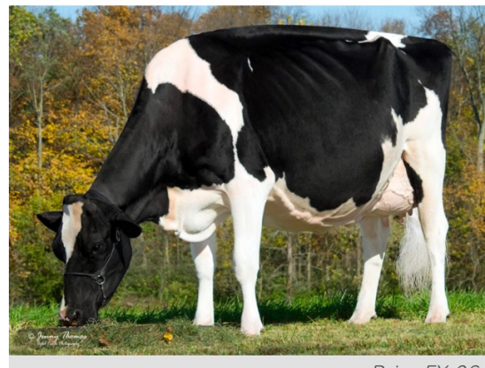
2 nd Dam