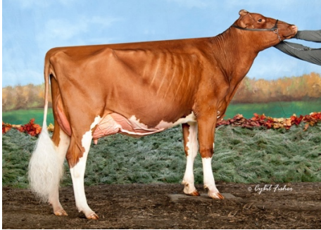
Full Sister to Dam EX 93