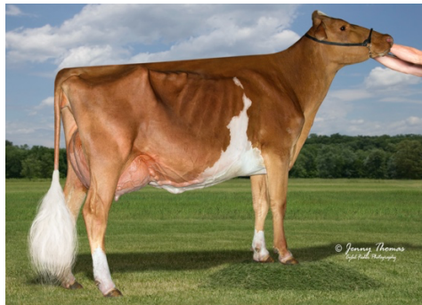
2 nd Dam