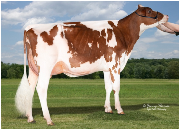
Full sister to embryos VG 88

Embryos from sexed semen Moovin X Infra EX 93 Embryos are located TOG- MD