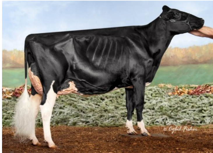
2 nd Dam

S: Duckett Pfct Has It All-ET D: Cheers Avalanche Chakira-ET EX 92 2 nd D: Unique Dempsey Cheers EX 95