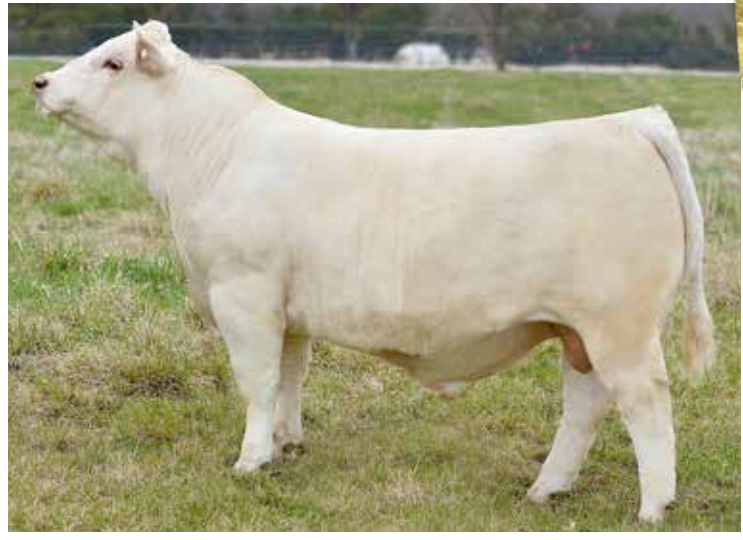
CCC WC RESOURCE 417 P Sire of Lot 29