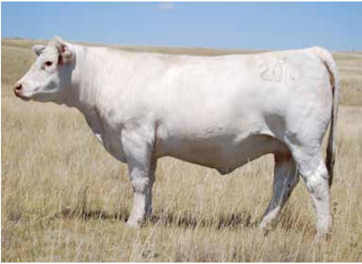
JDJ MS CIGAR B2011 P ET Dam of Lot 8

Sells bred A-I on 6/4/20 to DJJ Maximo A18 P, (homozygous Polled), and PE from 6/25/20 to 7/31/20 to RS Mr Smokin Asset D6. First calf, Waygu sired, weaned 8/3/20 and kept. This long-necked, square hipped young female is very correct, feminine, and after weaning, still shows a great udder quality. She does have good size, very strong maternal genetics. Ranks in top 6% for WW, 9% WW, 4% CW, 15% for both Marb and TSI for EPDs.