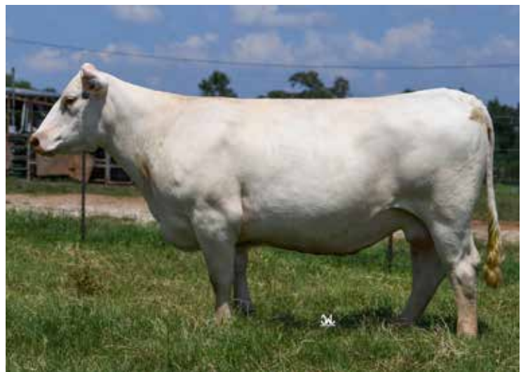
CLINK MS 468 REWARD 811 Sells as Lot 24

PE from 12/1/19 to 3/1/20 to SAT Liberty 6209 P. A true brood cow, 468 always has a tremendous calf. A weaned heifer out of her sold for $3,000 and her last bull sold for $7,000 in the 2019 Saterfield Sale. We're keeping last year's heifer to replace her. Her dam was one of our featured donor cows producing 13 calves and 468 has a great calving interval of 9/16; 9/17; 8/31; and 10/2.