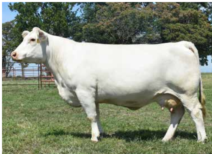
RE MS DUKE 745 ET Maternal Grandam of Lot 12