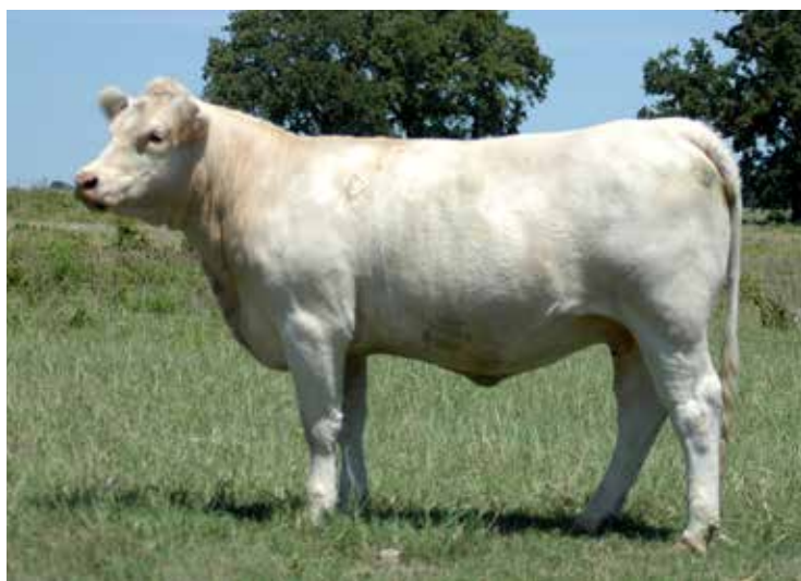
RE A REAL DUCHESS 154 ET Dam of Lot 50 Embryos

Selling 2-conventional embryos from mating of CJC Mr President T122 x JDJ Ms Dynasty L428. Probably the last opportunity to invest in one of the most proven and productive donor cows in the breed, L428. Her progenies have topped many sales and several of her sons are still contributing great genetics to many herds. President daughters have become some of the top broodcows in the industry. The high selling bull at DeBruyckers in 2020 was out of a President Daughter. The great thing is his bull calves are also awesome!