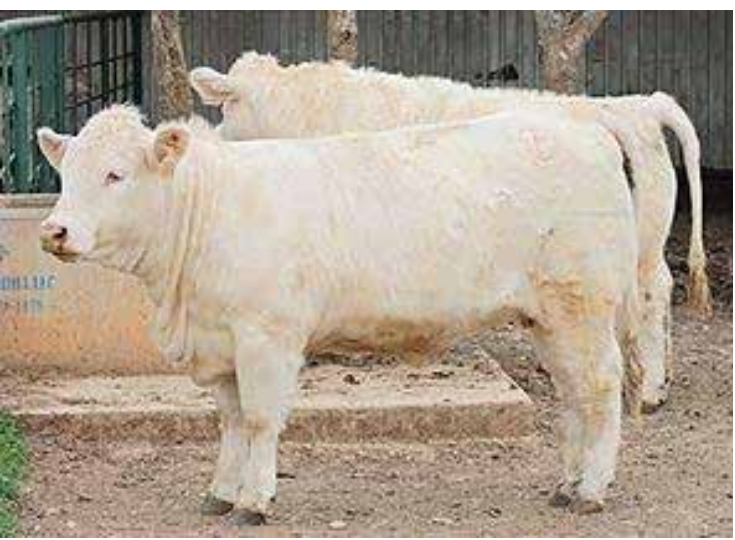
MS PC CLOVER LEAF Sells as Lot 18

Sells Open, another exciting Solera daughter with a different combination of the popular TR Mr Outkast and Diablo on the top side. You love the style, correctness, femininity, strong top, and extra muscling exhibited by these elite Solara daughters. Also top in CE and BW EPDs at a ranking of top 15% in those traits within the breed. Another great young heifer to add for more power, prestige, and productivity.