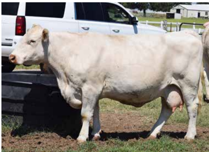
WELCOME GROVE VELVETTA ET Sells as Lot 79

PE from 2/1 to 6/13/20 to SKS New Rep F01, a Field Rep 2158 son out of a M6 New Standard cow tracing to Cigar and Wind in the background. A balance of performance traits and maternal is expressed in this female with a negative BW and ranking in the top 25% of the breed for WW and YW in combination with ranking in the top 5% for milk and Total Maternal She is sure to be a driving force for your herd.