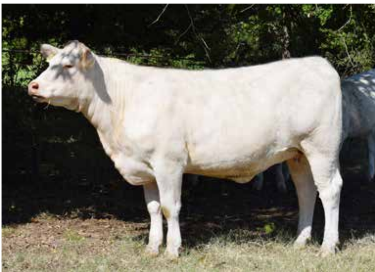
NKR 4021 MS CURLIN LEDGER 1875 Sells as Lot 67