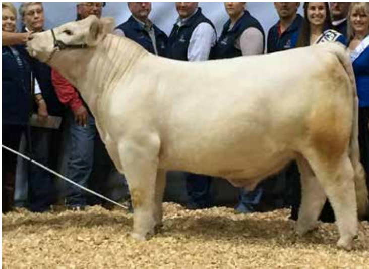
TCCS SAINT CHRISTOPHER Sire of Lot 74

Sells Open. If an outcross cow family is what you are looking for then here is your female. stemming back to the Cobb ABC Latora Lazodoble cow which was the pick of the herd for Riverdale and Hudspeth as well as produced many sale toppers. This female will combine Ledger, the 6100 female, and the legendary JDJ Smokester J1377 P ET. She expresses balanced traits and a proven cow family.