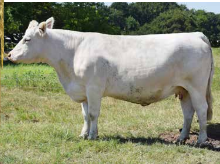
BRP MS REVELATION B02 PLD Sells as Lot 80