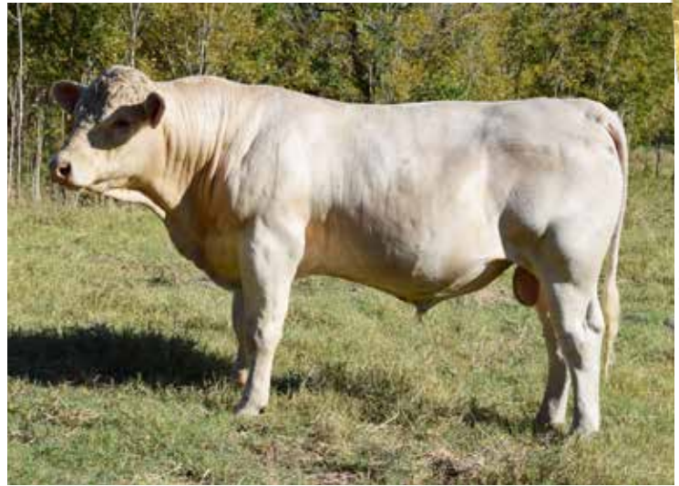
BAR M'S ANNA'S EL TORCEDOR P95 Sells as Lot 5