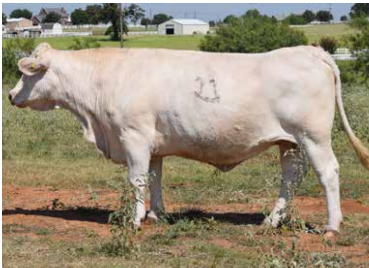
HC MISS GRID TRADER 1021 Sells as Lot 75