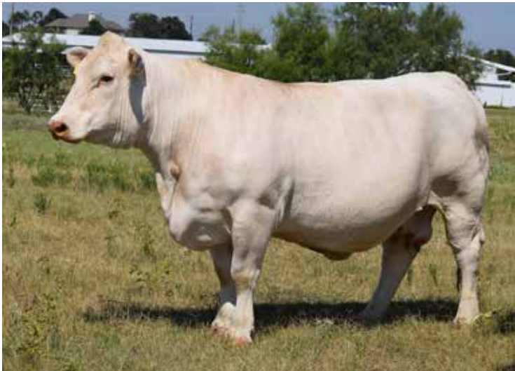
M6 MS STANDARD 462 PLD Sells as Lot 81

PE from 2/1 to 6/13/20 to SKS New Rep F01. A very feminine, eye-appealing broodcow, clean-fronted, wide-topped, and great disposition. A granddaughter of the legendary 248 female which has made her mark all over North America. While combining this with the outcross genetics of the HOODOO ranch is sure to make a female to merit some attention.