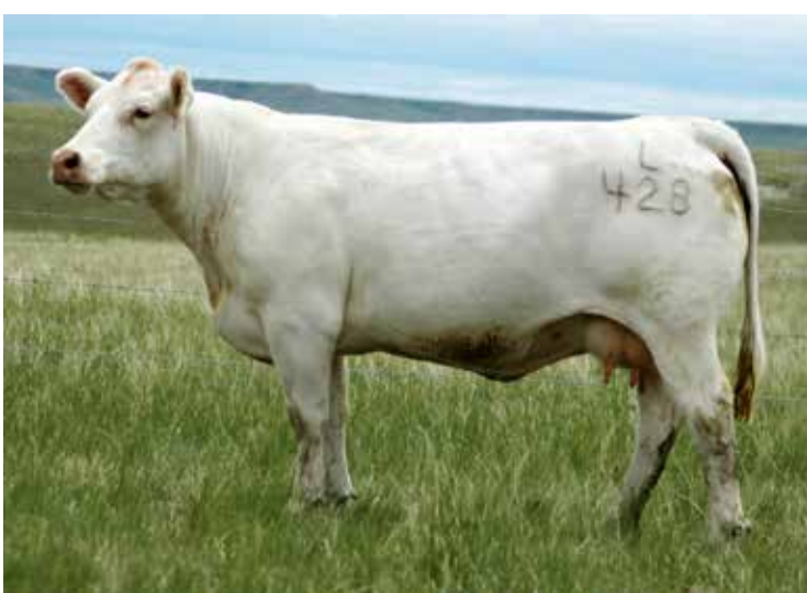
JDJ MS DYNASTY L428 Dam of Lot 82

PE from 2/1 to 6/13/20 to SKS New Rep F01. A direct daughter of New Standard out of a Field Rep back to a direct daughter of the infamous matron 6100 female. Ranking in the top 8% for 10 traits while ranking in the top 20% for REA and Marbling this female is sure to be a front pasture kind of female. A big soggy, big-boned cow with massive volume and a heavy milker.