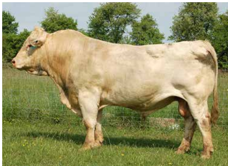
HF HI DEFINITION U08 ET Sire of Lot 46

46A: Pld bull calf, born 5/20/20, sired by CCC WC Resource 417 P. Sells Open. D187 traces back to the tremendous donor cow, JWK Gallicurci G072 ET. Equally impressive was her daughter and dam of D187, Ms Galli Jo ET. This stout, stylish bull calf will be a great addition to your herd. Hi Def has a proven record of tremendous progenies that perform, work for the commercial cattle people and will increase your profit picture.