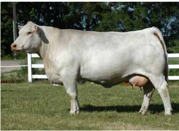
M6 MS E46'S DUKE 248 PET Dam of Lot 9

Open ET Polled heifer, selling 1/2 Interest and Full Possession. Dam is the remarkable B2011 that has been a tremendous Flush cow, often producing over 20+ number 1 embryos per flush. Her calves are well sought after, Kyle Reaves purchased her Kincesm heifer in the 2019 Sale of Excellence to top the sale at $9750.00. These Braxton calves are awesome, with super eye-appeal, style, correctness, with superb thickness, great dispositions, and has been a good calving sire! Tom believes she has real donor potential in her future!