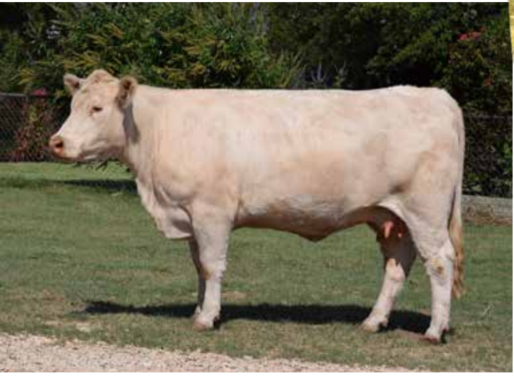
WC SOLERA 6188 P ET Dam of Lot 17

Sells Open, full ET sib to lot 16, same great potential for exciting progenies from these two outstanding broodcow candidates. A calving ease EPD of +12.3 is in the top 5% of breed, along with top 5% for BW EPDs as well. Notice the 67 lbs actual birth weight. Good growth after birth shows tremendous performance. You can add Lemmie Ida to your fall breeding program.