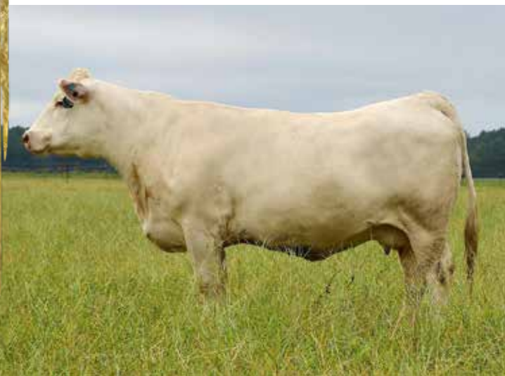
HEP MISS JOAN 27U Dam of Lot 25