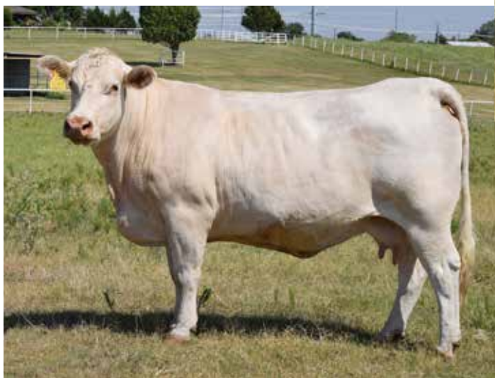
LC MISS GUNNER 0089 P Sells as Lot 76

Bred A-I on 1/8/20 to NKR Sir Duke 1425 P ET, PE from 2/1 to 6/13/20 to NKR Sir Duke 1425. Duke is an own son of VCR Sir Duke 914 and Rick Evans' great donor cow, RE Ms Duke 34 ET by LHD Cigar. An outcross pedigree with a balance of performance numbers and a prolific set of carcass numbers for this balanced female. This female also combines a large SC to ensure maturity as well as a highly expressed milk and MTL.