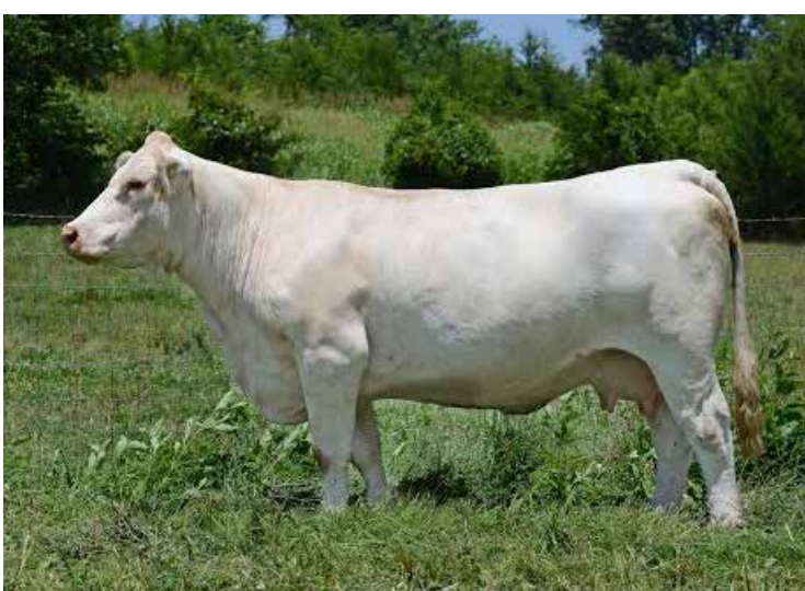
M6 MS E46 QUALITY4242PET Dam of Lot 27 Embryos

PE from 11/23/19 to sale to BC E46 Duke B01 P ET, "The DUKE". The masterful mating of Zen and THE DUKE will undoubtedly produce one of the top individuals! Majority of the top selling bulls in DeBruycker's annual bull sale are out of Zen daughters. The Duke's have great udder quality, look at Rocking S's lot 53 to see one in production. The Credit bull was one of the top sons of CJC Trademark H45!