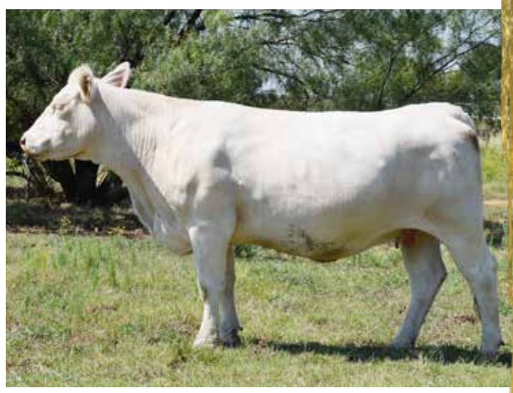
NKR MS A18 DYNASTY 1532 PET Sells as Lot 83

Bred A-I on 1/8/20 to LT Patriot 4004. A full sib to lot 82, her daughter sells as Lot 69 to evaluate the whole cow family. The mating to Patriot should be an ideal combination. The L428 daughters are very feminine, smooth-made, and moderate frame. L428 lived to 18 years of age and greatly contributed to the Evans' program and many more.