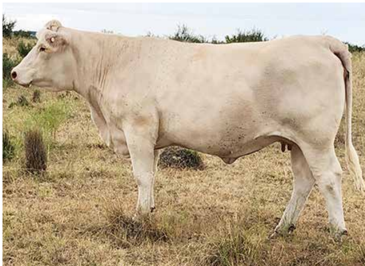
RE REALISTIC DYNASTY 714 Sells as Lot 34

Safe in calf to A-I Date of 1/13/20 to Sparrows Braxton 519C. The more of the Braxton calves you see, the more you want of them. So complete, stylish, easy calving. The 510 bulls is making a name for himself! A son of L428 and Maximo, his calves have same great conformation and style! The 14X cow traces to the F703, the dam of Howard Rambur's herdsire, CJC New Trend L1630, a top selling bull at DeBruycker with over 291 natural calves.