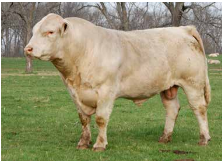
1A MR SANDMAN BY ACE 809 P Sire of Lot 89

Bred A-I on 6/26/20 to LT Patriot 4004. 1754 ranks in the top 15% for WW and total MTL while ranking in the top 20% for YW. Here is a cow which will add performance to the cow herd and with a calf by one of the top performance sires in the breed, Patriot, this combination should enhance any program.