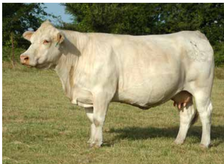
CJC MS CIGAR N385 Dam of Lot 47 Embryos