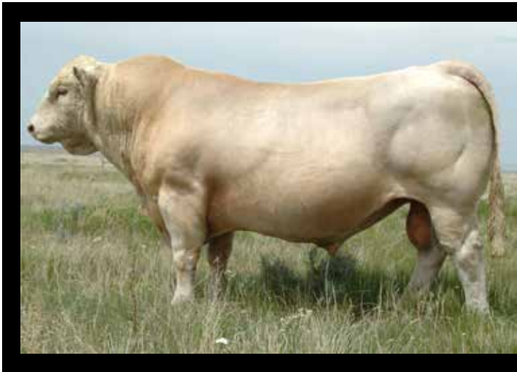
LT BLUE VALUE 7903 ET Sire of Lot 95 Embryos

Selling 1-Embryo from mating of JDJ Equity Z370 P x D&D Clarice 2809 Pld ET. This could become an awesome progeny with the $32,000 Equity, the sire of the $50,000 BHD Asset B178 and Clarice, the dam of many high sellers. Includes heifers to Sara Shepherd, $21,000, Hudspeth Farms $9,000, and many others, including some influence in this sale!