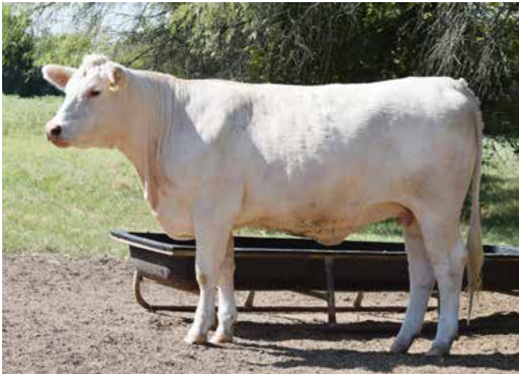
KNR 1425 MISS ROSEALE REP 1876 Sells as Lot 66

Selling Full Interest and Full Possession. A different genetic setup with this Rhinestone son giving you something different to work with. He will have great value next year as a sire. Dam sells as lot 89, out of a Trait Leader sire for calving ease, 1A Sandman.