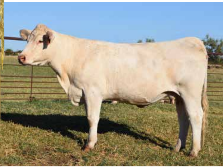
BAR M'S SUNFIRE DANCER P82 Sells as Lot 7