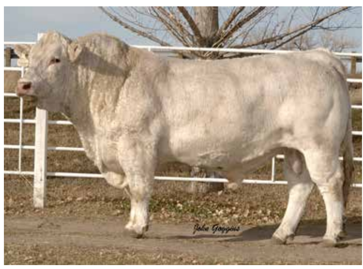
CJC TRADEMARK H45 Maternal Grand sire of Lot 30

Sells Open. A very solid bred prospect with abundant broodcow potential. The CJC Safelite M620 was one of the most massive, thick bulls in the DeBruycker herd bull battery. He sired some tremendous females. The dam of this cow was a "pick of a load of females purchased from DeBruycker". The top side represents great Happy 11 developed genetics