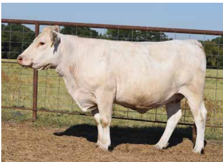
HEH AGATHAS DUCHESS 15 Sells as Lot 21

Sells bred A-I on 12/18/19 to Sparrows Braxton 519C, DUE 9/25/20. Lady Asset is already making a very desirable udder, proper teat placement, balanced, and comes from a good milking cow. This heifer has a good wide-top, plenty of depth and spring of rib, and square tail head. Her extended neck shows abundant femininity and gracious style. The Asset's are becoming known for calving ease and super milking ability. Her Braxton calf should be awesome!