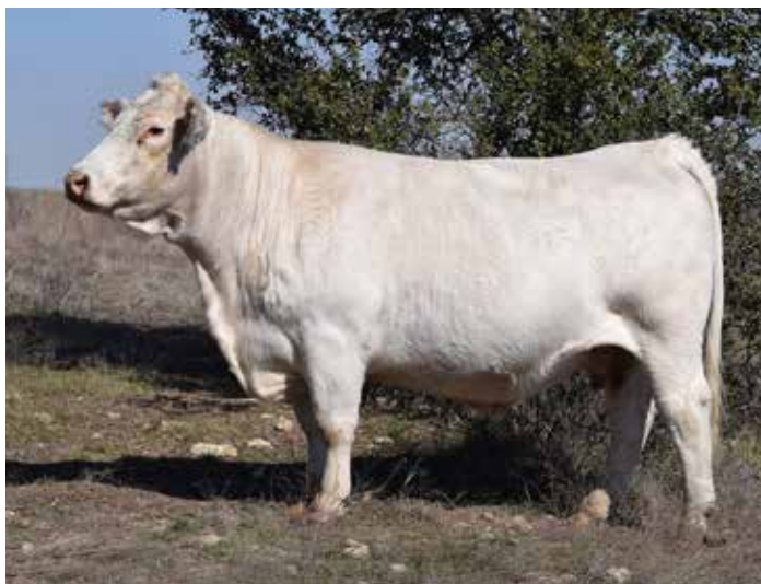
RE MISS CIGAR 12B ET Dam of Lot 33