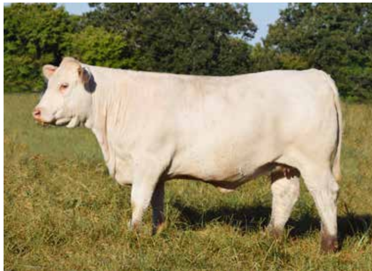
RS MS TIPPER BRAVO G192 Sells as Lot 52

Wow! A tremendous ET heifer sells Open, ready to breed. A paternal sib to M6 New Standard 842 P ET, this heifer should be on everyone's list to purchase! Rio Bravo is also the sire of LT Ledger 0332's dam. G192's dam is one of Double H's top donor cows, Tipper 026X, a daughter of the legendary M6 Ms E46's Duke 248, donor cow now at Southern Cattle Co. Great numbers and pedigree enable you to go far with the genetics represented here.