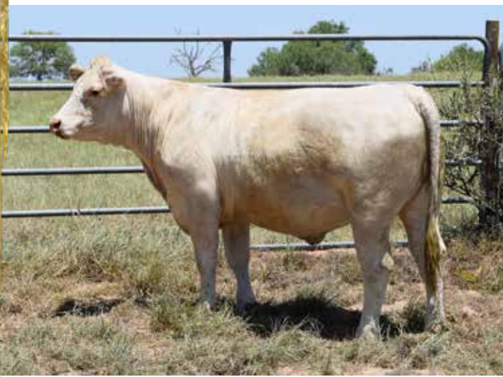
MARA MS ILLUSIVE ASSET 54E P Sells as Lot 42