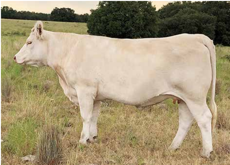
RE FORTRESS 748 Sells as Lot 37