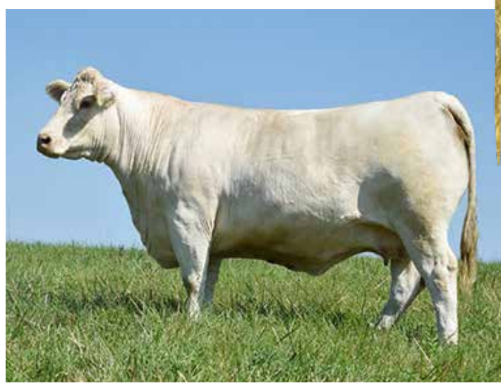
MV 2070 DUKE CIGAR 331 Dam of Lot 28 Embryos

Selling 3-Embryos from mating of JDJ Maximo A18 P x MV 2070 Duke-Cigar 331. Both remarkable animals in this mating are homozygous Polled for a very valuable genetic advantage! 331 donor has great numbers and a very superb past of proven ability. Her dam was a top selling lot in the Southern Connection sale, going to Bruce Roy, and her daughter, a full sib to 331, was the 2nd high selling lot, also going to Bruce Roy. The 2070 Cigar cow was perhaps one of the best Cigar cows in the breed.