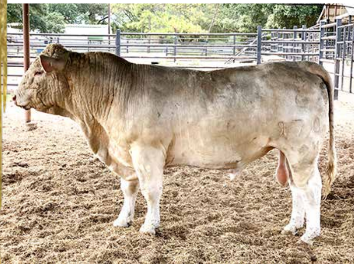
MR LP ALLSTATE G970 Sells as Lot 1