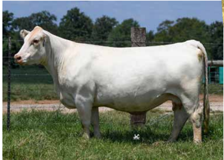
CLINK MS 424 REWARD 8013 Sells as Lot 23