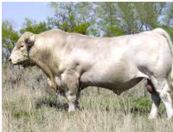
MS GRID MAKER 104 PET Sire of Lot 10

Open ET Polled Heifer, retaining one successful flush at buyer's convenience. Another tremendous donor prospect with these powerful credentials! You seldom get this stout opportunity to add such elite genetics to your herd. You definitely don't want to miss out here! A true POWER move would be to take both of these top females home, even if you had to cull the bottom to replace with these. If you a breeder and not a multiplier then these should be a great attraction. This heifer would be a full sib to M6 New Standard's dam!