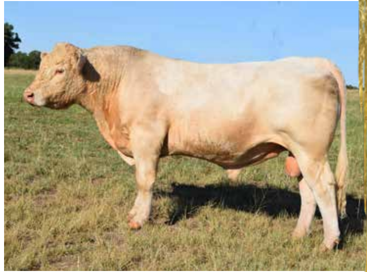
BAR M MAXIMUM FIRESTORM P M73 Sells as Lot 4

Selling full Interest and Full Possession. Fertility and Trich tested. A very complete, smooth-made, structurally correct bull with good feet and legs. Good balanced numbers with the tremendous eye-appeal known for Maximo progenies. His solid pedigree of leading genetics adds great confidence in breeding, selling, and siring very desirable offspring. Rapid Fire was a tremendous winner in the show ring. R2033 a Dam of Distinction.