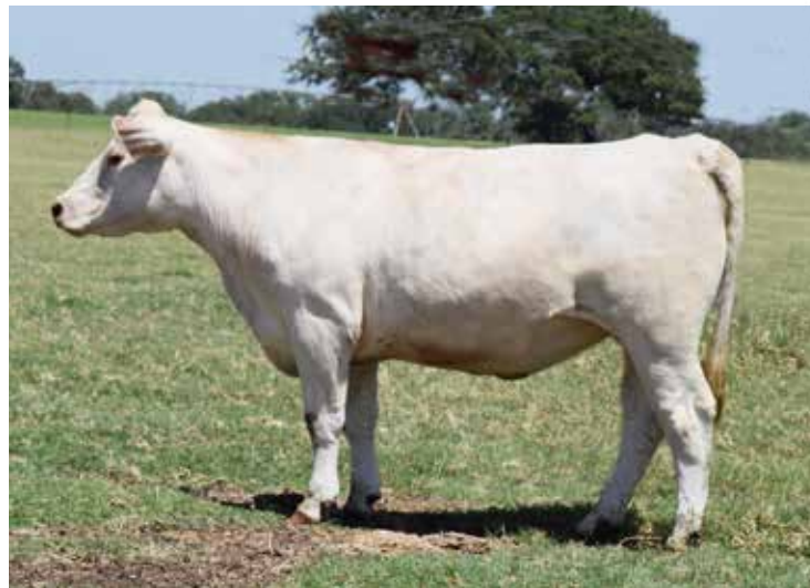
BARA MS M09 CIG MAX 5F P Sells as Lot 40