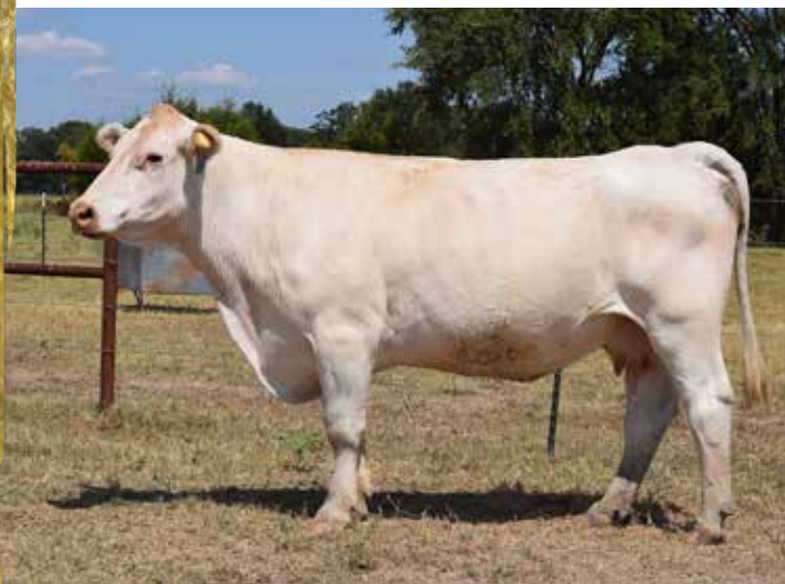
DOUBLE-H MAMIE 312ET Sells as Lot 19