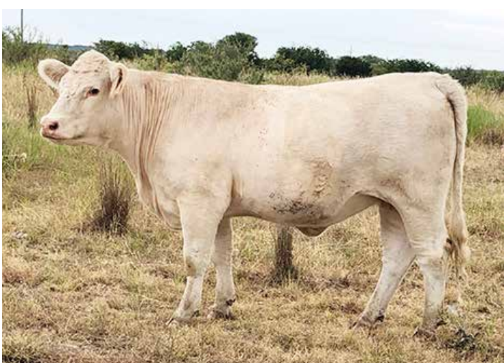
RE PERFECT ASSET 856 Sells as Lot 38