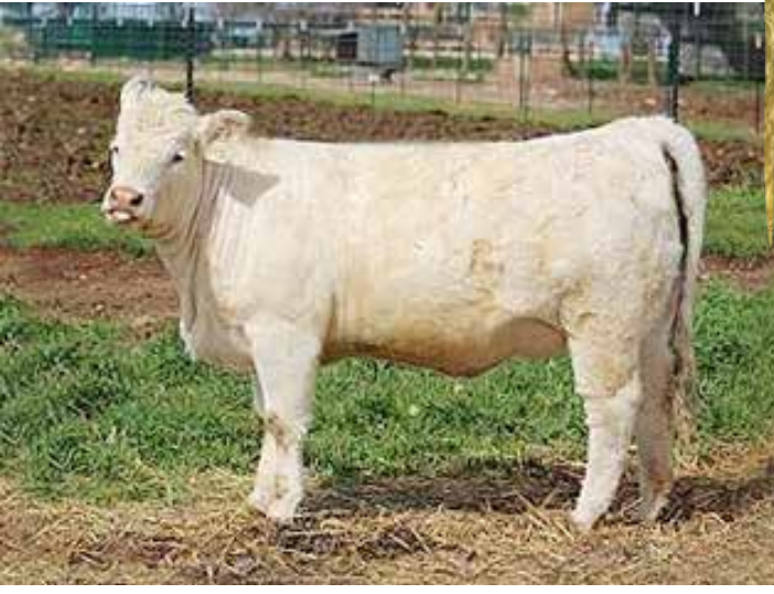
MS DOROTHY NELL Sells as Lot 16