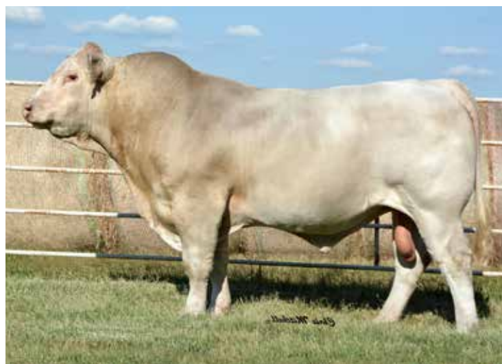
BHD ASSET B178 P Sire of Lot 41

Bred A-I on 2/21/20 to JDJ Maximo A18 P, safe in calf. 40E is out of a very good producing Cigar x Clarice 2809 mating and the homozygous Polled Asset. This moderate female displays abundant femininity, with a strong top. Arlitt have two Cigar-Agatha daughters that will not be leaving the herd, they are just that good! 40E ranks in the top 15% EPDs for Milk, top 25% for MTL, and top 35% for REA.