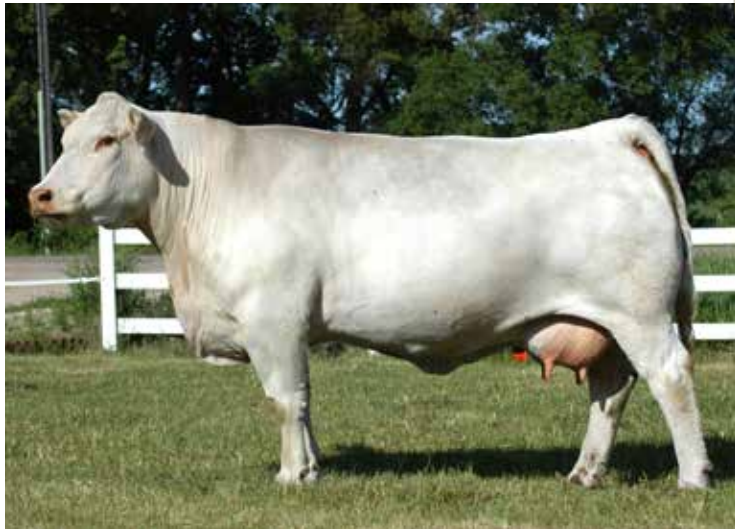
M6 MS E46'S DUKE 248 PET Dam of Lot 92

Selling 3-embryos from mating of M6 New Standard 842 P ET x M6 Ms E46 Duke 248 PET. This is the kind of mating that should appeal to any serious Charolais breeder! History of the breed has been written by these two outstanding individuals. Both have produced high selling offspring, show winning progenies, and used in many programs all over the U.S. Lot 9 shows you exactly what you can expect from this mating!