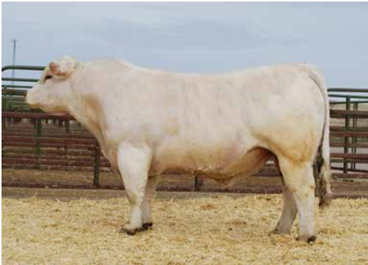
BHD ZEN X270 P Sire of Lot 26