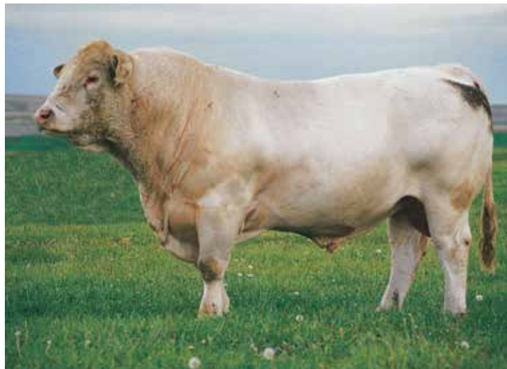
LHD CIGAR E46 Sire of Lot 11 ET Calf

DUE approximately 9/2/20. Another "put you on the map" genetic opportunity! 1145 was the high selling female in the 2016 M6 Sale and a daughter sold for $36,000 in 2017 M6 Dispersal sale with a full brother to the heifer topped out at $30,000. 1145's offspring totaled $165,000 in the dispersal sale! Cigar offspring continues long after he has gone to command top prices at almost every sale a daughter is entered. A masterful mating!