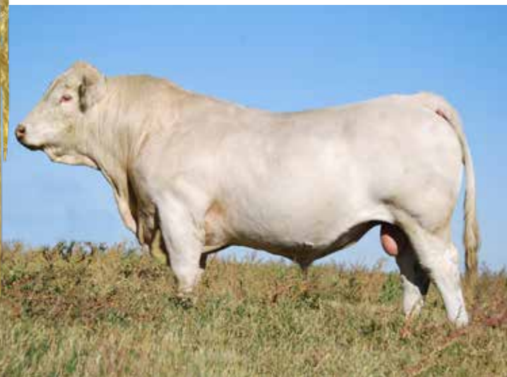
CJC MR PRESIDENT T122 Sire of Lot 36