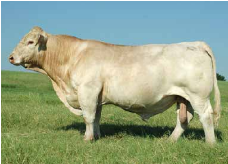
SR/NC FIELD REP 2158 P ET Sire of Lot 58