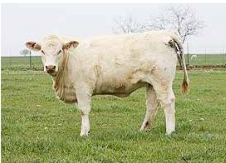
MS PC PAMELA ANDERSON Sells as Lot 15