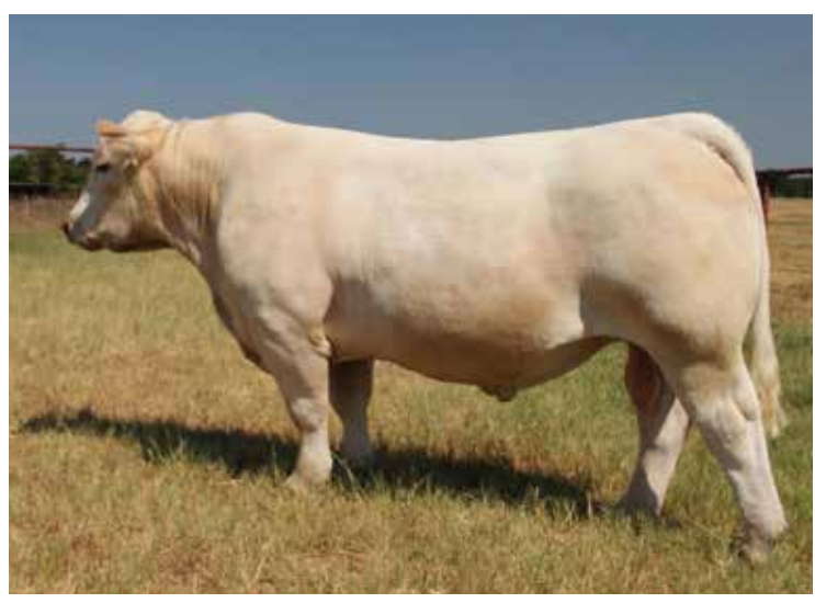
M6 BELLS & WHISTLES 258 P Sire of Lot 85

Sells Open, dam of Lot 73 Saint Christopher heifer, 6172 is a female with calving ease, growth, and Carcass merit She expresses a balance of statistical information while having the line bred genetic make up of the SR Lady Ease 914 which made her mark in many herds as power cow with balance and symmetry.