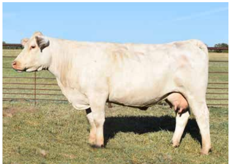
CWC MISS MARY 617 Sells as Lot 6

Pld bull calf, # 007, born 3/23/20, bw 87 lbs, sired by RS Mr Smokin Asset, M880457. Bred A-I on 6/4/20 to TR Mr Firewater 5792R. PE from 6/25/20 to RS Mr Smokin Asset D6. This powerful bull calf shows the tremendous ability of Smokin Asset, one of BHD Asset B178 greatest sons. Mary is a heavy milking cow with ideal frame size and correctness. Another great disposition female from Bar M with easy fleshing ability and out of the incomparable Slam Dunk 3113 sire.