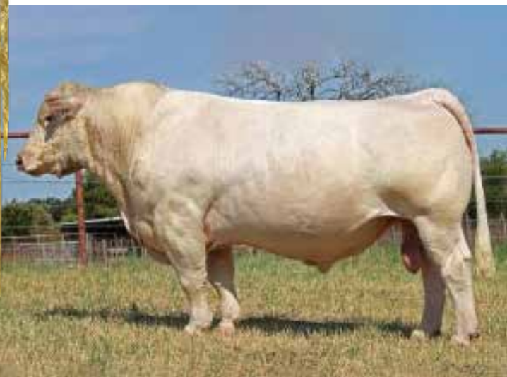
M6 COOL REP 8108 Sire of Lot 13