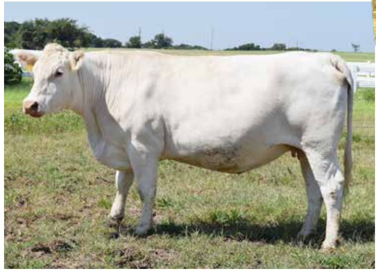
M6 NEW GERMAINE 6160 P Sells as Lot 84

Bred A-I on 1/8/20 to NKR Sir Duke 1425 P ET, PE from 2/1 to 6/13/20 to NKR Sir Duke 1425. Numbers is what this cow has to offer while combing the breed leading sire New Standard and the foundation matron Lady Ease 914 which is duly noted for making power cattle with eye appeal and statistical makeup which is unmatched.