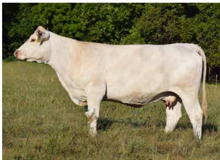
LWF JUNEBUG 1206 Sells as Lot 53