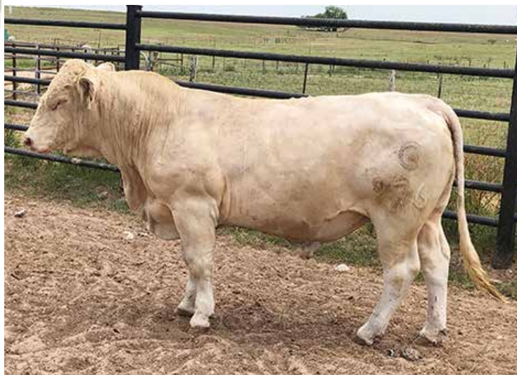
LP MR ALLSTATE G976 Sells as Lot 2