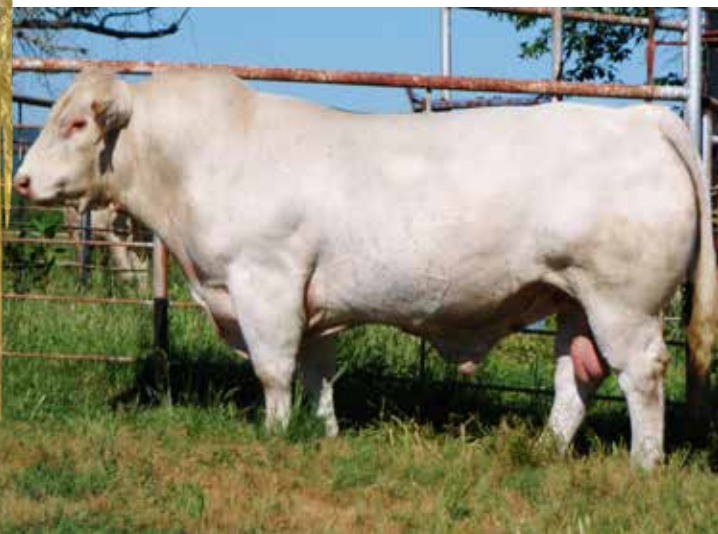
COOLEY ROYCE 1107T39 Paternal Grand sire of Lot 31