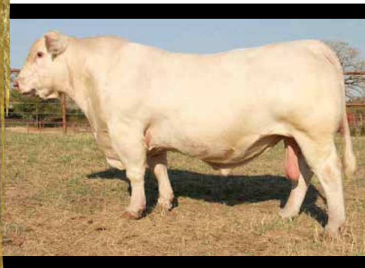
M6 NEW STANDARD 842 P ET Sire of Lot 48 Embryos