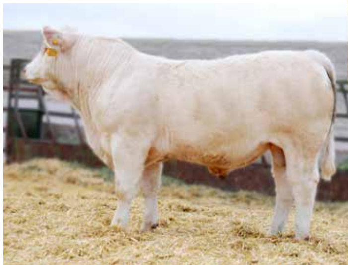
JDJ EQUITY Z370 P Service Sells as Lot 51

Very limited amount of semen on this tremendous proven sire. A very easy calving bull, (EPD for CE 11.0 and BW -1.2), and he adds tremendous style and eye-appeal to his calves. His dam traces back to Cigar and Smooth Deal. His sire, BHD Cobalt has been a cornerstone of tremendous females and sires at DeBruyckers. King D2503's dam is a Cobalt daughter. She topped the 2020 Sale of Excellence at $20,000. The high selling bull in 2020 at DeBruycker, Sugar Daddy, is out of a President daughter out of a Cobalt cow!