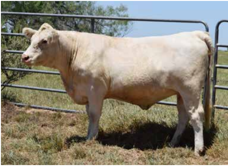
BARA MS ANGEL ASSET 56E ET P Sells as Lot 43