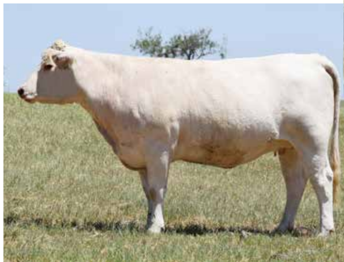
CWC ZENTASTIC 738 Sells as Lot 39

Bred A-I on 2/21/20 to JDJ Maximo A18 P, safe in calf. This is what a broodcow should look like, a beautiful pattern of femininity, moderate size with extra performance. She already displays an exquisite udder quality with skeletal correctness. Her dam is a out of a full sib to JDJ Smokester, JDJ Academy K890 ET. Kentake 503 is out of the 9419 Morley cow that was a high selling lot in one of the first Sale of Excellence sales.