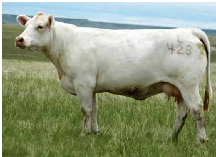
JDJ MS DYNASTY L428 Dam of Lot 49 Embryos

Selling 3-conventional embryos from mating of M6 New Standard 842 P ET x BC Ms E46 Bonanza 821 PET. 821 is a full sib to Thomas Ranch's great donor, Zsa Zsa, that has commanded record prices and produced progeny like TR Firewater 5792R, TR Firemaker 6062, and others. Firewater has been one of the most prolific sire of show ring winners! Think what a donor cow you could raise from this very elite mating!!