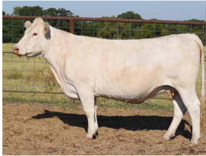
HEH MS SHOW MAKER C106 Sells as Lot 22