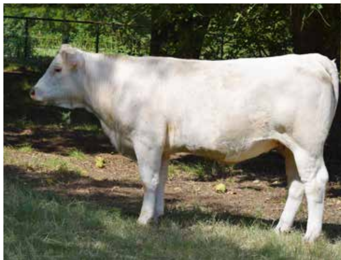
NKR MS 1650 LEDGER EDGE 1981 P Sells as Lot 68

Sells Open. The Nickers program here is a staple of their operation combining Tom's genetic blends. This female has some of the breeds power cows combining Ledger, 6100, and Evan's Duke 34 cow. This unique female also collectively composes a WW and YW EPD rankings in the top 35% of the breed while possesses the top 35% for marbling.