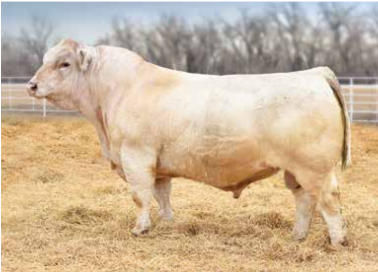
RBMFARGO Y11 Sire of Lot 14