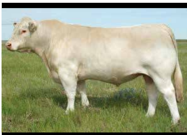
LT LEDGER 0332 P Paternal Grand sire of Lot 3