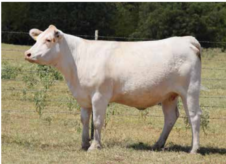
BAF/SCC LADY ASSET B1207 P Sells as Lot 20