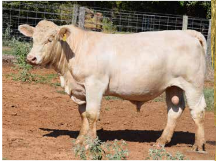
NKR NEW DUKE 1874 P Sells as Lot 59

This smooth bull will also be Fertility and Trich tested, selling Full Interest and Full Possession. His sire is the previous top herdsire on the farm, a Duke 914 son out of Evans' 34 donor cow by Cigar and CR Miss Duke 172. 172 was one of the all-time great donor cows in the breed. A very complete, thick-made bulls with good disposition.