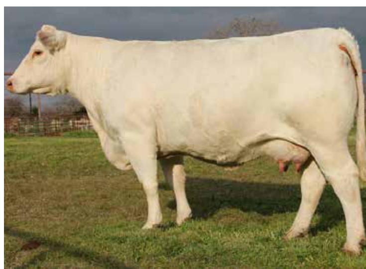
M6 MS 731 NANCY 6100 P ET Dam of Lot 93

Selling 1-Embryo from mating of LT Ledger 0332 P x M6 Ms 761 Nancy 6100 P ET. A gamble with just one embryo, but if you get it, you most definitely won't be disappointed!! It's line up the buyers! 6100 topped the M6 Sale the year she sold to Double-H and North Grove Charolais. Unfortunately, she didn't get an opportunity to produce as many offspring as they would have liked!