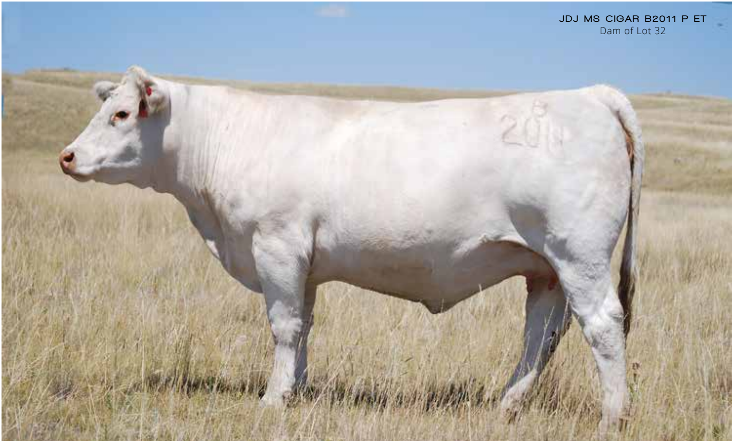
JDJ MS CIGAR B2011 P ET Dam of Lot 32

Sells Open. A paternal sib to lot 30, this heifer displays great femininity. Excellent growth numbers and a light birth weight adds value to this top female. The Trademark Y298 traces to Trademark on top a back to a Grid Maker 104 daughter out of a full sib to JDJ Smokester J1377 P ET, the K889 cow! Double Cool was used heavily in the herd as his calves really performed.