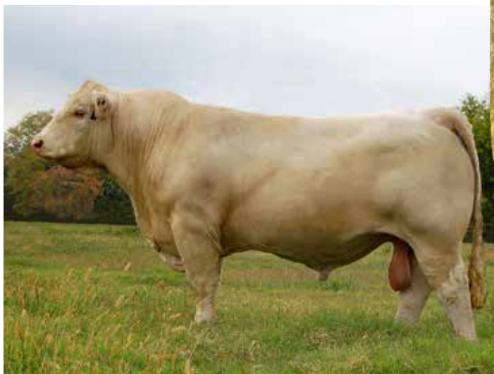
CWC TRIFECTA J825 Sire of Lot 45

45A: Pld heifer calf, born 5/30/20, sired by White River, EM854558, a Turton son. Cow will sell Open. Trifecta was a very complete bull with good disposition, good depth, and very good muscling. His daughters make great cows. The TOC Mr Duke is a full sib to WCR Sir Perfection 734, the sire of LHD Mr Perfect Y416. He was used by D&S in their elite herd and had 76 progenies.