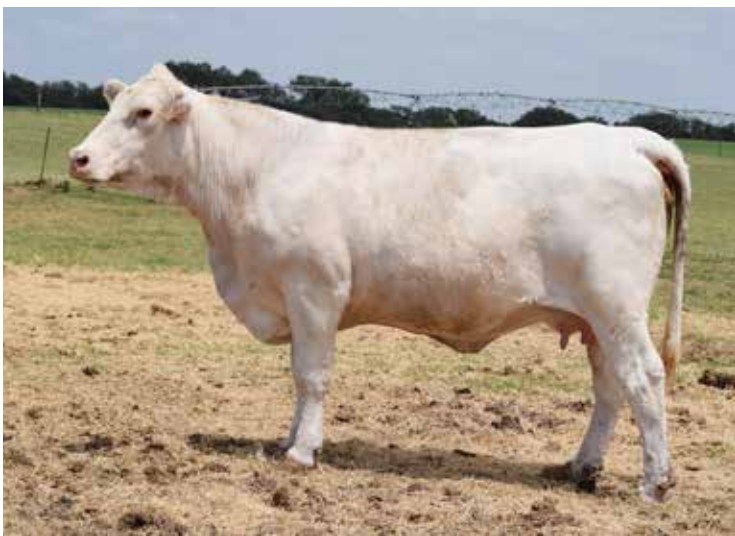
BARA MS ANGEL ASSET 67D P Sells as Lot 44

Bred A-I on 12/20/19 to JDJ Maximo A18 P, safe in calf. This is going to be a big, stout cow with plenty of natural muscling and volume. She traces to the great Ms Legend H124 donor cow that worked for Al Ragsdale, Double-H, Spring Ridge, and then back to Biggs and Hyde. Double H sold a $10,000 daughter out of H124 in the Sale of Excellence. Notice the Legend cow also traces to the Dynasty C584 bull, the sire of L428!