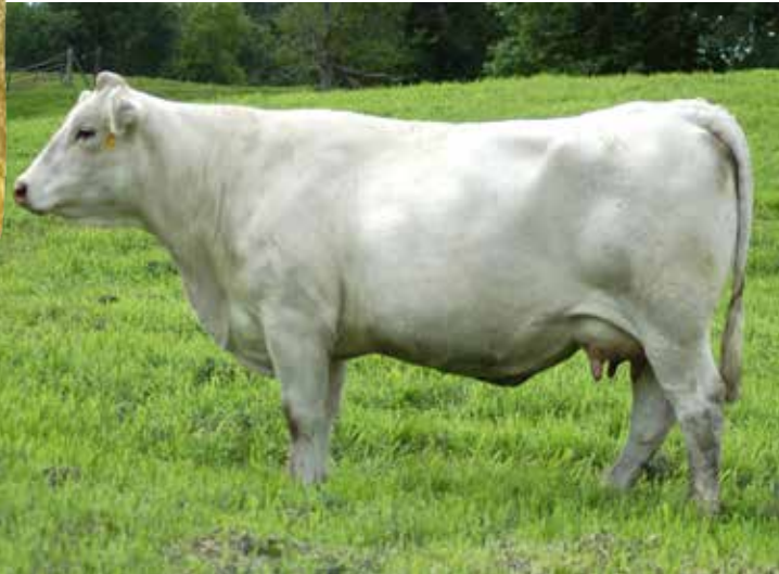
D&D MS CLARICE 2809 PLD ET Dam of Lot 94 Embryo