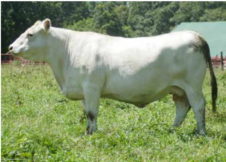
HALES MS GRID 717 Dam of Lot 96 Embryos