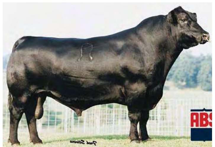
Leachman Saugahatchee Sire of Lot 68

Herd sire by Acclaim that has growth to make some heavy calves. Top 1% WW, YW, RADG, CW, $W, $F, $B, and $C. His calves will get it done all the way to the rail.