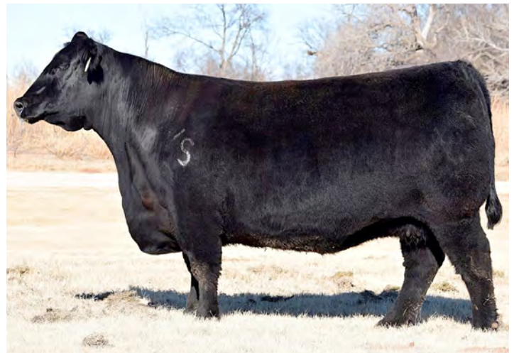
SLC Blackbird Power 804 Dam of Lot 18 Maternal Sister

Selling a young Blackbird Power Cow out of the ABS sire Basin Payweight 1682 and the Stevens Land and Cattle matriarch Blackbird Power 804 daughter. Maternal sister to Dam of 818, Blackbird Power 807 sold 1/2 interest for $90,000 to McWherter Farms in 2018. Examined safe to SS Enforcer due 3/19/21