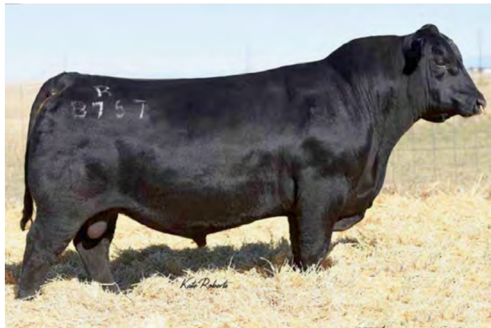
Tehama Tahoe Sire of Lot 12

A really growthy female with plenty of power and a pleasure to work with. A.I.'d to Deer Valley Wall Street May 6, 2020. Pasture exposed to Fore Big Time our Growth Fund Son from 6/15/20. Safe to A.I.