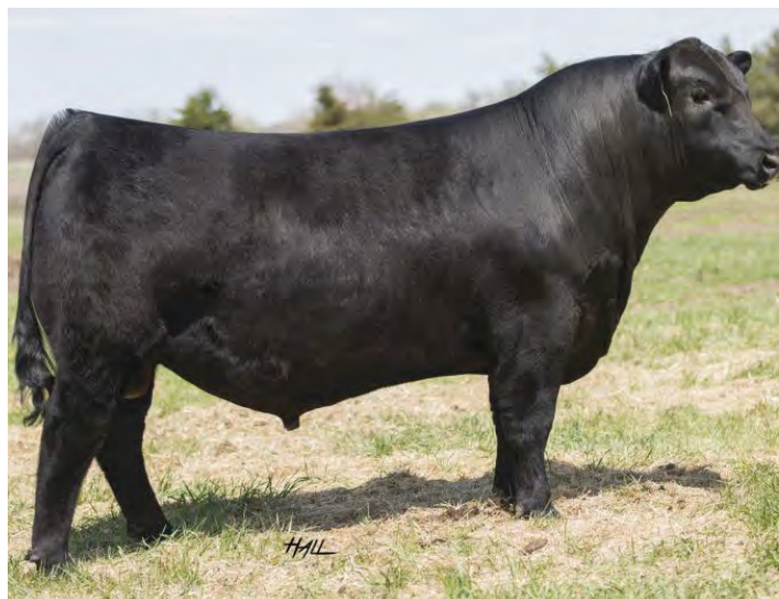
Barstow Bankroll Service Sire of Lots 13 & 15

This Jindra Double Vision heifer, out of the heart of our replacements, has great maternal potential and a great cow family to back it up. Bred A.I. 1/1/20 to Barstow Bankroll, pasture exposed to WDB Mr Bankroll 1651 1901, (Reg. # 19547614).