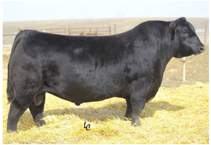
RB Tour of Duty 177 Sire of Lots 17 & 42

A big power cow with growth (1% for both WW & YW), top of the breed for carcass traits, and a $C in the top 1% of the breed! She has a beautiful udder with a large volume of milk, she will raise a big calf. C30 will calve by sale day to GB Fireball 672. The few Fireball calves that have sold this year have been sale toppers. The EPD's on this Fireball calf should be breed leading.