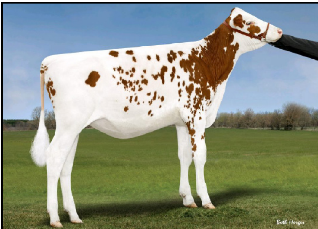
DJL PUREPRIDE A ANGIE-RED-ET - DAM OF LOT 20