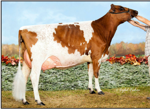
GOOD-VUE DEMPSEY GIZEL - DAM OF LOT 19