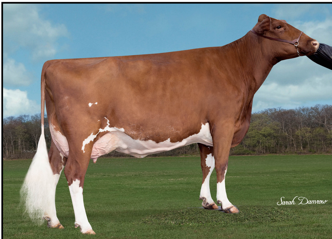
INNISFAIL-WO MEGA LOVE SONG ET - DAM OF LOT 14