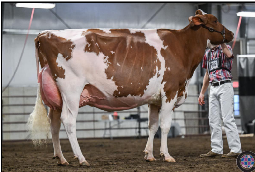
SYNERGY SPIKE SEQUEL - SAME FAMILY AS LOT 17