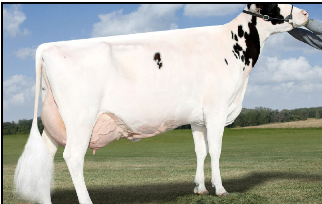
AL-SHAR ENCOUNTER SCARLET-RED - SAME FAMILY AS LOT 16