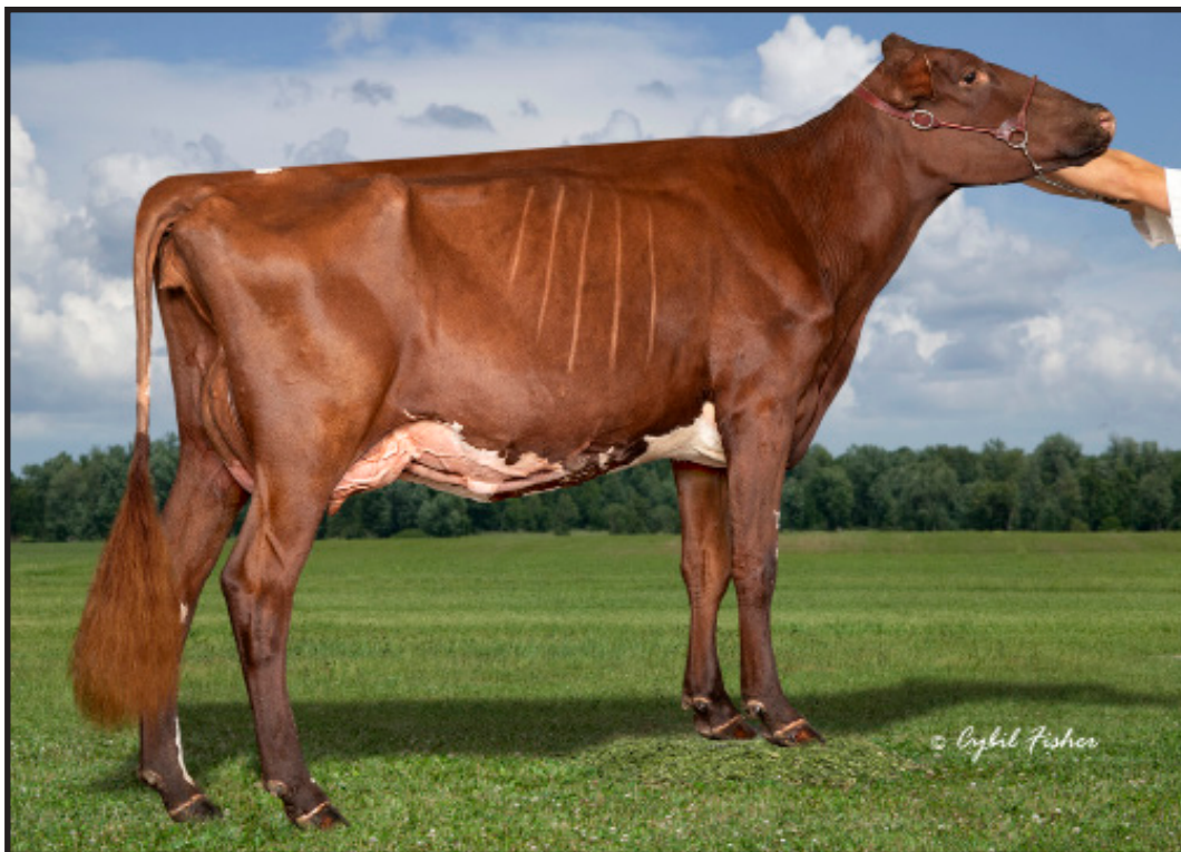
RTB PRESTO LIBERTY ET - FULL SISTER TO THE DAM OF LOT 6