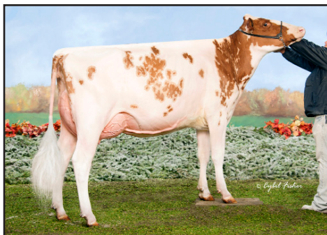
KARA-KESH-RK OUR GEM-RED

Nom Jr AA RW Sr 3 Yr Old '24 All-MN Holstein Sr 2 Yr Old '23 HM Jr AA RW Fally Yrlng in Milk '22 Member Nominated AA RW Sr Best 3 '22 Res All-MN RW Fall Calf '21 Daughter - Kara-Kesh-RK Alt Gaia-Red VG 85 @ 2-03 (Altitude) DMDBK GALA (SISTER TO GARNET) Nominated AA RW Jr 2 Yr Old '21 HM Jr AA RW Jr 2 Yr Old '21 Member Nominated AA RW Sr Best 3 '21 All-MN RW & Holstein Jr 2 Yr Old '21 2ND DAM - KARA-KESH-RK OUR GEM-RED Hon Mention Grand Champion, Res Int Champion, 1st Jr 2 Yr Old & B&O, Grand International RW Jr Show '19 3rd Jr 2 Yr Old, 1st B&O, Grand Intl RW Show '19 Res Jr AA RW Jr 2 Yr Old '19 HM AA RW Jr 2 Yr Old '19 Grand Champion, MW Fall Nat'l RW Jr Show '19