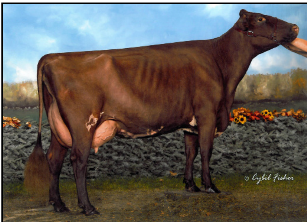
INNISFAIL RO LADY 5086-TW - GRANDDAM OF LOT 12 GRAND AT WDE