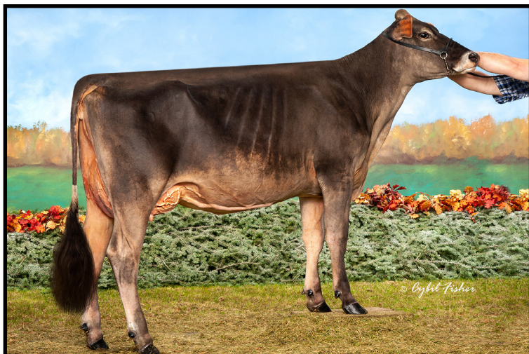
PIT-CREW DAREDEVIL KONA - MATERNAL SISTER TO THE DAM OF LOT 21