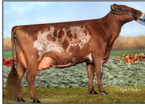
GOOD-VUE BURDETTE GENEVA - SISTER OF LOT 19