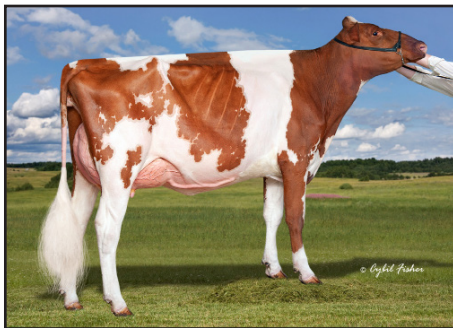
KARA-KESH-RK DMDBK GALA-RED