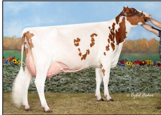
GOOD-VUE POKER GINNY EX - GRANDDAM OF LOT 19