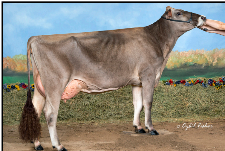
PIT-CREW THOR KARMEL - GREAT GRAND DAM OF LOT 21