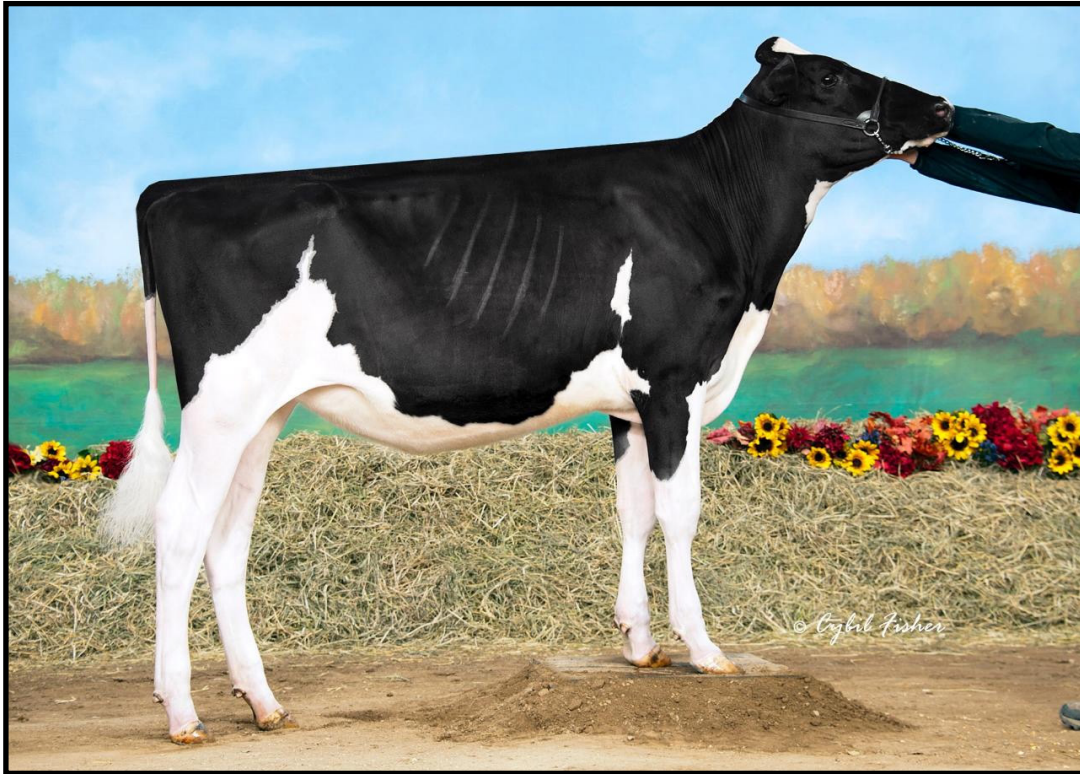
MS NMOUNO RELATION - SAME FAMILY AS LOT 9