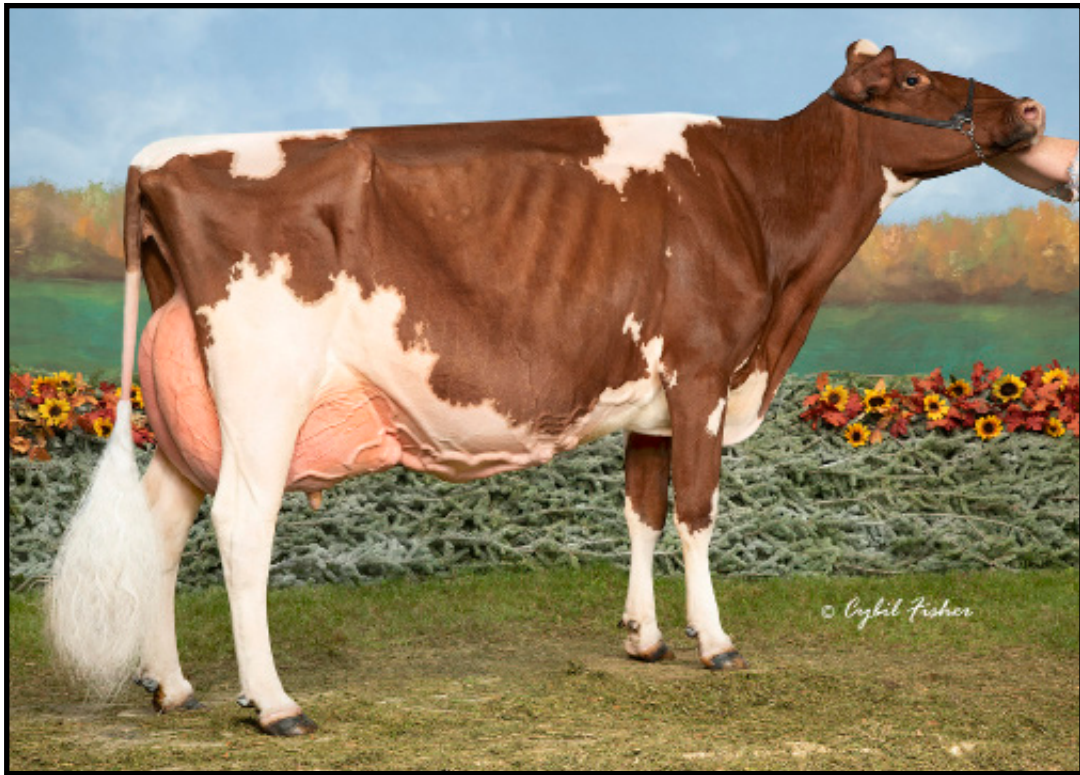
KING-LANE ABS ALWAYS-RED - DAM OF LOT 22