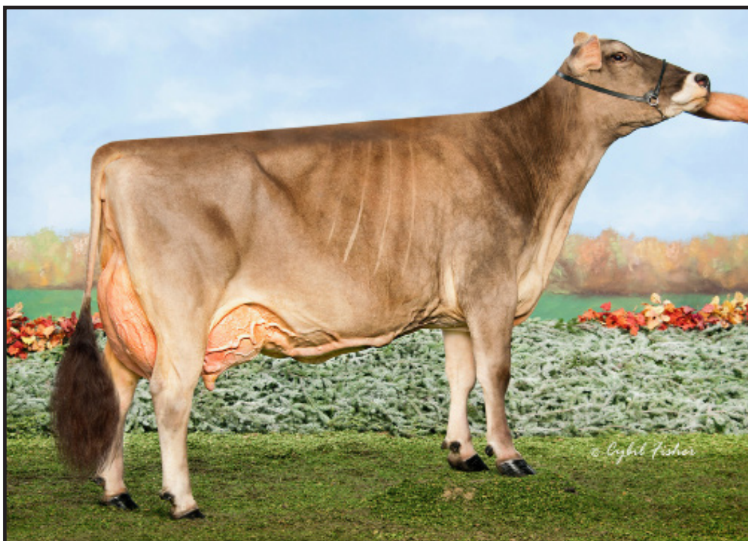
C&A SWEET WONDERMENT RUTH - SAME FAMILY AS LOT 5