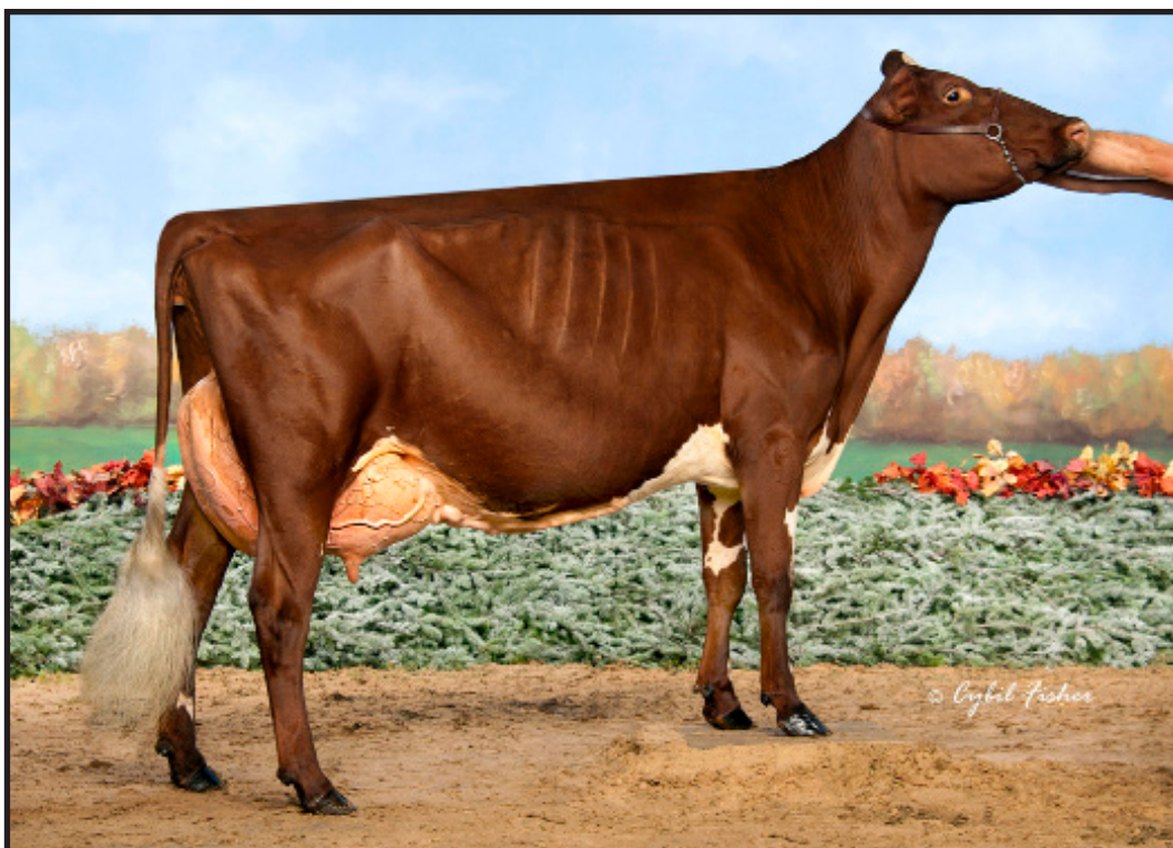
TRILOW ZEUS LALA-ET - FULL SISTER TO THE DAM OF LOT 8