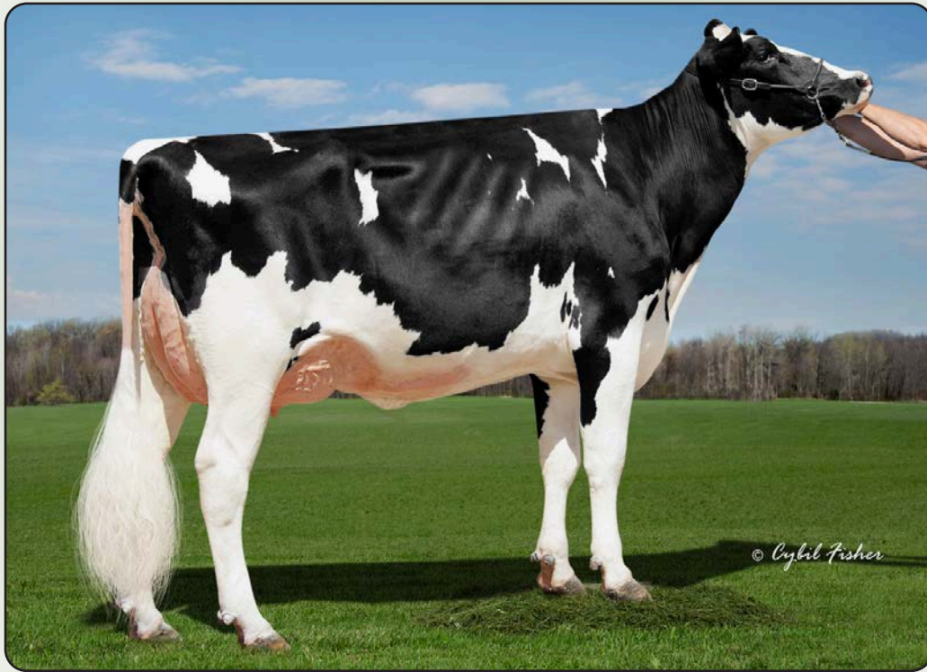
Ronelee Detour Barbie-ET "EX-91 EX-MS" Fifth Dam of Lot 2E