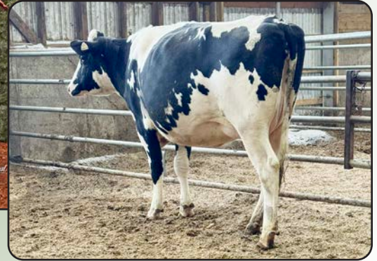
Jacobs Ranger-Red Shanny-ET *RC Dam of Lots 16E & 17E