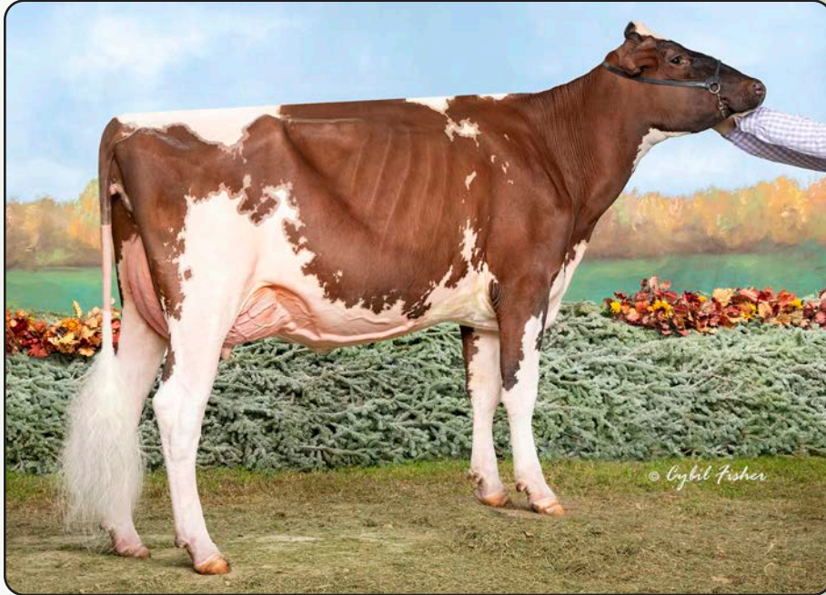
Cherry-Lor Robin P-Red "VG-89 EX-MS"

Int. Champion International R&W Show 2024