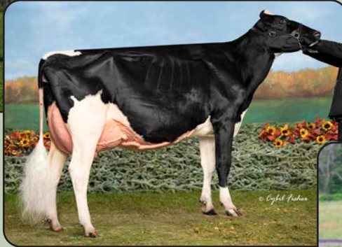
Budjon-Vail Raptor Sonya-ET "EX-93"

1st Jr. 2 Year Old Northeast Spring National Junior Show 2024 Dam of Lots 22E & 23E