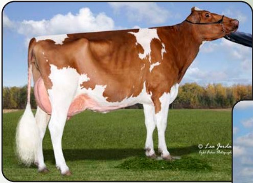
Luck-E Awesome Joy-Red-ET *PO "EX-93" Granddam of Lot 24E