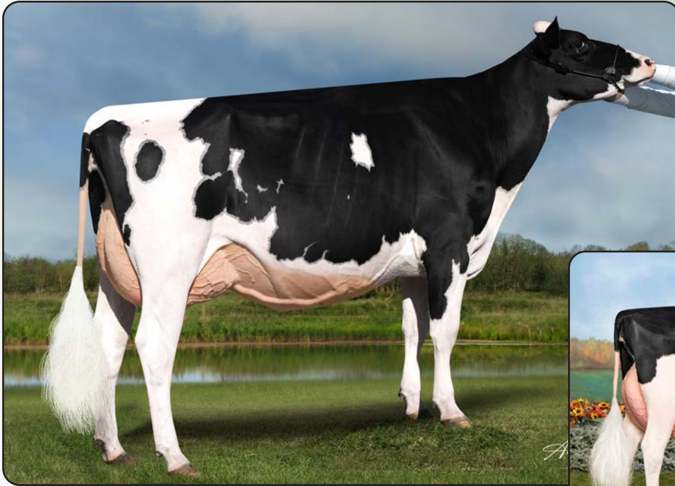
T-Triple-T-TC Perplex-ET "EX-92" 1st Jr. 3 Year Old & HM Int. Champion Eastern National 2024 Dam of Lot 11E