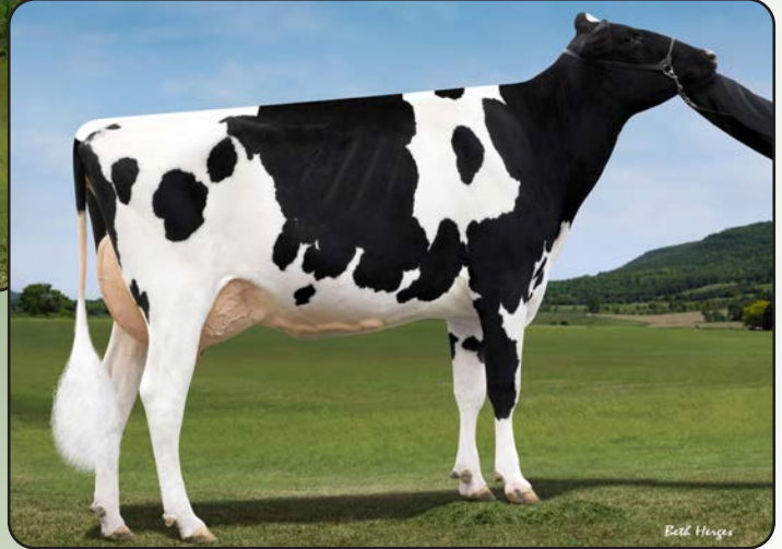
Maple-Downs Annabelle-ET *PO "EX-93 2E" Graddam of Lot 6C