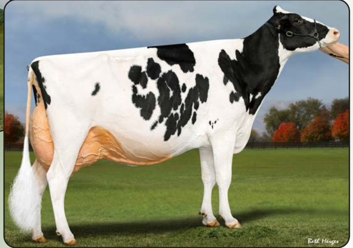
Farnear TBR Aria Adler-ET *RC "EX-96 2E" Unanimous All-American Lifetime Production Cow 2021 Granddam of Lot 8E