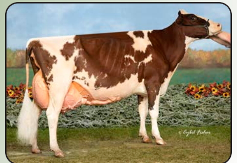
Cherry-Lor Ladd Ripple-Red "EX-95 3E"