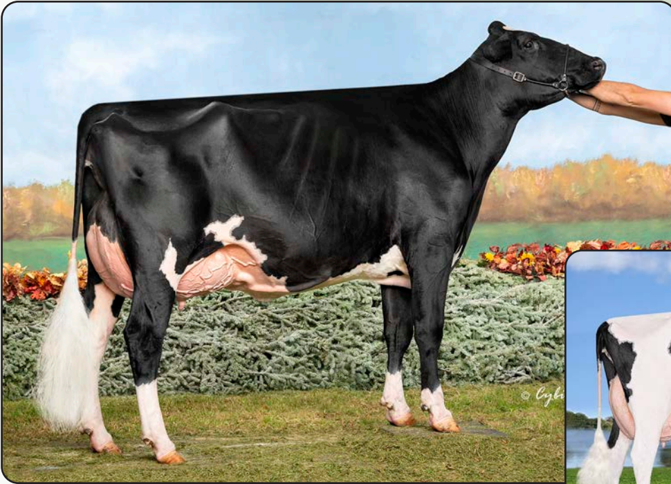
Kingsway Snazzy Jazzy-ET "EX-92 EX-MS" Int. Champion Northeast Spring National Junior Show 2023 Dam of Lot 29E