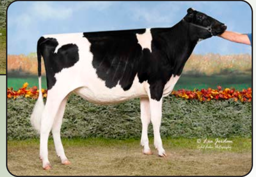
R-E-W Moovin To Cabo-ET

Unanimous All-American Jr. 2 Year Old 2022 Granddam of Lot 19E