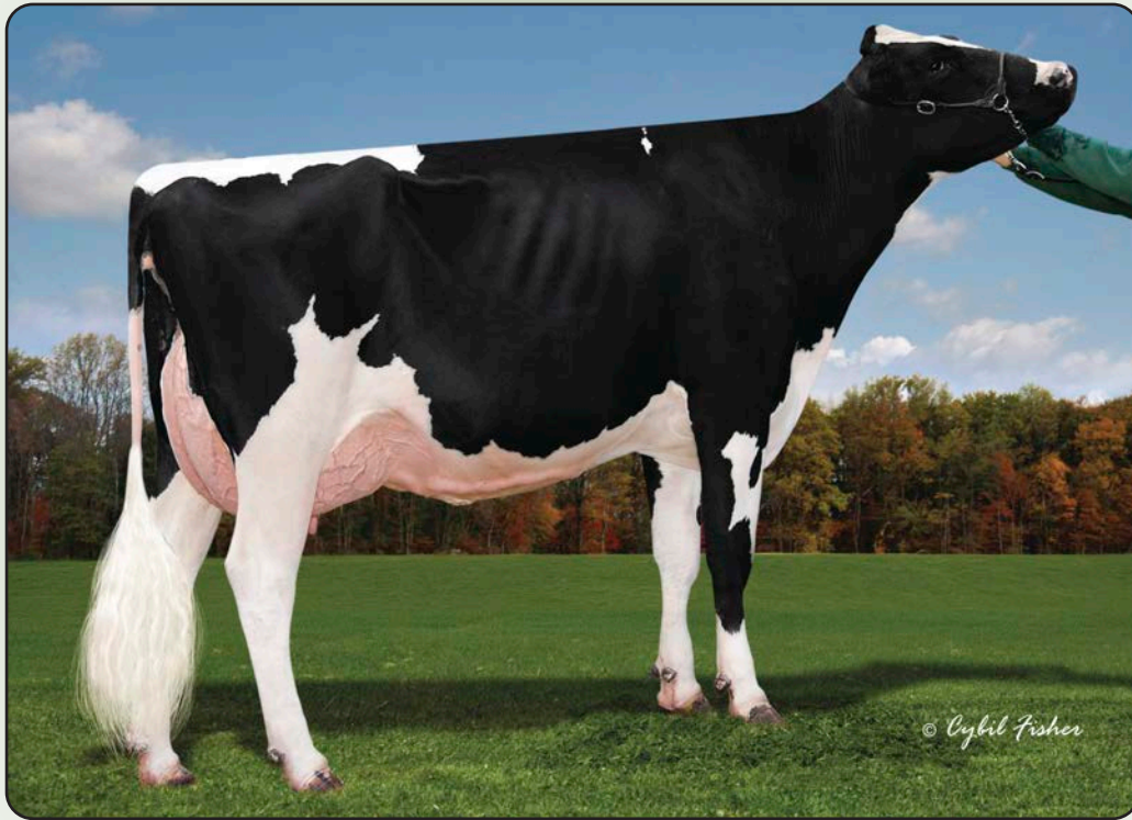
Cookiecutter DTA Habitan-ET "EX-90" Fifth Dam of Lot 4E