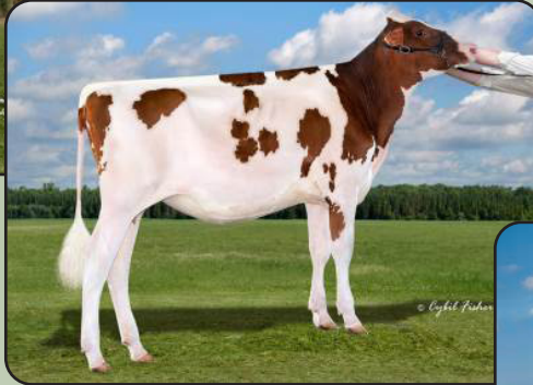
ZBW-JLP Doral Jenga-Red-ET *PO "VG-86 VG-MS" Dam of Lot 24E