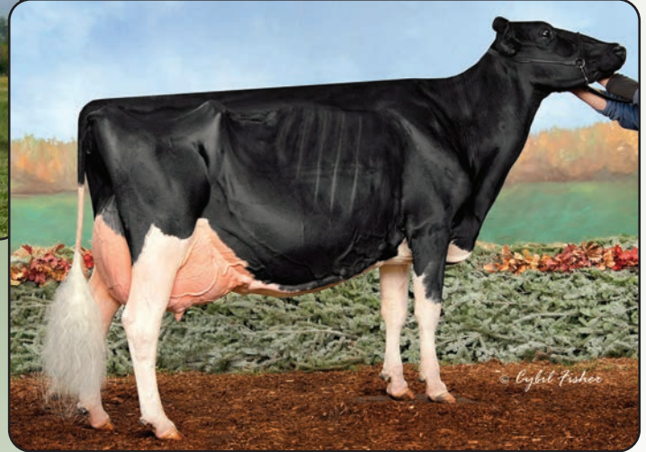
T-Triple-T Platinum-ET "EX-95 3E" Holstein USA Star of the Breed 2018 Granddam of Lot 12E