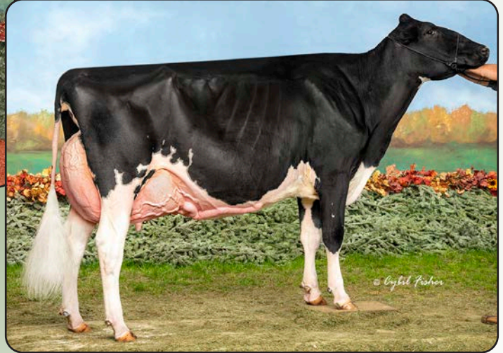
Jacobs Avalanche Bradly-ET "EX-95 2E"

All-Canadian 5 Year Old 2022 Same Family as Lot 2