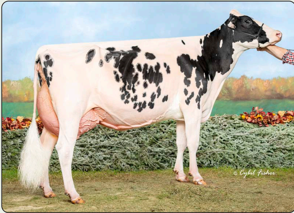
Elm-Spring Octane Margo "EX-94" Res. Int. Champion Northeast Spring National 2023 Dam of Lot 13E