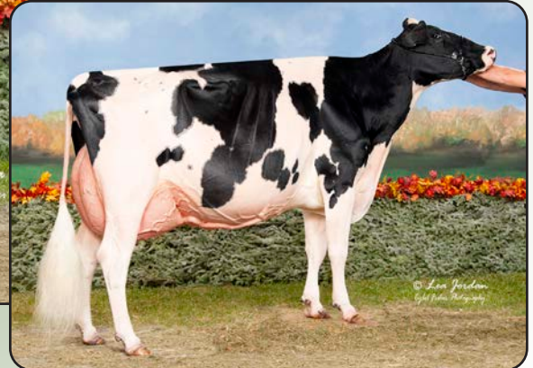
Kings-Ransom CR Dazzling-ET "EX-94" Member Nom. All-American Produce of Dam 2024 Granddam of Lot 5E