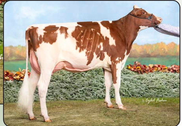
Curr-Vale Baracuda-Red-ET "VG-88 EX-MS"

1st Jr. 2 Year Old NY Holstein and R&W Shows 2024