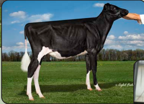
Liddleholme Heybear-ET 1st Winter Calf Northeast Spring National 2024 Full Sister to Lot 14E