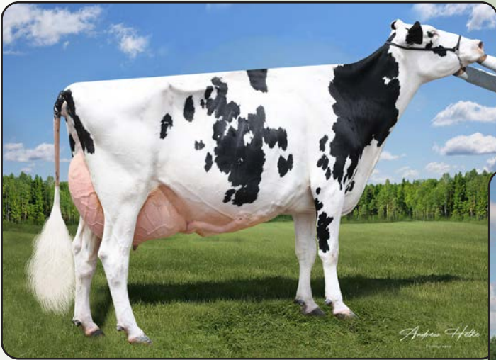
Paramount-MB Defiant Aries "EX-94 2E" Dam of Lot 4C