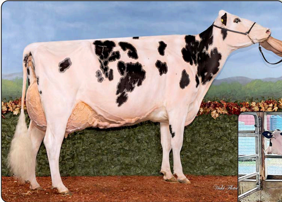
Lo-Pine-VA Lady Crush "EX-94"

Res. Grand Champion Canadian National Show 2024 Maternal Sister to Lot 1