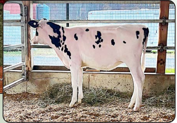
Lo-Pine-VA Crshabl Lovey-ET

Res. Grand Champion Canadian National Show 2024 Maternal Sister to Lot 1