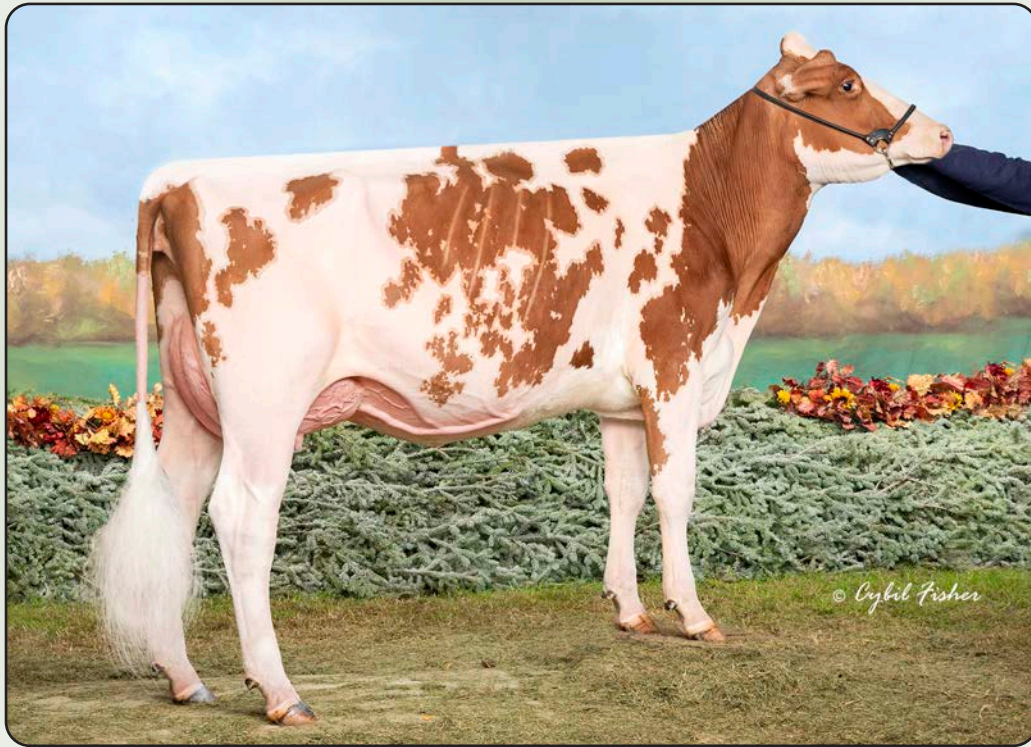
Curr-Vale Journy Ada-Red-ET "VG-87" 2nd Milking Yearling International R&W Show 2024 Maternal Sister to Lot 9E