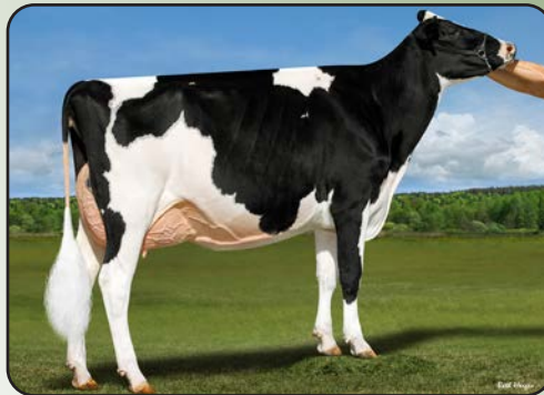
Genosource Looks Matter-ET "VG-89" 2nd Milking Yearling International Show 2024 Lot 1E - Maternal Sister to Dam of "Sleeping"