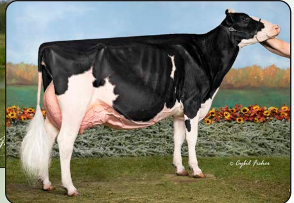
T-Triple-T Petunia-ET "EX-95 2E" Junior All-American Aged Cow 2020 Granddam of Lot 11E