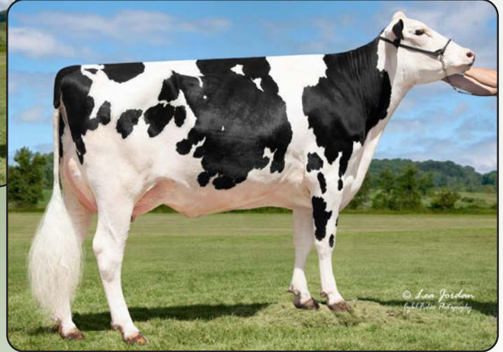
Kenyon-Hill Gameday Onia-ET "VG-85 VG-MS" Dam of Lot 3