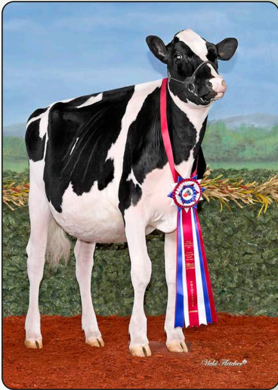
Kingsway Alligator A Twix-ET "VG-89" Junior Champion Royal Winter Fair 2022 Full Sister to Dam of Lot 3C