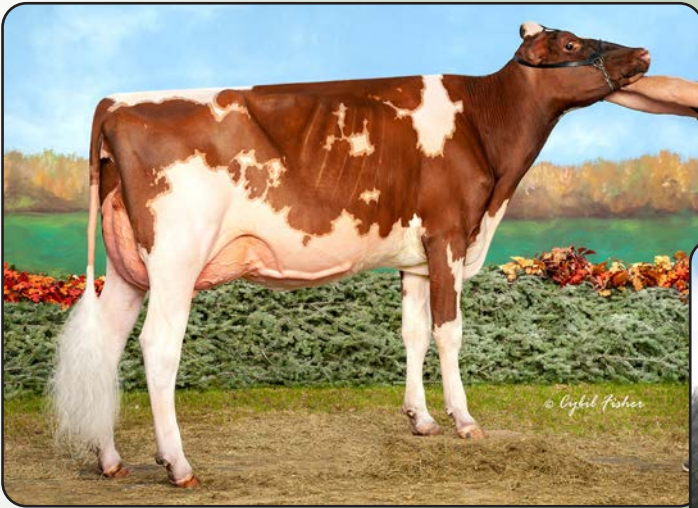
Apple-Pts Ainsa-Red-ET "EX-93"

Unanimous All-American R&W Summer Jr. 2 Year Old 2021 Full Sister to Dam of Lot 7E