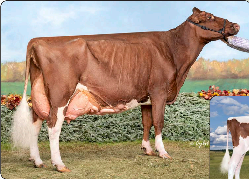
LME Armani Rascal-Red "EX-96 3E" 1st 125,000 lb. Cow International R&W Show 2024 Dam of Lot 1S