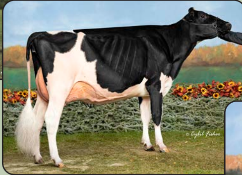
Retso Sidekick Charlene-ET "EX-94"

Res. Grand Champion International Show 2011 Fourth Dam of Lot 19E