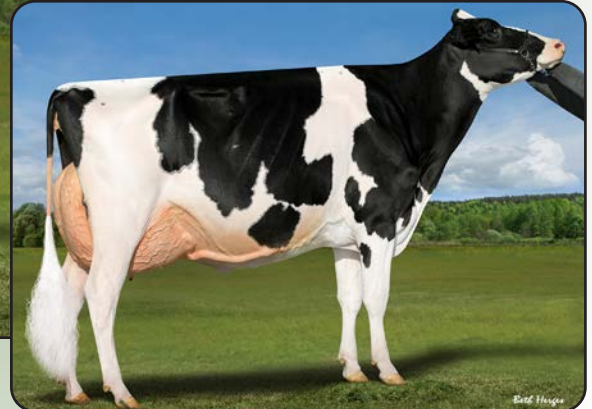
Ladyrose Caught Your Eye-ET "EX-95" 3x All-American in milking form Granddam of Lot 6E