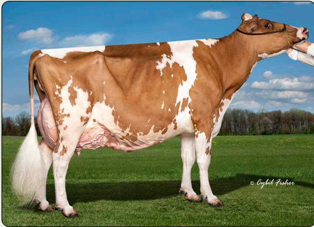
Tiger-Lily Apple Pie-Red-ET "EX-94 2E"

Res. Junior All-American R&W 5 Year Old 2022