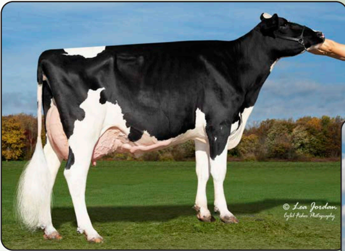
Welcome Homecoming Cap-ET "EX-90" Maternal Sister to Lot 15E