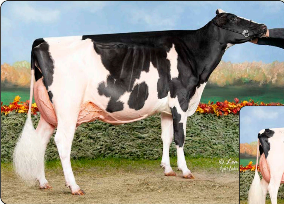
Kings-Ransom Doc Drizzlin "EX-92" 1st Jr. 3 Year Old International Show 2024 Dam of Lot 5E