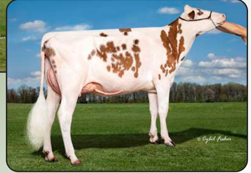
ZBW-JLP Mrand Joyful-Red-ET *PO "EX-91" 1st Summer Jr. 2 Year Old Northeast Spring National 2023 Maternal Sister to Dam of Lot 24E