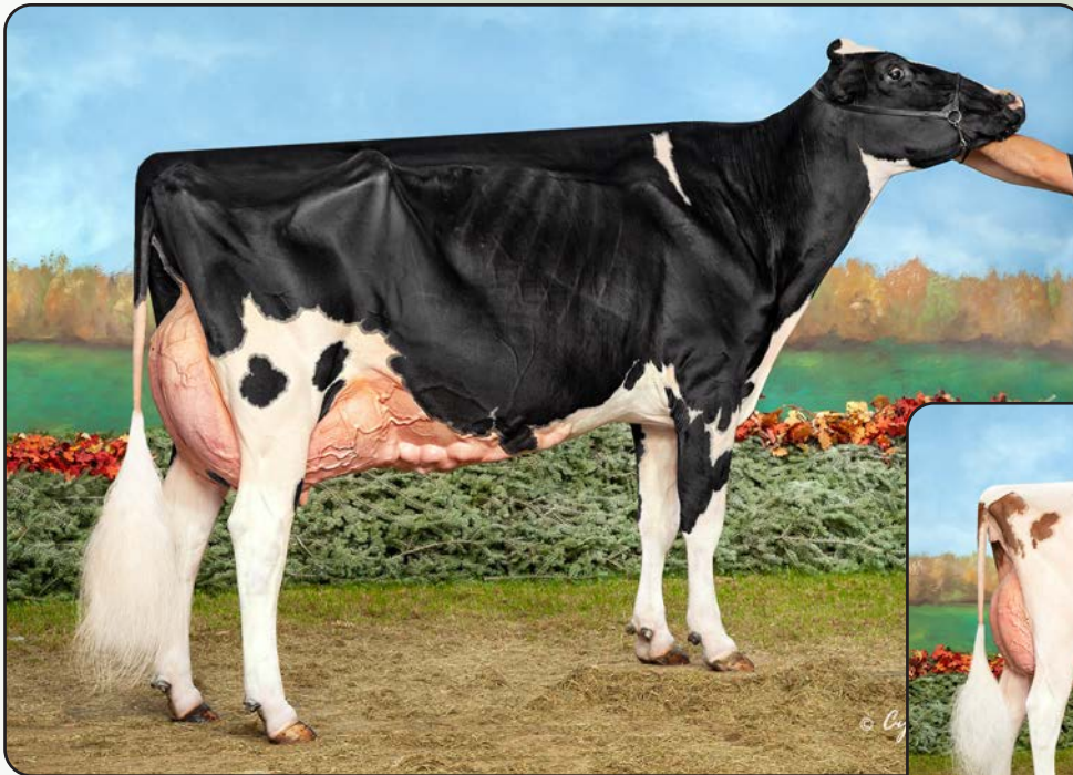
Milksource Byway Affection *RC "EX-94 2E"

1st Aged Cow Maryland State Show 2022 Dam of Lot 7C