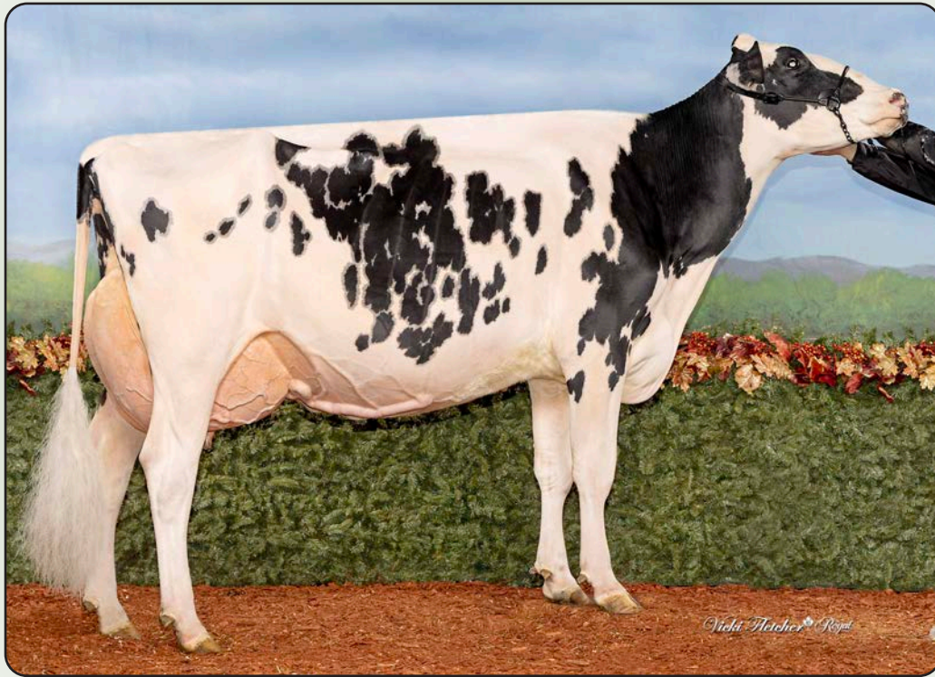
Welcome Hancock Camilan-ET "EX-94" 2nd 4 Year Old Canadian National Show 2024 Dam of Lot 1C