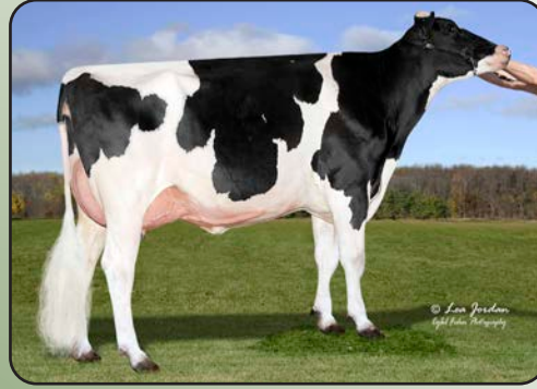
AOT Doc Heart-ET VG-85" Lot 1E - Dam of "Hazel"