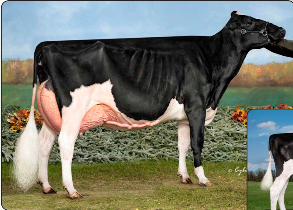
S-S-I Doc Have Not 8784-ET "EX-96" DOM Res. All-American 4 Year Old 2022 Granddam of Lot 2C