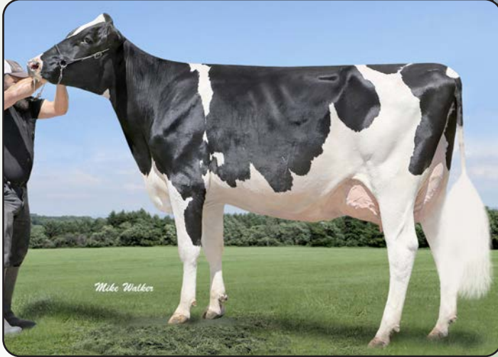
Richmond-FD Mogul Lilith-ET "EX-90 2E" Seventh Dam of Lot 4S