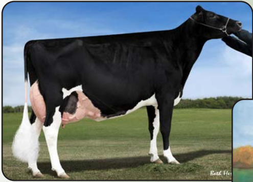
Silvermaple Damion Camomile "EX-95" 7*

Res. Grand Champion International Show 2011 Fourth Dam of Lot 19E