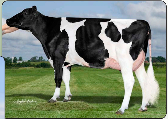
Midas-Touch Hot Lips-ET "VG-88" Fifth Dam of Lot 4S