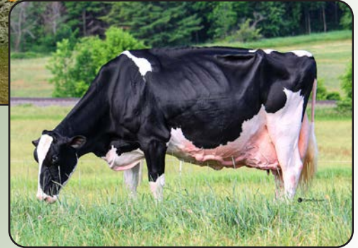
Blondin Goldwyn Subliminal-ETS "EX-97 4E" 2*

All-American and All-Canadian winner Third Dam of Lots 22E & 23E