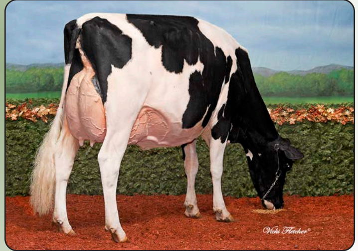
Kingsway Sanchez Aragatang-ET "EX-95 2E" 27* HM All-Canadian 4 Year Old 2014 Granddam of Lot 3C