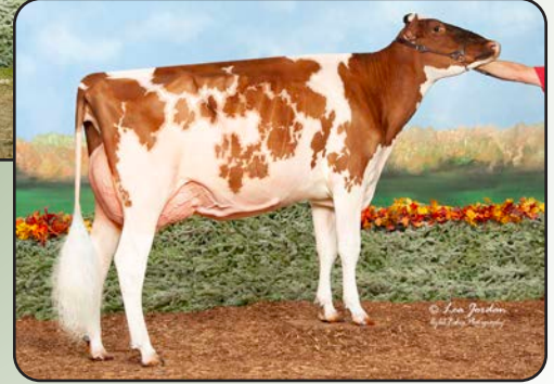
Kress-Hill Sci-Fi-Red-ET "VG-88"

Res. Jr. All-American Sr. 2 Year Old 2023 Full Sister to Lot 5C