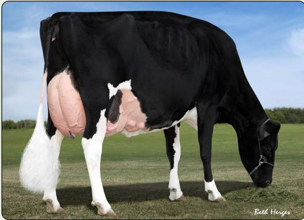
Silvermaple Damion Camomile "EX-95"

Res. Grand Champion International Show 2011 Fourth Dam of Lot 4