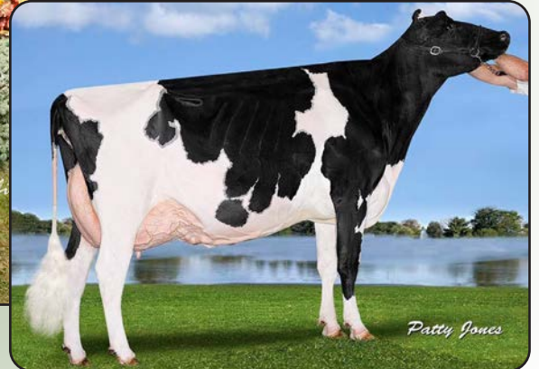
Kingsway Windbrook Jazz "EX-95 2E" 4* Res. All-Ontario 4 Year Old 2017 Maternal Sister to Dam of Lot 29E