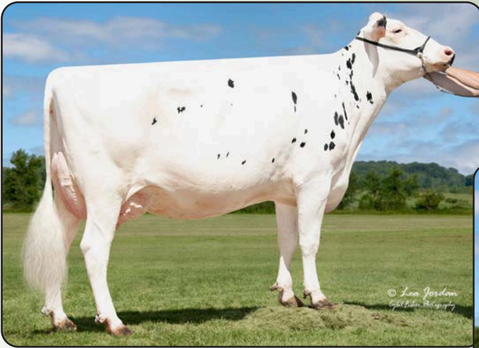
Kenyon-Hill Pursuit Nia "EX-90 EX-MS" Granddam of Lot 3