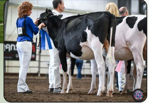
Liddleholme Heydude-ET 1st Winter Calf WI Championship Show 2024 Full Sister to Lot 14E