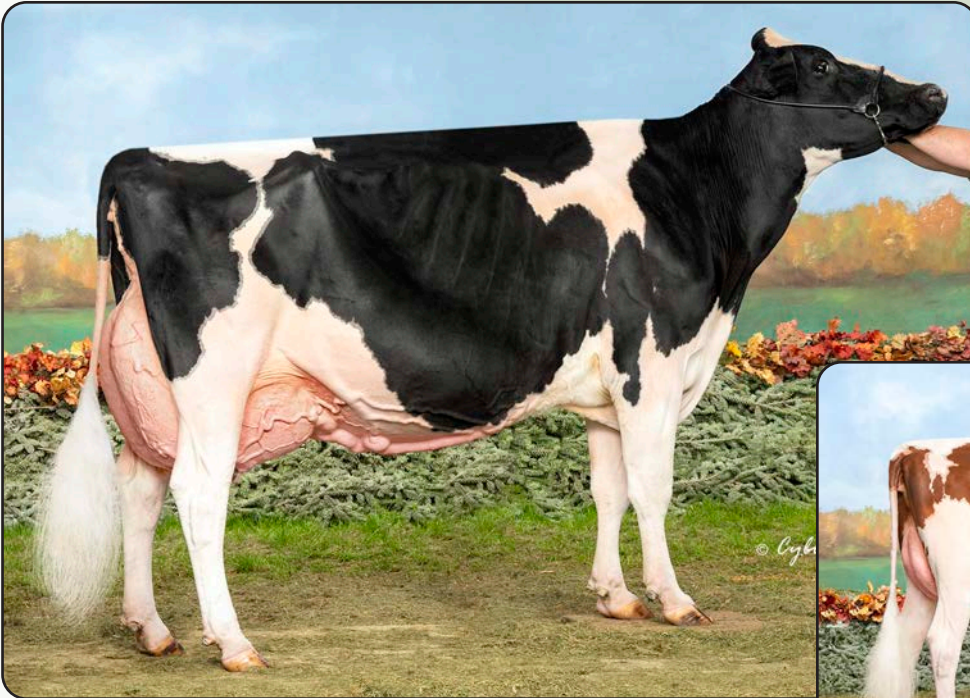
Jericho-Dairy Baracuda-ET *RC "EX-96 2E"