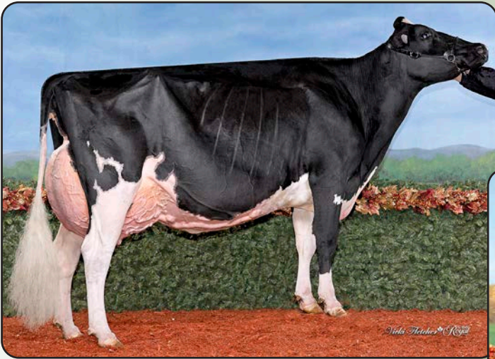
Jacobs High Octane Babe-ET "EX-96 2E"

All-Canadian 5 Year Old 2022 Same Family as Lot 2