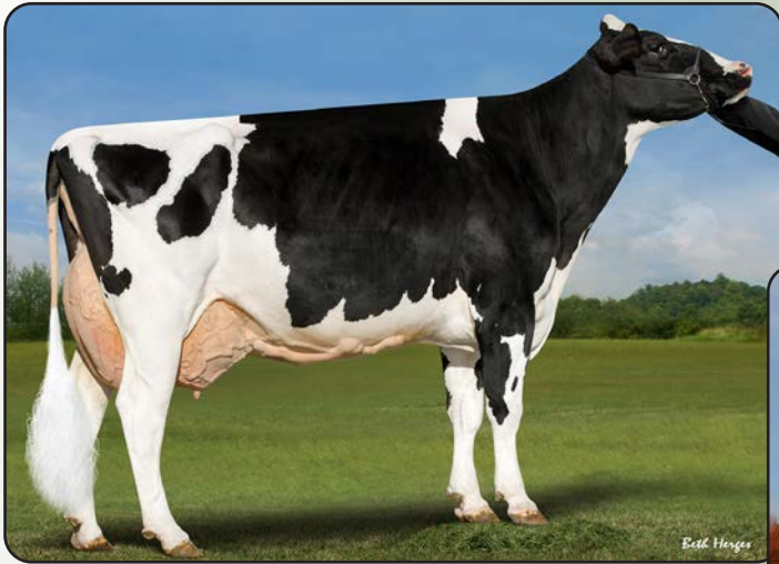
Farnear Adler Arla *RC "EX-94 3E" Dam of Lot 8E