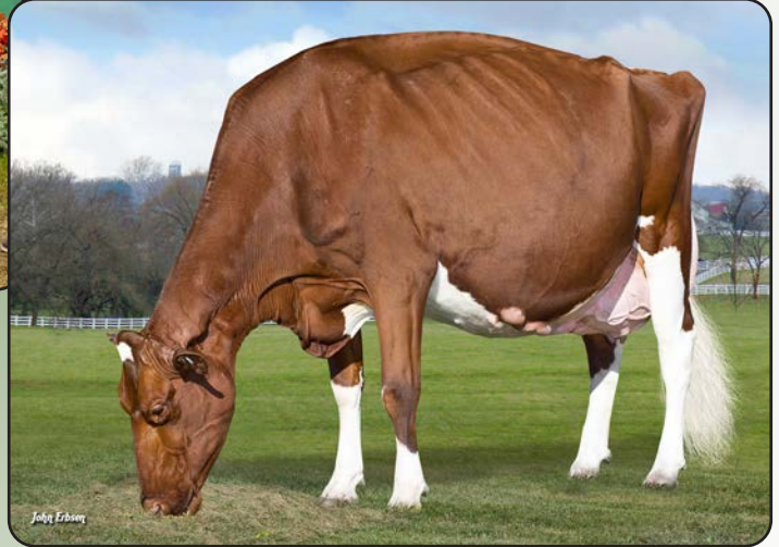
KHW Regiment Apple-Red-ET "EX-96 4E" DOM

Unanimous All-American R&W Summer Jr. 2 Year Old 2021 Full Sister to Dam of Lot 7E