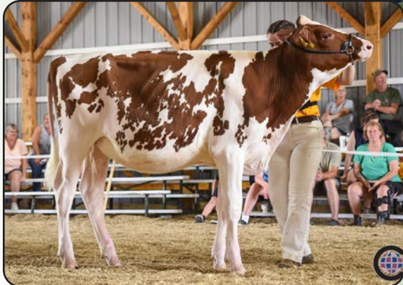
La-Ca-De-Le TG Demi-Red-ET 1st Fall Calf New England Summer Show 2024 Maternal Sister to Lot 26E