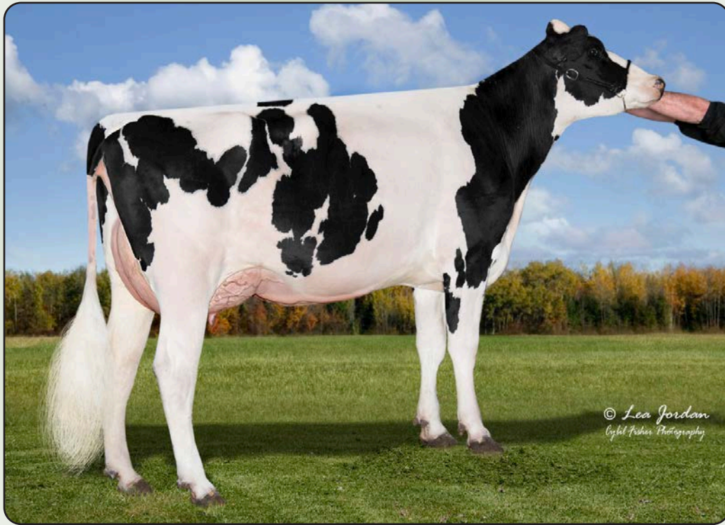
Cookiecutter SIm Hoplite-ET "VG-88 EX-MS" Fourth Dam of Lot 2S