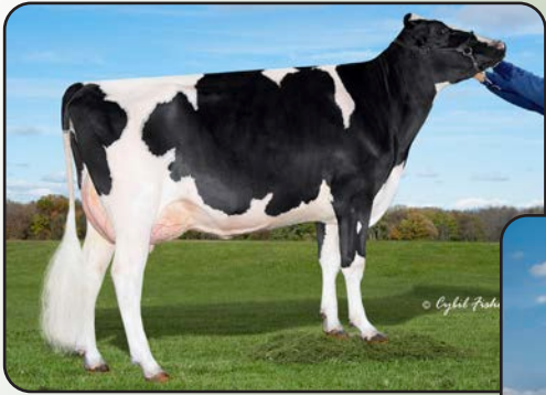
Cookiecutter Mac Halmaci-ET "EX-94 2E" Third Dam of Lot 14E