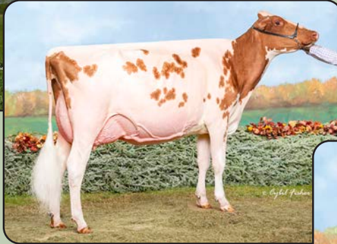
Kress-Hill Spicy-Red-ET "EX-92"

Supreme Junior Champion WDE Jr. Show 2018 Dam of Lot 5C