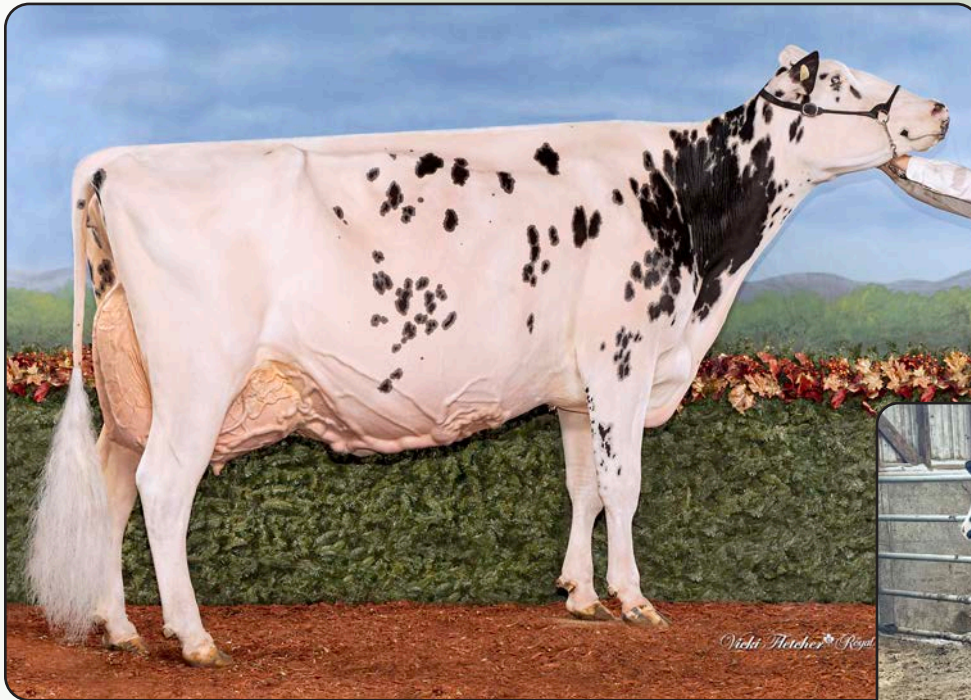
Erbacres Snapple Shakira-ET *RC "EX-97 4E" 7* Supreme Champion World Dairy Expo 2021 & 2023 Supreme Champion Royal Winter Fair 2023 Granddam of Lots 16E & 17E