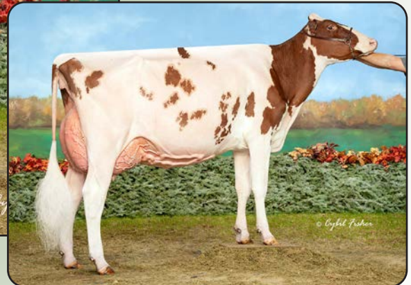
Milksource Attica-Red "EX-92"

1st Aged Cow Maryland State Show 2022 Dam of Lot 7C