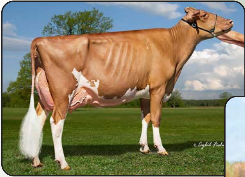
Ms Kress-Hil Sapphire-Red-ET "EX-92 2E"

Supreme Junior Champion WDE Jr. Show 2018 Dam of Lot 5C