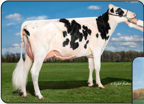
ZBW M Denver Serenity "EX-90 EX-MS"

1st Jr. 2 Year Old Northeast Spring National Junior Show 2024 Dam of Lots 22E & 23E