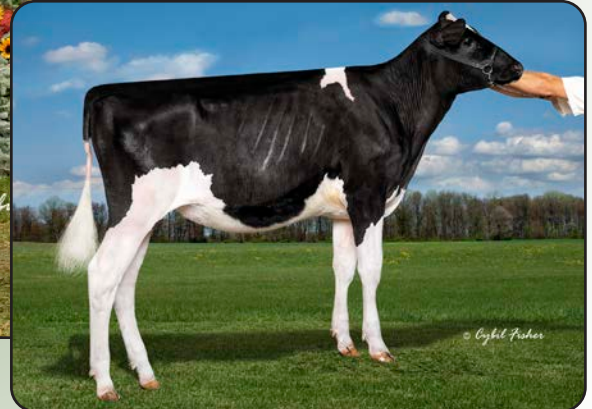
Haveitall Drpbx Hibiscus-ET Dam of Lot 2C