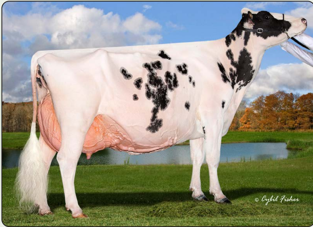
Liddleholme Resur Lu-ET "EX-97 4E" All-American & All-Canadian Production Cow 2018 Granddam of Lot 27E