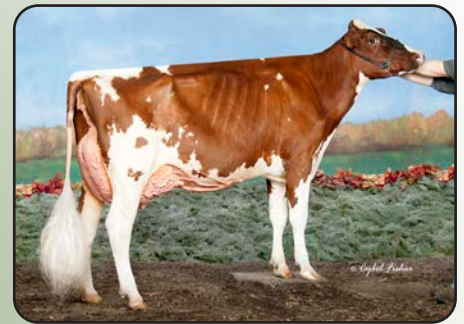
Cherry-Lor Dbk Robin-Red-ET "EX-92"

Junior All-American R&W Jr. 3 Year Old 2020