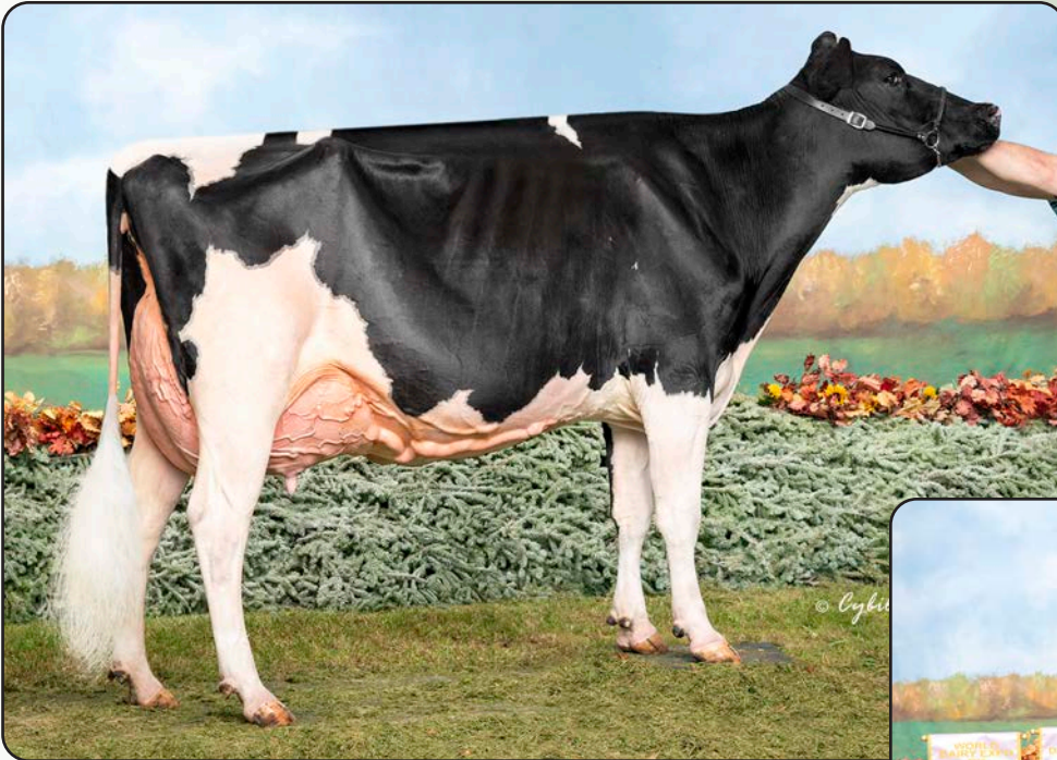
Liddleholme Mucho-ET "EX-93" Res. Grand Champion International Junior Show 2024 Dam of Lot 28E