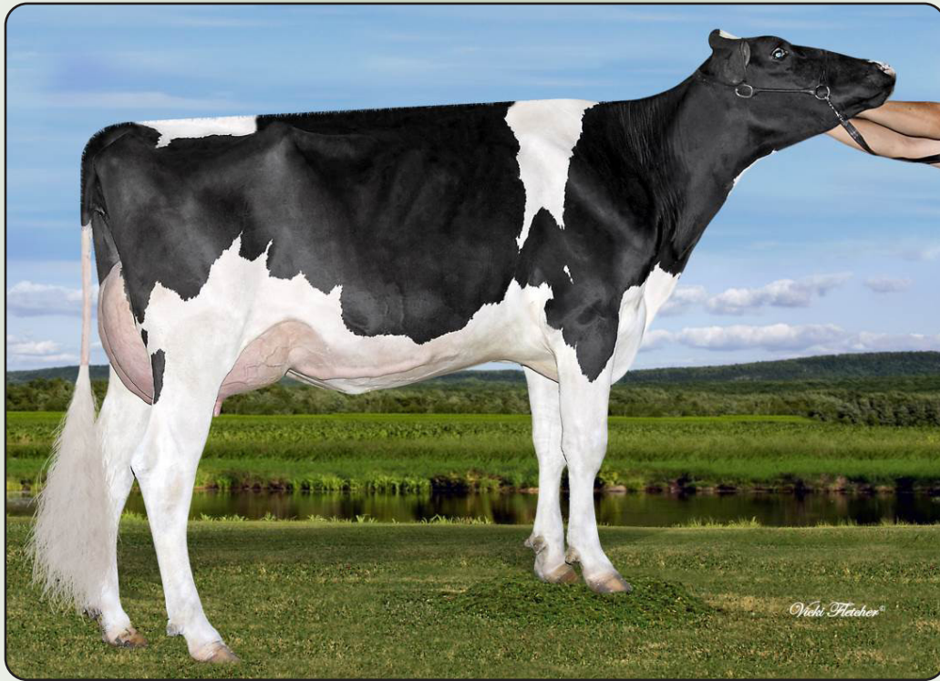
Aija King-Doc Wichita-ET "EX-90 EX-MS" Fourth Dam of Lot 3E