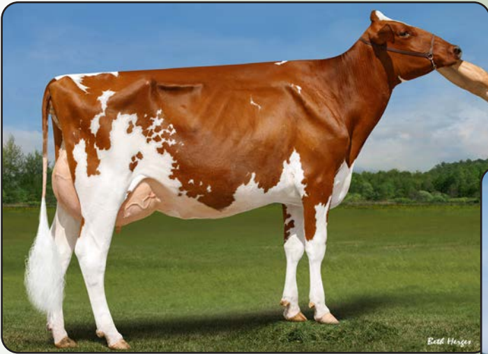
Maple-Downs Anikia-Red "EX-92 EX-MS" 1st Summer Jr. 2 Year Old SE PA Championship Show 2022 Dam of Lot 6C