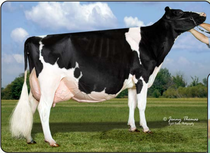
T-Triple-T Dundee Paige "EX-96 3E" HHM All-American 125,000 lb. Cow 2013 Third Dam of Lot 12E