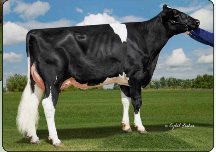
Welcome Hancock Capri-ET "VG-88" Dam of Lot 15E