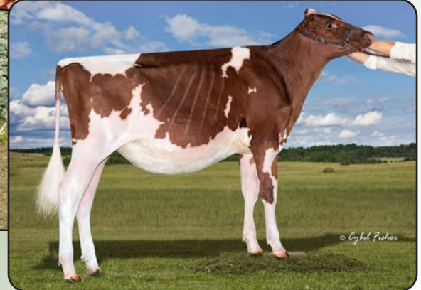
Liddleholme Reign-Red-ET 1st Winter Calf NY State R&W Jr. Show 2024 Daughter of Rascal-Red