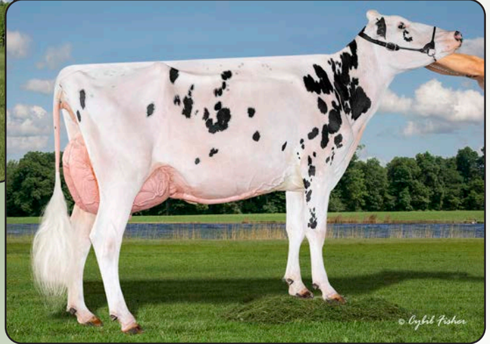
Mikelholm Devour Ariel "EX-93" Maternal Sister to Lot 4C