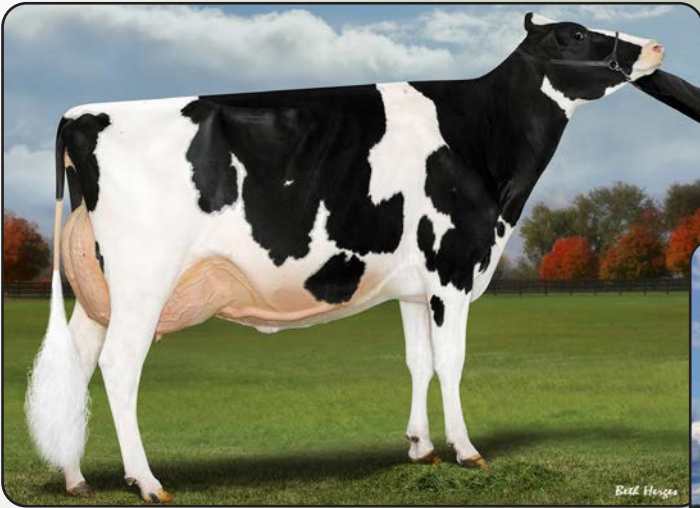
Ladyrose Caught Your Eye-ET "EX-95"