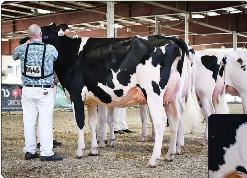
ZBW Bust A Moove *RC "EX-93"

1st Jr. 2 Year Old Northeast All Breeds Spring Show 2022 Dam of Lot 21E