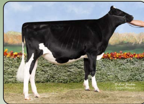
AOT Heartbeat 2716-ET Junior Champion New York State Show 2024 Lot 1E - Full Sister to "Hazel"