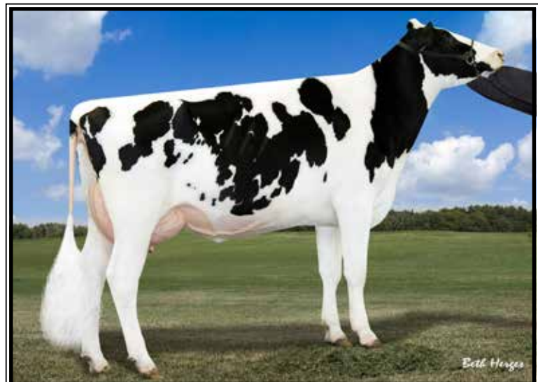
Harvue Planet Evie-ET VG-87 VEV+V DOM