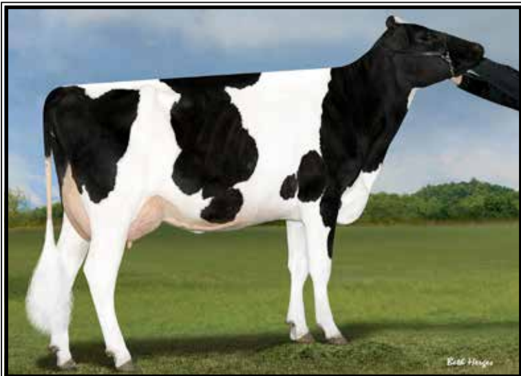
Triplecrown Delta 26-ET VG-88 VEVVV