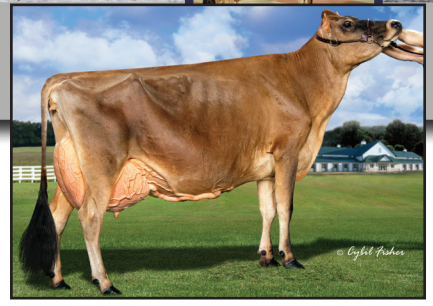
FERMAR PARAMOUNT JOY Fifth Dam of Lot 50

5TH DAM: FERMAR PARAMOUNT JOY 95% 3-01 305 2 21400 5.2 1116 4.1 873 CAN 3001C ALL AMERICAN LIFETIME CHEESE COW, 2014 1ST LIFETIME CHEESE, 2014 WORLD DAIRY EXPO