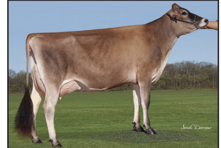
JX CROSSWIND AXIS 5962 {4} Fourth Dam of Lot 52

5TH DAM: JX CROSSWIND IMPULS 4965 {3} 84%