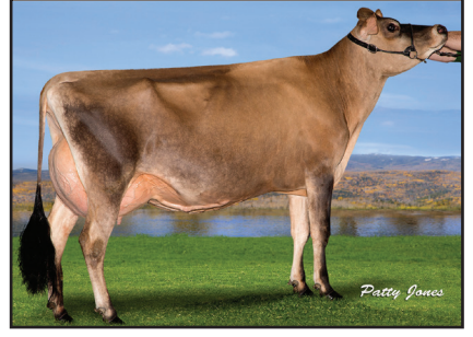
GUIMO SPECTACULAR JOELLE Sister to Fourth Dam of Lot 50