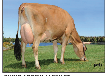
GUIMO ARROW JACEY-ET Full Sister to Fourth Dam of Lot 50