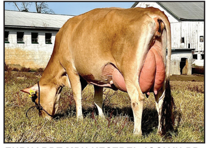
EHRHARDT-MPH KESTREL JOSLYN-PP Dam of Lot 50