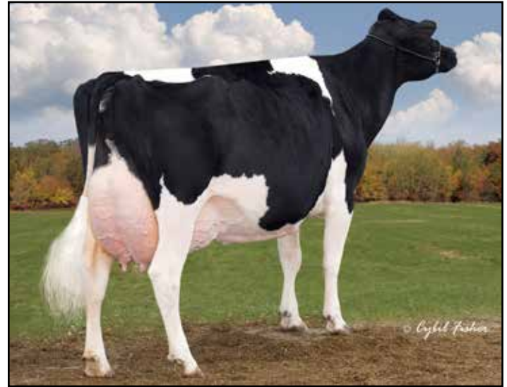
KRULL ENCORE ELISE 2E94 3rd Dam of Lot 6