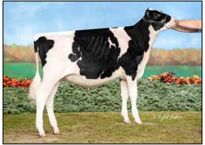
SOLID-GOLD TATOO APOLLO4 VG88