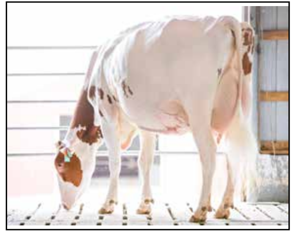
OCD JO LIONKING-RED-ET VG88