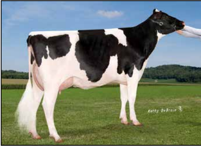
TREALAYNE ATWOOD GARLAND EX90 Family member of Lots 40 & 41