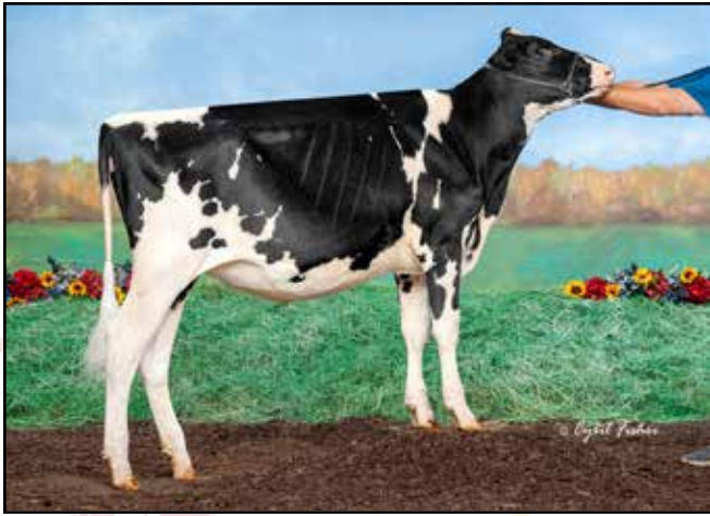
SOLID-GOLD TATOO APOLLO3 VG88