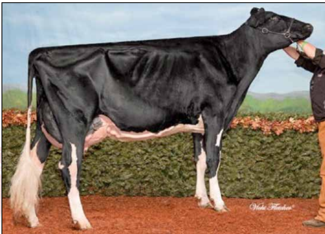
COMESTAR HORIZON JASPER-ET 2E90 3rd Dam of Lot 26