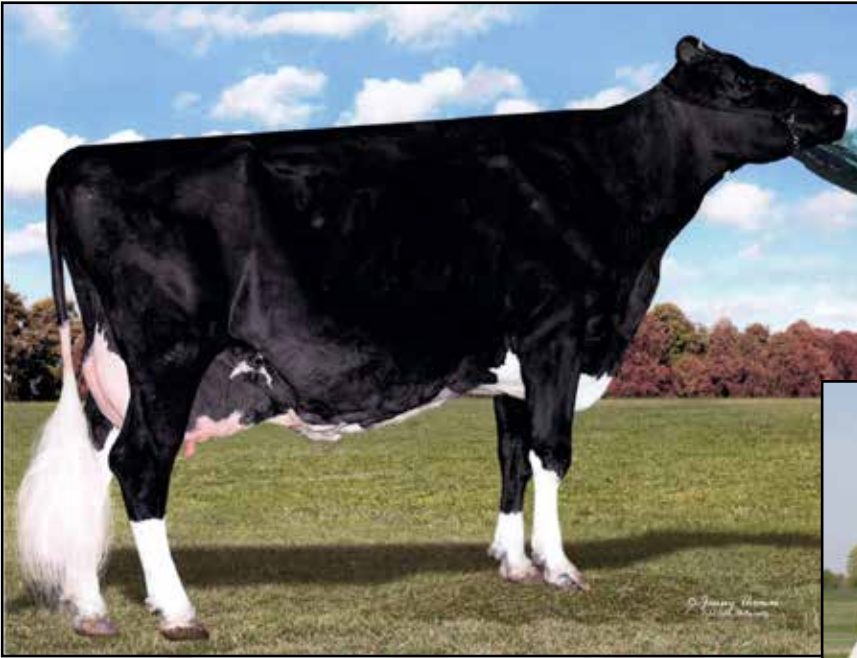
LONG-HAVEN GOLD RHEA-ET 2E94 Dam of Lot 18