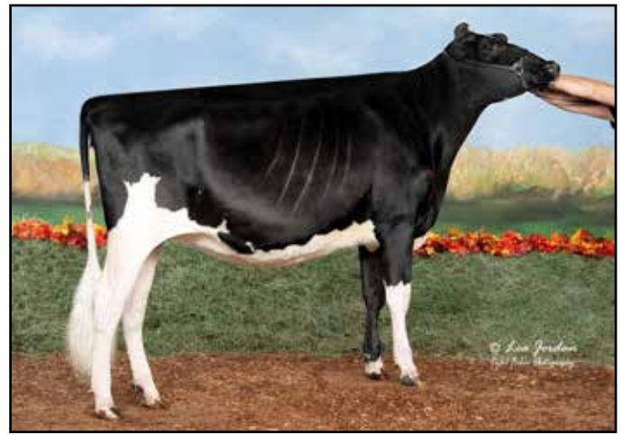
GLEN-PAUL BACKFLIP BREEZE VG86 ALL-OHIO WINTER CALF & WINTER YRLG Dam of Lot 35