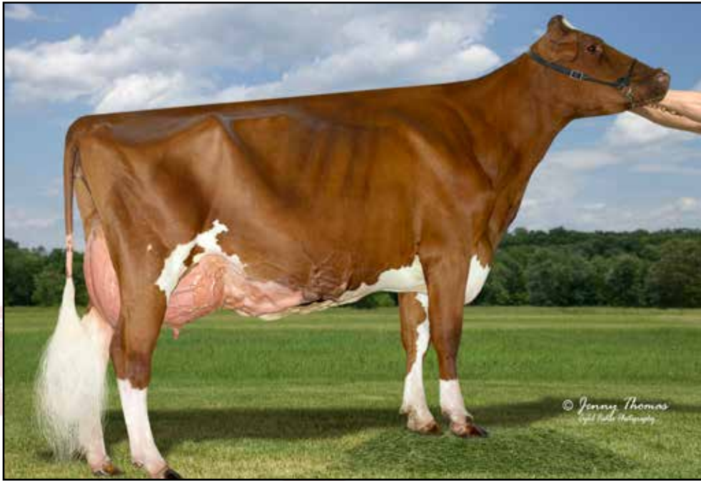
BUDJON-VAIL HZ LOTSА-RED-ET 2E91 Dam of Lot 3