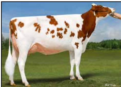
BETLEY LIONINE-RED-ET EX92