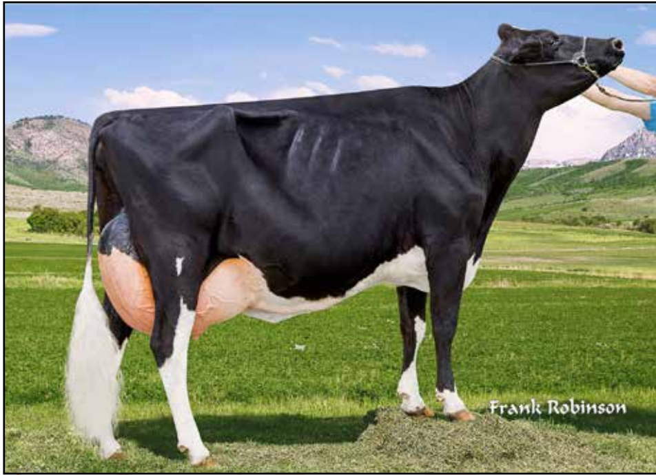
E-EVANS-A JASPER EMMA-ET 2E93 Award winning Dam of Lot 4 & 5