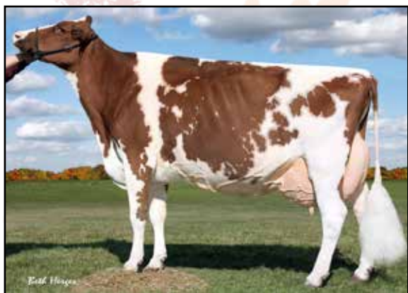
LAVENDER RUBY REDROSE-RED 4E96 Foundation Dam of Lot 46

BROOKVIEW SHOW STOPPER-RED EX90 5-05 2 365 39550 4.3 1720 3.0 1172 99 LIFE 1929 136320 4.1 5593 3.1 4261 BROOKVIEW REDVELVET-ET GP83 3-06 2 38 32920 94 3.7 1221 3.2 1038 STARMARK AD ROSES-RED-ET VG88 2-04 2 365 32840 3.0 985 3.1 1005 ROSEDALE-L SS ROSE-RED-ET VG88 DOM 4-05 2 365 35960 4.0 1443 2.9 1030 LAVENDER RUBY REDROSE-RED 4E96 7-04 2x 365 52100 4.9 2576 3.4 1751 Life: 2671 255980 4.3 10988 3.5 9047 • Supreme Champion World Dairy Expo 2005 • All-American R&W 2005 & 2007; Reserve 2004 NORTHROSE-I LAVENDER RC EX-90 3-10 2x 365 28734 3.6 1034 3.4 974 ROSEDALE LEA-ANN RC 2E93 GMD 4-08 3x 365 39370 3.4 1325 3.1 1202 Life: 1345 120420 3.6 4315 3.2 3795 STOOKEY ELM PARK BLACKROSE 3E96 GMD DOM 5-03 2x 365 42230 4.6 1939 3.4 1432 • All-Time All-American Jr 2 Yr & Jr 3 Yr Old Cow NANDETTE TT SPECKLE-RED EX93 DOM 4-08 2x 365 25290 4.7 1195 • All-American R&W 1981 & 1984 NANDETTE RILEY NANA-RED VG-87 NANDETTE BOOTMAKER GALE VG-89 VG-MS