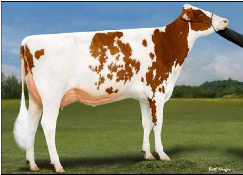
BETLEY LIONLIKE-RED-ET EX90