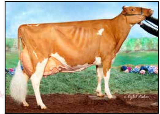
ROSEDALE LUCKY ROSE RED 2E94