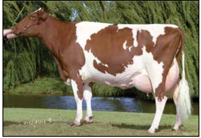
SELLCREST ROSEANNEOREDOET 2E93 GMD DOM 6th Dam of Lot 42