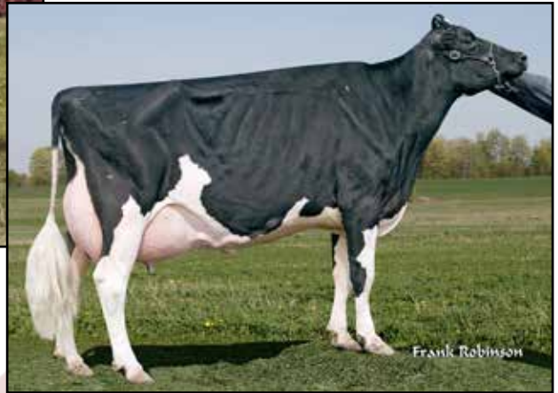
LONG-HAVEN DURHAM RANDI-ET 2E93 Granddam of Lot 18