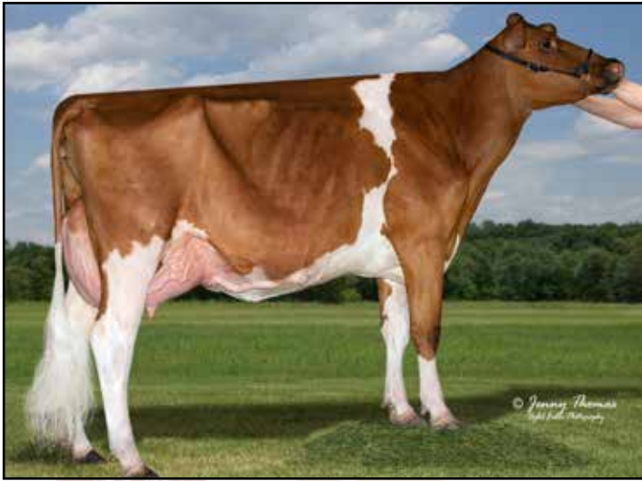
FUTURAMA AWESOME HONEST EX92 Granddam of Lot 10