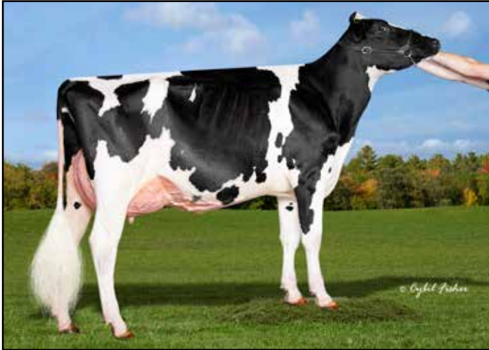
LIZETTES CRUSH LILLY PAD-ET VG88 Dam of Lot 9