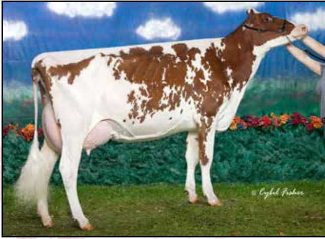
SCHULTE-BROS RENITA-RED-ET EX92 3rd Dam of Lot 34