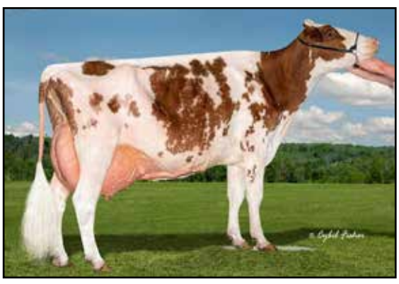
Maternal Sister to 3rd Dam FUTURAMA REDBURST HAZEL-RED 3E94 LIFE 1582 141440 3.5 4984 3.1 4368 *Nom. Jr All-Am R&W Aged Cow 2022 *Res. Gr. Champ. N-E All-Breeds R&W Jr Show 2022

2nd - 15th Dams: FUTURAMA AWESOME HONEST-RED EX92 4th MID-E SUMM NATL 4Y COW 2021 FUTURAMA DUSK HONEY-RC VG8 4-11 2 329 22480 4.4 991 3.2 712 JA-BOB LB HAYLEY-RED-ET VG88 LIFE 2311 137930 5.1 7018 3.3 4563 JA-BOB BEST HALIFAX VG88 2-11 2 365 25440 4.7 1208 3.7 931 JA-BOB STEVEN HALLIE-ET VG87 2-02 3 365 27120 5.0 1368 3.2 864 JA-BOB PHIDEAU HANNA-RED EX-90 DOM 3-10 365d 34,420 4.1 1413 3.2 1110 OHIANA MOM HANDMAID-RED-ET EX-91 DOM 3-10 365d 34,230 3.7 1272 3.3 1117 Dam of Ja-Bob Jordan-Red-ET JA-BOB HOLLY JO-RED-ET EX90 DOM 6-11 365d 29,440 4.5 1322 3.3 960 JA-BOB MARK HEAVENLY JOY RC EX92 CAN DOM 7-03 365d 33,093 3.5 1155 3.0 991 LIFE: 1735d 120,734 3.9 4767 3.1 3744 SKY-HI MARS HELEN-ET RC 4E92 GMD DOM 10-00 365d 30,180 3.9 1174 3.0 907 LIFE: 3898d 235,830 4.0 9408 3.2 7472 SKY-HI BOOTS HONEY VG-86 GMD 9-10 365d 22,750 4.6 1050 LIFE: 4327d 233,390 4.5 10,475 SKY-HI MAJORITY HONEY EX-90 GMD 6-04 365d 20,311 4.2 849 LIFE: 2429d 123,200 4.2 5180 NEXT TWO DAMS: BOTH VG-86 WITH LIFETIME RECORDS OVER 120,000 LB