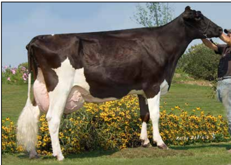
QUALITY QUEST FIRESTRIKE-ET EX90 6th Dam of Lot 30