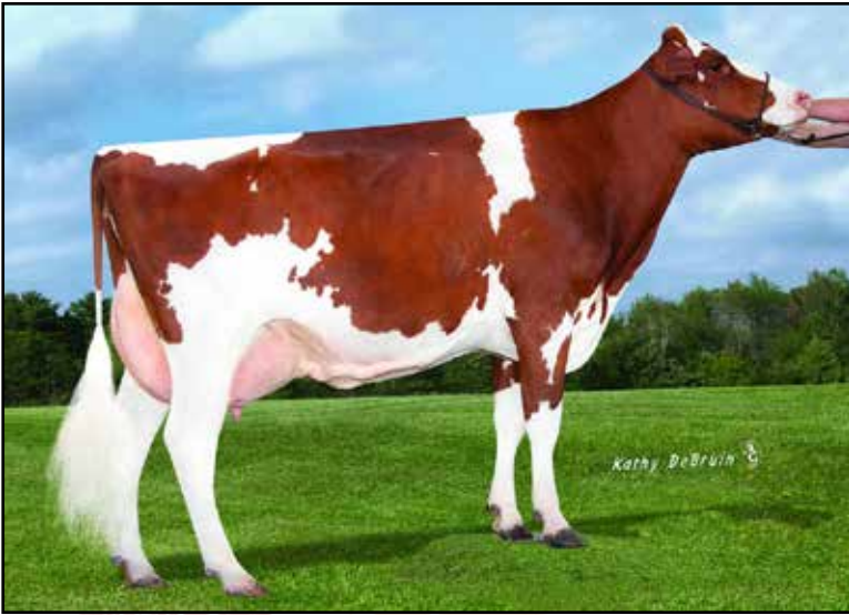
ZIMMERVIEW SYMPTC REMMY-RED VG86 Granddam of Lot 2