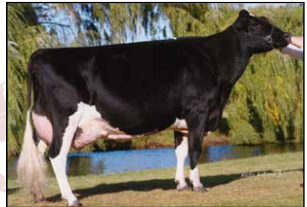
KRULL BROKER ELEGANCE 3E96 GMD DOM Foundation Dam of Lot 4-6