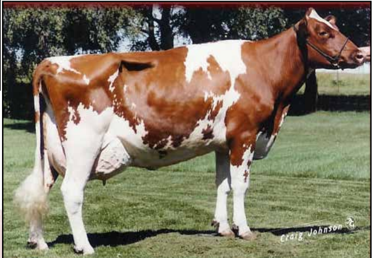
OHIANA MOM HANDMAID-RED-ET EX91 DOM Matriarch of Lots 10 & 11