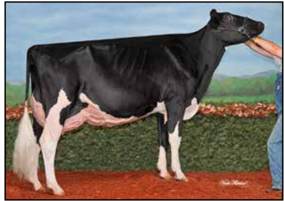
LOTTOS ATWOOD LIZETTE-ET 3E94 Granddam of Lot 9