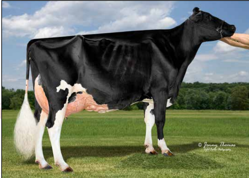
FUTURAMA ATWOOD LYNELL-TW 2E94 Dam of Lot 1