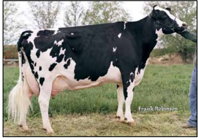
CANYON-BREEZE EM AUGUST 2E92 3rd Dam of Lot 44