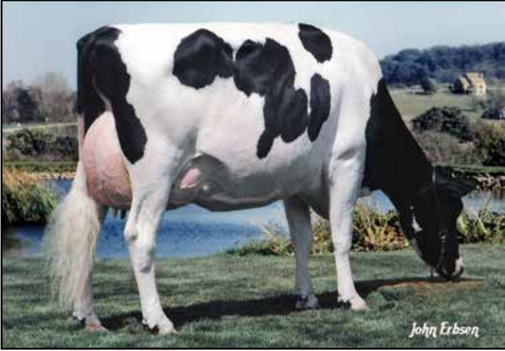
TOPP-VIEW RUBENS EXCTASY 2E94 3rd Dam of Lot 19