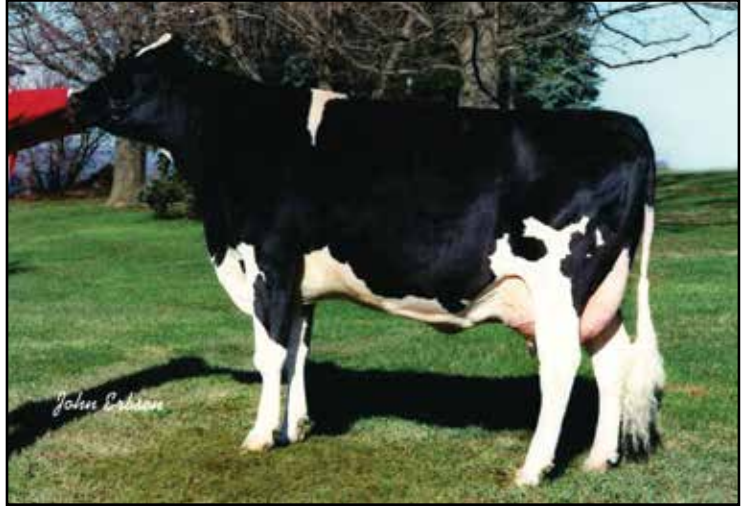
BE-WARE DUSTER DELLA Foundation Dam of Lot 20