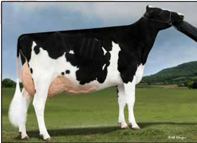
TILLAPYKE WINBROOK ABBIE-ET EX93