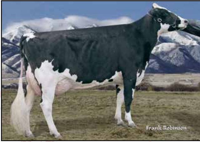
CANYON-BREEZE BOSS ALLIE-ET 2E93 Granddam of Lot 44