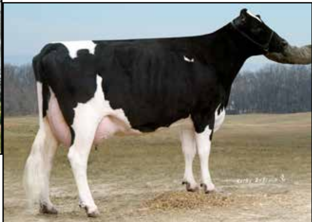
QUALITY QUEST FIREPOWER-ET 3E90 DOM Matriarch of Lot 30