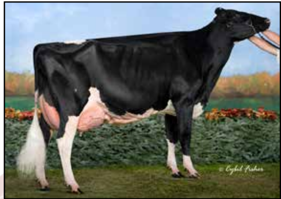
WINTERBAY GOLDWYN LOTTO EX95 3rd Dam of Lot 9