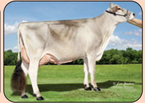
A JOY T CHERRIO 'E91/E91ms' 4/04 336d 2X 26330 4.8 1273 3.5 924 DHIR Nom All American Summer Yrlg 2019 Maternal Sister to Chica