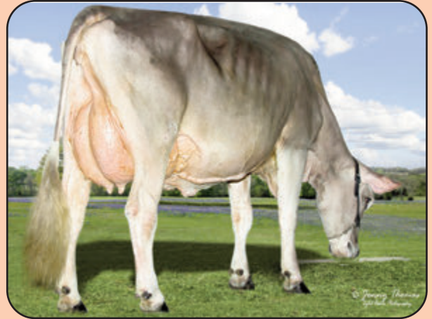
LA RAINBOW SWEET SILK ETV 'E91/E91ms' *Certified* 3/07 365d 2X 26890 5.3 1425 3.5 929 DHIR 1st 4 Yr Old OH State Show 2019 4th Dam of Lot 29