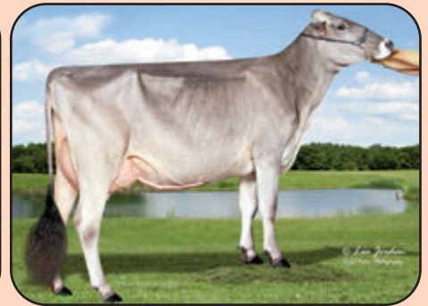
DRIVALE P WILMA 'V88/E90ms' Same Maternal Line as Wizard Dam of Wacky