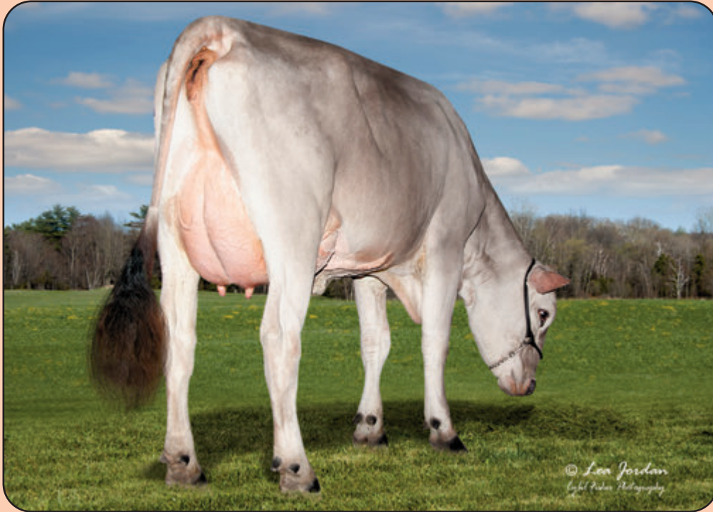
HILLTOP ACRES SEGA NATASHA '+84/V86ms' @2yr *1/10 288d 3X 27010 4.0 1077 3.5 934 (RIP) Dam of Lot 1, Maternal Sister to Lot 2