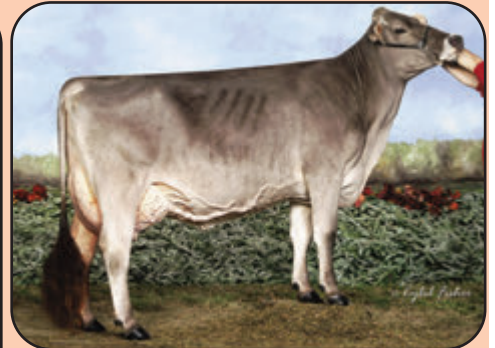
JO-DEE DENMARK NOOKIE ET *SBC* '2E92/E91ms' - MGD of Lot 17 HM All American Jr 3 Yr Old 2012