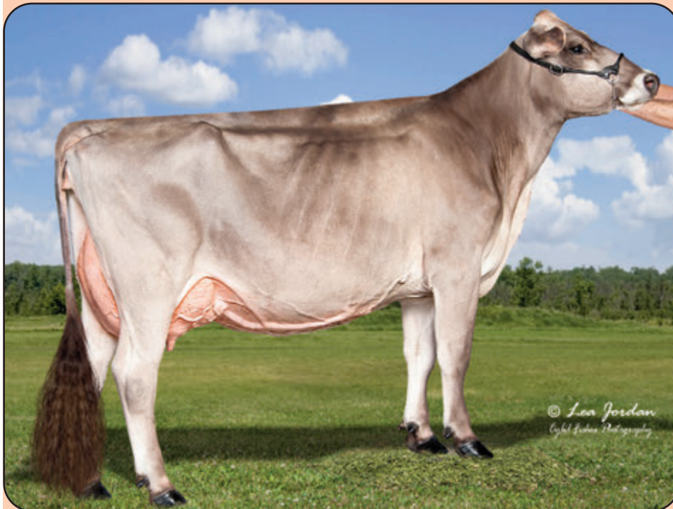
WF WHISKEY NATALIE '2E91/E92ms' *4/06 365d 2X 26069 3.6 942 3.2 819 DHIA Nom All American 4 Year Old 2020 Dam of Lot 18