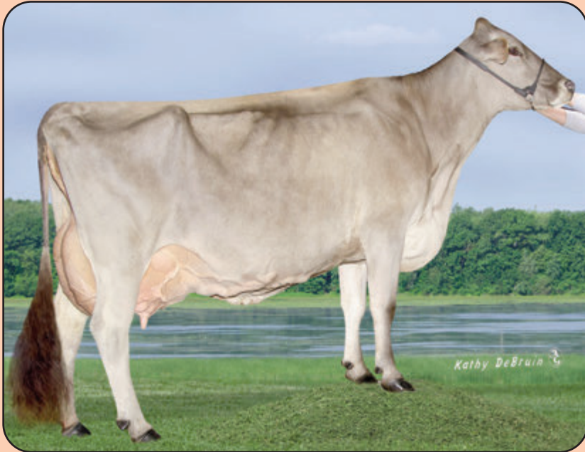
POWERLINE RICH WHATEVER ET '3E93/E93ms' *5/03 365d 2X 31905 5.3 1666 3.5 1135 DHIA Dam of Lot 15