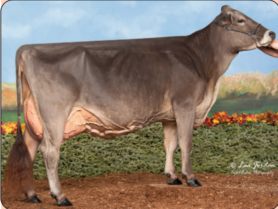
WF BIVER NORTHERNLIGHTS ET 'E93'/E93ms *4/02 354d 2X 30282 4.8 1441 3.7 1114 DHIR Hon Men All American Sr 3 Yr Old 2021 Hon Men All American Produce of Dam Member 2021 Dam of Lot 17