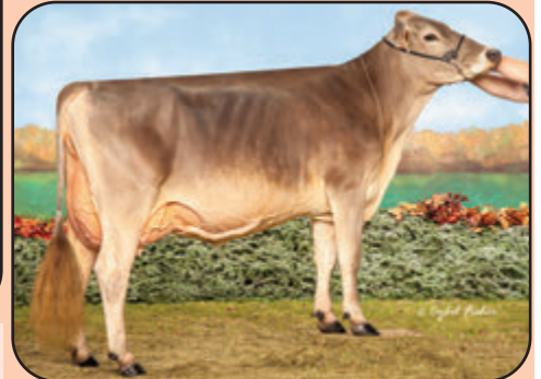
WF CAYENNE NICOLE ET '2E92/E93ms' All American Jr 3 Yr Old 2021 HM ALL AMERICAN PRODUCE OF DAM MEMBER 2021 Maternal Sister to Dam of Lot 17