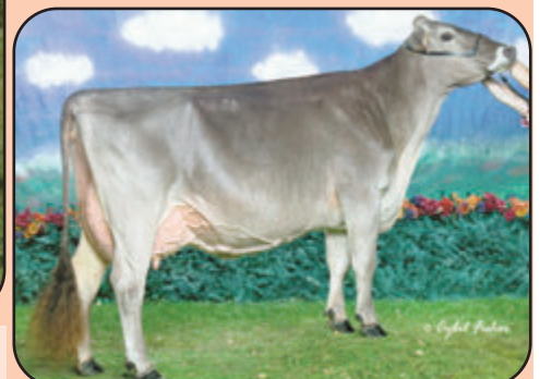
VALLIGROVE JETWAY NORA *SBC* '2E91/E92ms' - 3rd Dam of Lot 24 All American Component Merit Cow 2007 3rd Dam of Lot 17, 4th Dam of Lot 18