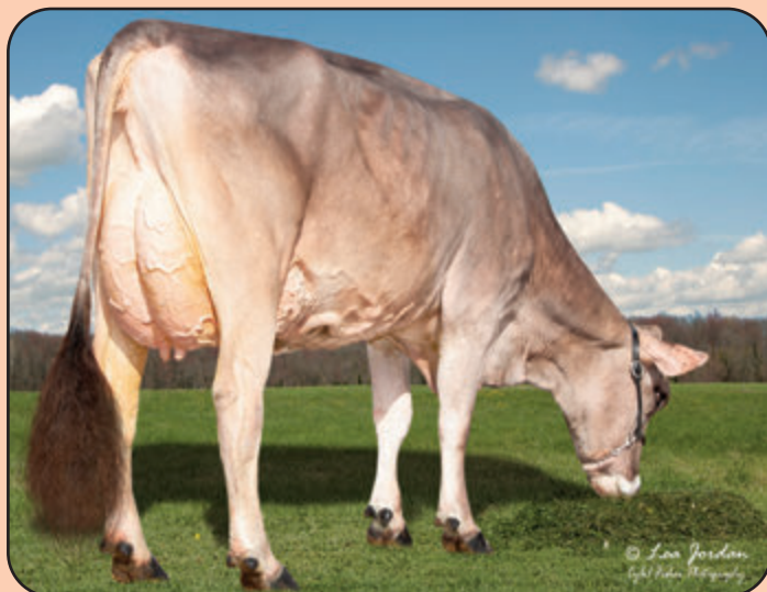
V B PHANTOM SINISTER 'E91/E93ms' 2/02 292d 3X 18320 4.4 798 3.6 663 DHIA Maternal Sister to Lot 8