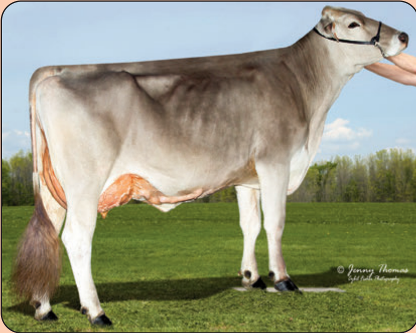
LA RAINBOW SWEET SMILE ETV 'E91/E92ms' 3/01 365d 2X 24320 4.5 1086 3.5 846 DHIR 2nd Sr 3 Yr Old Ohio State Show 2022 3rd Dam of Lot 29