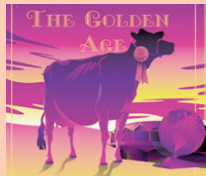
CUTTING EDGE T DELILAH *Protein Plus* Supreme Champion World Dairy Expo 2018, 2019 Supreme Champion PA All American Dairy Show 2018 Donor Dam of Lot 12E, MGD of Lot 11C