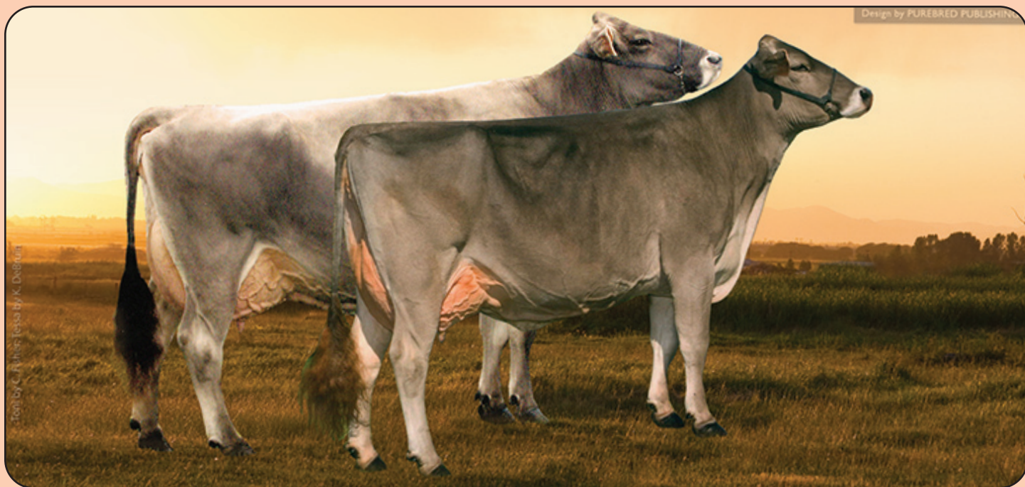
TIMBERLINE JETWAY TONI (M*) '3E94' *Certified* - 5X All American 4th Dam of Lot 25