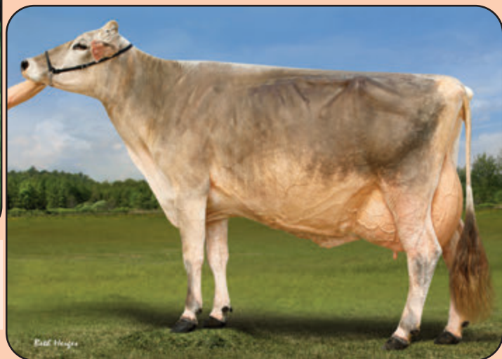
CUTTING EDGE B DAHLIA 'E90/E90ms' *2/06 305d 2X 22419 4.2 944 3.8 851 DHIR Donor Dam of Lot 11C