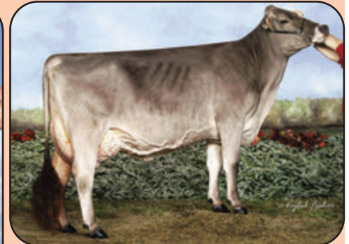
JO-DEE STARBUCK NORI ET 'E91' 6/10 305d 2X 24140 3.9 939 3.3 793 DHIR 3rd Dam of Lot 18