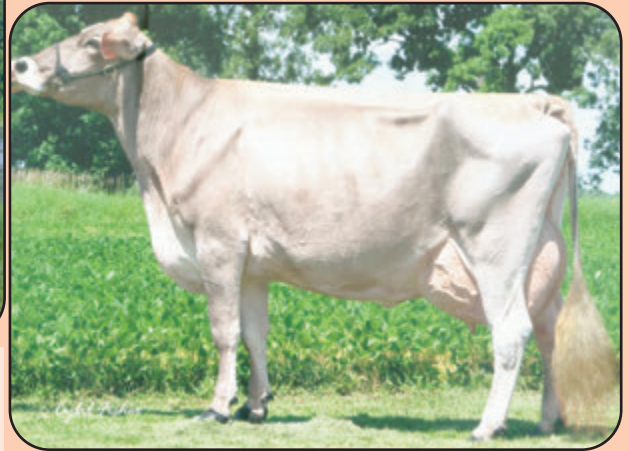
ROUND HILL PREM WISHLIST ET '3E93/E95ms' Protein Plus 6/07 365d 2X 34830 4.1 1443 3.4 1197 DHIR Res All American Comp Merit Cow 2010 MGD of Lot 15