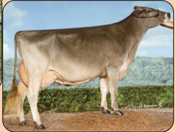
Sun-Made HF Zeus Kayla *TM '2E93/E93ms' 5/04 365d 2X 32480 4.5 1464 4.0 1294 DHIR 3rd Dam of Lot 34