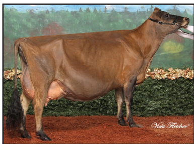
RAPID BAY WHISTLERS RUMOR Great-Grandam of Lot 4