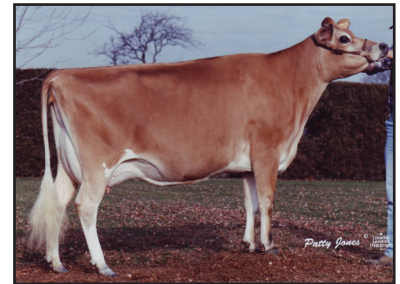
AVONLEA STARFIRE KITTEN 21S Fourth Dam of Lot 1