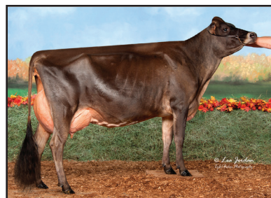
RATLIFF FIZZ BUBBLES Sister to Lot 6