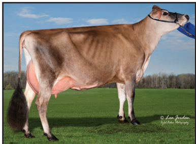
KEVETTA CITATION A VERNA-ET Dam of Lot 8