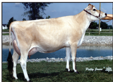
PLEASANT NOOK JUDES MARCIE Sister to the Dam of Lot 2

PLEASANT NOOK BREEZE MARTHA-ET 90% 7-08 305 2 19160 4.0 763 3.5 669 92DCR 2148C MORDALE REMAKE MARIA 90% 3-02 305 2 14970 4.4 666 3.5 529 81DCR 1798C MORDALE SAMBO MARTHA-ET VG 85 (CAN) 7-01 305 2 19790 4.6 919 3.5 690 CAN 2385C MORDALE ONLINE MARLENE-ET VG 85 (CAN) 3-04 298 2 13312 6.0 798 3.3 441 CAN 1523C MORDALE AMADEO MARTHA-ET EX 90-2E (CAN) 3-10 305 2 21417 5.6 1200 3.3 703 CAN 2428C MORDALE ONLINE MARMEN-ET VG 86 (CAN) 2-01 305 2 17208 4.6 787 3.4 582 CAN 2011C