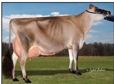
RAPID BAY FATAL GETAWAY RICH Dam of Lot 4