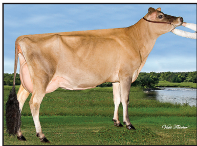
RAPID BAY CONNECTION ROSIE-ET Sister to the Dam of Lot 4

FEMALE EFI 6.6% PO PA -1479M -47F -39P -345CM$ -344NM$ -361FM$ 0.5PL 2.1DPR 2.2CCR 1.5HCR 3.24SCS PA TYPE 1.0 JPI 38%R -67 ST SR DF RA RW RL FA FU 0.7 0.4 0.5 H1.8 0.6 P0.8 S0.7 1.9 RH RUW UC UD TP TL RTR RTS 0.5 -0.2 0.6 S1.9 C0.7 L0.2