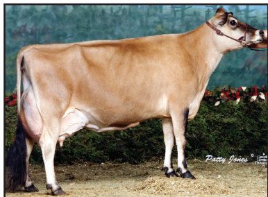
PLEASANT NOOK J IMP MARTHA Grandam of Lot 2

PA -1720M -42F -44P -335CM$ -341NM$ -379FM$ 0.7PL 0.9DPR 1.5CCR -0.5HCR 2.93SCS PA TYPE 1.0 JPI 37%R -58 ST SR DF RA RW RL FA FU 0.2 0.6 -0.5 H1.6 0.8 P0.9 S1.1 2.5 RH RUW UC UD TP TL RTR RTS 0.7 0.1 0.5 S2.4 C0.8 S0.7