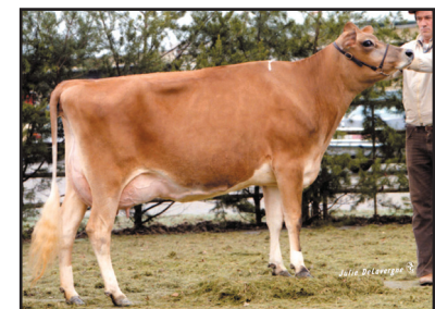
AVONLEA VALIANT KITTY 15N Fifth Dam of Lot 1