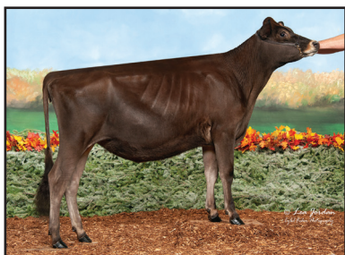
SCHULTE BROS KID ROCK GANGSTA-ET Sister to the Dam of Lot 10