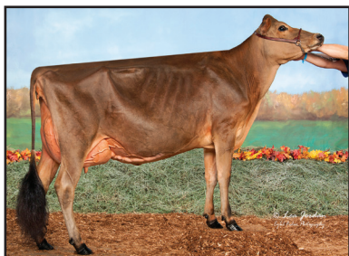
SCHULTE BROS SHOWDOWN GLAM Dam of Lot 10