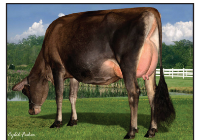
ARETHUSA TEQUILA VANNA Sister to the Dam of Lot 3