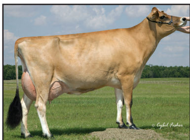
MI WIL DELUXE GORGEOUS Great-Grandam of Lot 10

FEMALE EFI 7.7% PO PA -444M -9F -8P -91CM$ -93NM$ -118FM$ -0.2PL -0.7DPR -0.5CCR 0.7HCR 3.08SCS PA TYPE 1.4 JPI 44%R -20 ST SR DF RA RW RL FA FU 1.5 -0.5 1.6 H1.3 0.7 S0.2 S0.4 1.5 RH RUW UC UD TP TL RTR RTS 1.3 1.4 1.1 S1.6 C1.3 L0.6