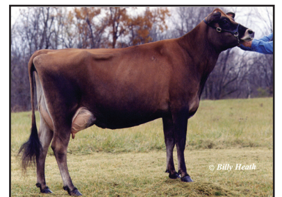
WF JUSTIN BESS-ET Fifth Dam of Lot 5