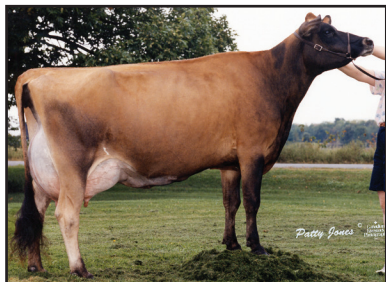
PLEASANT NOOK REGAL MADISON Sister to the Dam of Lot 2

MARTHAS DUAISEOIR MELANIE-ET USA 118830920 GT9K BBR 100 JH1F JNS-TF TATTOO AE08/AE08 DHIA HERD # 23-38-0423 CONTROL # 920 3-05 292 2 12780 4.6 585 3.5 450 93DCR 1555C 9-08 270 2 10850 4.6 504 3.5 377 95DCR 1303C 305 2X ME AVG 4L 12137M 576F 410P 1415C