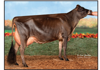
RATLIFF FIZZ BUBBLES Sister to Lot 5