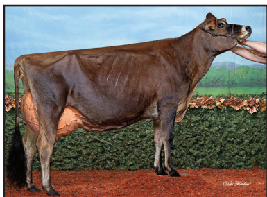
SCHULTE BROS TEQUILA SHOT-ET Sister to the Grandam of Lot 10