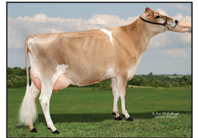
WF SIGNATURE BREE Grandam of Lot 5