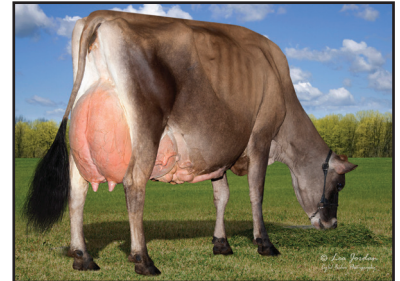
OAKFIELD TBONE VIVIANNE-ET Grandam of Lot 9