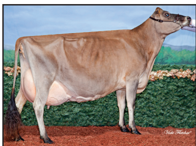
RAPID BAY FATAL ROSE-ET Grandam of Lot 4