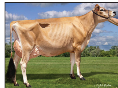
KEVETTA CHROME VIOLIN-ET Sister to the Dam of Lot 8

FEMALE EFI 8.4% PO PA -392M 9F 0P 156CM$ 150NM$ 95FM$ 2.4PL -0.8DPR 0.1CCR 1.5HCR 3.03SCS PA TYPE 1.4 JPI 40%R 41 ST SR DF RA RW RL FA FU 0.9 0.2 1.0 H0.3 0.5 P0.7 S1.1 2.8 RH RUW UC UD TP TL RTR RTS 1.6 1.1 0.3 S1.9 C1.6 L0.0