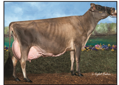
HURONIA CENTURION VERONICA 20J Great-Grandam of Lot 3