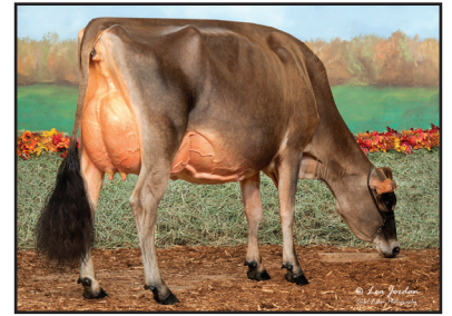
SPATZ APPLEJACK BAYLEE Dam of Lot 5

WF SAMBO BUNNY 93% 8-01 305 2 17140 4.1 705 3.4 587 98DCR 1940C 4TH SR 3-YEAR-OLD, 2003 ALL AMERICAN JERSEY SHOW