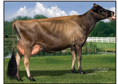
ARETHUSA RESPONSE VANITY-ET Grandam of Lot 3