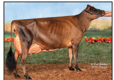
KEVETTA VICTORIOUS VILLANOVA-ET Sister to the Dam of Lot 9