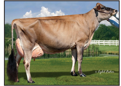
AVONLEA GATOR KIMBER-ET Dam of Lot 1

AVONLEA STARFIRE KITTEN 21S SUP-EX 1 (CAN) 7-04 305 2 15889 5.0 796 4.1 646 CAN 2173C FOUR STAR BROOD COW IN CANADA, DECEMBER 2011