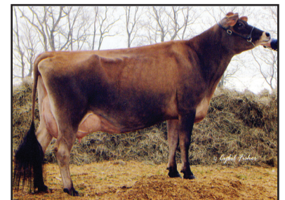
WF SAMBO BUNNY Fourth Dam of Lot 5