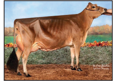
ARETHUSA COLTON KENDRA Sister to Lot 1