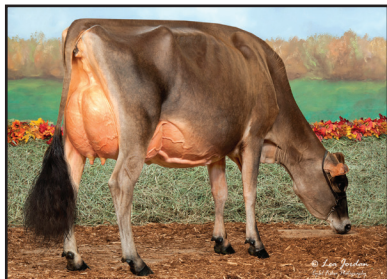
SPATZ APPLEJACK BAYLEE Dam of Lot 6

4TH DAM: WF SAMBO BUNNY 93% 8-01 305 2 17140 4.1 705 3.4 587 98DCR 1940C 4TH SR 3-YEAR-OLD, 2003 ALL AMERICAN JERSEY SHOW