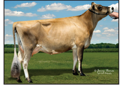
ARETHUSA GRAND VEANNA Dam of Lot 3

SISTER(S): ELLIOTTS SD VANNA-ET 93% ELLIOTTS GOLDEN VISTA-ET 95% 3-04 365 2 22399 6.7 1502 4.2 939 DHIA 3254C ELLIOTTS GOLDEN VANESSA-ET 93% 7-04 305 2 12110 4.7 574 3.3 401 101DCR 1384C ARETHUSA PRIMETIME DEJA VU-ET 95% 5-00 305 2 20000 5.0 996 3.8 763 96DCR 2640C ARETHUSA VERONICAS DASHER-ET 95% 7-04 305 3 27720 5.9 1643 3.6 1007 90DCR 3482C ARETHUSA VERONICAS PRANCER-ET 93% 6-09 305 2 21220 5.4 1143 3.9 829 97DCR 2869C ARETHUSA VERONICAS VIXEN-ET 92% 6-10 305 2 24160 6.2 1499 3.9 935 95DCR 3236C ARETHUSA VERONICAS COMET-ET 95% 2-02 305 2 20500 4.3 879 3.6 743 DHIR 2437C ARETHUSA VERONICAS CUPID-ET 94% 5-06 305 2 18310 4.6 837 3.6 663 95DCR 2258C ARETHUSA VERONICAS DONNER-ET 90% 6-06 304 2 25980 5.6 1464 4.0 1049 98DCR 3633C ARETHUSA RESURRECTION VERSACE-ET 93% 7-09 305 2 22150 5.4 1190 4.0 877 96DCR 3036C ARETHUSA PRIMETIME VOILA-ET 92% 5-09 305 2 20350 6.5 1313 4.1 832 DHIR 2882C ARETHUSA PRIMETIME VOYAGE-ET 93% 4-03 300 2 19580 6.2 1207 3.9 759 97DCR 2627C ARETHUSA RESPONSE VIEW-ET 92% 6-04 305 2 20110 5.8 1163 3.7 749 97DCR 2591C ARETHUSA RESPONSE VIVID-ET 96% 6-00 305 2 22670 6.5 1482 3.5 790 97DCR 2730C ARETHUSA SOCRATES VALDINA-ET 93% 4-05 305 2 21970 6.4 1398 3.6 782 96DCR 2703C ARETHUSA GOLD VENUS-ET 94% 6-02 305 2 21550 5.3 1137 3.9 848 95DCR 2936C ARETHUSA ON TIME VOGUE-ET EX 94 (CAN) 2-00 305 2 26264 3.0 778 2.0 529 CAN 1809C ARETHUSA VAUDEVILLE EXCITEMENT-ET EX 94 (CAN) ARETHUSA MINI VEE-ET 92% 3-02 305 2 18580 5.1 953 3.9 721 98DCR 2495C