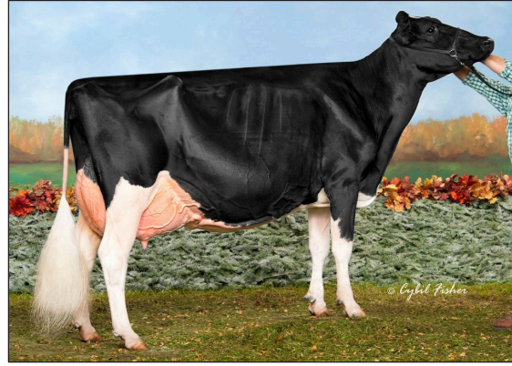
2nd Dam Lot 78 T-TRIPLE-T PLATINUM-ET (3E-95 EEEEE 9Y) • Star of the Breed 2018