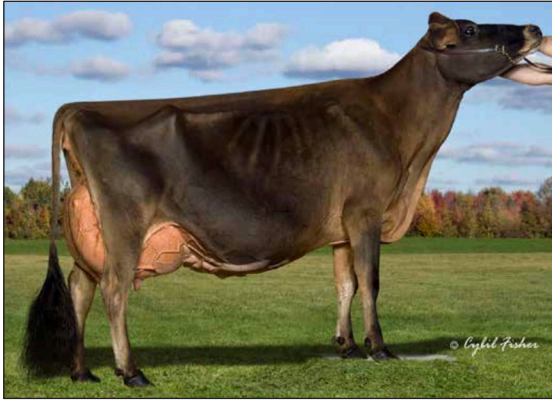
3rd Dam Lot 77 EXTREME ELECTRA (EX-95%) • All-American 100,000 lb cow 2013