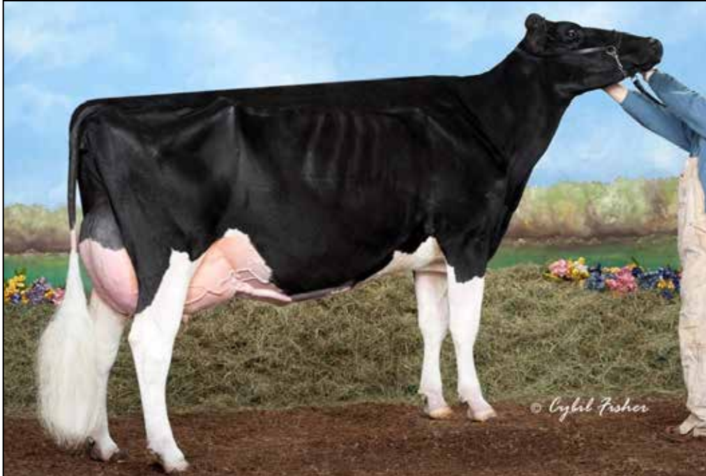
SAVAGE-LEIGH GOLD LONA-ET EX-92 EX-MS 4TH DAM OF 182