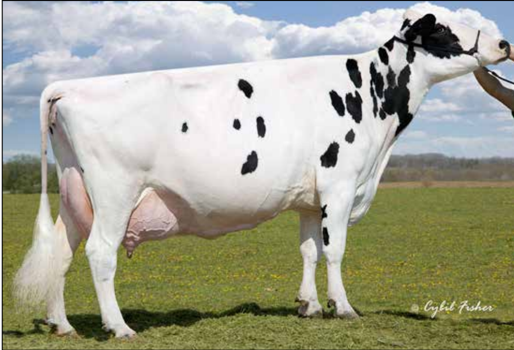
ASTRAHOE LJ ROSA REBEL-ET EX-92 EX-MS 8TH DAM OF 183