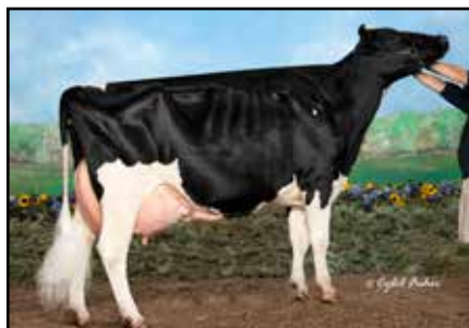
HILLMONT DURHAM TAMIKA-ET EX-93 FULL SISTER TO 4TH DAM OF 185

840003257166974 Born: July 23, 2023 • Herd No. 11783 GTPI +2810 A2/A2