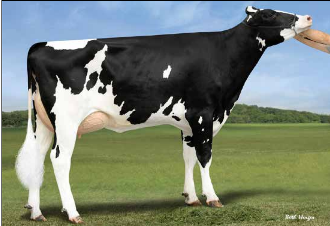
BGP FRAZZLED FAYETTE-ET 2ND DAM OF 189