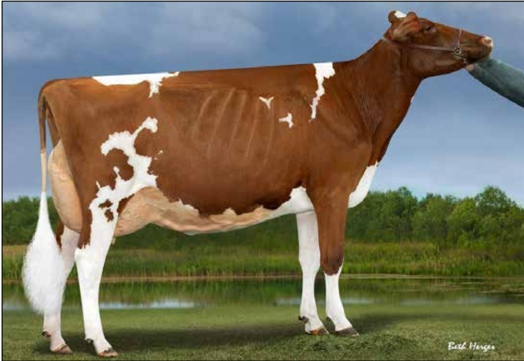
MS APPLE ANDRINGA-RED-ET EX-94 EX-MS 2E 2ND DAM OF 187