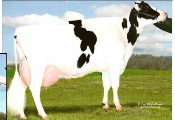
OVALTOP SANCHEZ TOBI EX-90 5TH DAM OF 186