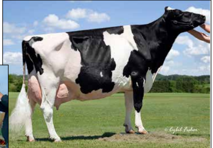
BUDJON REDMARKER DESIRE EX-96 EEEEE 3E 6TH DAM OF 179