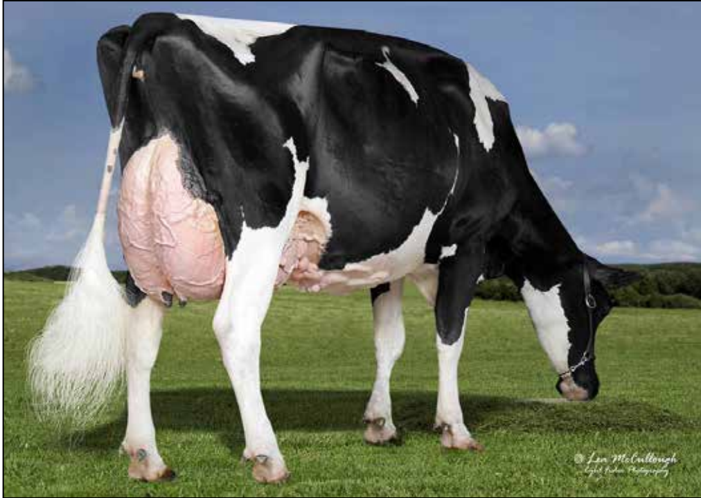
STRAUSSDALE G W ATWOOD 1337 EX-93 EEEEE 2E 2ND DAM OF 180