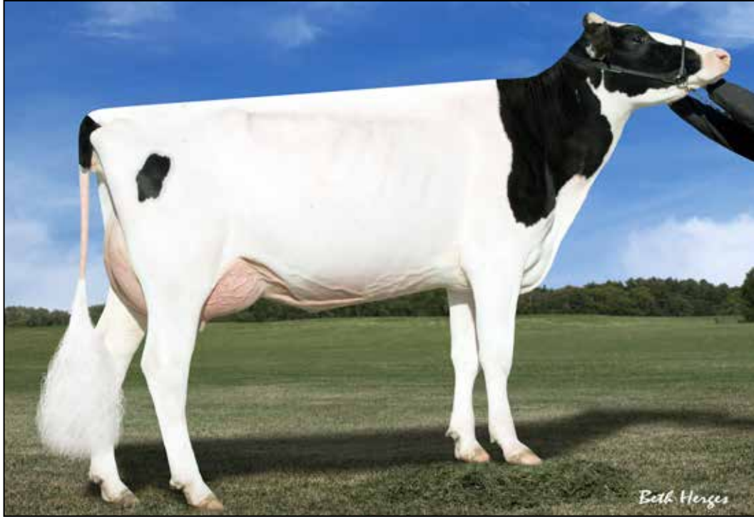
DES-Y-GEN PLANET SILK-ET EX-90 EX-MS 6TH DAM OF 190