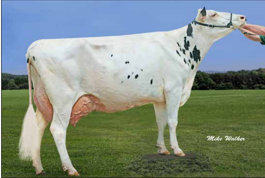
RICHMOND-FD BARBIE EX-92 2E DOM 7TH DAM OF 191