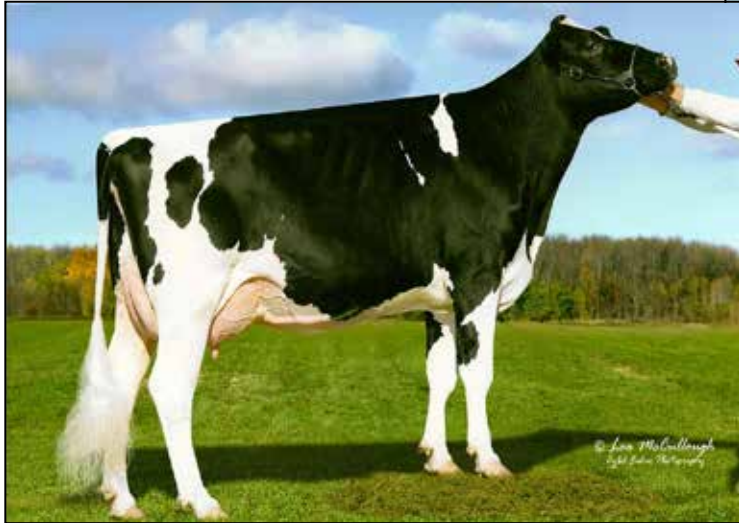
RAGGI TOBIS DAMION LIZ-ET EX-92 EEEEE 2E 6TH DAM OF 186