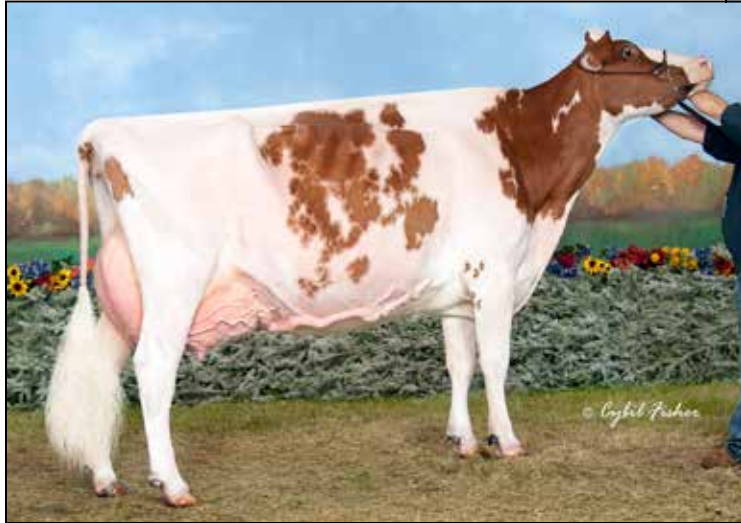
BUDJON-NITZY DESTINY-RED-ET EX-94 EEEEE 5TH DAM OF 179