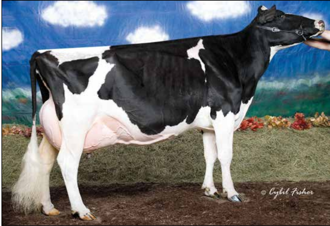
SURE-CAN-DO DURHAM VANITY EX-94 EX-MS 2E 4TH DAM OF 188