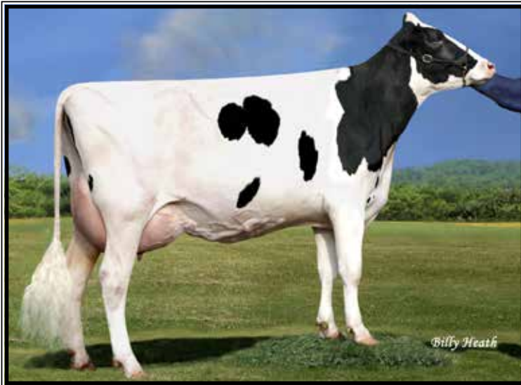
Cherrypencol Lee-ET EX-93 EEVVEE

3-06 365 30950 3.8 1164 3.7 1153 (2nd Dam of Lot 3 above)