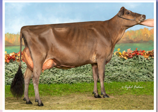
Schulte Bros Colt First Lady-ET EX-91% Maternal sister to Lot 10