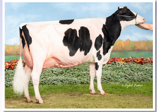
Dappleview Tatoo Ella EX-92 Dam of Lot 23

Next dams: VG-86 x EX-91-2E x VG-88 x VG-85 1*