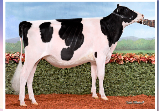
Kingsway Caught A Vibe-ET Full sister to Lot 1