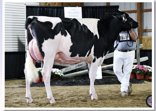
Juniper Unix Davina VG-87 Dam of Lot 26

Next dams: EX-90 3E x GP-83 x EX-91 2E x VG-85 x VG-87 x VG-85 x EX-90 2E GMD x VG-85 GMD x VG-85 GMD