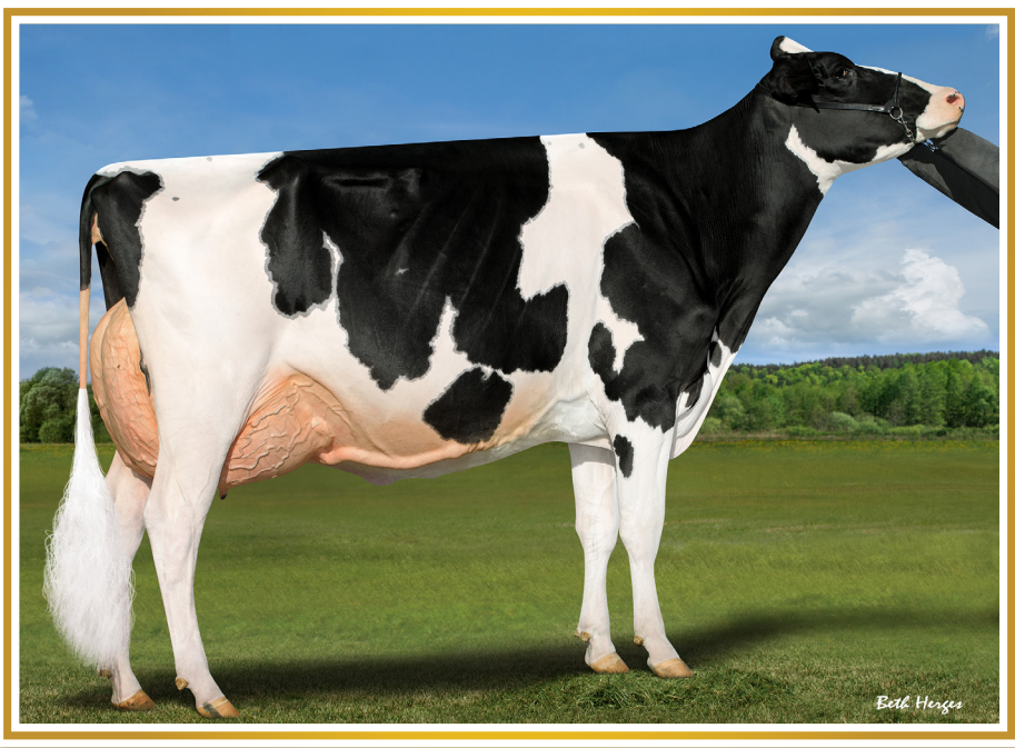
Ladyrose Caught Your Eye-ET EX-94 Dam of Lot 1