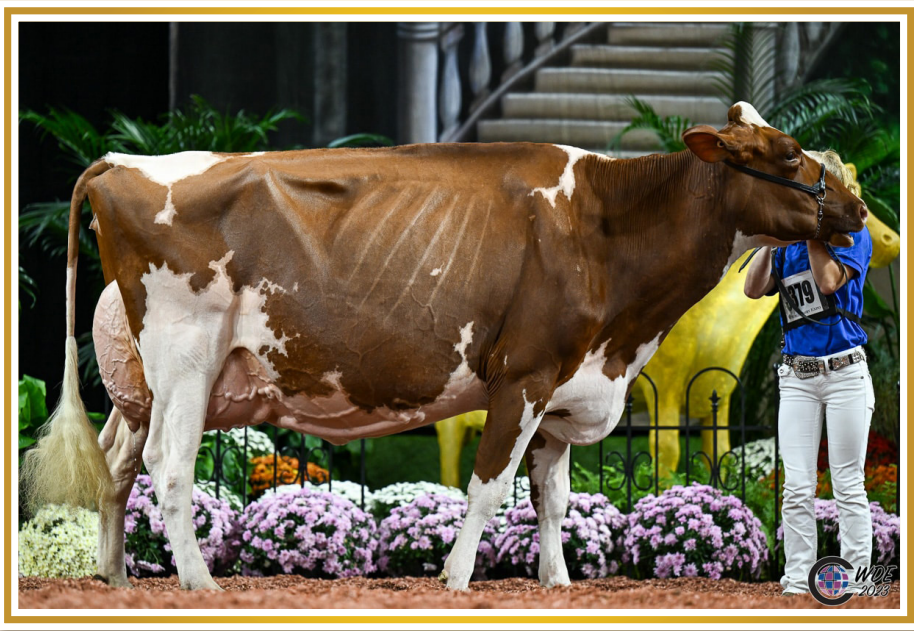
Garay Red Diamond-Red EX-93 2E Dam of Lot 2