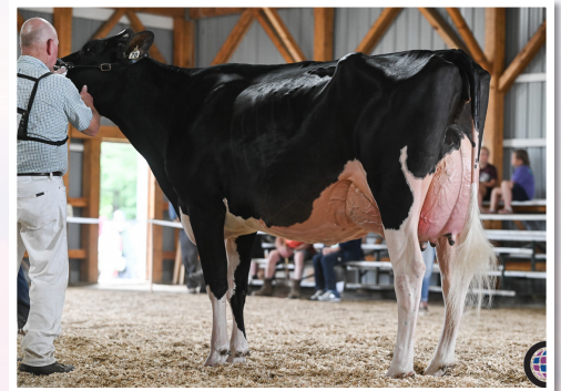
Ms Eatonholme A Phoebe-ET EX-92 Dam of Lot 25

Next dams: EX-91 2E x EX-95 4E GMD DOM x VG-87 DOM