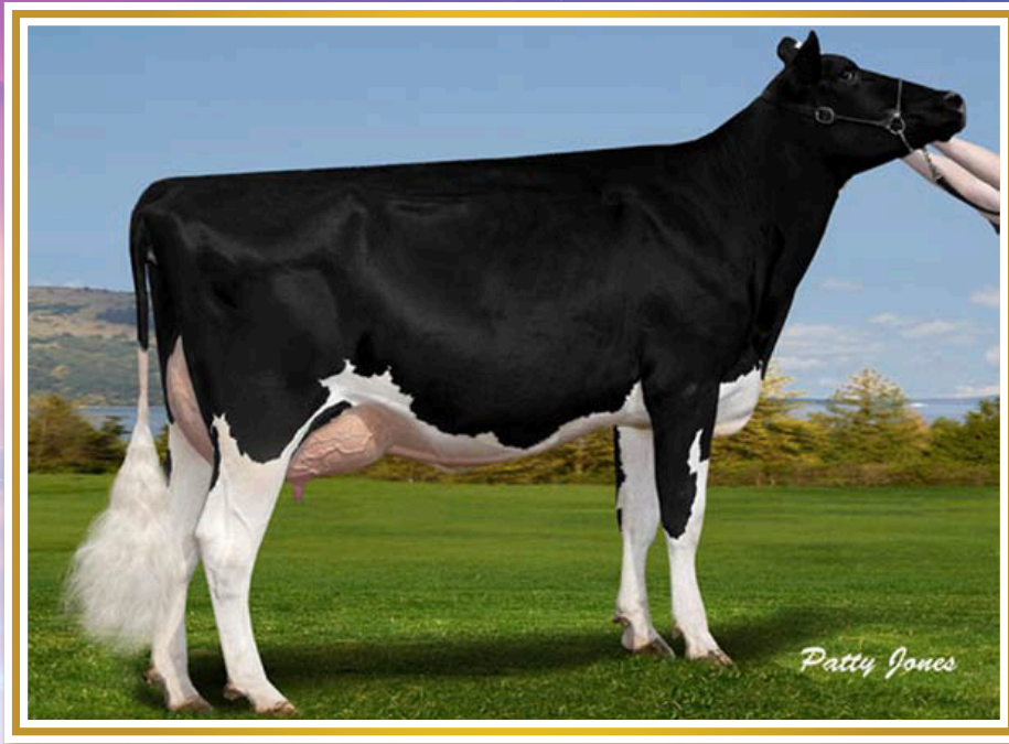
Wedgwood Louise Goldwyn-ET EX-93-2E 3* 3rd Dam of Lot 3