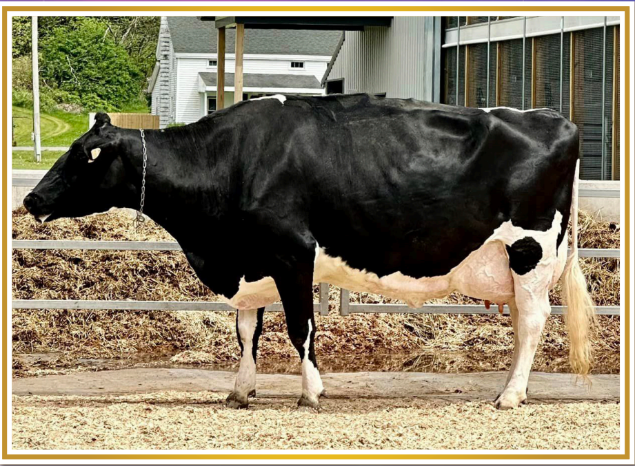
Pierstein Aftershock Adelle EX-94 Dam of Lot 9