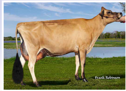
Ratliff Colton Diza-ET EX-92