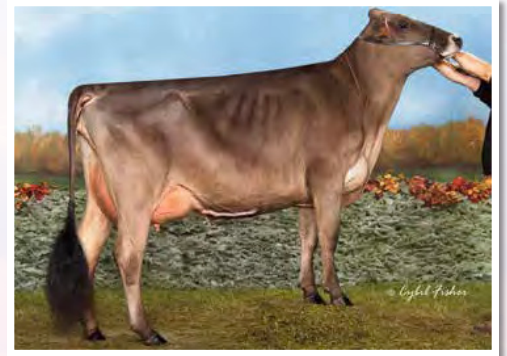
Bo Joy Ensign Miss Gee ET EX-94 3E 3rd dam of Lot 36

Sire: Kar-Linn Reeses Rampage Dam: MSS Vanta Grace EX-90 EVVVE 2-11 2 273 16320 4.0 658 3.5 573 Grandam: Bo Joy Ensign Miss Gee ET EX-94 3E EEEEE 5-09 2 331 29910 4.3 1281 3.3 988 LIFE 2144 164680 3.8 6230 3.1 5203 All-American Milking Yearling '14 3rd Dam: Bo Joy Emory Gretchen EX-93 2E 6-07 2 365 28440 4.4 1263 3.5 983 Nom. All-American Aged Cow '99 Next dams: VG-86 x EX-90 2E