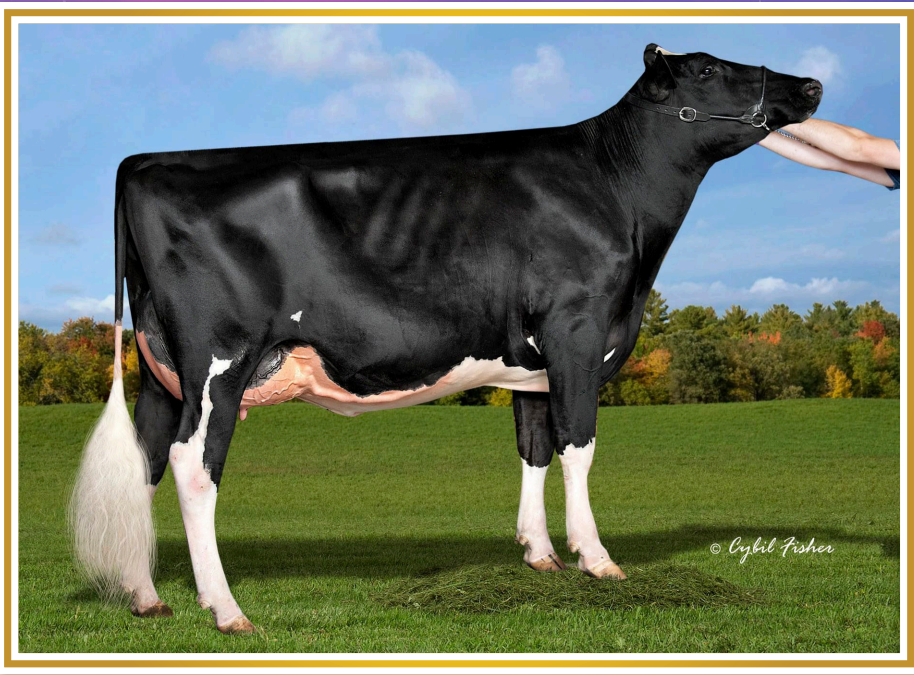
Watch-Hill Armani Esther EX-94 2E Dam of Lot 8