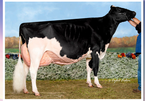
Kingsway Goldwyn Abba Dabba-ET EX-95 Grandam of Lot 4