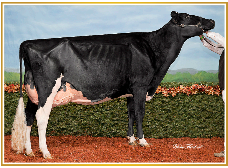
Jacobs Goldwyn Britany-ET EX-96-2E-CAN 36* Grandam of Lot 5