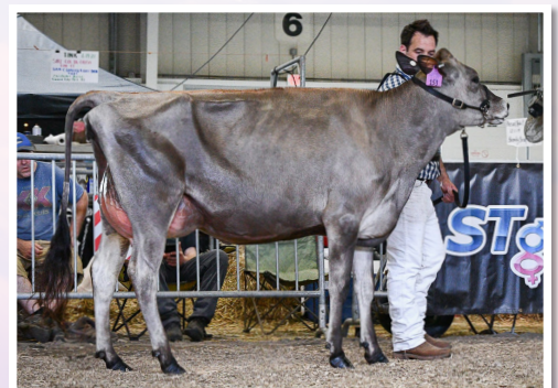
Sugar Brook Gentry Simplicity VG-87 Dam of Lot 19

Sire: River Valley Victorious-ET Dam: Sugar Brook Gentry Simplicity VG-87 2-00 2 260 11430 4.5 516 3.8 429 1st Junior 2-Year-Old, Northeast All-Breeds Spring Show '22 Next dams: NC x VG-83 x EX-90 x EX-90 x EX-91