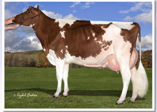
Miss Roxys Recovery-Red EX-92 2E Matriarch of Lots 31-35

840 3288960022 Born April 26, 2024 Sire: Blondin Alpha-ET Dam: Ms-AOL Rewrite-Red-ET EX-91