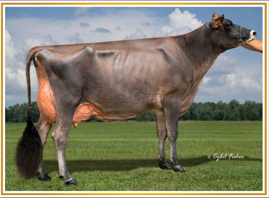
Schulte Bros Flashy Lady EX-95% Maternal sister to Lot 10