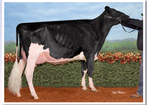
Desperle Bunny Doorman-ET EX-93 Sells as Lot 20

Next dams: GP-80 2* x EX-90 2* x Howes BC Sassy EX-2E 7* (3X All-American & All-Canadian) x 5 more VG/EX dams