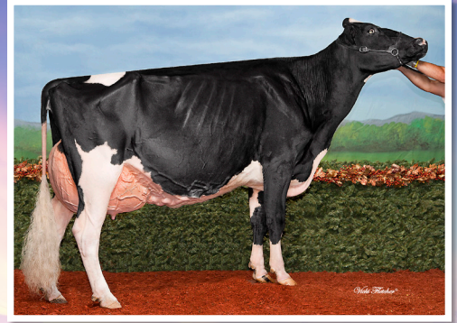
Ms Goldwyn Alana-ET EX-96-2E 20* Grandam of Lot 9