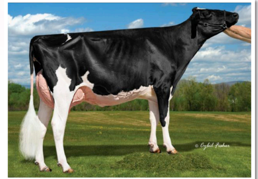
Juniper Drman Adorabella-ET EX-91 Grandam of Lot 27

Next dams: EX-91 3E 5* x EX-94 4E 2* x VG-85 x VG-86 x VG-87 x VG-85 2*