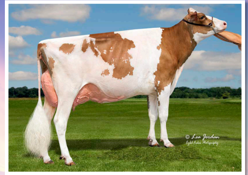
Hilrose Altitude Audi-Red EX-91 Full sister to Lot 6 HM All-American R&W Spring Calf '19