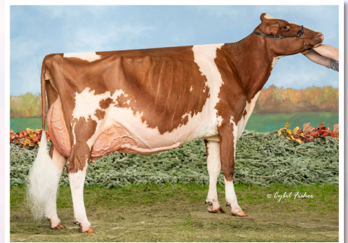
Juniper Dback Missy-Red EX-94 Full sister to dam of Lot 22