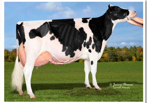
HowardviewWG Gold Casey-ET EX-94 3E Grandam of Lot 21