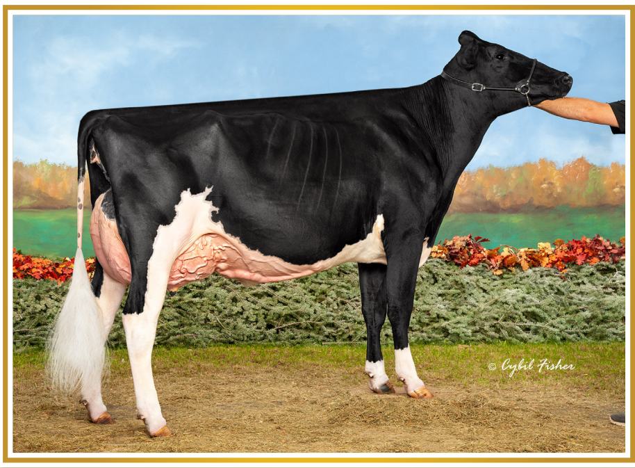
Ms Abba Amazing 2319-ET EX-93 Dam of Lot 4