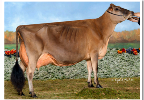
Miss Triple T Serenity-ET EX-94 Maternal sister to Grandam of Lot 17

Sire: Hawarden Impuls Premier Dam: Miss Triple-T Sure Bet EX-92 5-05 2 305 25960 5.2 1355 3.7 953 AJCA Reserve Junior All-American Fall Calf '13 Reserve Junior Champion, OH State Fair '13 & Spring Dairy Expo '14 Grandam: Miss Triple T Sensational-ET Maternal Sister: Miss Triple T Serenity-ET EX-94 AJCA All-American 5-Year-Old '15 · All-Canadian 4-Year-Old '14 · Nom. ABA All-American '13 3rd Dam: Windrift Breeze Plum Sarah EX-95 9-06 2 305 19820 5.9 1167 3.4 676 All-Canadian Aged Cow '11 · ABA Reserve All-American Aged Cow '11 Next dams: EX-90 x EX-91 x VG-86 1* x VG-88 x SUP-EX-90 1* x SUP-EX-90 x EX-90