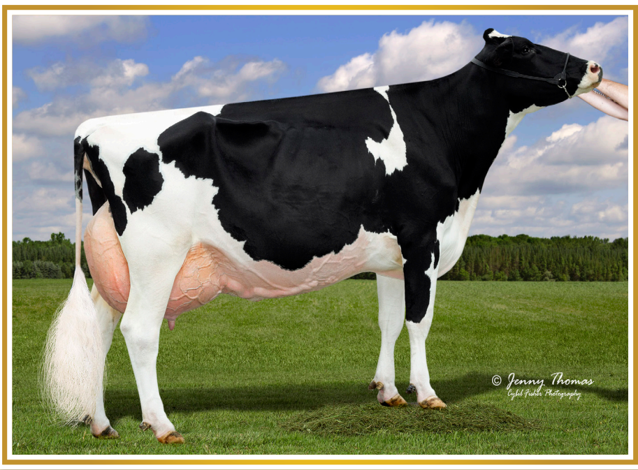
Pineland Goldwyn Hemi EX-96 3E Maternal Sister to 3rd Dam of Lot 7