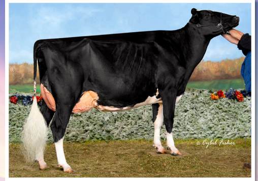
Jacobs Sid Beauty EX-95 1* Full sister to dam of Lot 5