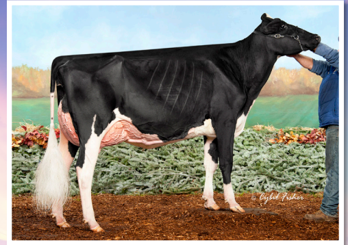
Garay Awesome Beauty-ET VG-88 Maternal sister to dam of Lot 2