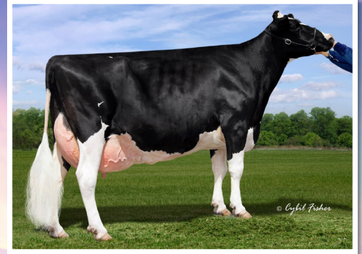
Watch-Hill Advent Elaine EX-93 2E Grandam of Lot 8