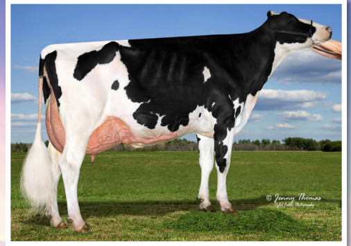
Pineland Punch Harlow EX-95 From the same maternal family as Lot 7