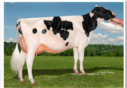
Ridgedale Area EX-94 Dam of Lots 28 & 29

Next dams: EX-92 2E x Ms Kingstead Chief Adeen EX-94 2E DOM x Starbuck Ada EX-94 2E DOM