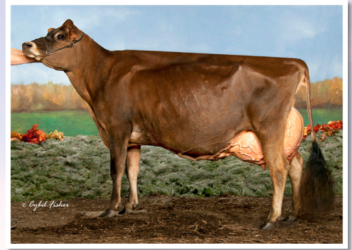
Schulte Bros Tequila Shot EX-95 Dam of Lot 15

Sire: River Valley Venus VIP-ET Dam: Schulte Bros Tequila Shot-ET EX-95 All-Canadian 4-Year-Old '17 · ABA Reserve All-American 4-Year-Old '17 All-Canadian Senior 3-Year-Old '16 · ABA HM All-American Senior 3-Year-Old '16 ABA HM All-American Senior 2-Year-Old '15 Nom. ABA All-American Fall Yearling '14 · ABA All-American Fall Calf '13 Next Dams: EX-91 x EX-92 x VG-84 x EX-93