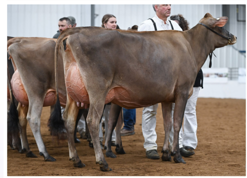
GL&SC VIP Lady-ET