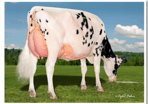
Brigeen Humblnkind M87 Gigi EX-94 Dam of Lot 24

VG-86 GMD x VG-89 GMD DOM x EX-91 GMD DOM x EX-90 2E GMD DOM