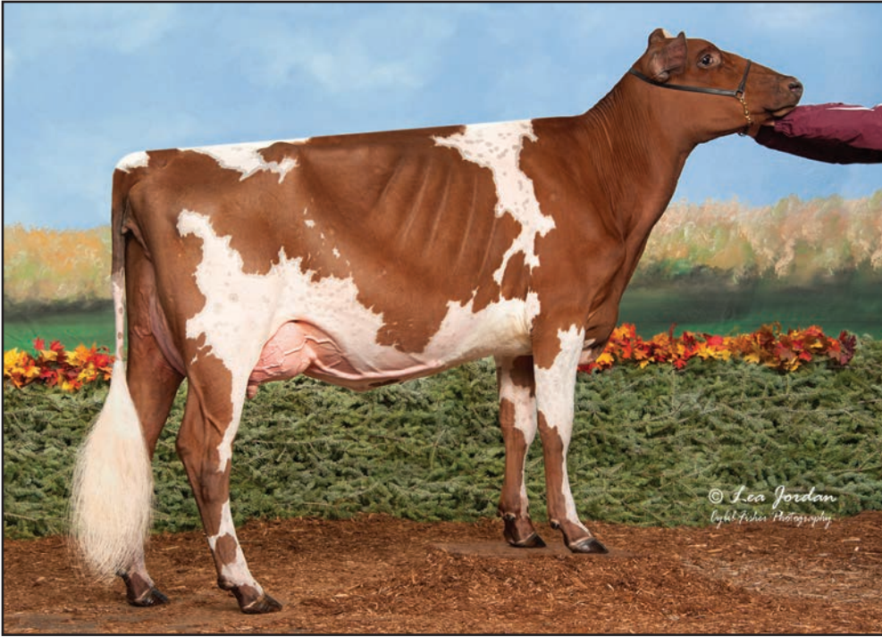
B-RUTHLESS GENTLE REVENGE-ET, VG-86 RES ALL-AMERICAN MILKING YEARLING, 2022 DAM OF LOT 25