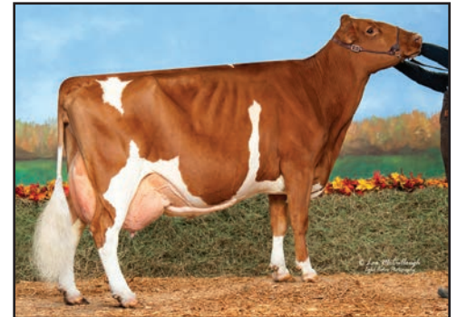
GATTON PADDY CHERRY, EX-94 4E 9-01 365D 23,090M 3.5% 816F 3.0% 704P GRANDDAM OF LOT 24