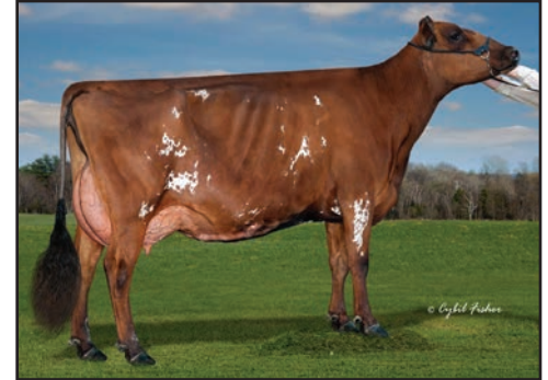
OLD-N-LAZY GENTLE WIPEOUT-ET, EX-93 2E 6-01 305D 31,950M 4.0% 1280F 2.9% 922P UNAN ALL-AMERICAN JR 3-YEAR-OLD, 2019 RES ALL-AMERICAN 4-YEAR-OLD, 2020 HM ALL-AMERICAN 5-YEAR-OLD, 2021 MATERNAL SISTER OF LOT 3