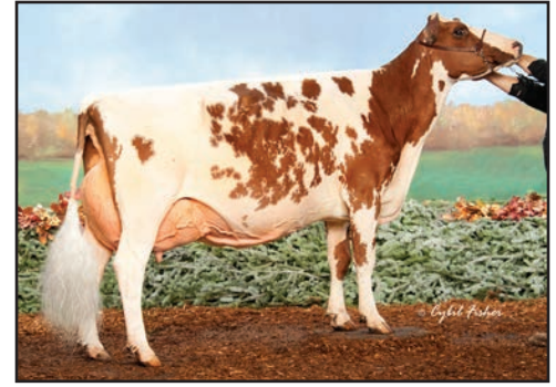
HARDY-FARM RIO VERIFY, EX-94 4E 2X RES ALL-AMERICAN AGED COW GREAT-GRANDDAM OF LOT 19