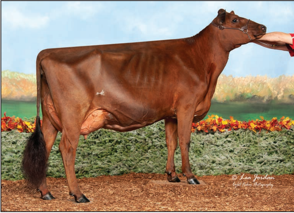
GRAND-VIEW BIGSTAR BRIELLE, VG-88 GRAND & SUPREME CHAMPION, 2024 NEW HIGH PROTEIN SHOW DAM OF LOT 21