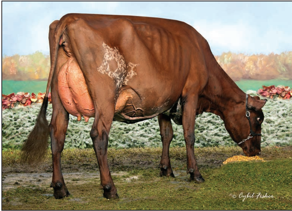
DES PRAIRIES BOUNTY, VG-88 HM ALL-AMERICAN & UNAN JR ALL-AMERICAN JR 2, 2019 DAM OF LOT 2