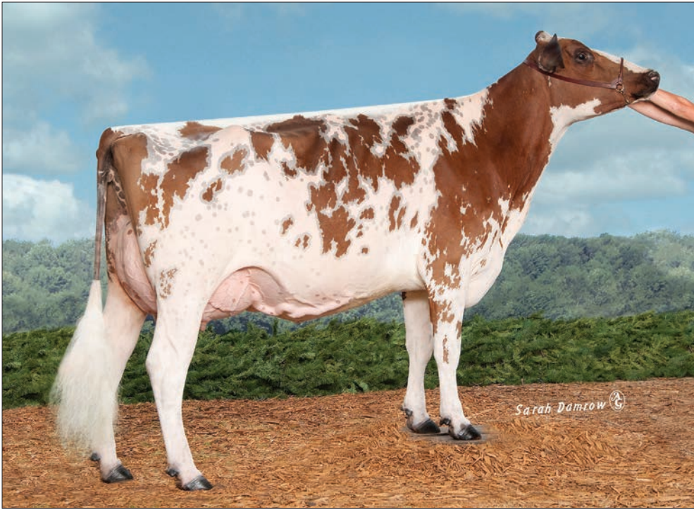
DE LA PLAINE REMINGTON WING-ET, EX-92 2E 4-11 322D 28,290M 4.5% 1274F 3.3% 934P DAM OF LOT 3