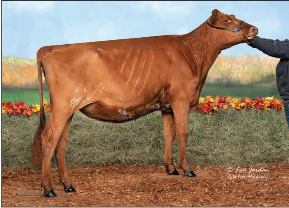
RUSTIC-CREEK-KG RINGER JULIP-ET 1ST FALL CALF, 2023 SOUTHERN NATIONAL OPEN & JR SHOWS NOM JR ALL-AMERICAN FALL CALF, 2023 MATERNAL SISTER OF LOT 20