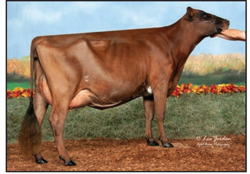
MOY-AYR GENTLE LOVE TOP, VG-86 2ND JR 2, 2023 SOUTHERN NAT'L JR SHOW MATERNAL SISTER OF LOT 9