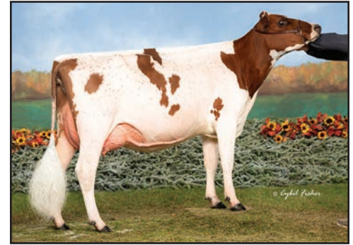
MOY-AYR BERKELY LADYBUG, VG-87 NOM ALL-AMERICAN JR 2-YEAR-OLD, 2022 JR ALL-AMERICAN JR 2-YEAR-OLD, 2022 MATERNAL SISTER OF LOT 9