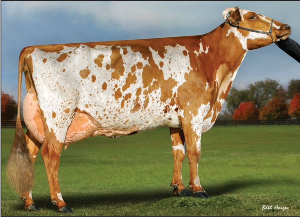
DOMYNAIRE BARBIE GIRL-ET, EX-90 RES ALL-AMERICAN JR 2-YEAR-OLD, 2019 DAM OF LOT 27