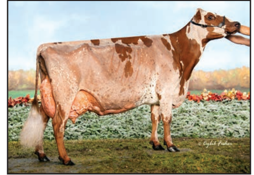
BEAR-AYR BURDETTE RAY, EX-94 2E 8-09 365D 40,190M 4.0% 1606F 3.0% 1202P GRANDDAM OF LOT 14