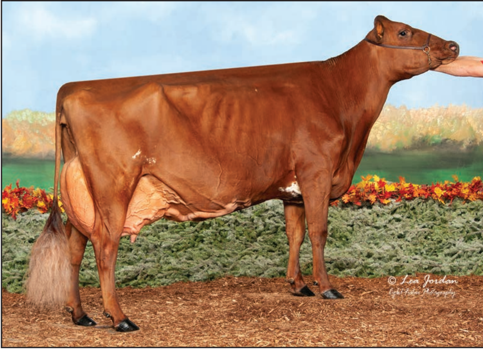
BRICKER-FARMS GIBBS CARVELLA, EX-95 6-06 305D 28,560M 3.3% 936F 2.6% 739P RES ALL-AMERICAN COMPONENT MERIT, 2023 DAM OF LOT 5