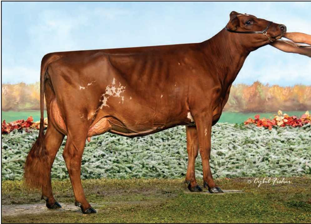
ARTHURACRES DEMPSEY ALISE-ET, EX-93 5-02 267D 22,292M 3.5% 789F 3.5% 780P DAM OF LOT 12