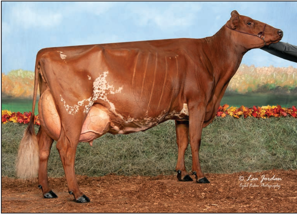
HAYNES-FARM DAZZLE BANSHEE, EX-94 2E 3-09 312D 29,350M 3.2% 925F 3.1% 897P GRAND CHAMPION, 2023 SOUTHERN NATIONAL SHOW DAM OF LOT 6