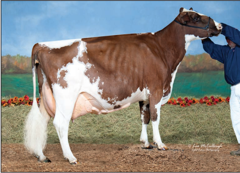
HAWKSFIELD BEN BLANCHE, EX-92 2E 9-11 313D 25,940M 4.0% 1028F 3.0% 784P GREAT-GRANDDAM OF LOT 30