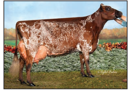
GRAND-VIEW BURDETTE BURGANDY, EX-94 5-01 365D 25,970M 4.4% 1130F 3.5% 908P GREAT-GRANDDAM OF LOT 21