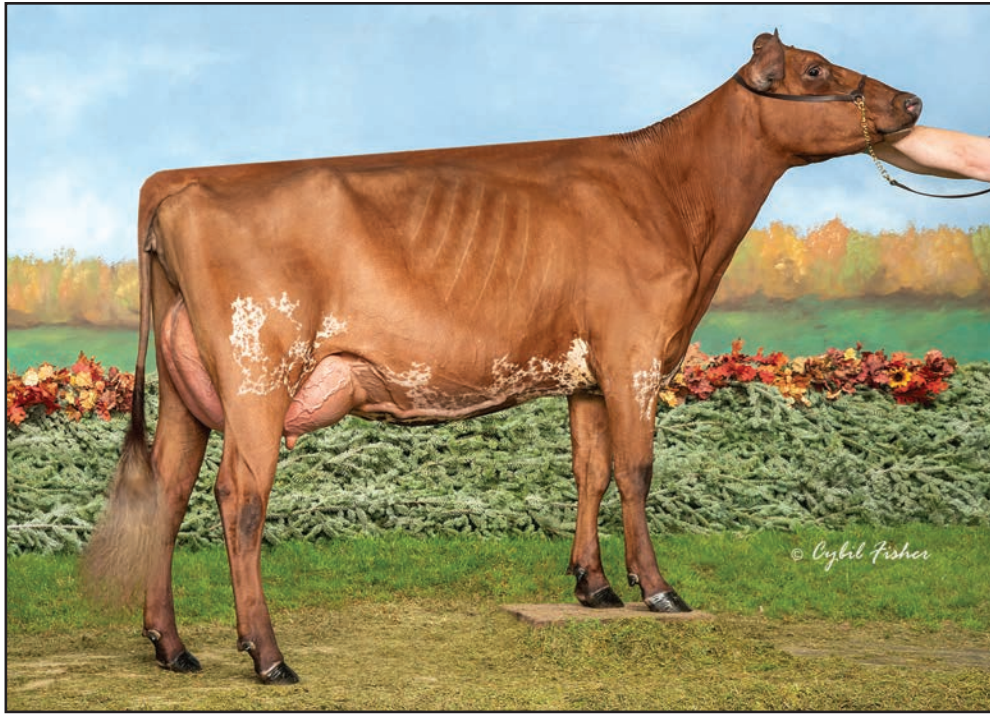
TOPPGLEN KINGSIRE GUINEVERE, VG-88 EX MS UNAN JR ALL-AMERICAN SUMMER JR 2, 2023 DAM OF LOT 17