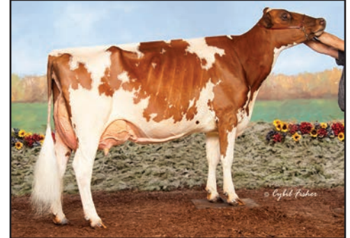
PALMYRA PREDATOR B RUTHLESS-ET, EX-933 3X ALL-AMERICAN 2X WDE GRAND CHAMPION GREAT-GRANDDAM OF LOT 25