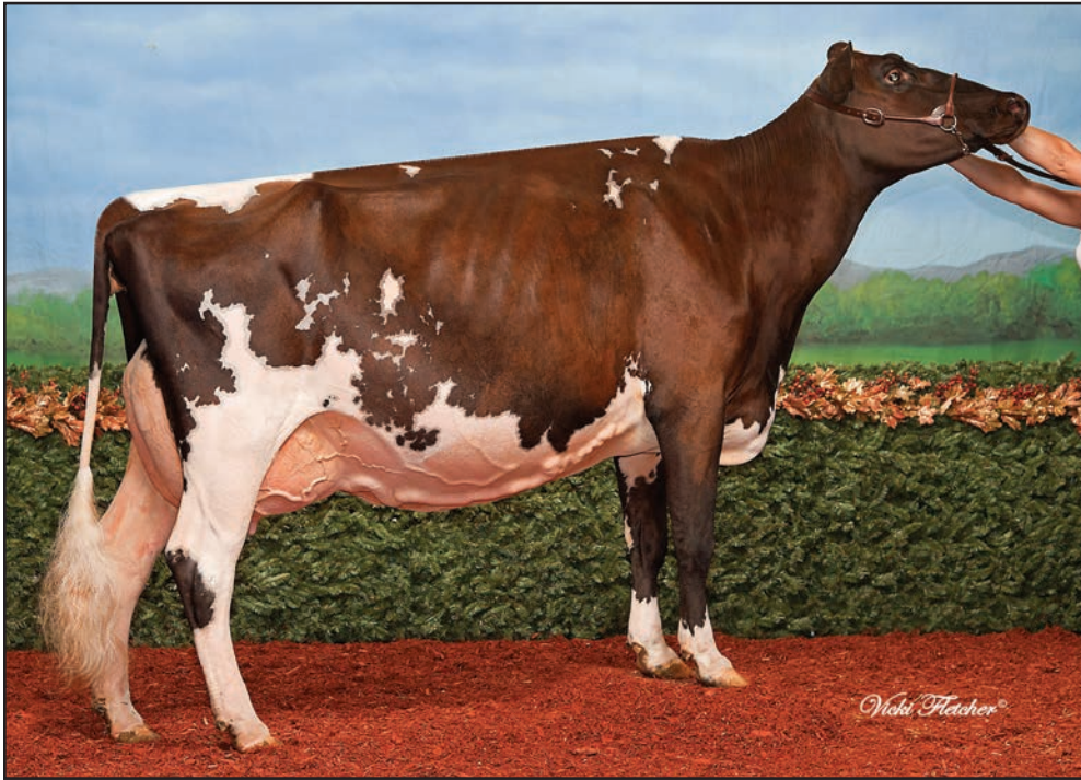
VIEUX VILLAGE C CALIE, EX-95 64E 4X ALL-CANADIAN GREAT-GRANDDAM OF LOT 28