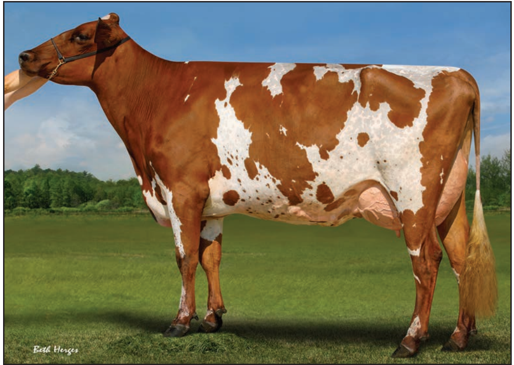
TWIN COUNTY PBR BEACH PARTY-ET, EX-90 2-03 305D 20,449M 4.5% 924F 3.0% 616P DAM OF LOT 4