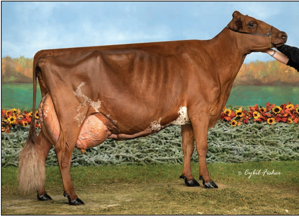
TOPPGLEN WISHFUL THINKING-ET, EX-95 4E 2X UNAN ALL-AMERICAN 9-00 305D 34,157M 3.7% 1270F 3.2% 1103P DAM OF LOT 8