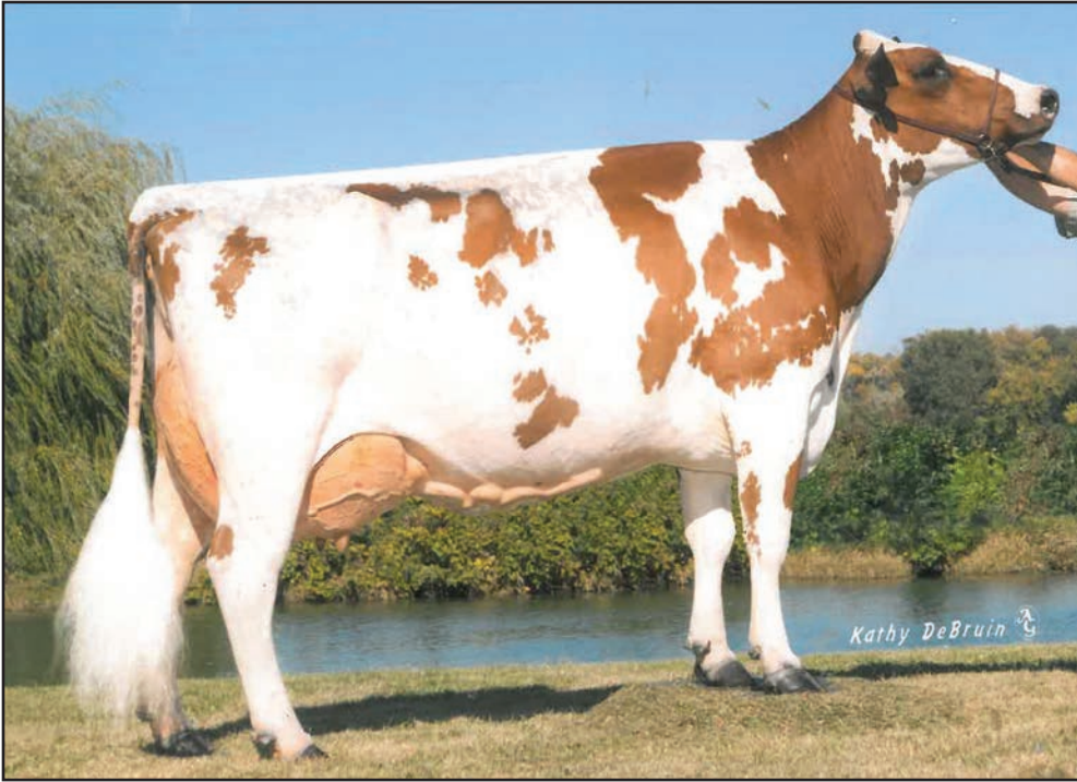
MILLER'S BURT BRAN MUFFIN, EX-93 4E 154,040M 4.9% 7558F 3.3% 5144P LIFETIME SAME GREAT BREEDING AS LOT 11