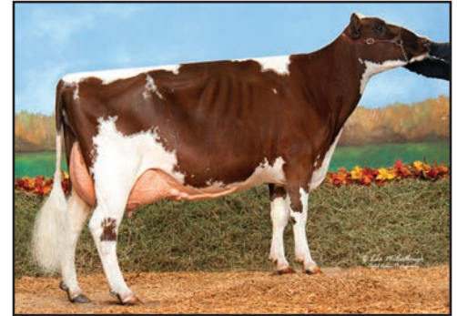
HAWKSFIELD BLANCHE, VG-89 9-11 313D 25,940M 4.0% 1028F 3.0% 784P 2X JR ALL-AMERICAN NOMINEE MATERNAL SISTER TO GRANDDAM OF LOT 30