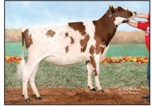
HAWKSFIELD BRANDI DAM OF LOT 30