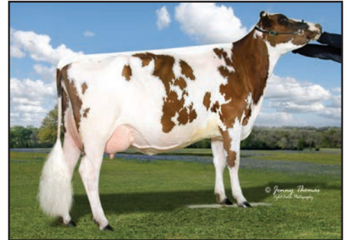
GEMINAECHO REMINGTON SHELLIE, EX-91 2E HIGH-SELLER, 2013 NATIONAL SALE GREAT-GRANDDAM OF LOT 26