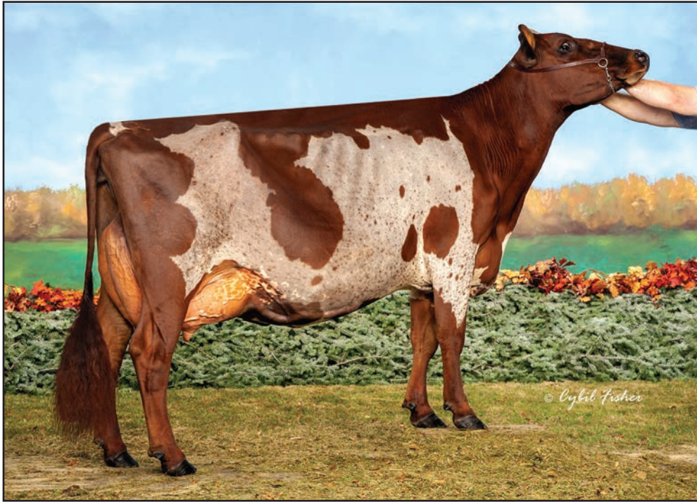
MOY-AYR BURDETTE LIGHTNING-ET, EX-92 2E RESERVE JR ALL-AMERICAN SR 3-YEAR-OLD, 2021 DAM OF LOT 9