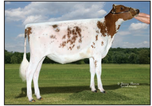
HAWVER-CREST SHOWSTOPPER-ET RES JR ALL-AMERICAN SUMMER YEARLING, 2019 DAM OF LOT 26