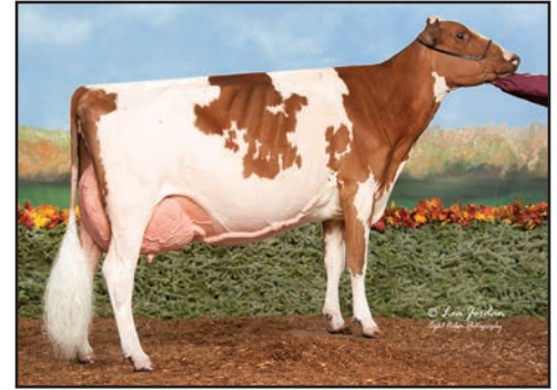
PALMYRA PREDATOR B RUTHLESS-ET, EX-93 4X ALL-AMERICAN GRANDDAM OF LOT 25