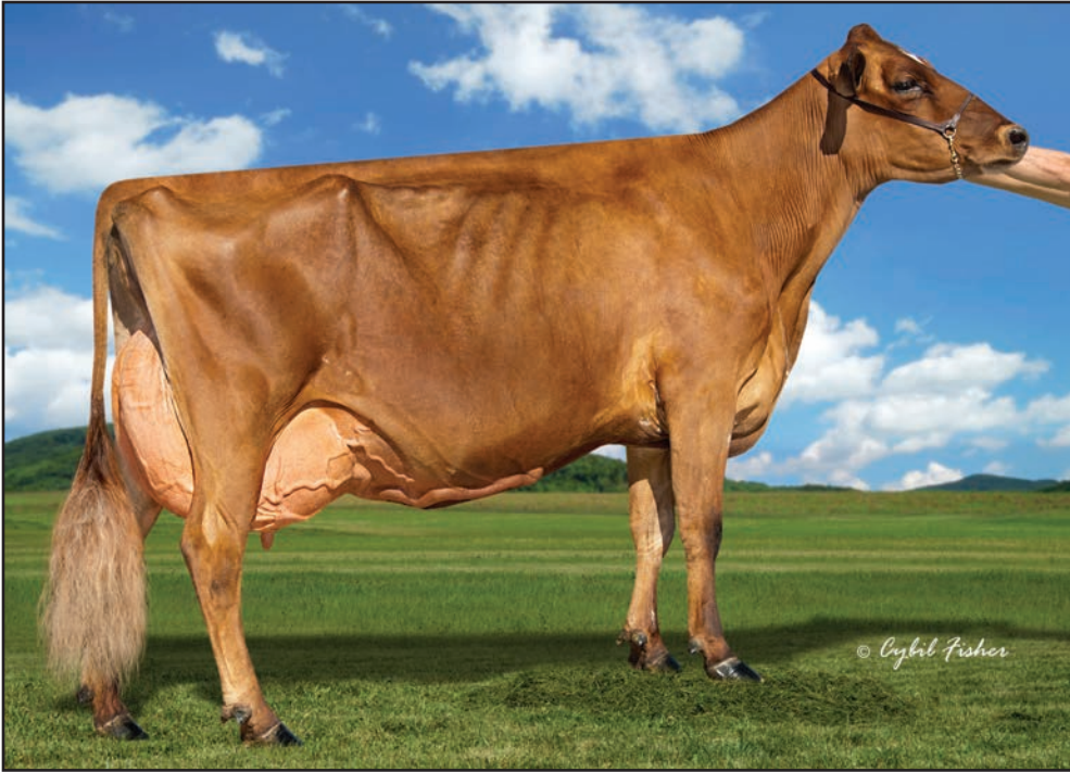
HARDY-FARM PRIME VERBENA, EX-94 2E 5-01 365D 34,650M 4.7% 1644F 3.2% 1105P DAM OF LOT 19