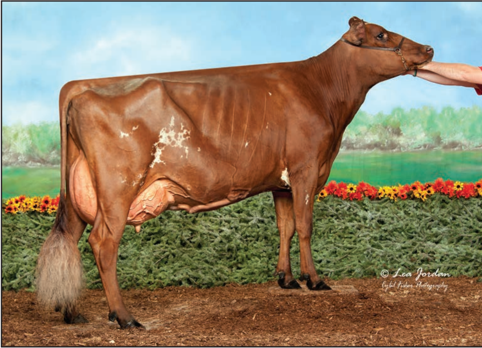
ARTHURACRES DEMPSEY ALISE-ET, EX-93 NOM ALL-AMERICAN JR 2-YEAR-OLD, 2019 FAMILY MEMBER OF LOT 1