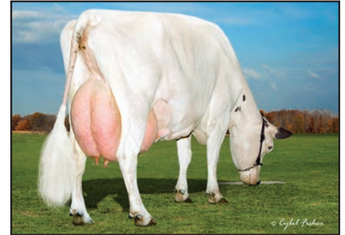
HAWKSFIELD GVA PARDNER BLUE-ET, EX-91 5E 6-03 288D 24,780M 4.5% 1180F 3.0% 742P FOURTH DAM OF LOT 21