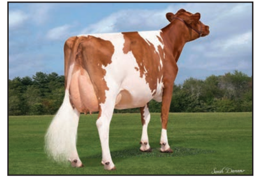
STIL-DREAMN VICKING CHATEAU, EX-92 FULL SISTER TO DAM OF LOT 24