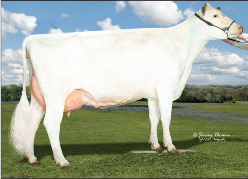
JACKSON-HILL DWHAMMY NYQUIST, EX-90 3-02 305D 22,900M 3.8% 871F 3.1% 700P FAMILY MEMBER OF LOT 22