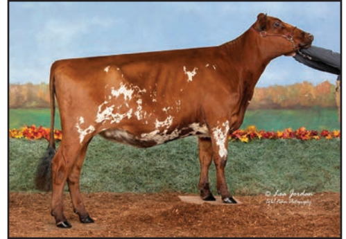
ALDENS SHOWSTAR HONEY NOM JR ALL-AMERICAN FALL YEARLING, 2021 MATERNAL SISTER TO DAM OF LOT 18