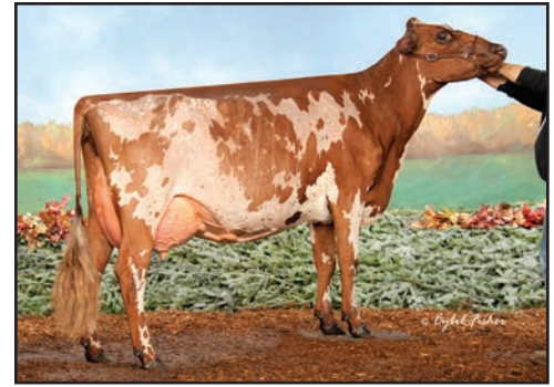
HAYNES-FARM BRACHIOSAURUS, EX-92 2E 4-09 305D 33,400M 3.6% 1194F 3.1% 1034P UNAN ALL-AMERICAN YEARLING IN MILK, 2017 NOM ALL-AMERICAN SR 2-YEAR-OLD, 2018 GRANDDAM OF LOT 6