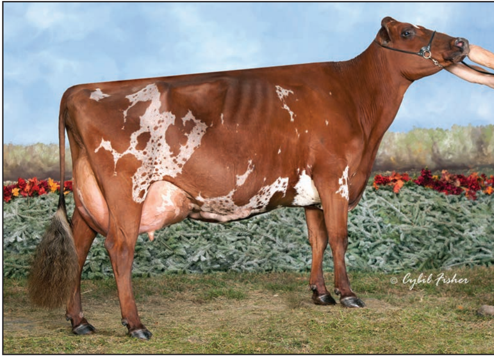
SHARWARDS CALIMERO MEGAN, EX-94 3E 4X ALL-AMERICAN FOURTH DAM OF LOT 13