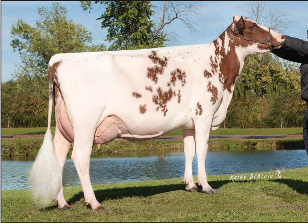
HAWVER-CREST SHIRLEY SUE JR ALL-AMERICAN JR 2-YEAR-OLD, 2015 GRANDDAM OF LOT 26