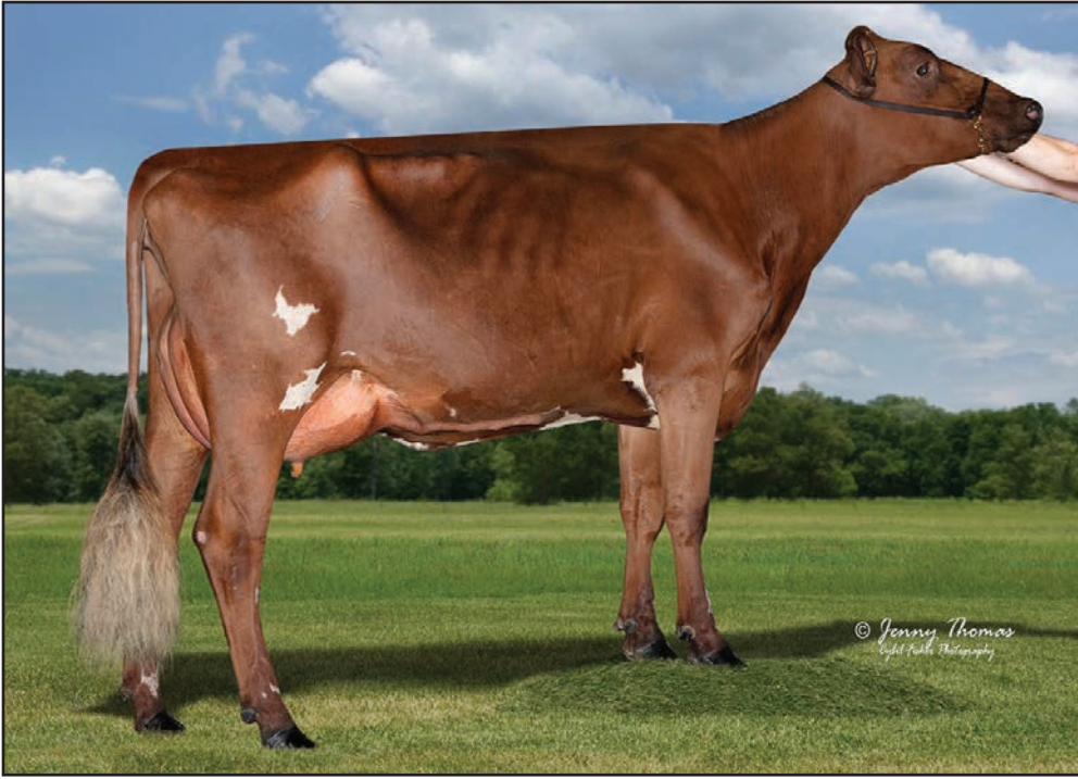
ALDENS K HALLE 1ST SR 2 & HM INT CHAMPION, 2023 OH STATE FAIR DAM OF LOT 18