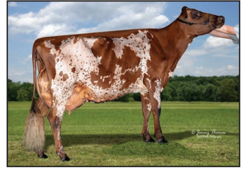
MILLER'S TITO II BABS, EX-92 2E RECORDS OVER 29,000 SAME GREAT BREEDING AS LOT 11