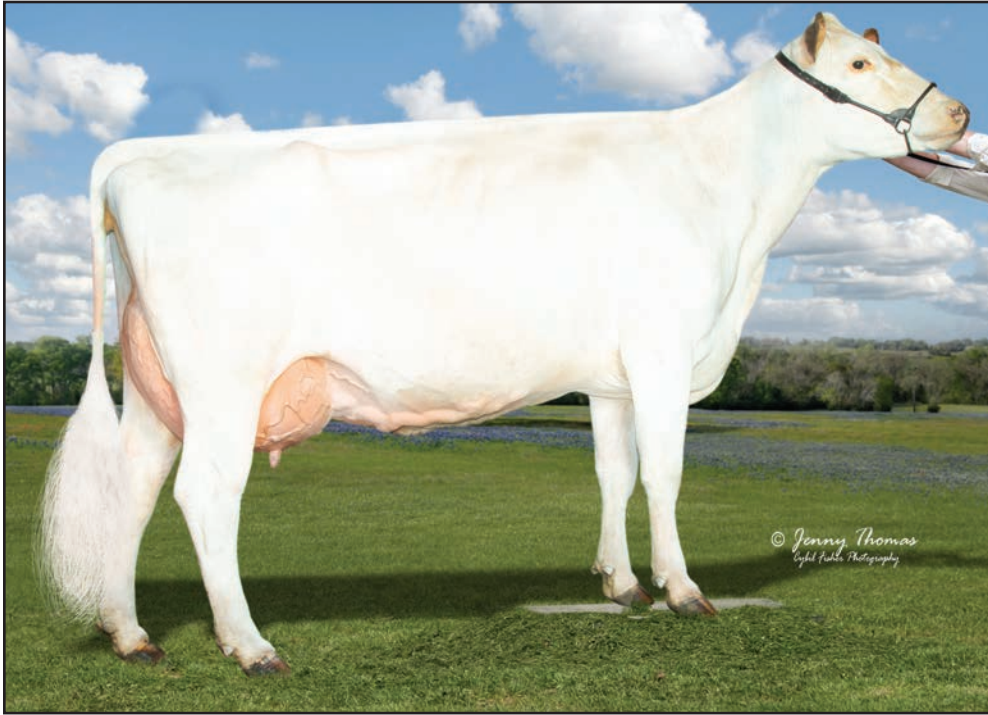
JACKSON-HILL DWHAMMY NYQUIST, EX-90 3-02 305D 22,900M 3.8% 871F 3.1% 700P DAM OF LOT 23