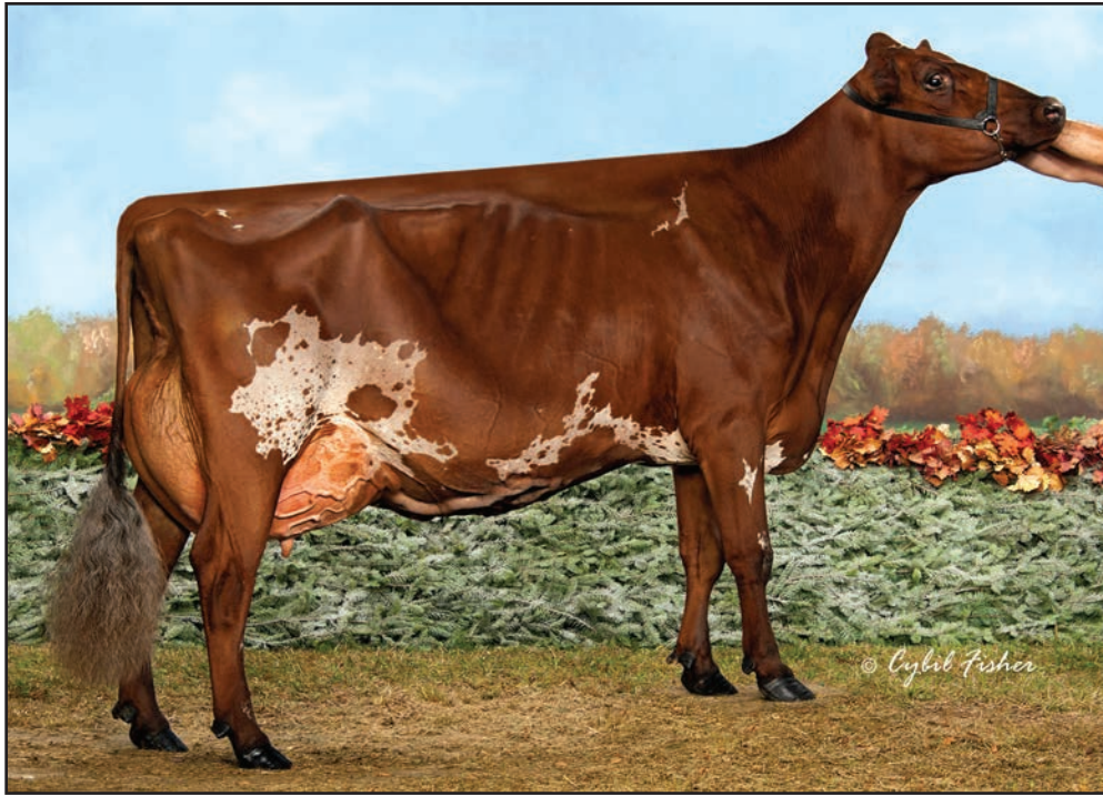
CEDARCUT BURDETTE CLOVE COLATA, EX-94 3E A PEDIGREE FULL OF NATIONAL SHOW & ALL-AMERICAN HONORS! DAM OF LOT 10