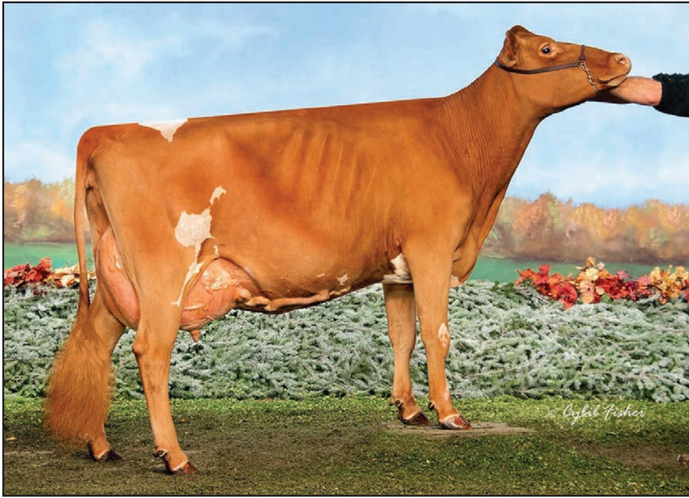
STIL-DREAMN VICKING CACTUS, EX-91 RES ALL-AMERICAN MILKING YEARLING, 2018 NOM ALL-AMERICAN SR 2-YEAR-OLD, 2019 FULL SISTER TO DAM OF LOT 24