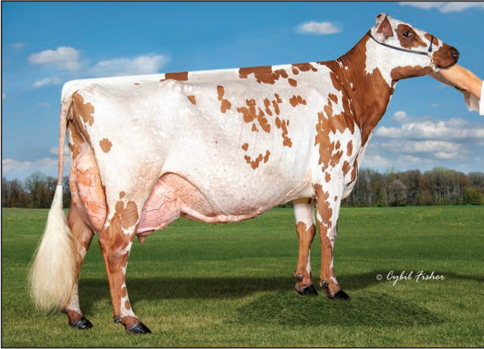
BEAR-AYR MISS RACHEL RAY, EX-93 3E 5-04 365D 33,690M 4.6% 1543F 3.0% 999P DAM OF LOT 14