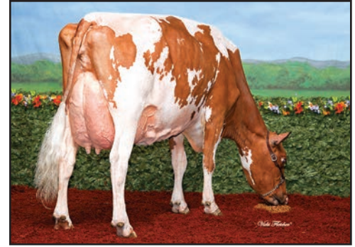
FOREVER SCHOON PING, EX-95 4E ALL-AMERICAN & ALL-CANADIAN GRANDDAM OF LOT 3