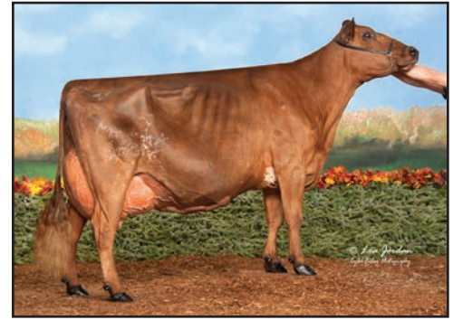
YELLOW BRIAR J BEVERLEY, EX-93 2E 4X ALL-AMERICAN NOMINEE GRANDDAM OF LOT 27