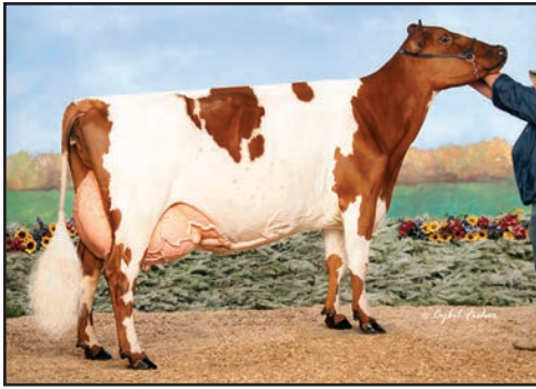
OLD-BANKSTON JC BRI'S BIKINI-ET EX-94 3E 6-05 311D 29,600M 3.8% 1112F 3.2% 950P 3X NOM ALL-AMERICAN GRANDDAM OF LOT 4