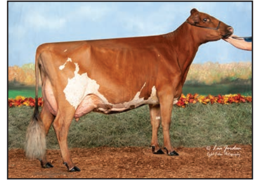
TOPPGLEN WICKED CHAMP, EX-91 2-00 305D 24,634M 5.2% 1289F 3.5% 865P UNAN JR ALL-AMERICAN MILKING YEARLING, 2022 HM JR ALL-AMERICAN SR 2-YEAR-OLD - 2023 MATERNAL SISTER OF LOT 8