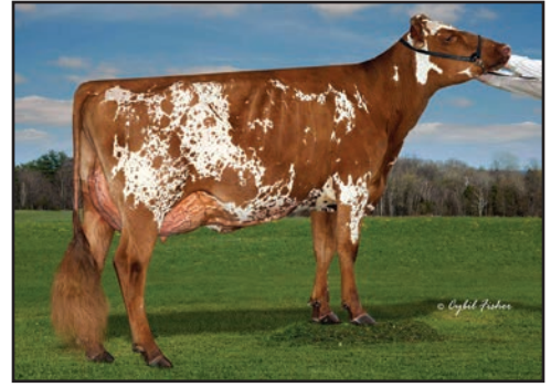
ALDENS SHOWSTAR HOLIDAY, EX-90 NOM ALL-AMERICAN WINTER YEARLING, 2020 MATERNAL SISTER TO DAM OF LOT 18