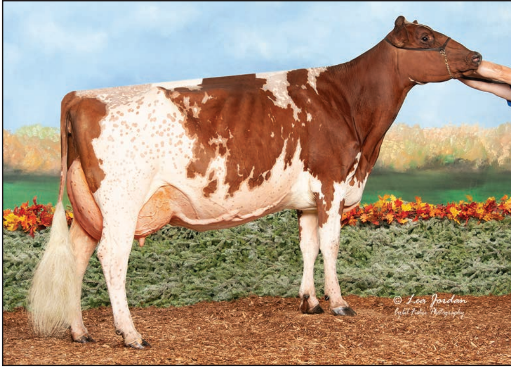
LAZY M DISTINCT REASON, NOW EX-94! 6-06 305D 28,560M 3.3% 936F 2.6% 739P UNAN JR ALL-AMERICAN 5-YEAR-OLD, 2023 DAM OF LOT 7