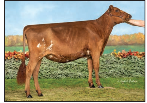
BRICKER-FARMS KING CINDERELLA, VG-88 UNAN ALL-AMERICAN WINTER YEARLING, 2023 ALL-WORLD, 2023 GRAND CHAMPION, 2024 MIDWEST COLORS SHOW FULL SISTER OF LOT 5